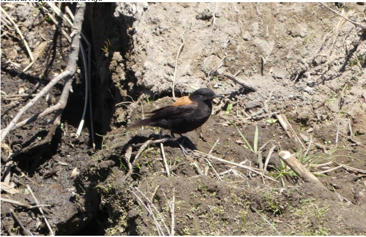
Argentina: A total of 6 in Laguna Los Juncos. Uruguay: 1 in Bañados del Indio was a surprise find considering the time of year.

Spectacled Tyrant Hymenops perspicillatus