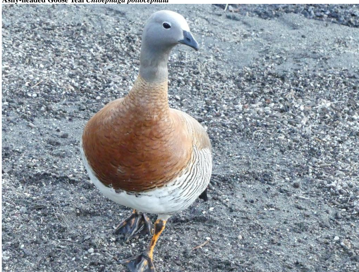
Argentina: Up to 8 of this beautiful goose were in Puerto Manzano.

Ashy-headed Goose Teal Chloephaga poliocephala