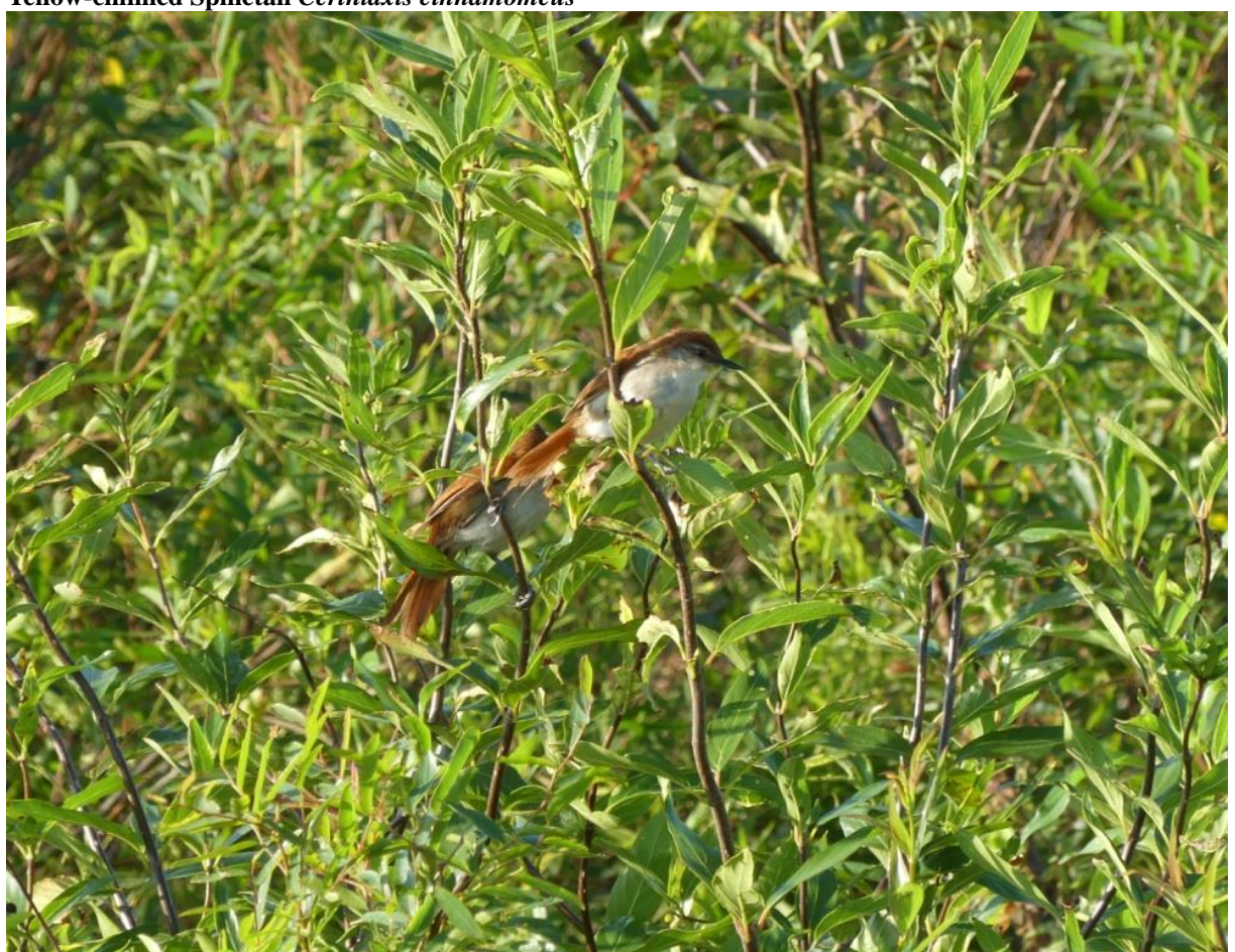
Uruguay: 2 at the bridge between km 22-23 Ruta 19.

Yellow-chinned Spinetail Certhiaxis cinnamomeus