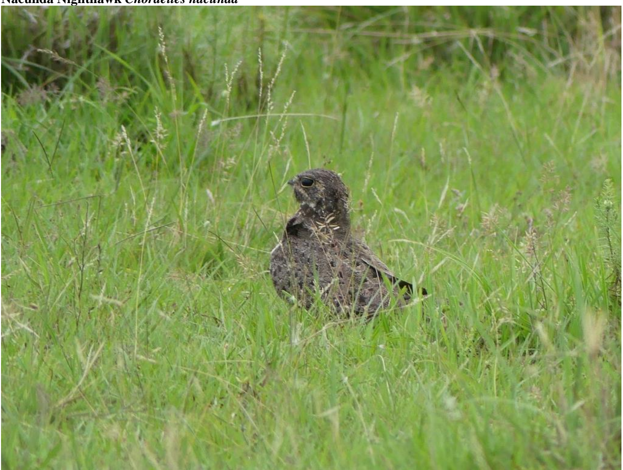
Uruguay: Easily seen at Estancia La Amorosa, e.g. 7 flushed one late afternoon, and of course also when night-birding. Other than those, 1 at San Antonio.