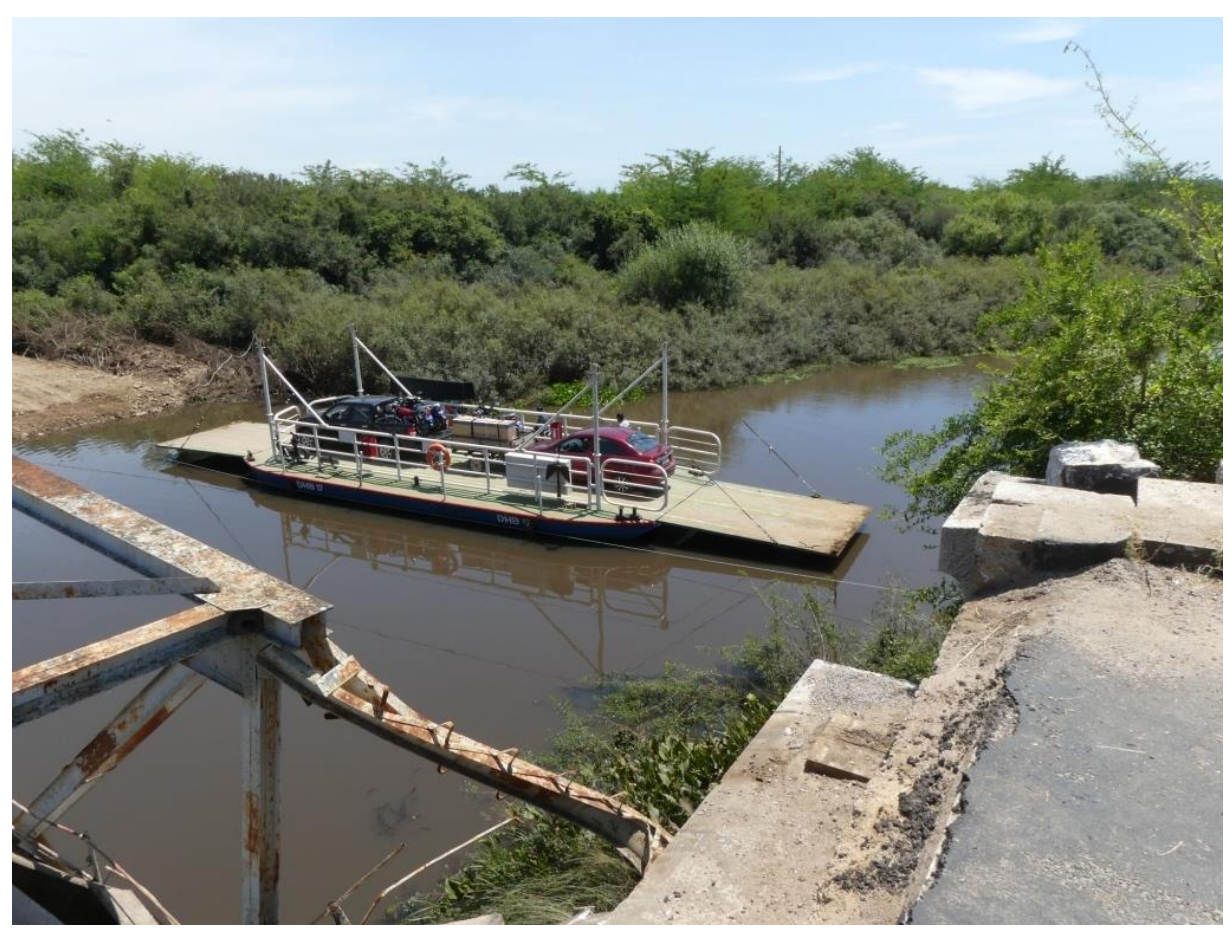
The smallest car ferry we have ever seen, roughly two thirds of the river width – however, facing a collapsed bridge, a very welcome solution!

Argentina: 4 at Los Pantanos. Uruguay: Recorded eight days. Ssp: nominate platensis