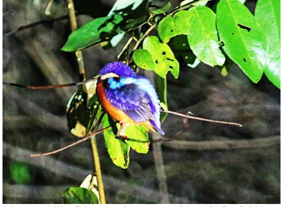
Blue-eared Kingfisher sleeping

Alcedo meninting verreauxii Ceyx rufidorsa motleyi