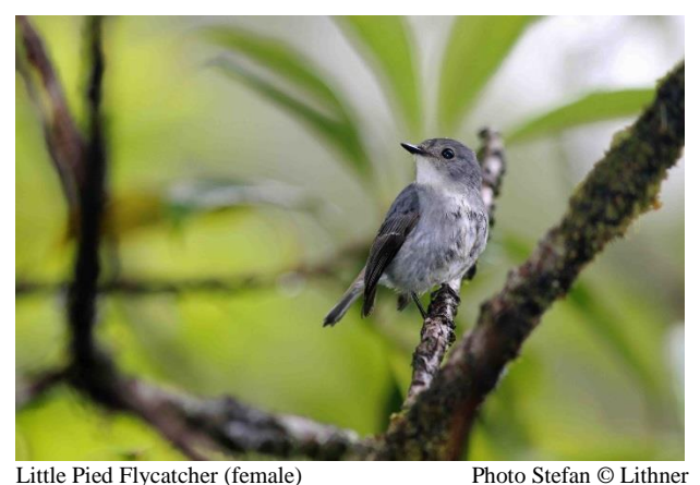
Little Pied Flycatcher (female)

Dicrurus paradiseus brachyphorus Hypothymis azurea prophata Terpsiphone affinis borneensis Platylophus galericulatus coronatus Platysmurus aterrimus Cissa jeffreyi Dendrocitta cinerascens Corvus enca compilator (heard) Eupetes macrocerus