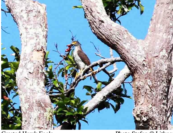
Crested Hawk Eagle

Ardea intermedia intermedia Egretta garzetta Ardea coromandus Butorides striata Ixobrychus cinnamomeus Aviceda jerdoni Pernis ptilorhynchus torquatus Macheiramphus alcinus alcinus Lophospiza trivirgata Ictinaetus malayensis Lophotriorchis kienerii Nisaetus limnaeetus