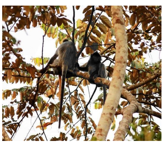
Maroon Leaf Monkey