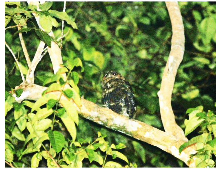
Brown Wood Owl