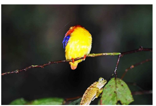
er Rufous-backed Kingfisher sleeping