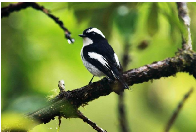
Little Pied Flycatcher

Stachyris maculata maculata Malacopteron magnirostre cinereocapilla Malacopteron affine phoeniceum Malacopteron cinereum cinereum Malacopteron magnum saba Malacopteron albogulare Pellorneum rostratum macropterum Pellorneum bicolor Pellorneum malaccense sordidum Pellorneum pyrrogenys canicapillus