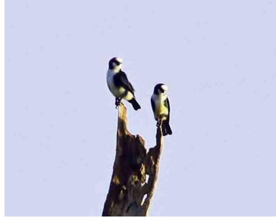
White-fronted Falconet sleeping

Psittinus cyanurus Psittacula longicauda Loriculus galgulus