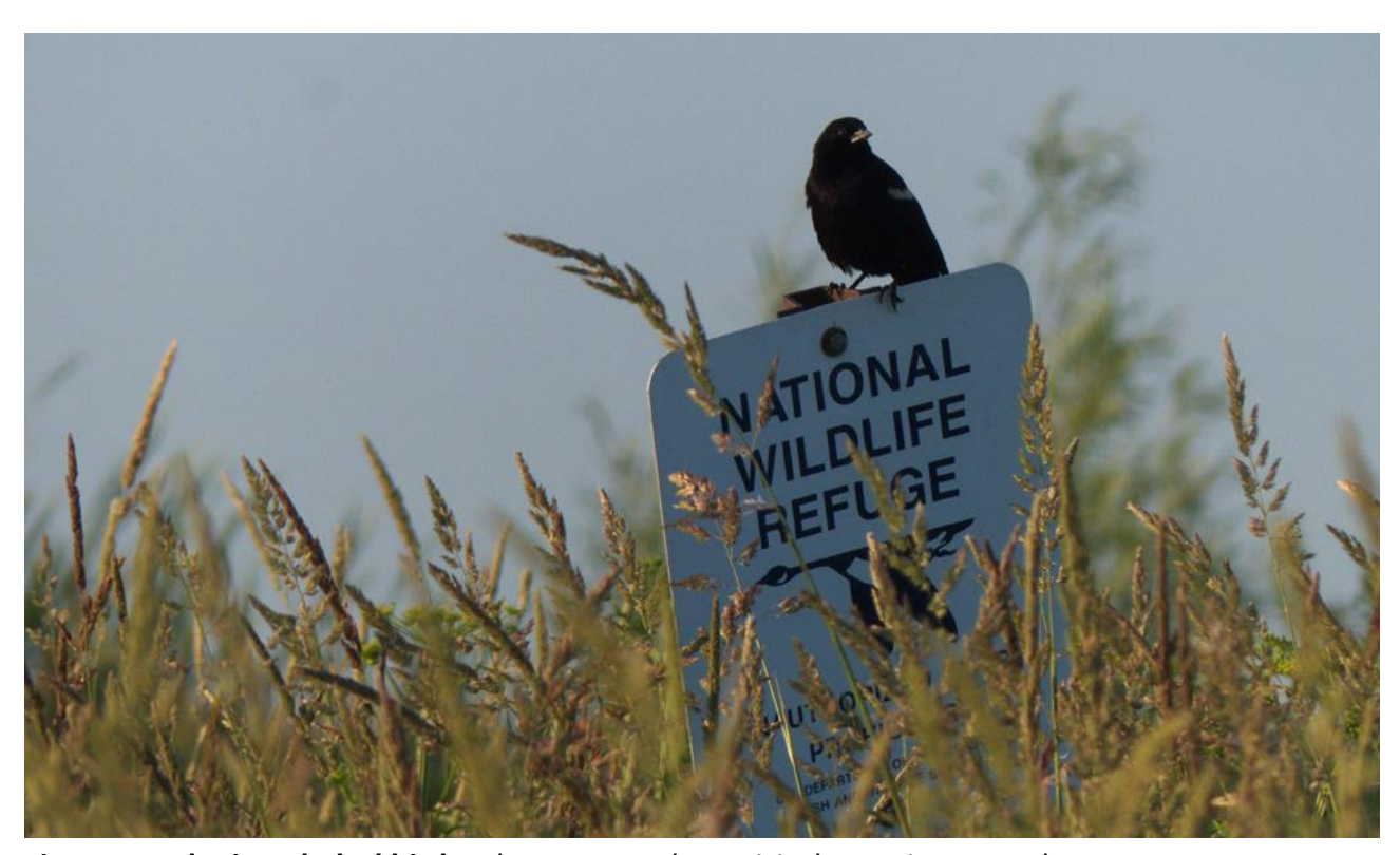
Fig. 1. A Red-winged Blackbird welcomes people to visit the Horicon Marsh.

Horicon Marsh is a vast (130 km2) marshland area located in the Dodge and Fond du Lac counties of Wisconsin. It is the largest freshwater cattail marsh in the United States of America. The northern two-thirds of the area is federal land and protected as the Horicon National Wildlife Refuge (NWR). It is managed by the U. S. Fish and Wildlife Service. The southern section, on the other hand, is owned by the state of Wisconsin and managed by the Wisconsin Department of Natural Resources, as the Horicon Marsh State Wildlife Area (SWA).