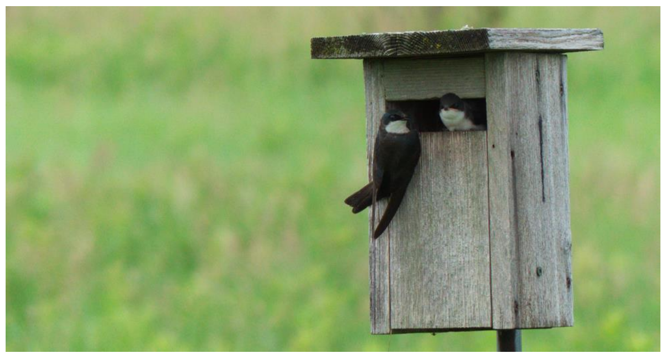
Fig. 11. An adult and a juvenile Tree Swallow , at their nest box by the marsh. The needs of these swallows and Purple Martins had been well attended by the local nature-lovers.

House Sparrow 13, at Inntown Motel, for example.