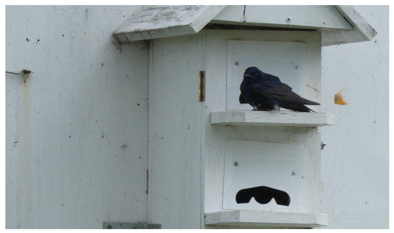
Fig. 12. A male Purple Martin , at the 'doorstep' of its condo in a block of apartments, at the SWA headquarters. See the shape of the entrances, specifically designed for the large martins!