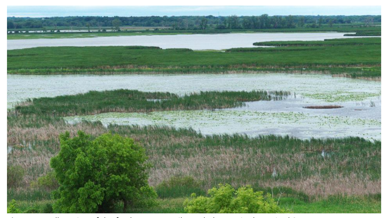
Fig. 4. A small section of the freshwater cattail marsh, largest in the United States.