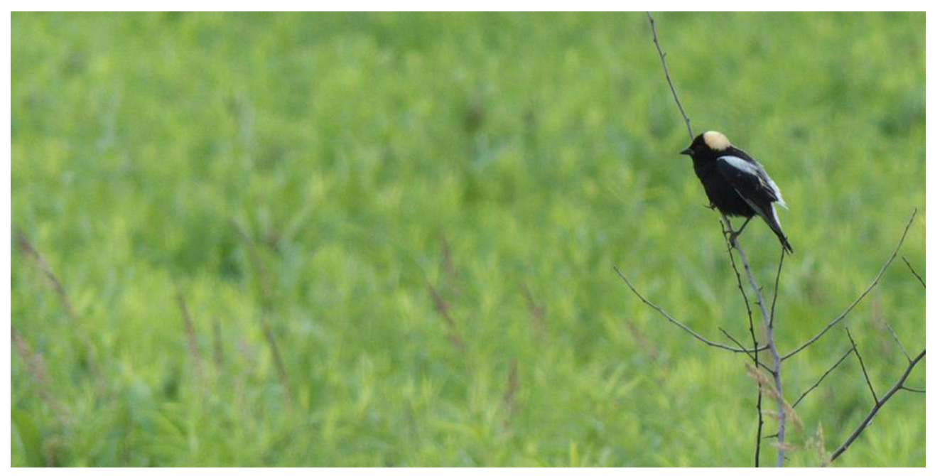
Fig. 9. A smart Bobolink, one of several along the Auto Tour road.

Also the area west of Rockvale Rd was productive, even though the Dike Rd (almost) across the marsh was almost not worth the trouble. I also went to the Breakneck Waterfowl Production Area, with little success. The passerines were mostly recorded along the Auto Tour road (both forest and lush meadows, with smart Bobolinks , for example), at the eastern section of the Old Marsh Rd across the marsh, to the Point Rd, and by the NWR headquarters. In the east, the farmland added to my daily list of records. The numbers in the following bird list are approximate numbers, when in full tens or hundreds, or 25, for example. I was, after all, not doing a scientific survey!