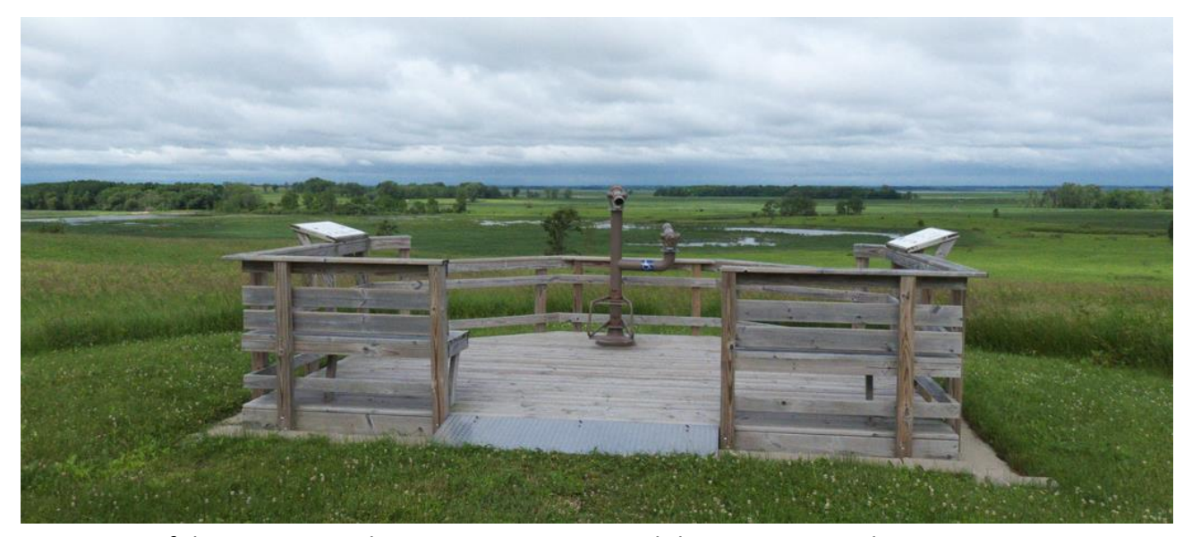
Fig. 3. One of the many nice observation points around the Horicon Marsh.