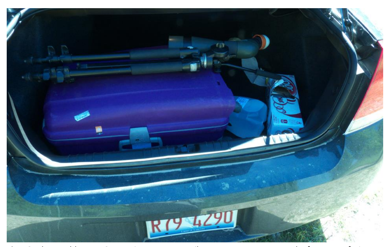
Fig. 13. The troublesome Samsonite... a scope, toilet paper, some water and a few cans of Diet Dr. Pepper in the trunk. In other words, the basic possessions of a traveling birder. In the U.S.A., people seldom buy their drinks by cans or bottles. They prefer boxes!