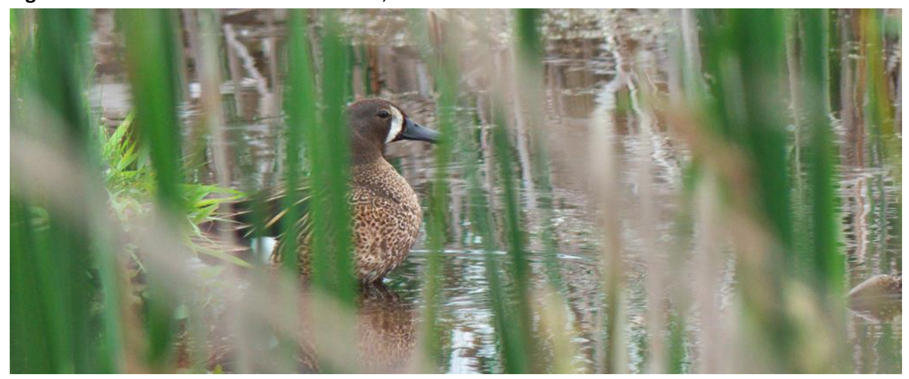
Fig. 8. At Legde Rd, one needed sharp eyes to spot all the birds which hid in the reeds; an eclipse drake Blue-winged Teal . I have found a similar bird in Finland, the third record for the nation.

A particularly potential area for migratory birds, next to empty in June, was located within the SWA in Horizon. Follow the N. Palmatory St. up to a ridge with an observation point with great scope views to ponds and pools around Quick Point. Close by, the SWA headquarters had a good variety of birdlife in front of the building.