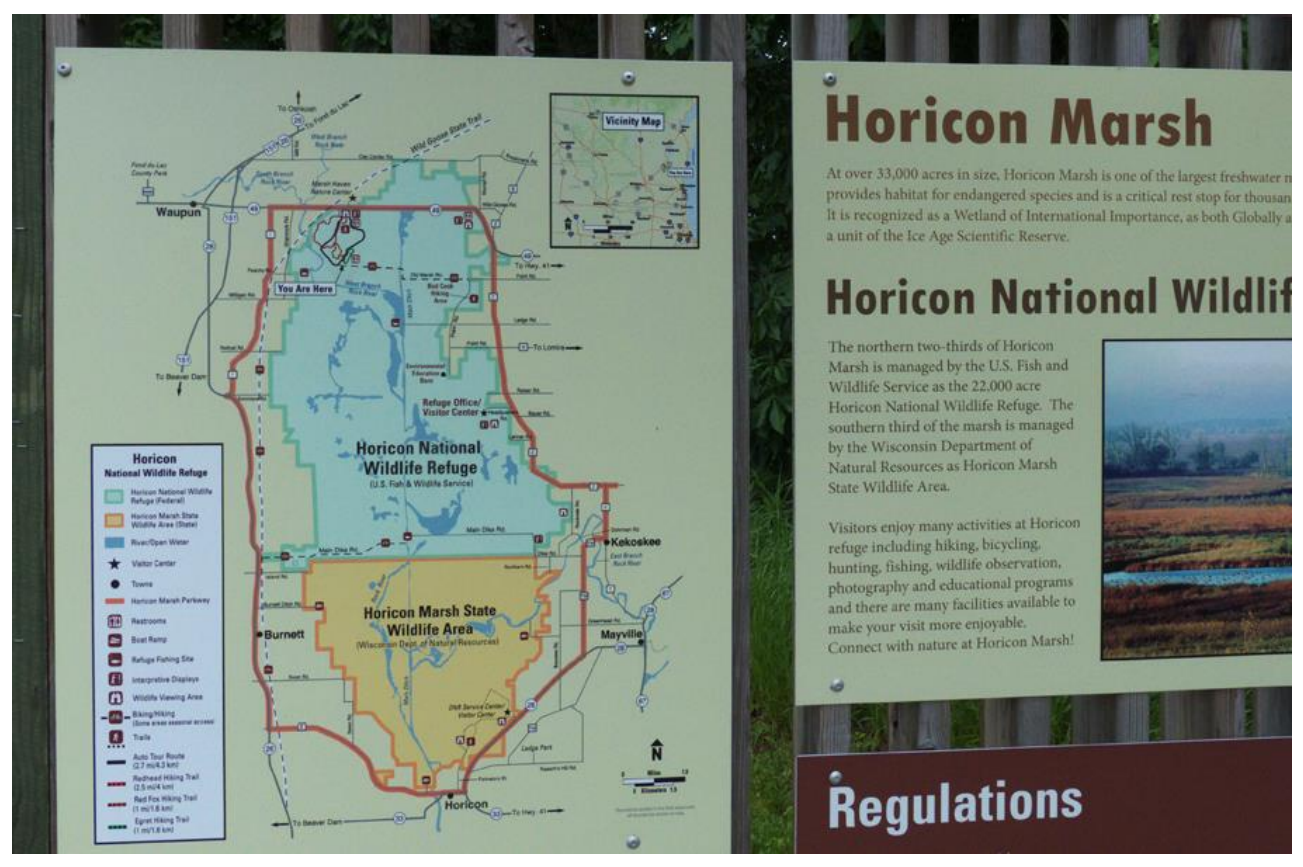
Fig. 2. A rest area map provides a comprehensive overview of the reserve and its roads.

In summer 2016, June 15th to 17th, I stopped at Waupun, Wisconsin, to spend one full day and one morning at the Horicon Marsh, mainly to see the place and enjoy relaxed general birding, while increasing my World Year List while doing so (at the end of the year, just under 1.300). I had already spent four-and-half days in North Michigan, driving around Lake Michigan, in my search for missing lifers and few 50 States List species, too.