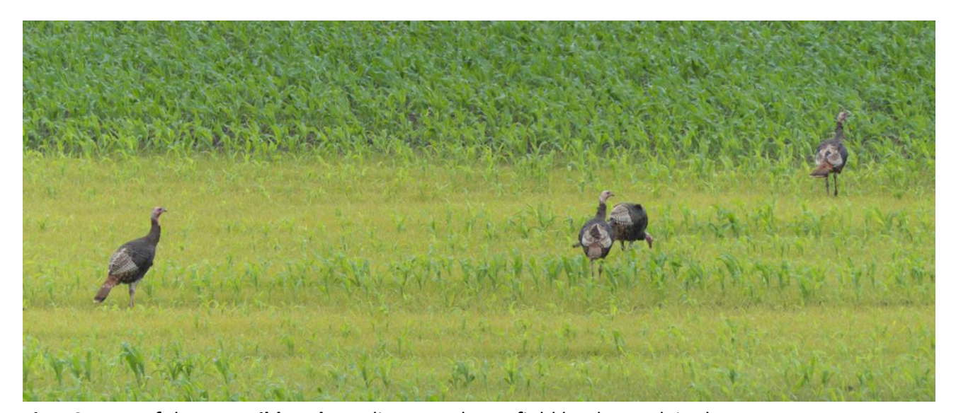
Fig. 10. Four of the ten Wild Turkeys discovered on a field by the Z Rd, in the east.

The best record probably was a Yellow Rail , of which I had just recently made four observations in North Michigan, during the previous four days (Houghton Lake & Trout Lake). It could have been either a bird on migration or a territorial one. In early June, one may expect to see both breeding birds and late migrants to the far north, not to mention migratory birds not fit enough to reach