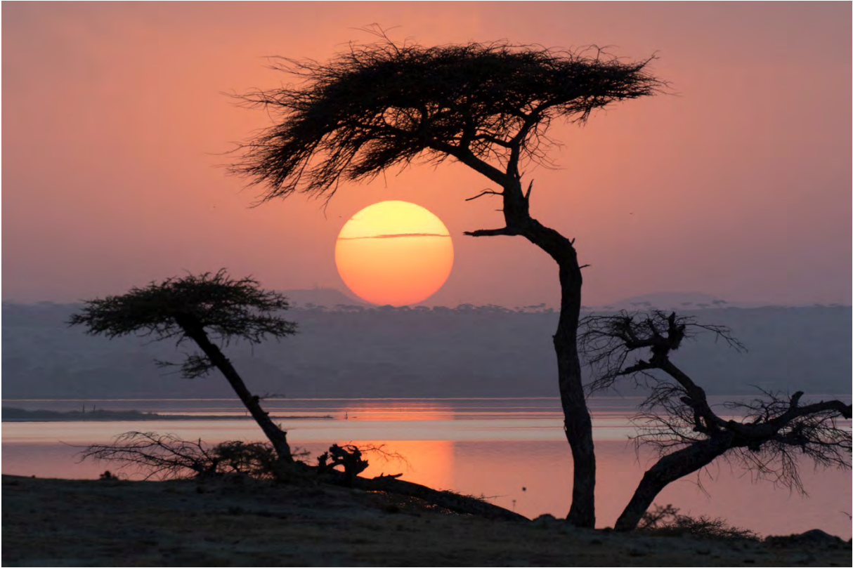
Sunset at Lake Langano (TC)