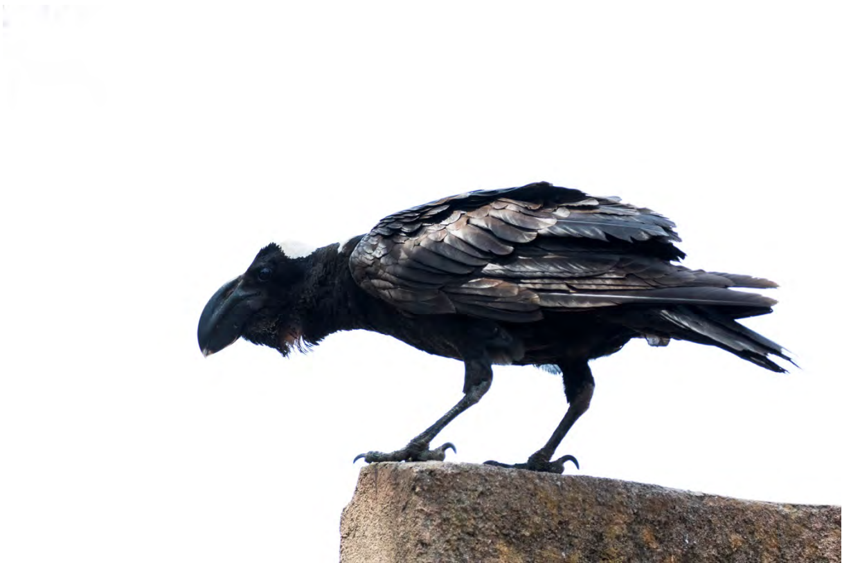
Thick-billed Raven, Sheshemene (TC)