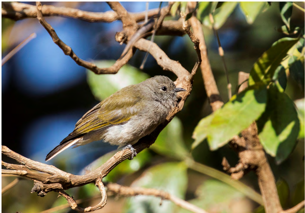
Green-backed Honeybird, Lonekoko (TC)

Peregrine Falcon Falco peregrinus 1 13/1, 1 19/1, and 1 26/1. (probably minor )