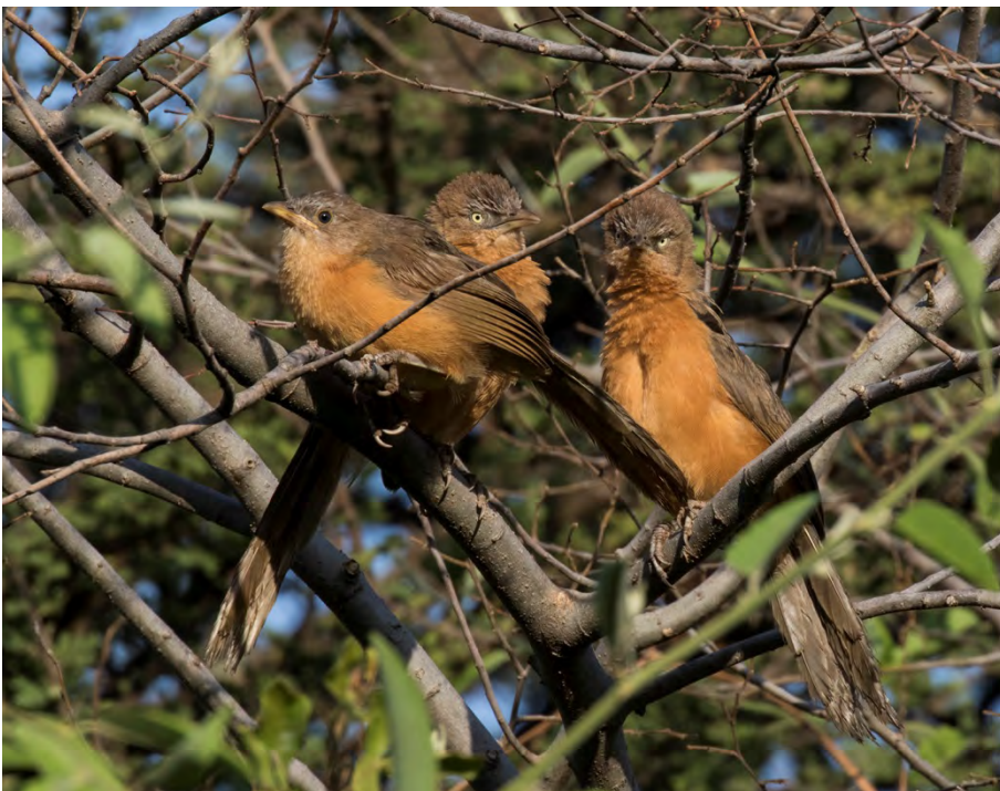
Rufous Chatterer, Bishangari (TC)

Banded Parisoma Sylvia boehmi 1 13/1, and 2 14/1. ( somalica )