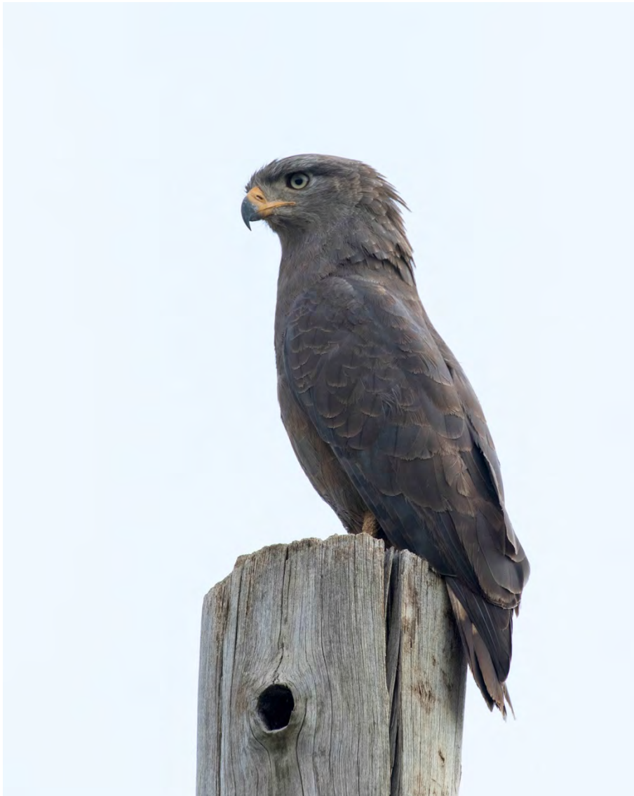
Western Banded Snake Eagle (TC)

Western Banded Snake Eagle Circaetus cinerascens 1 rd 10/1.