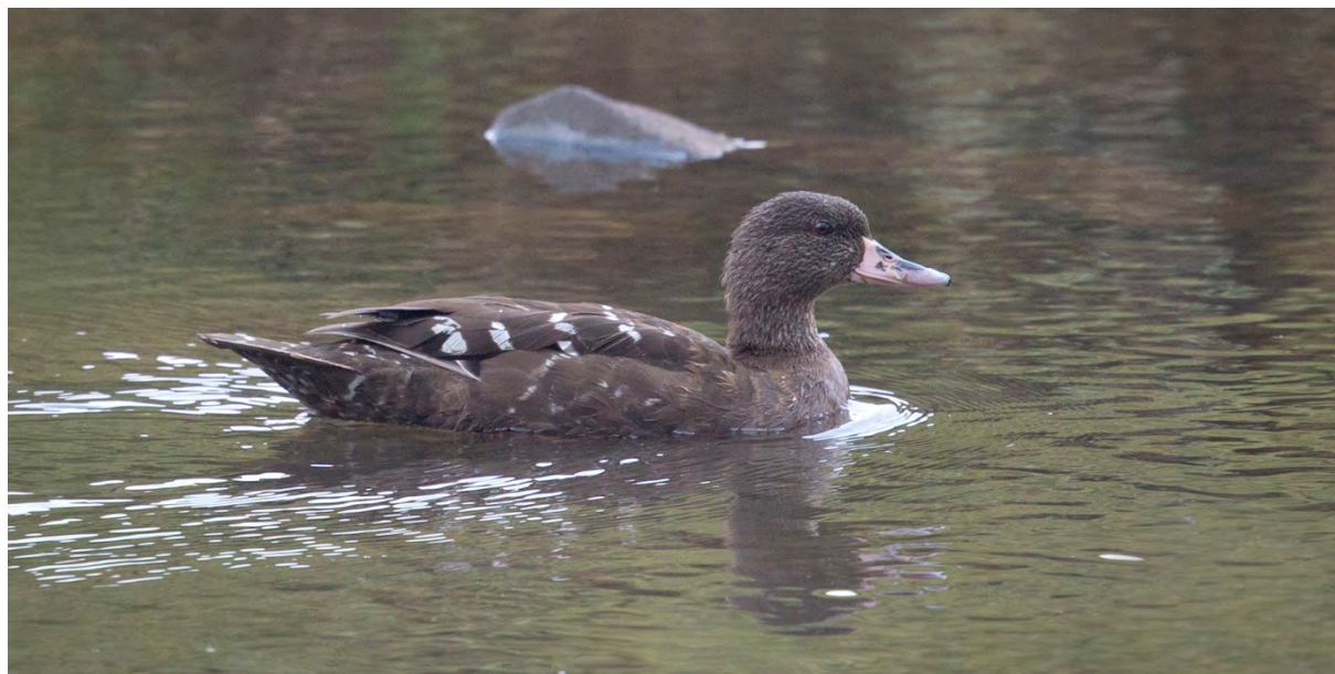
African Black Duck, Bale Mts (HP)

African Black Duck Anas sparsa Great views of 1 in a creek at Gaysay Valley, Bale Mts 18/1. ( leucostigma )