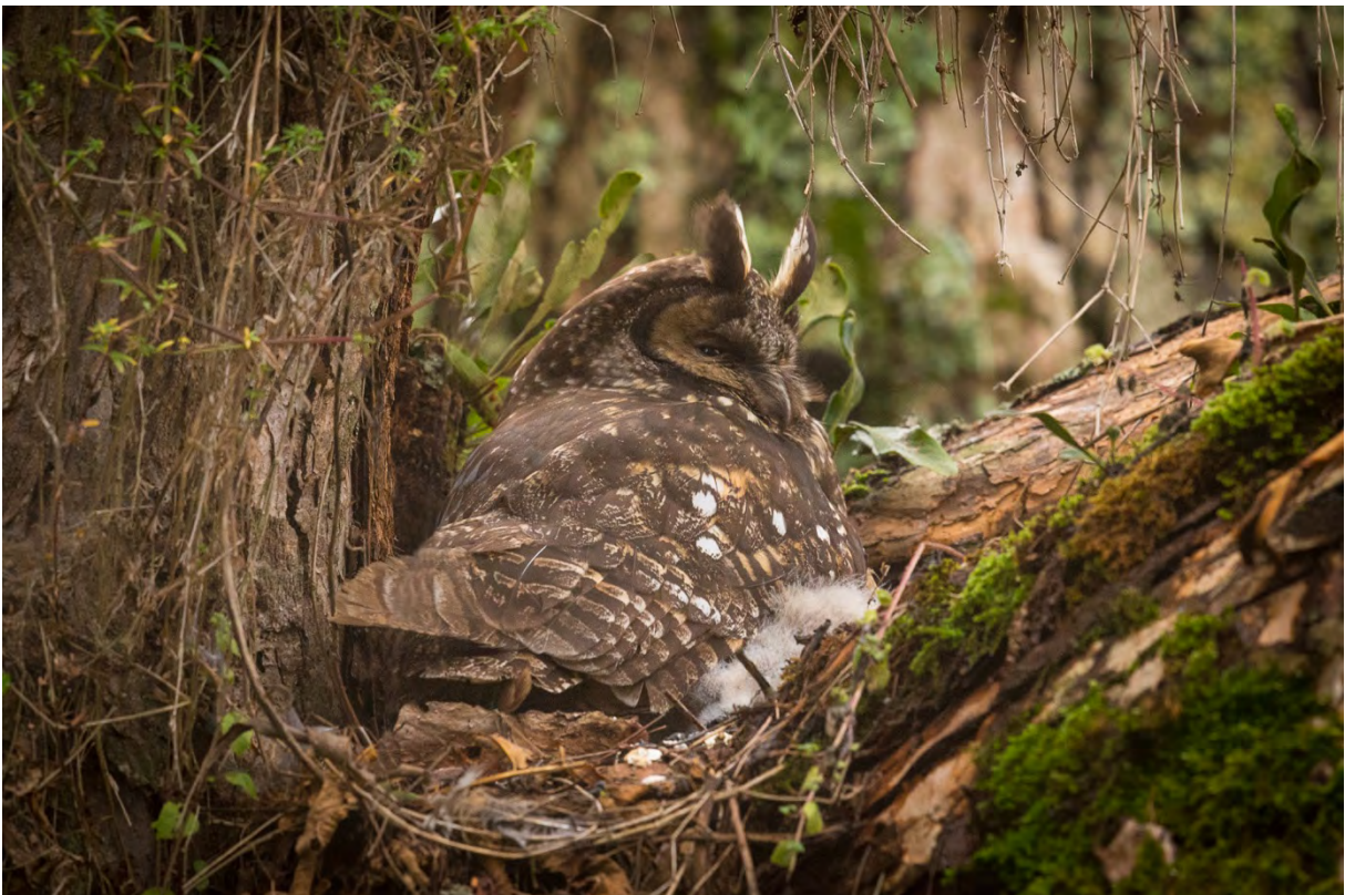
Abyssinian Owl at nest, Bale Mts (HP)