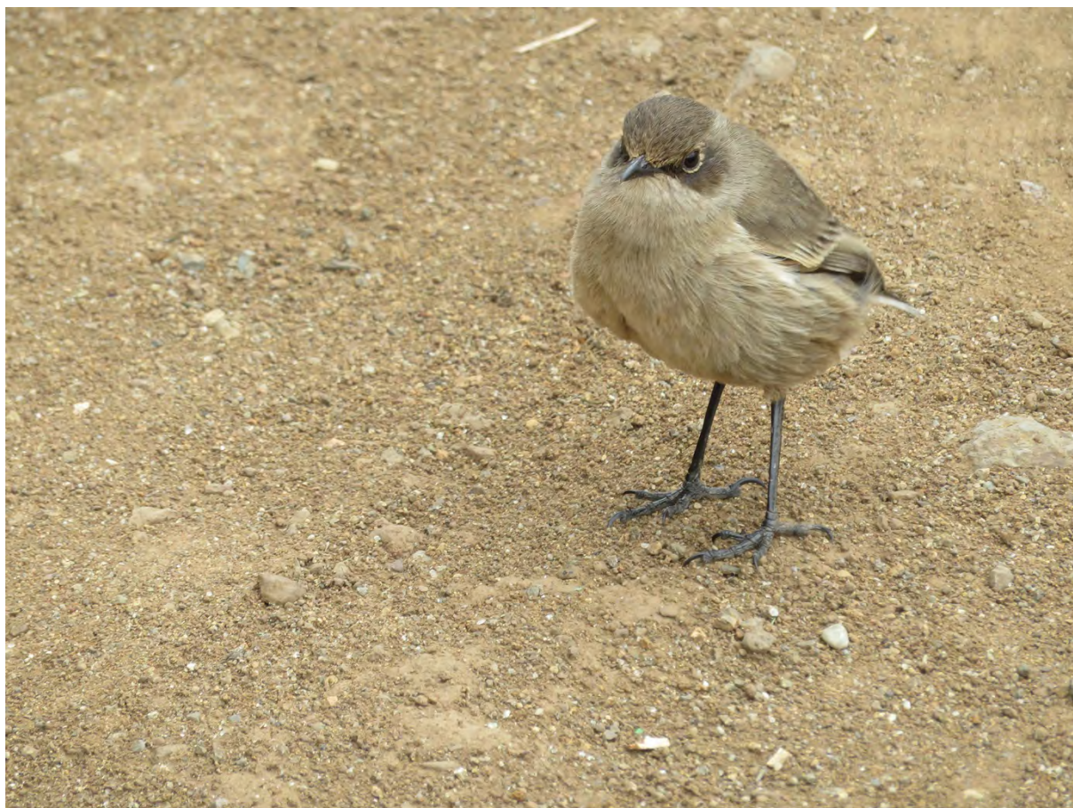
Moorland Chat, Sanetti Plateau (RH)

Red-breasted Wheatear Oenanthe bottae 2 Gaysay Valley 17/1, 15 rd 19/1, 1 20/1, 3 24/1, 6 rd 25/1, and 3 rd 27/1. ( frenata )