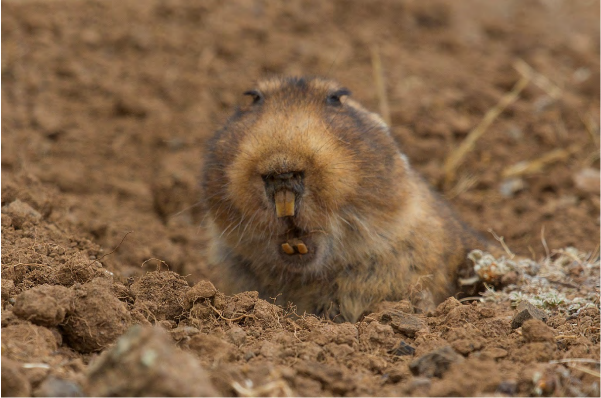
Giant Mole Rat, Sanetti Plateau