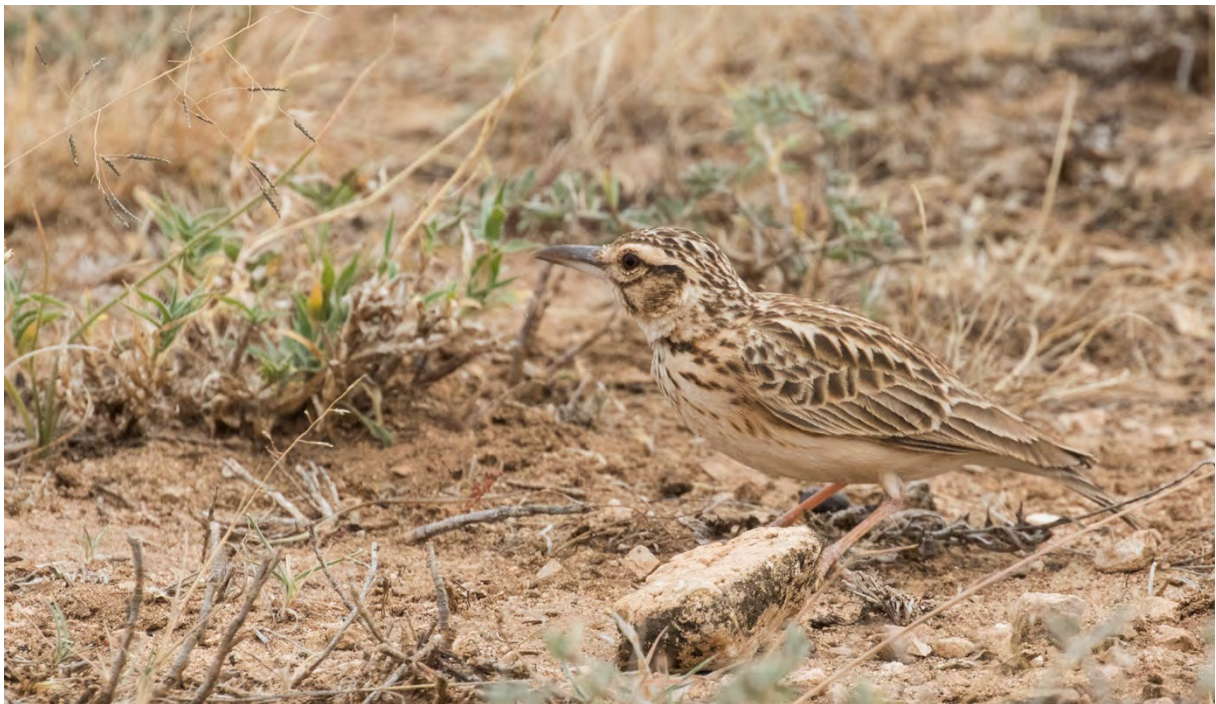
Short-tailed Lark (TC)

Short-tailed Lark Spizocorys fremantlii 15 rd 11/1, and 3 12/1. ( megaensis )