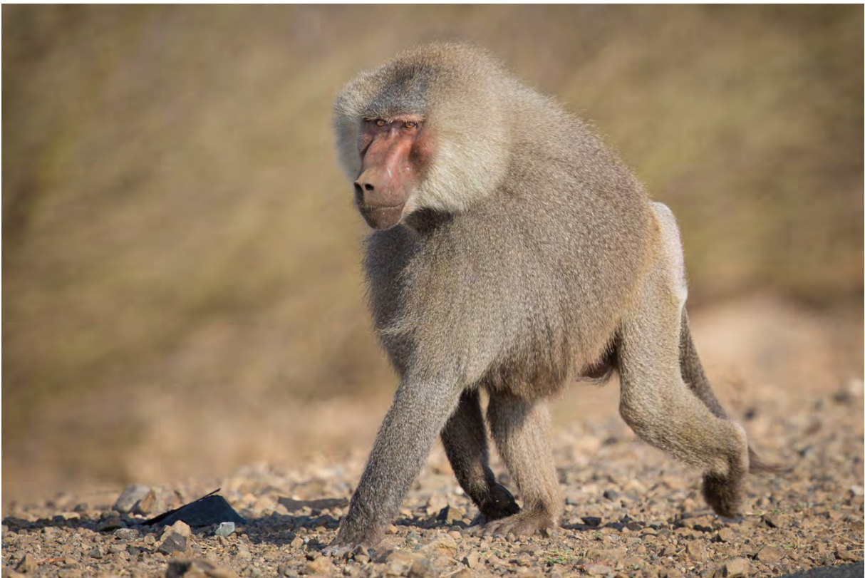
Hamadryas Baboon (HP)