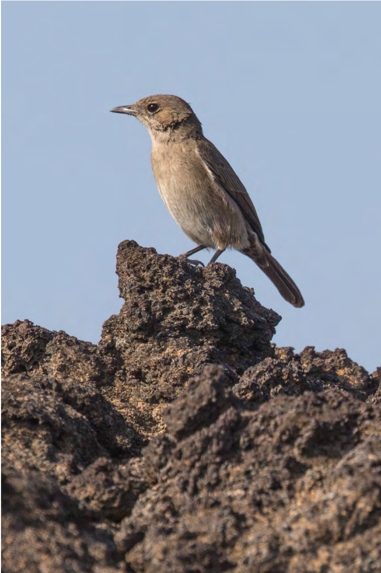
Sombre Rock Chat, Matahara area (HP)

Collared Sunbird Hedydipna collaris 5 9/1, 2 14/1, 1 15/1, 5 16/1, and 3 17/1.