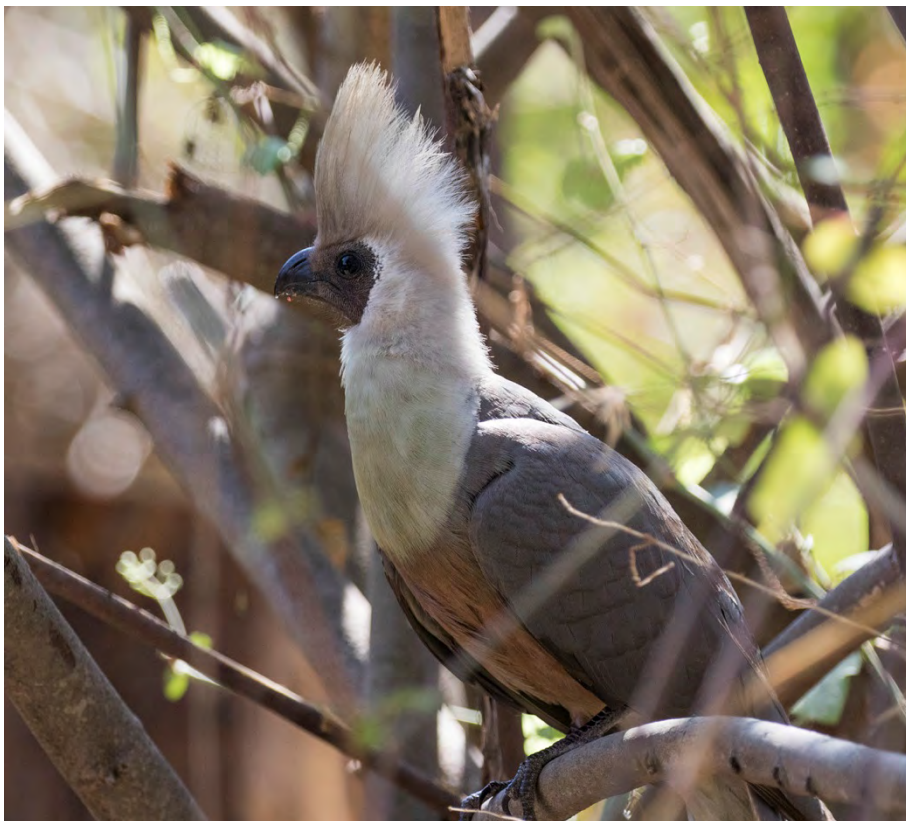
Bare-faced (Brown-faced) Go-away-bird, Bishangari

Note: This taxon is recently splitted by HBW into Brown-faced Go-away-bird Corythaixoides personatus (endemic to Ethiopia) and Black-faced Go-away-bird C. leopoldi occurring in Kenya.