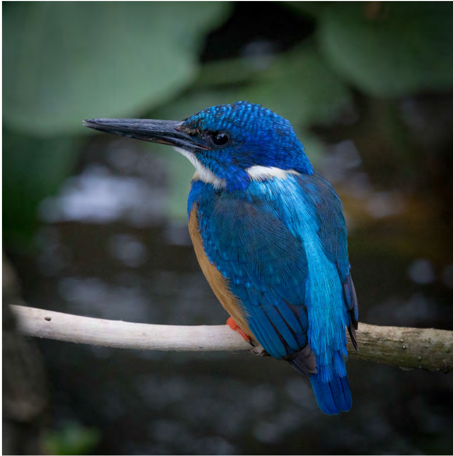
Half-collared Kingfisher, Wondo Genet (HP)

Half-collared Kingfisher Alcedo semitorquata 4 Wondo Genet 9/1, and 3 Melka Ghebdu 24/1.