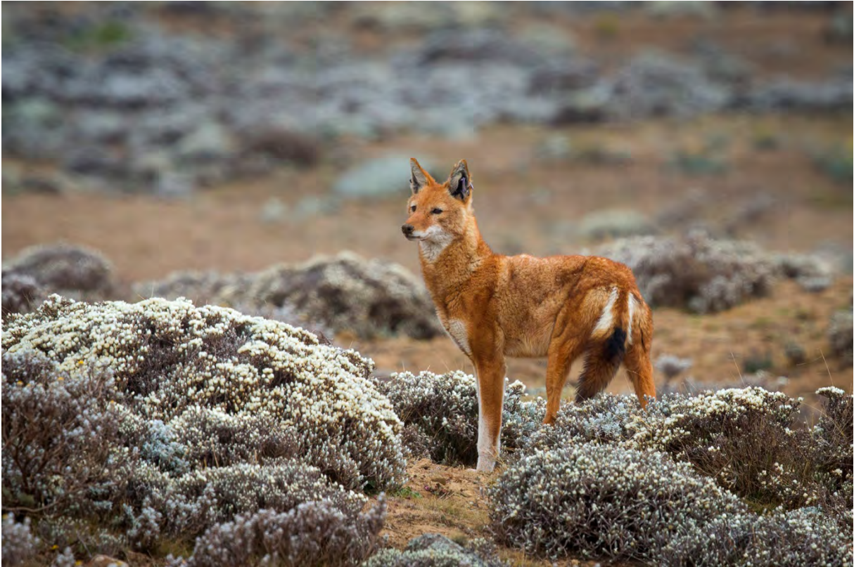
Ethiopian Wolf, Sanetti Plateau (HP)

Wildcat Felis silvestris 1 Bilen Plains 21/1, 1 at a gas station 22/1, and 1+1 rd 25/1. ( ocreata )