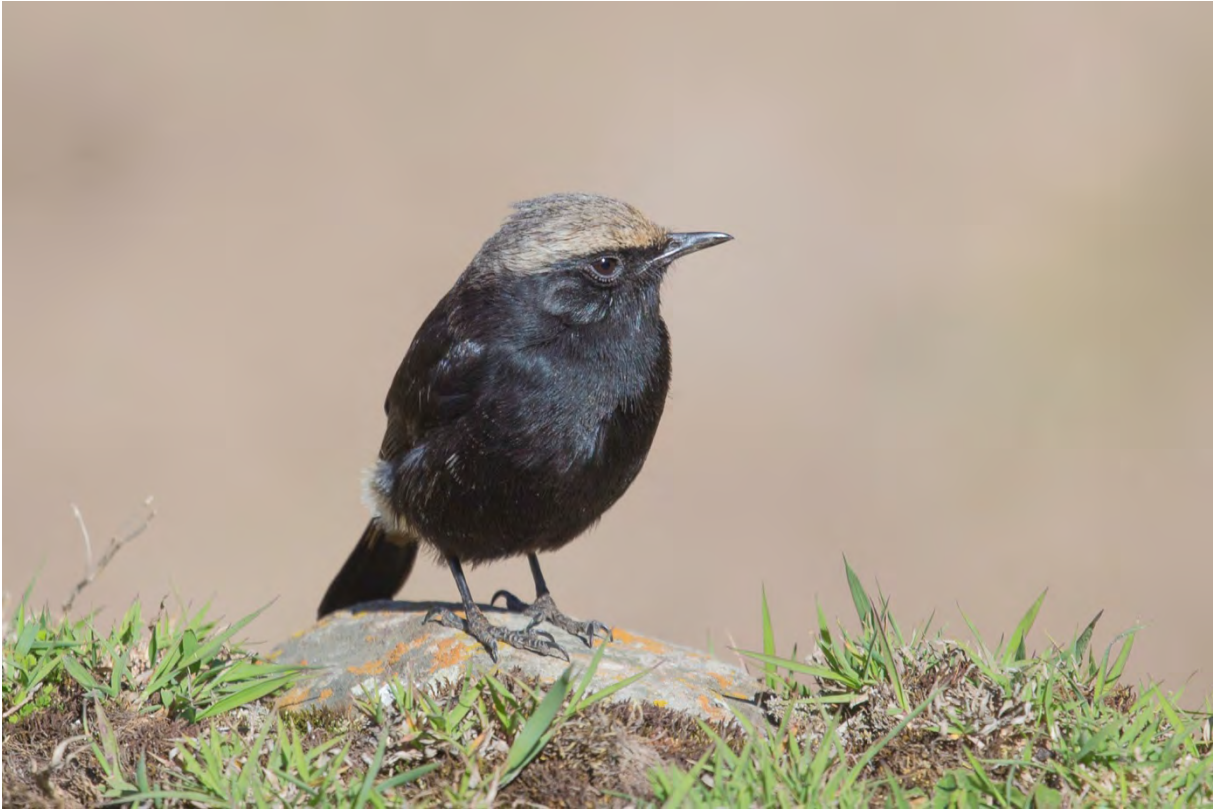
Abyssinian Wheatear (HP)