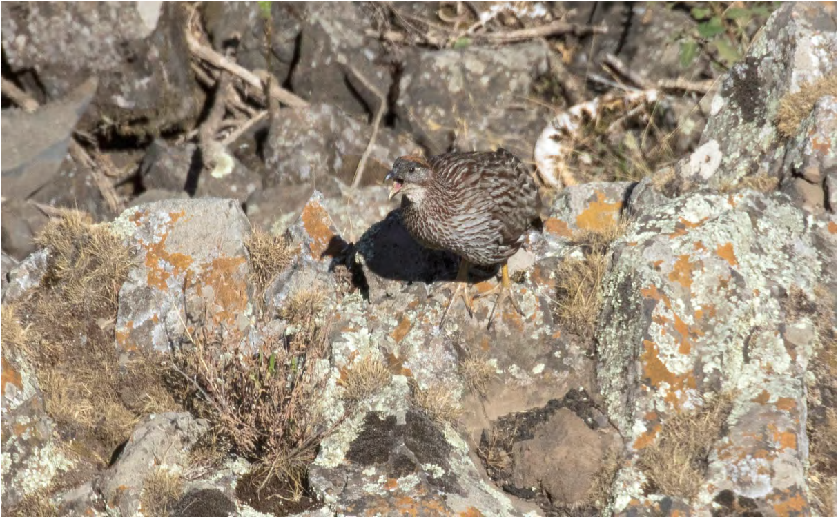
Erckel's Francolin, Jema Valley (TC)

Yellow-billed Stork Mycteria ibis 1-15 recorded on 10 dates 7-27/1.