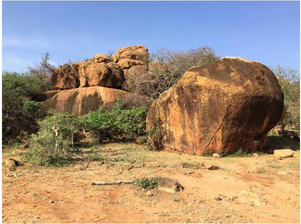
Tent camp at Bishangari, and kopje near Kenya border (TC)