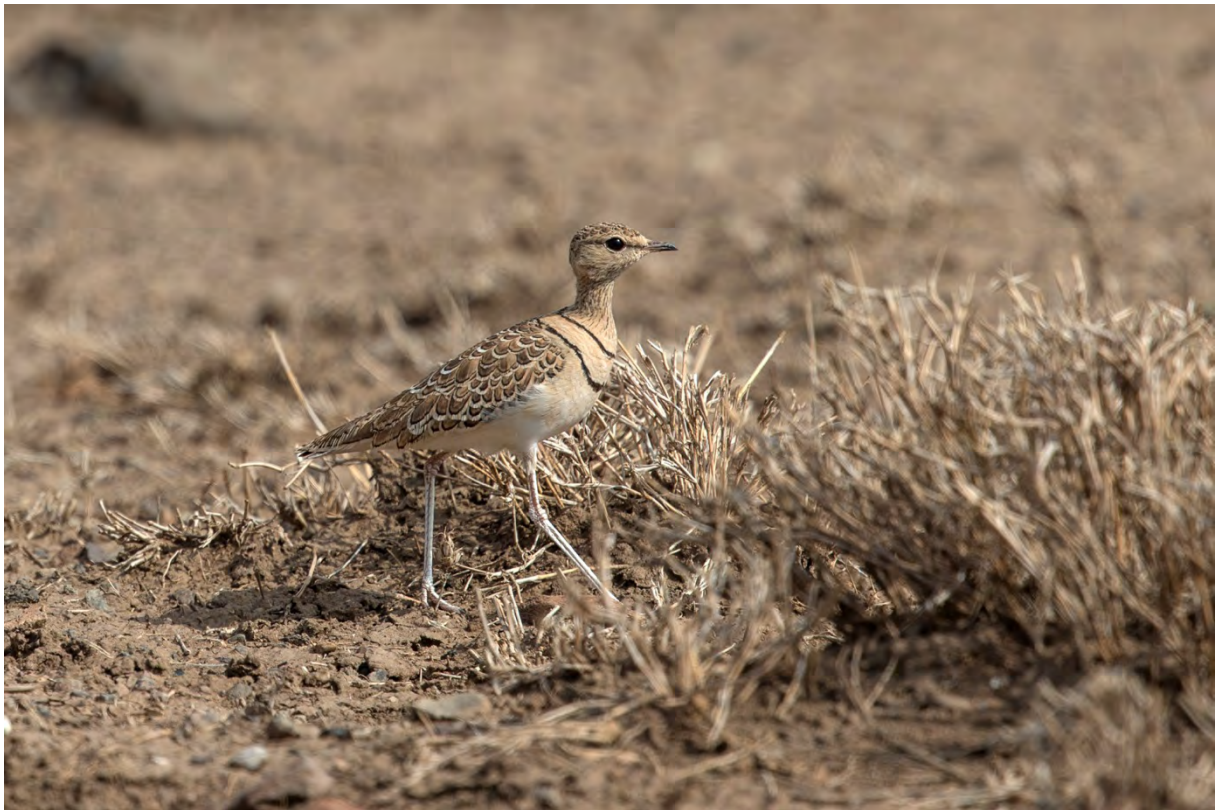
Double-banded Courser, Aledoghi Plains (HP)

White-winged Tern Chlidonias leucopterus c 10 7/1, and 2 Lake Shalla 20/1.