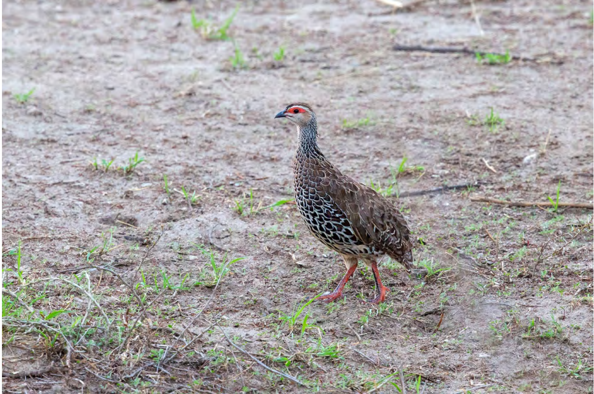
Clapperton's Francolin, Abiata-Shalla NP (HP)

together all characters, assigning species status for the Black-fronted Francolin is justified. Based on our survey, we estimate the current population to be very small, rendering the Black-fronted Francolin the most endangered galliform bird of Africa. Also, we assume its range to be much smaller and more fragmented than previously thought, making the local populations crucially endangered.”