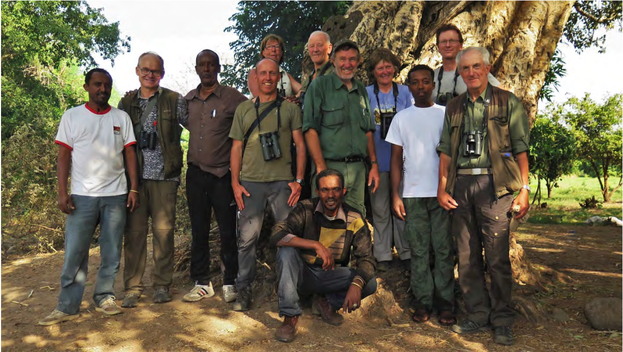
Our group (I) in Jema Valley (TC)