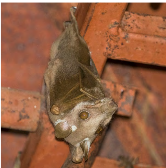
Epauletted Fruit bat sp, Jema Valley (TC)

Epauletted Fruit Bat sp. Epomophorus sp. c 25 in the roof of a campanile, near a church in Jema Valley 26/1. Could be one of three species: Ethiopian Epauletted Fruit Bat E. labiatus , Gambian Epauletted Fruit Bat E. gambianus , or East African Epauletted Fruit Bat E. minimus .