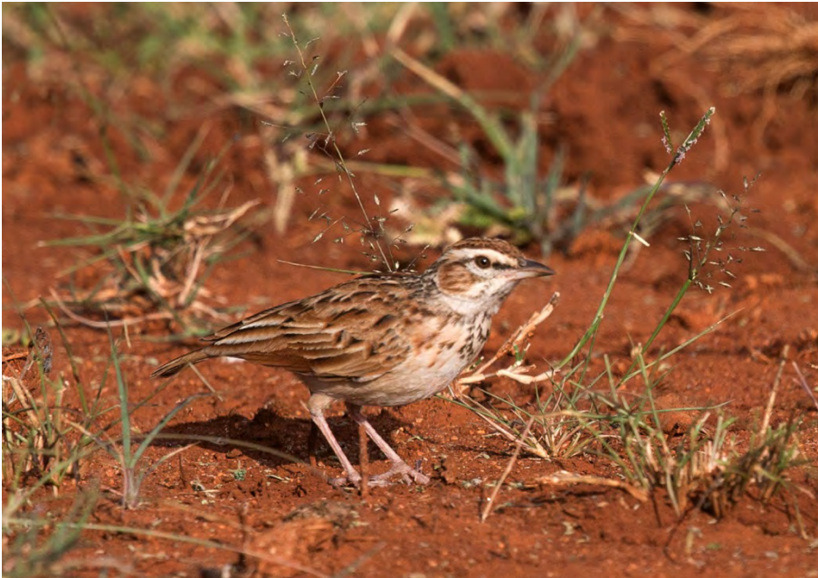
Foxy Lark (HP)

Red-winged Lark Mirafra hypermetra 1 12/1, and 1 21/1. ( gallarum )