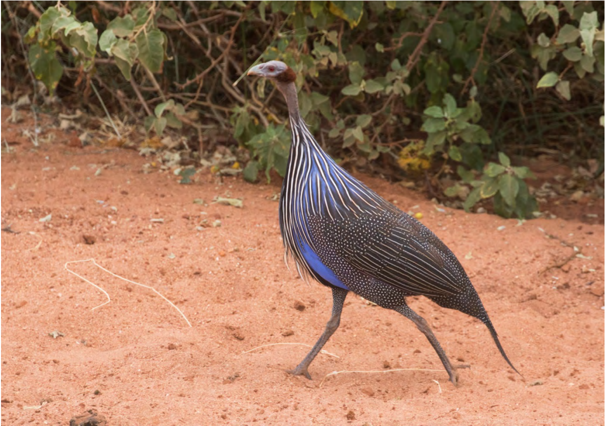
Vulturine Guineafowl (TC)

Crested Francolin Dendroperdix sephaena First recorded at Bishangari 7/1 (3); totally 70 seen on 13 dates 7-24/1.