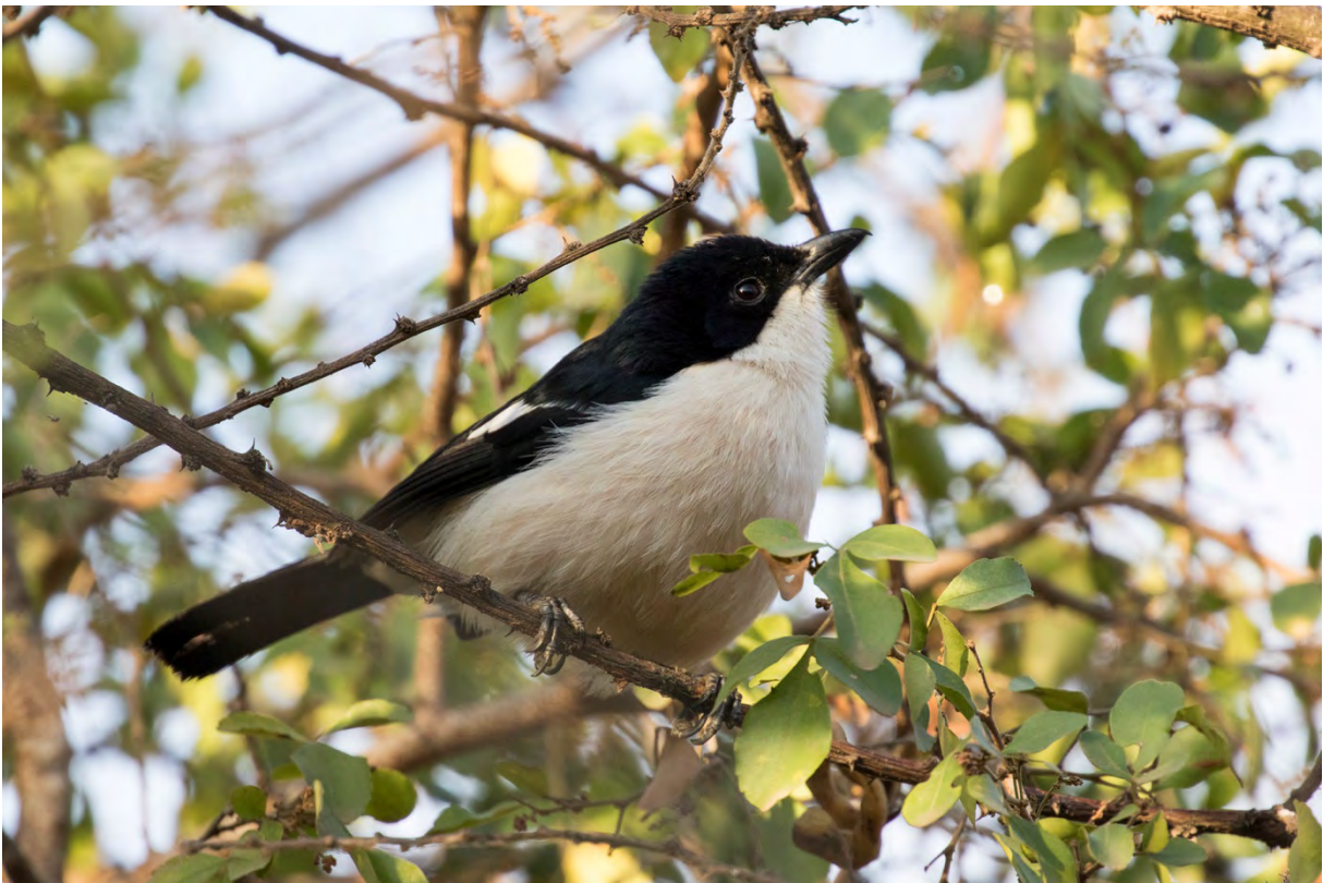
Ethiopian Boubou, Bishangari (TC)

Brubru Nilaus afer 18 recorded on 9 dates 8-21/1. (nominate)