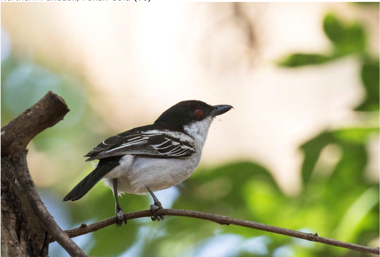
Northern Puffback, Genale River (TC)