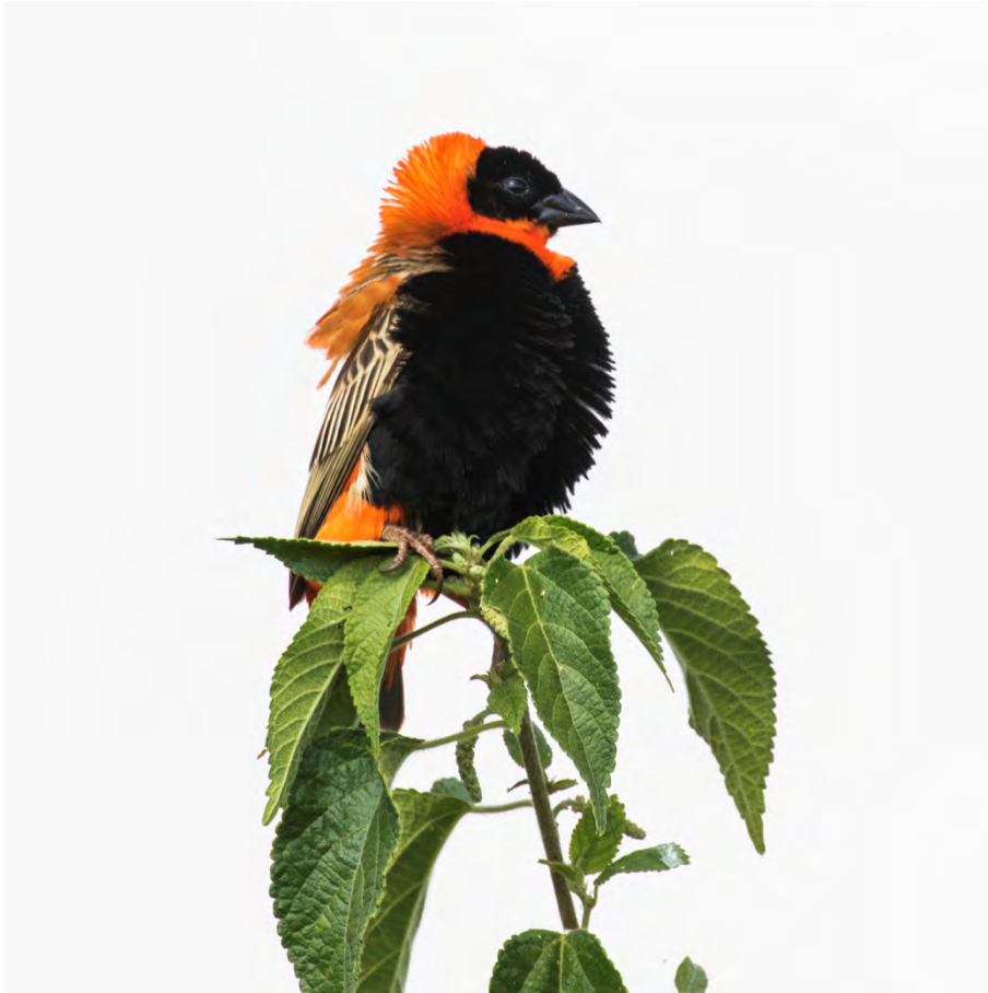
Northern Red Bishop (TC)

Orange-winged Pytilia Pytilia afra 1 where we had lunch 16/1.