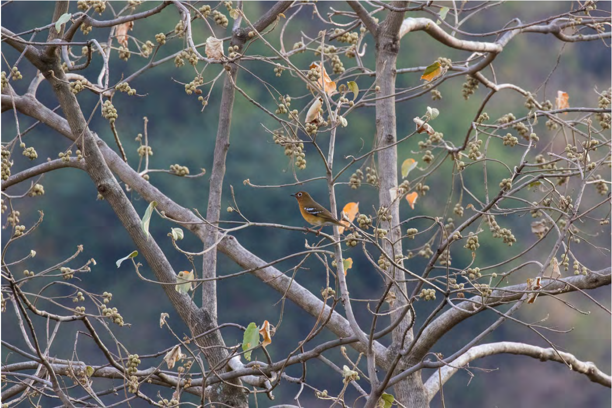
Abyssinian ground Thrush, Wondo Genet (TC)

Bare-eyed Thrush Turdus tephronotus 1 Fonan Gofa 11/1, 2 14/1, and 1 15/1.