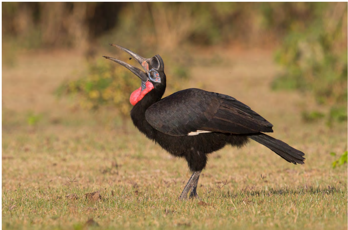
Abyssinian Ground Hornbill, male, Bishangari (HP)

Red-fronted Barbet Tricholaema diademata 1 pair en route, 5 kms SW Mega 14/1, 1 Bobela Forest 15/1, and 1 pair Abiata-Shalla NP 19/1.