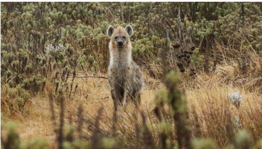
Spotted Hyena, Gaysay Valley, Bale Mts (BW)

Spotted Hyena Crocuta crocuta HO at Bishangari 7/1, 2 seen Lake Boyo 10/1, HO at camp sites 13/1 and 15/1, HO at camp site Haremma Forest and 1 seen Gaysay Valley 17/1, HO 18/1, 3 seen 19/1, and HO at camp site 23/1.