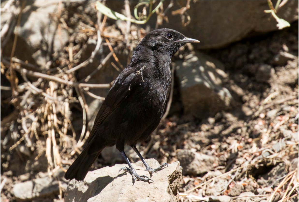
Rüppell's Black Chat, Jema Valley (TC)