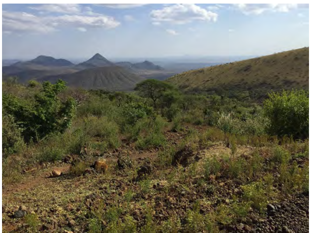
Kollawako Village and view near Fonan Gofa (TC)