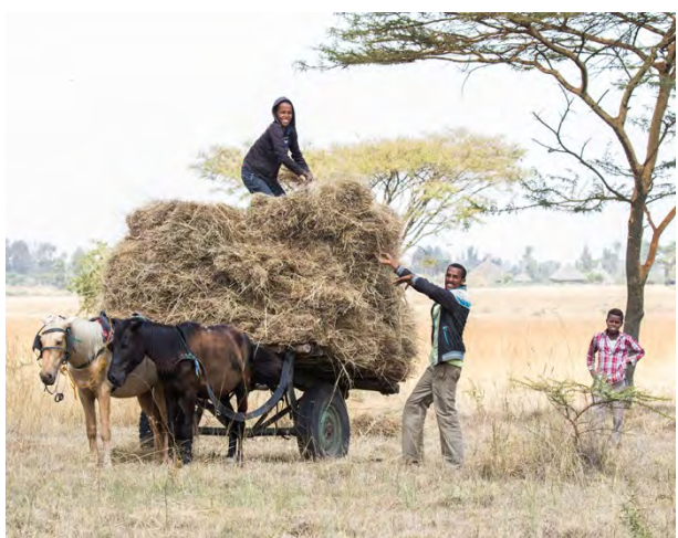
Roadside Ethiopians (above), and people in Jema Valley (below)