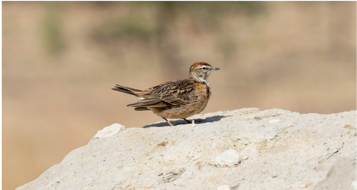
Erlanger's Lark, near Lake Boyo (TC)

Erlanger's Lark Calandrella erlangeri E. 2 near Lake Boyo 10/1, 6 rd 24/1, and 10 rd 25/1.