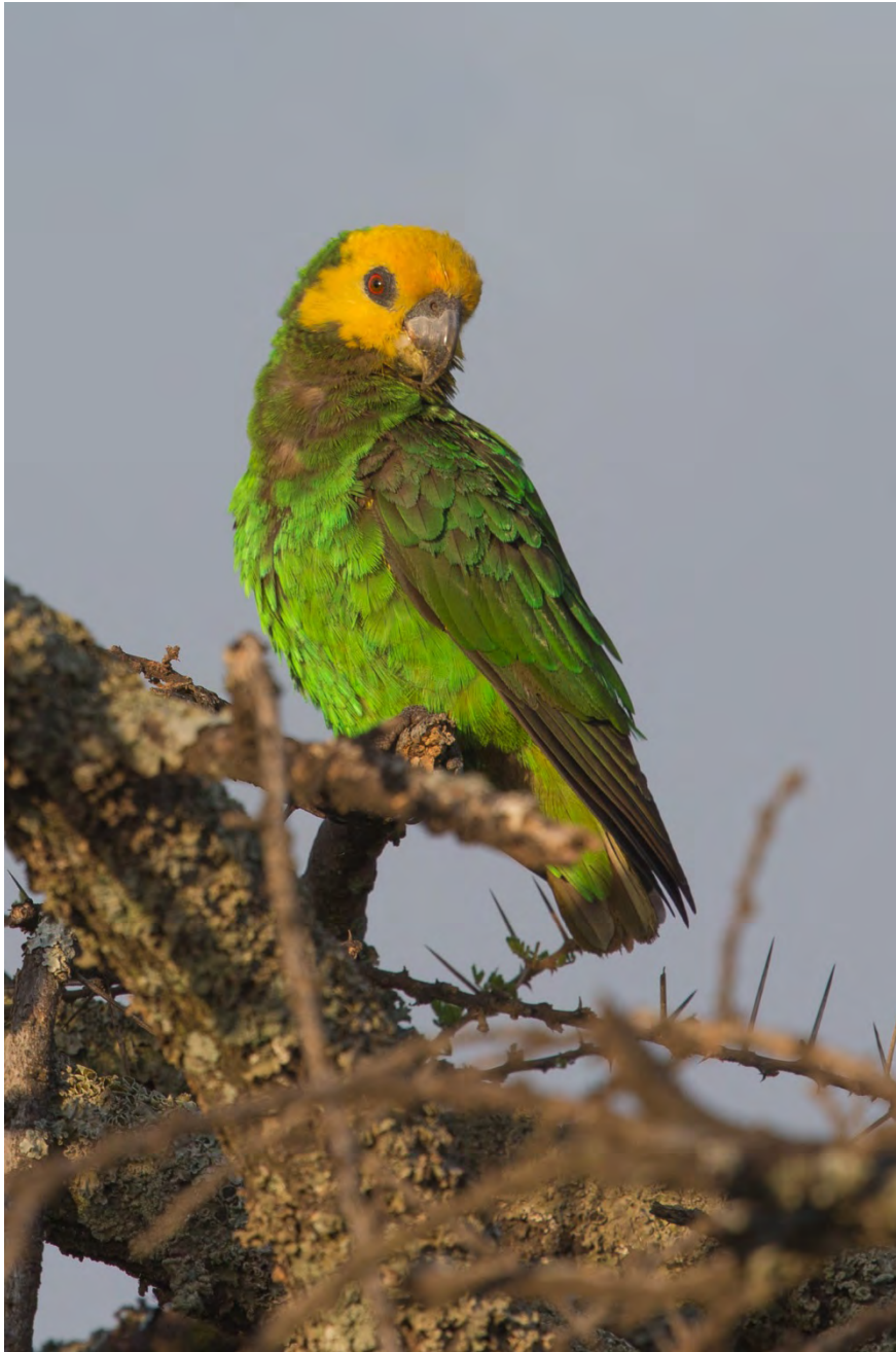
Yellow-fronted Parrot, Bishangari (HP)

Yellow-fronted Parrot Poicephalus flavifrons E. 3 + 33 Bishangari 7-8/1, and 6 Wondo Genet 8/1.