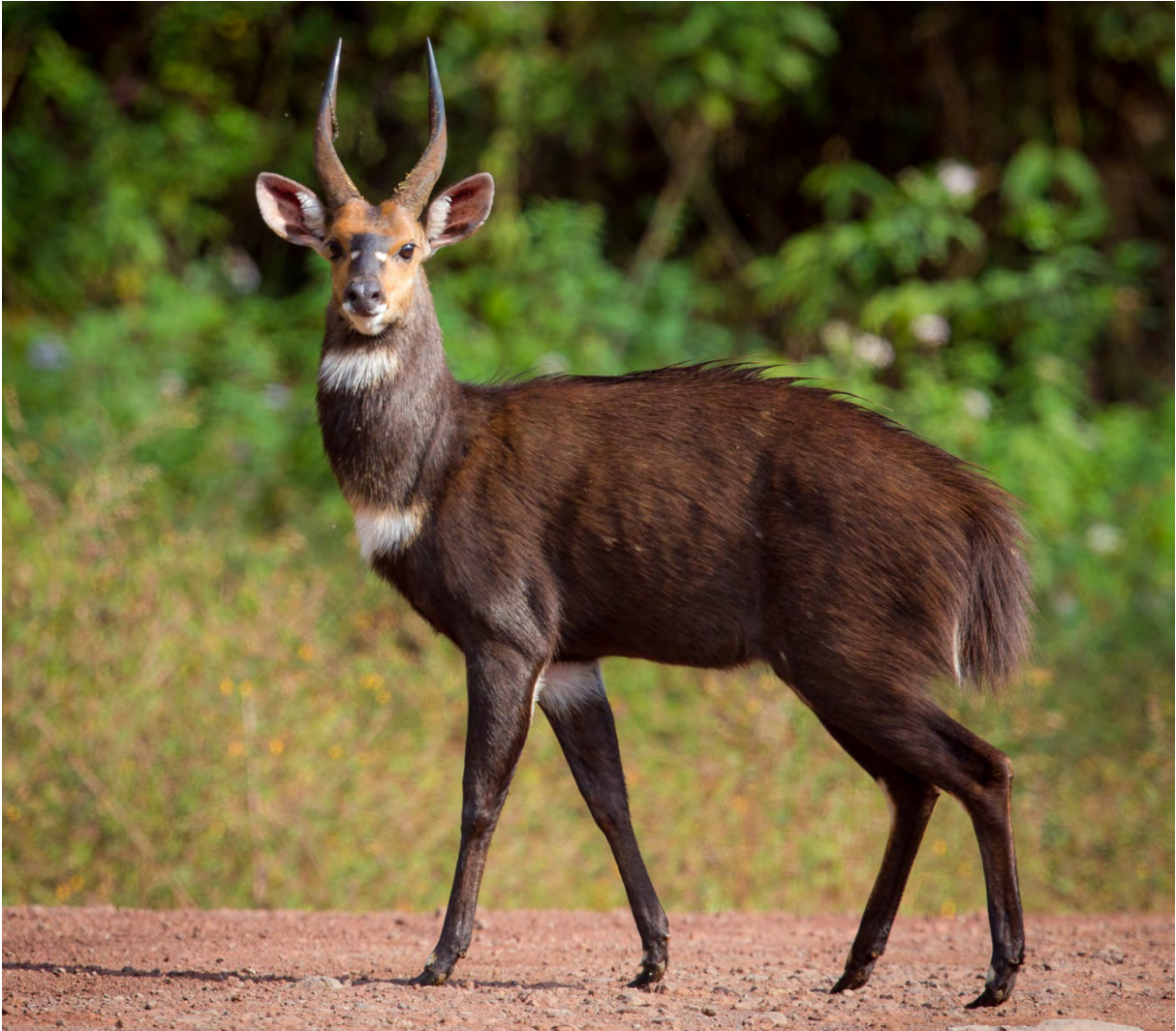
Ethiopian Highlands Bushbuck, Haremma Forest (HP)

Northern Lesser Galago Galago senegalensis 2 seen after dusk at Abiata-Shalla NP. ( dunni )