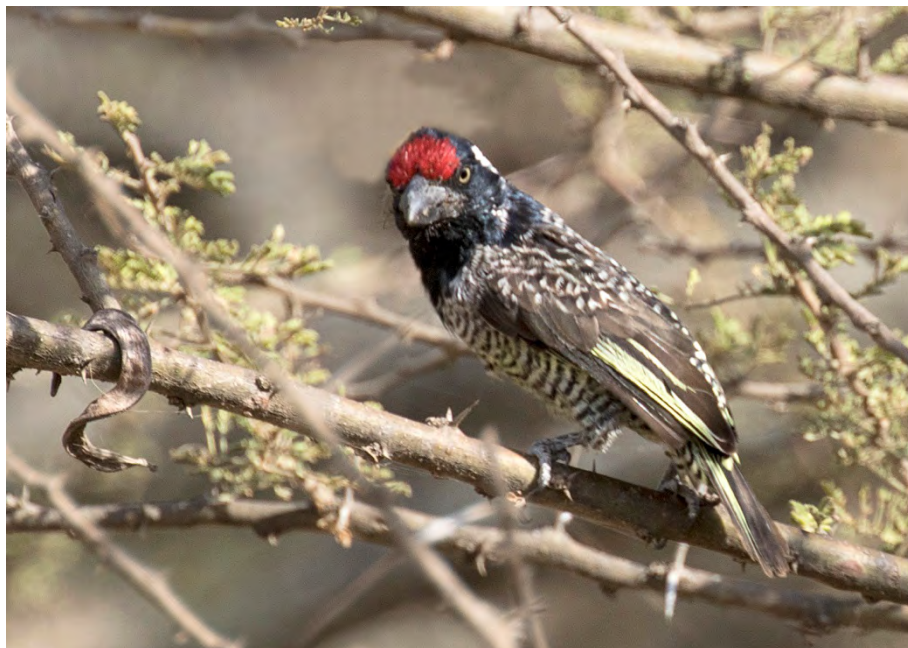
Banded Barbet, Bishangari (TC)

Banded Barbet Lybius undatus c 18 recorded on 7 dates 7-25/1. ( undatus in NW to C Ethiopia, and leucogenys in SC to SW Ethiopia)