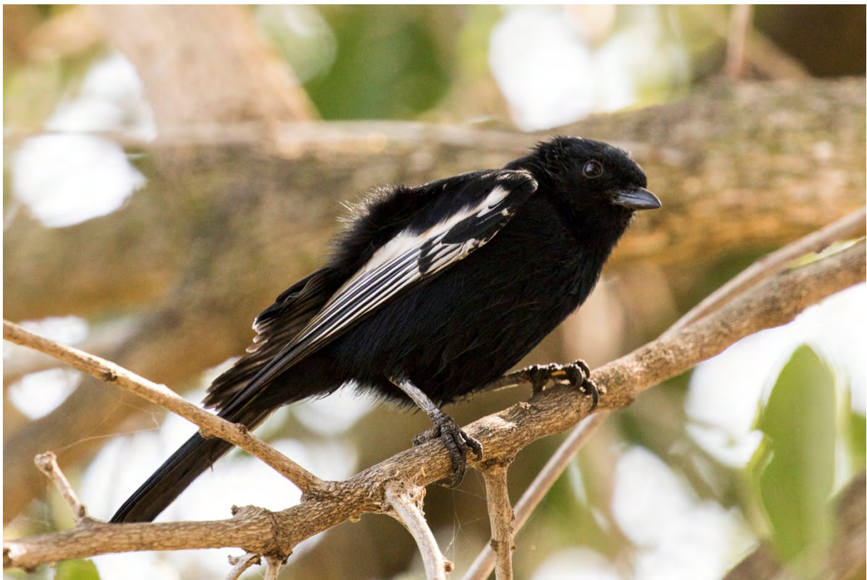
White-winged Black Tit, Bishangari (TC)