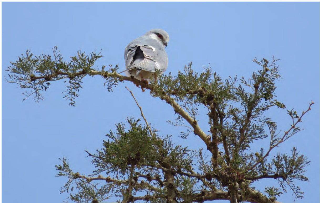
Scissor-tailed Kite, Senkele Wildlife Sanctuary (RH)

Bearded Vulture Gypaetus barbatus 1 Rira 17/1, 1 Gaysay Valley 18/1, 1 22/1, and 2 Debre Birhan 24/1. ( meridionalis )