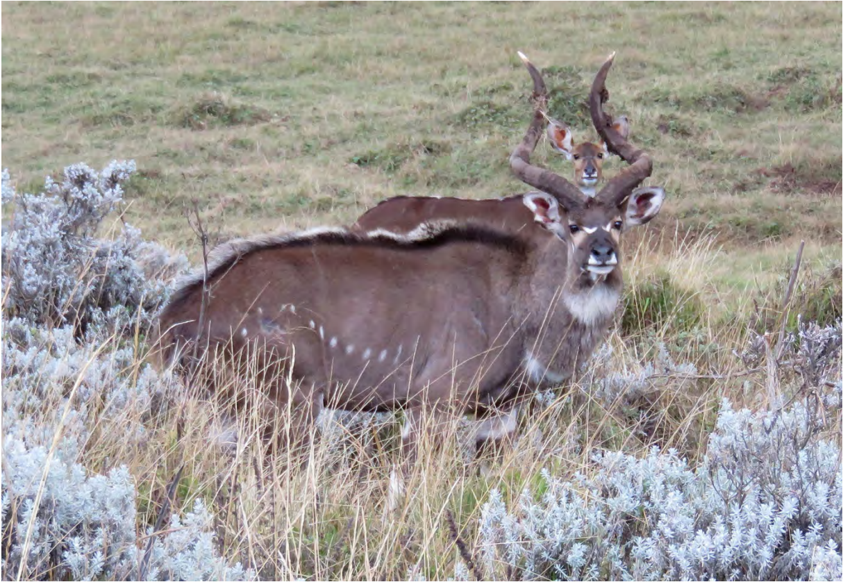
Gedemsa, Bale Mts (RH)