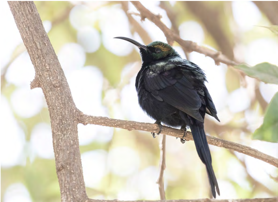
Tacazze Sunbird (TC)

Variable Sunbird Cinnyris venustus 40 recorded on 7 dates. ( albiventris )