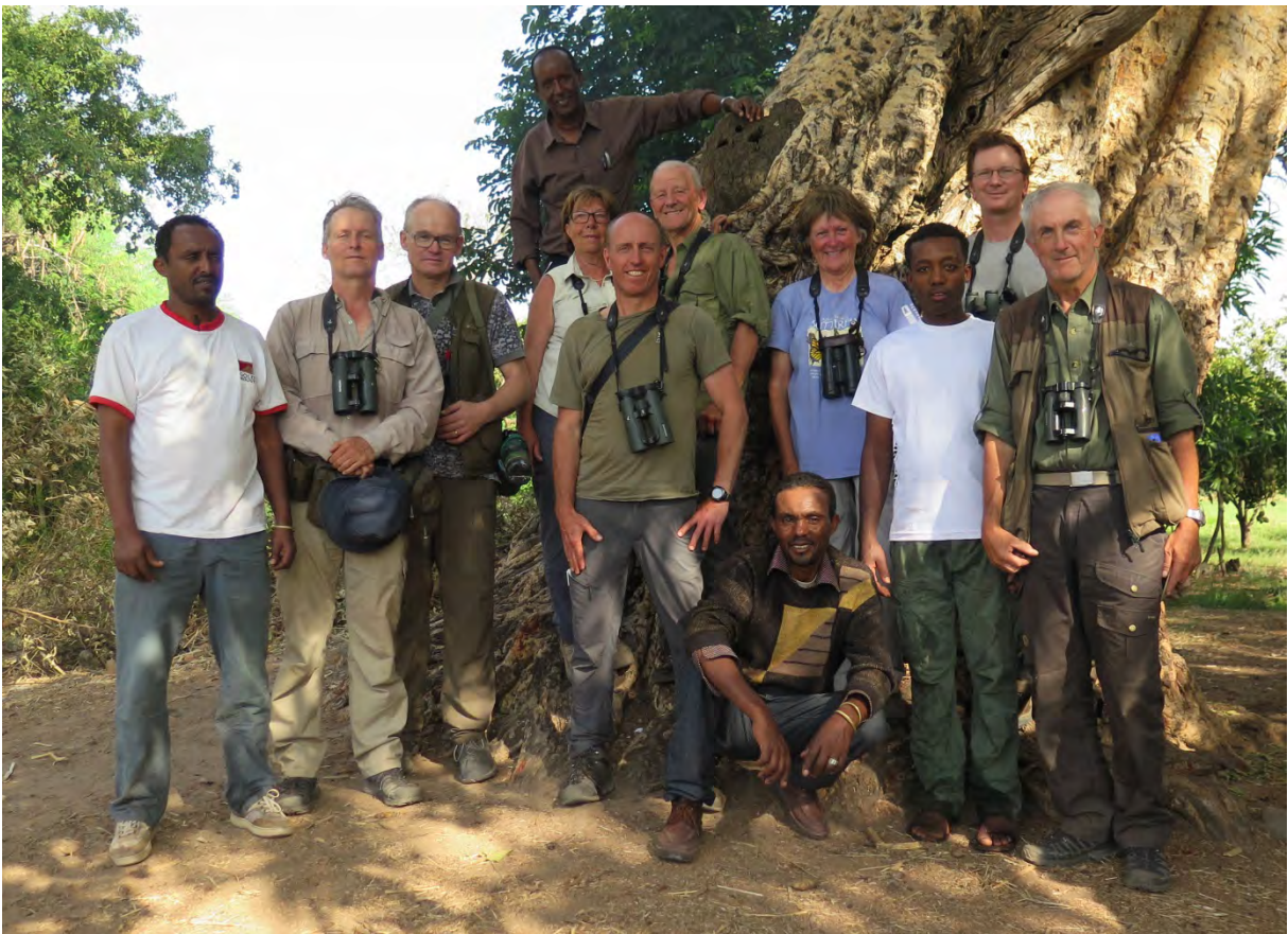
Our group (II) in Jema Valley (HP)