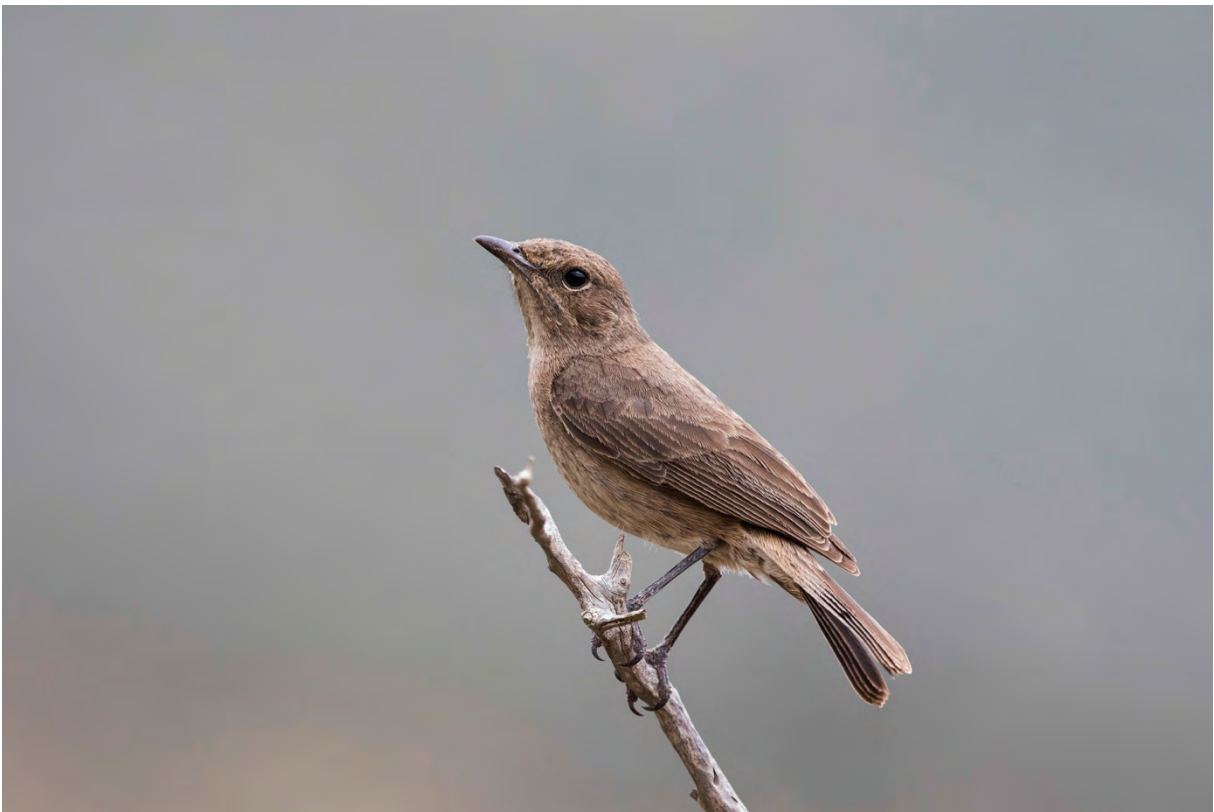
Brown-tailed Rock Chat, near Fonan Gofa