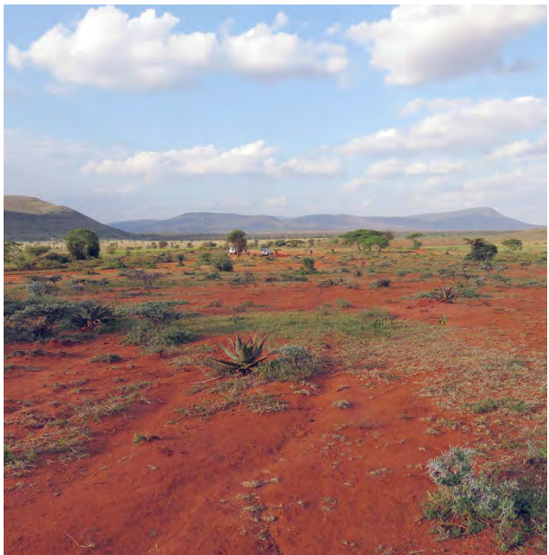
Jema Valley rift (TC), and Africa's red soil, Kollawako Village (RH)