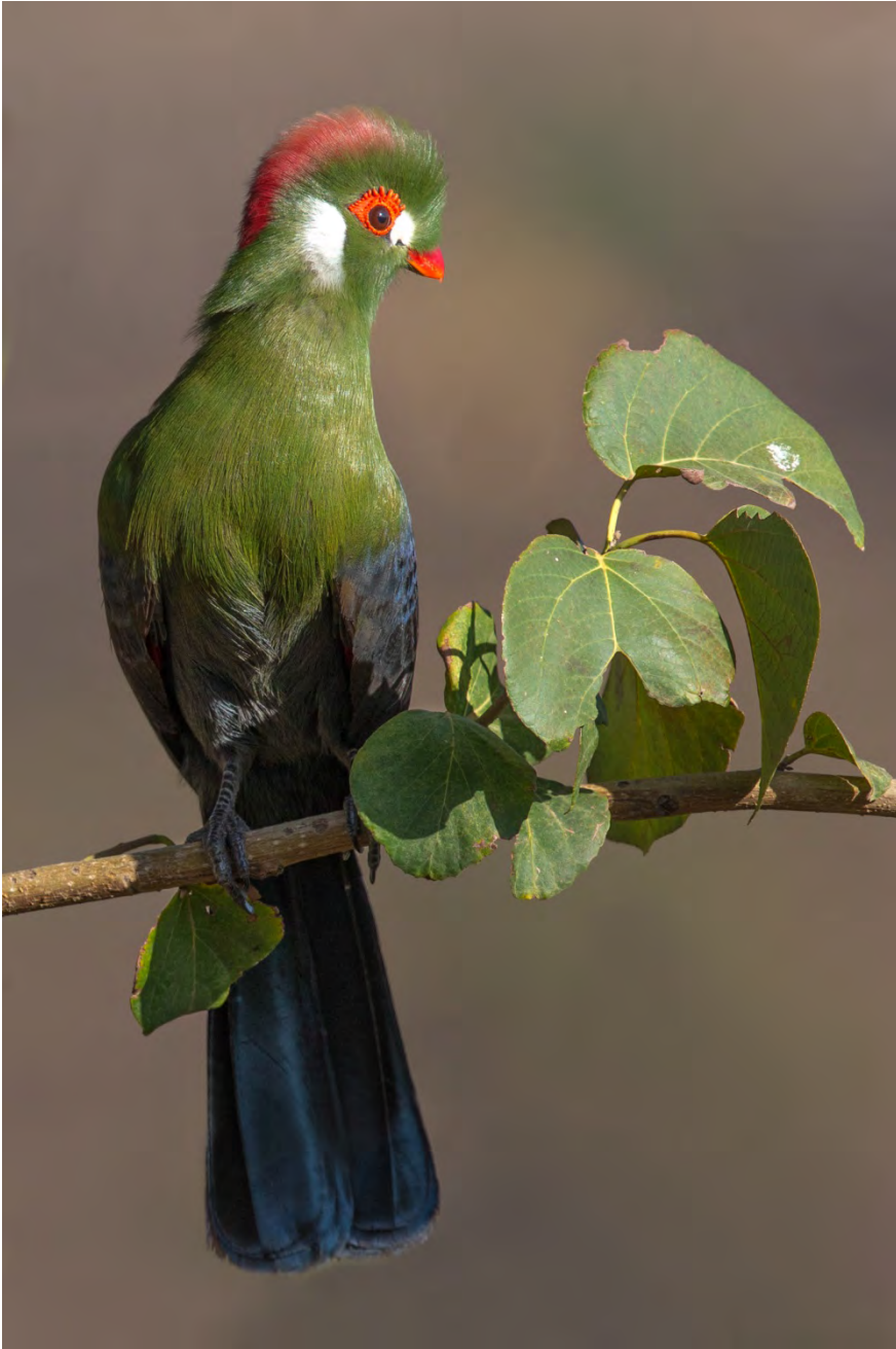
Maroon-crested Turaco Tauraco leucotis donaldsoni (HP)

White-bellied Go-away-bird Corythaixoides leucogaster c 110 recorded on 13 dates 10-24/1, most common btw 11-16/1.