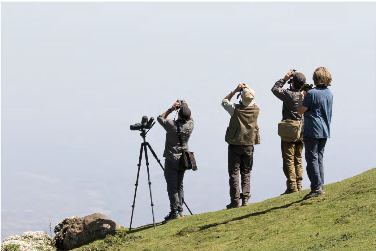
Birding at Gemasa Gedel (TC)