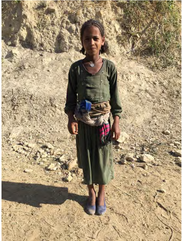
Kids at Gofa stream (TC)