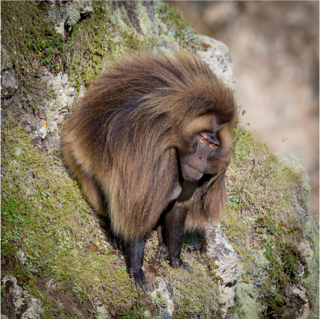
Gelada Baboon (HP)