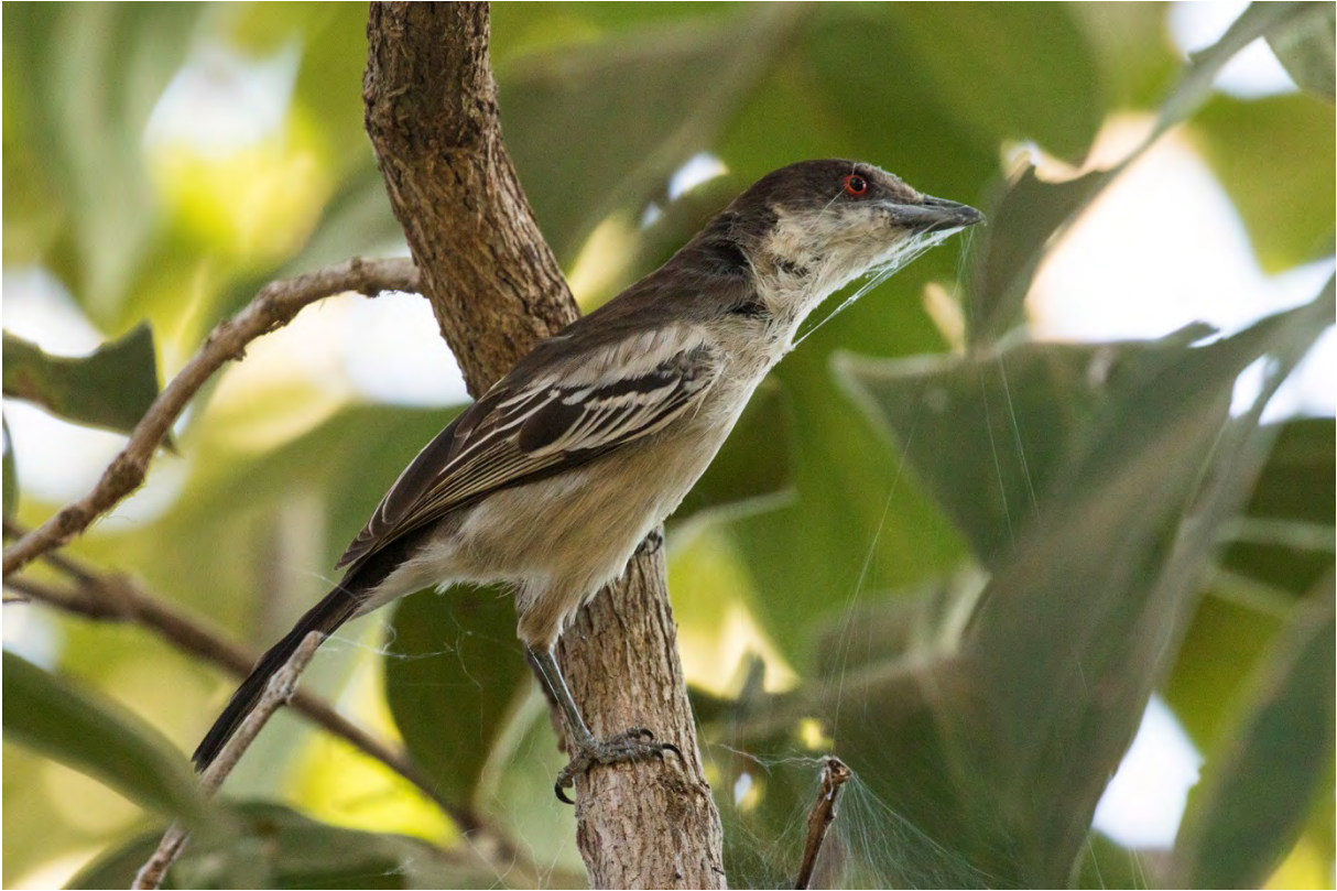
Northern Puffback, Fonan Gofa (TC)