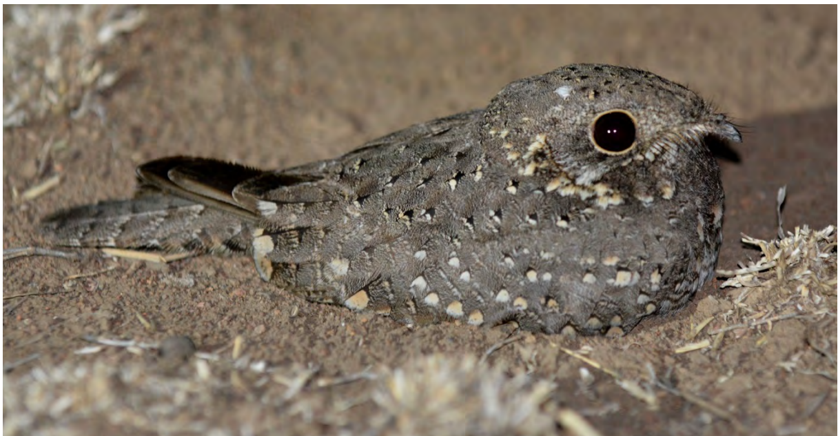
Star-spotted Nightjar, Awash NP, two different birds (BS)

Speckled Mousebird Colius striatus Recorded on 11 dates 7-27/1, often as common 7-16/1 and 25-26/1.