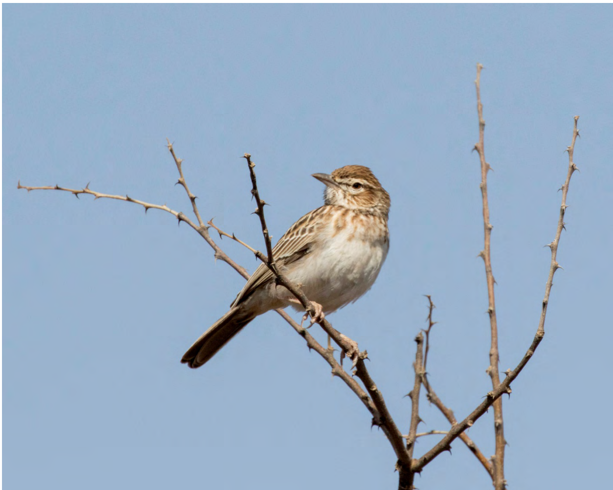
Gillett's Lark Mirafraga gilletti in Awash NP.

African Golden Wolf, Side-striped Jackal, Ethiopian Wolf, Bat-eared Fox, Serval, Wildcat, Swayne's Hartebeest, Soemmerring's Gazelle, Ethiopian Klipspringer, Beisa Oryx, Bush Duiker, Ethiopian Highlands Bushbuck, Gedemsa (Mountain Nyala), Hamadryas Baboon, Gelada Baboon, Northern Lesser Galago, Giant Mole Rat, and Honey Badger.