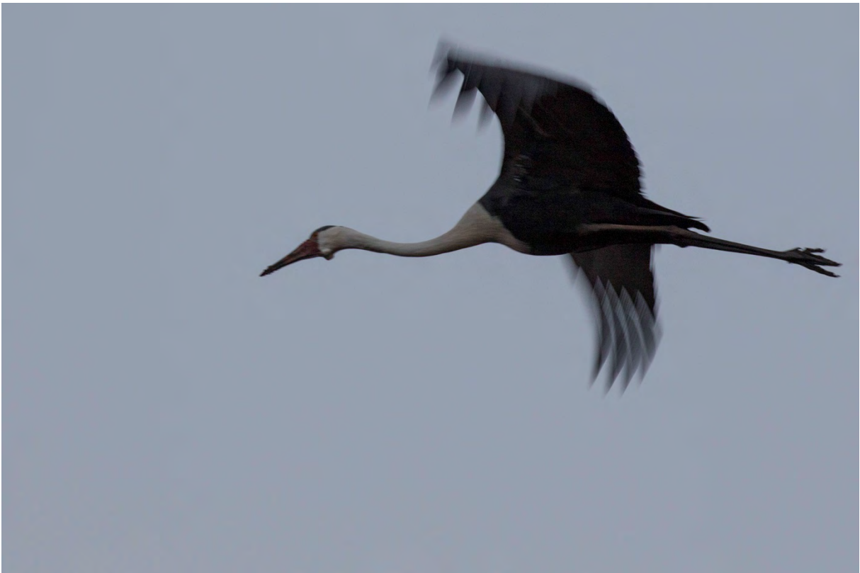
Wattled Crane late evening (TC)