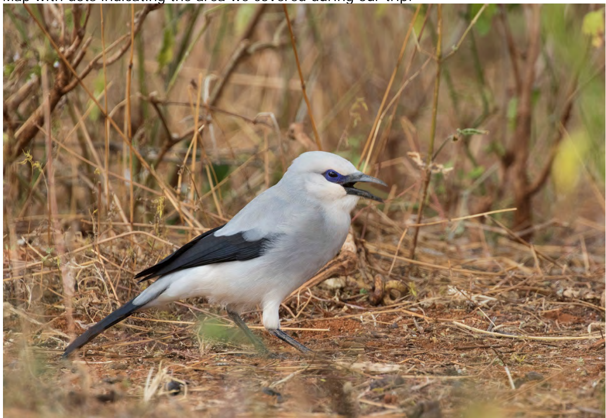
Stresemann's Bushcrow, one of many stunning Ethiopian endemics