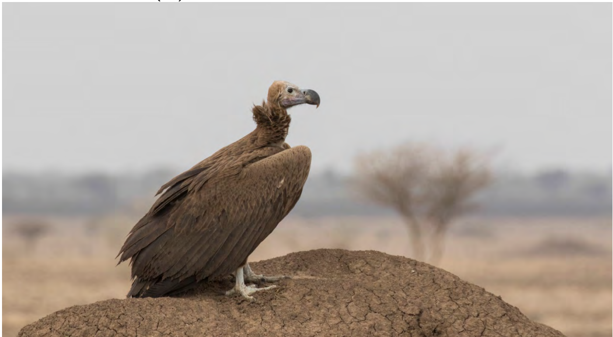
Lappet-faced Vulture, Aledoghi Plains (TC)

Lappet-faced Vulture Torgos tracheliotos 2 13/1, 1 rd 19/1, 2 Aledoghi Plains 21/1, 1 24/1, and 1 25/1.