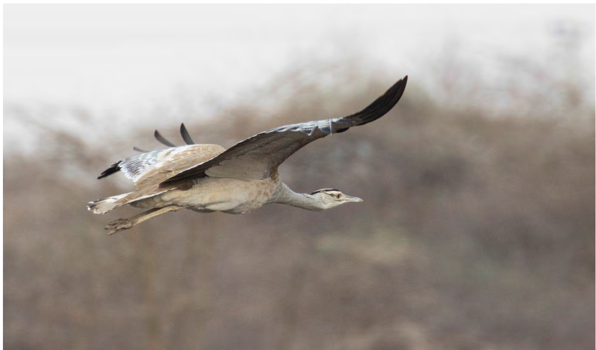
Arabian Bustard, Aledeghi Plains (TC)

Arabian Bustard Ardeotis arabs 3 Aledeghi Plains 21/1 and 1 Awash NP 22/1.