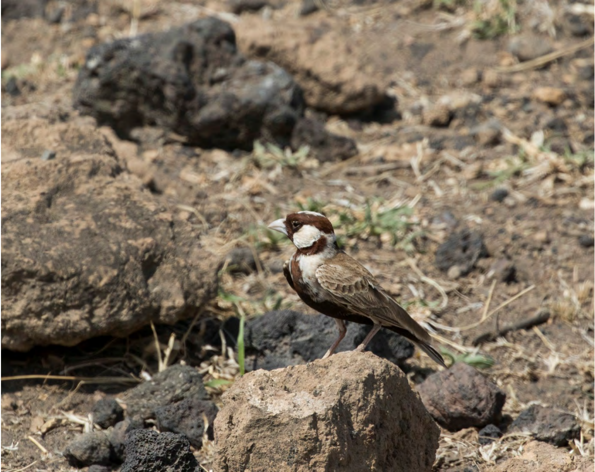
Chestnut-headed Sparrow-Lark (TC)