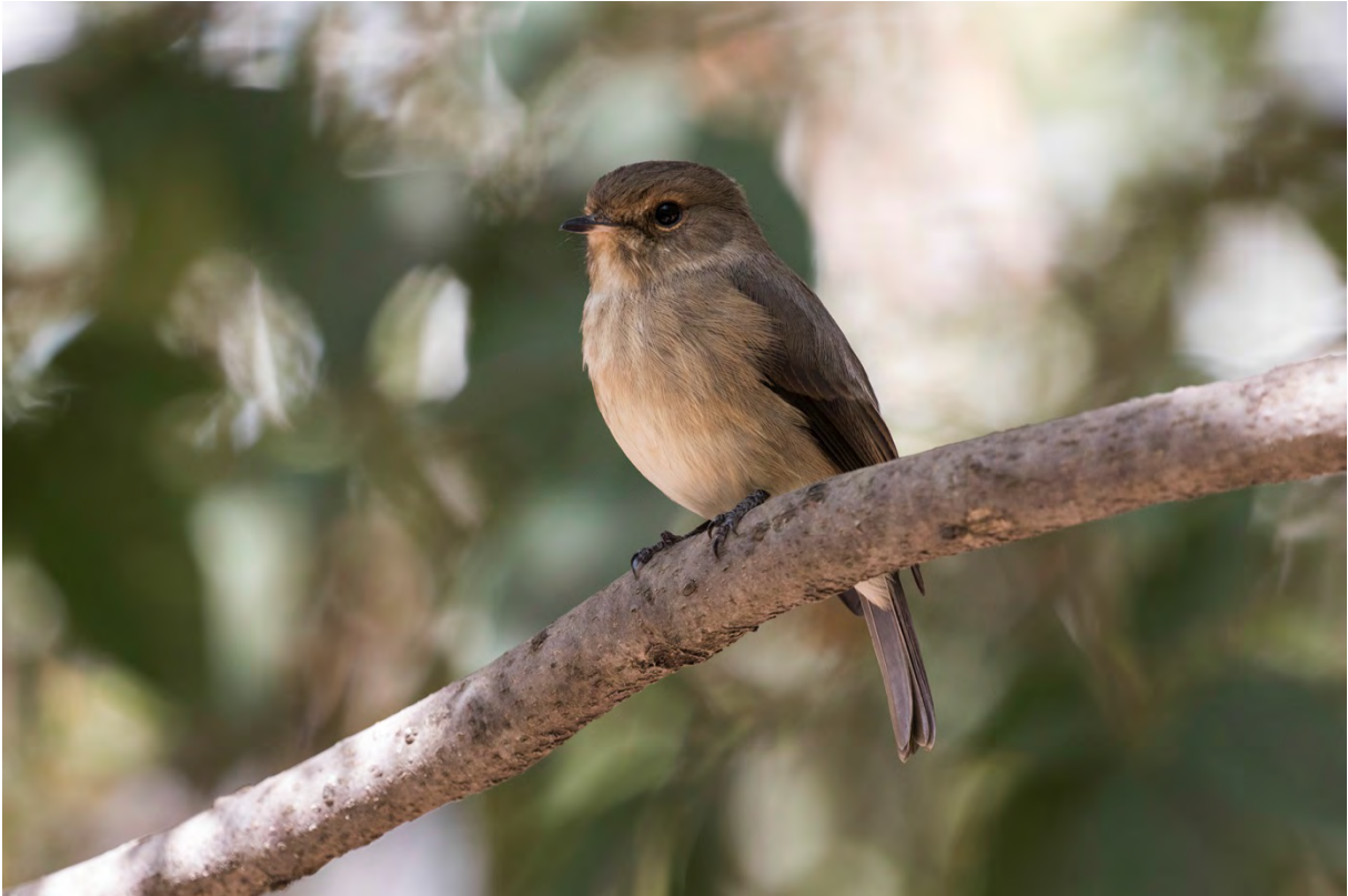
African Dusky Flycatcher (TC)

Spotted Palm Thrush Cichladusa guttata 1 11/1, 1 12/1, 4 13/1, and 4 14/1. ( intercalans )