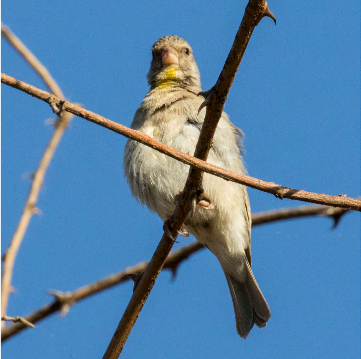
Yellow-throated Seedeater, a stunner and an real colour bomb...

Salvadori's Seedeater Crithagra xantholaema E. 7+2 Bobela Forest 14-15/1.