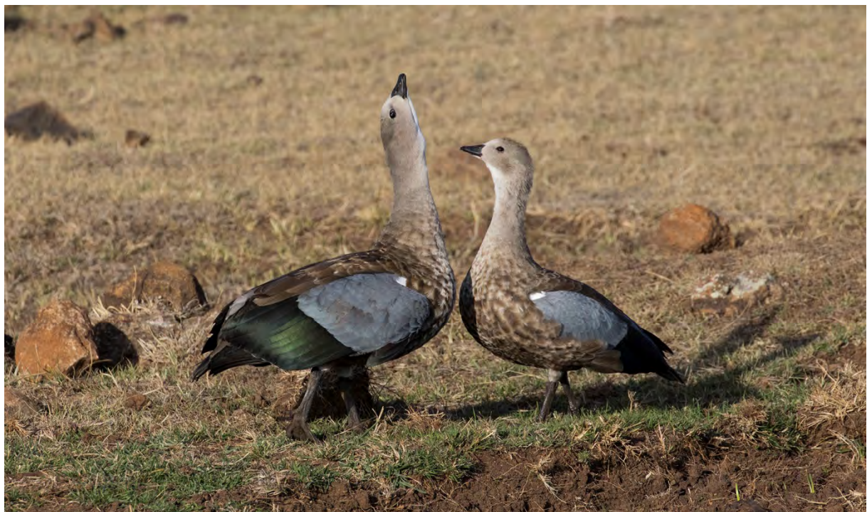
Blue-winged Goose (TC)

Blue-winged Goose Cyanochen cyanoptera E. Recorded on 5 dates in Ethiopian highland wetlands: c 80 Bale Mountains NP 17/1, 10 18/1, 1 19/1, 10 25/1, and 5 27/1.