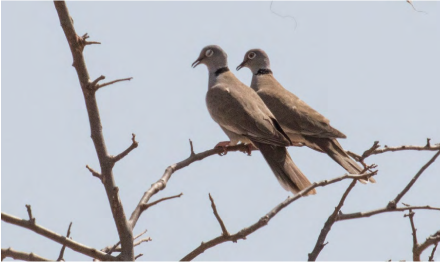
White-winged Collared Dove, Dawa village (TC)

Vinaceous Dove Streptopelia vinacea Up to 10 Jema Valley 25-26/1.