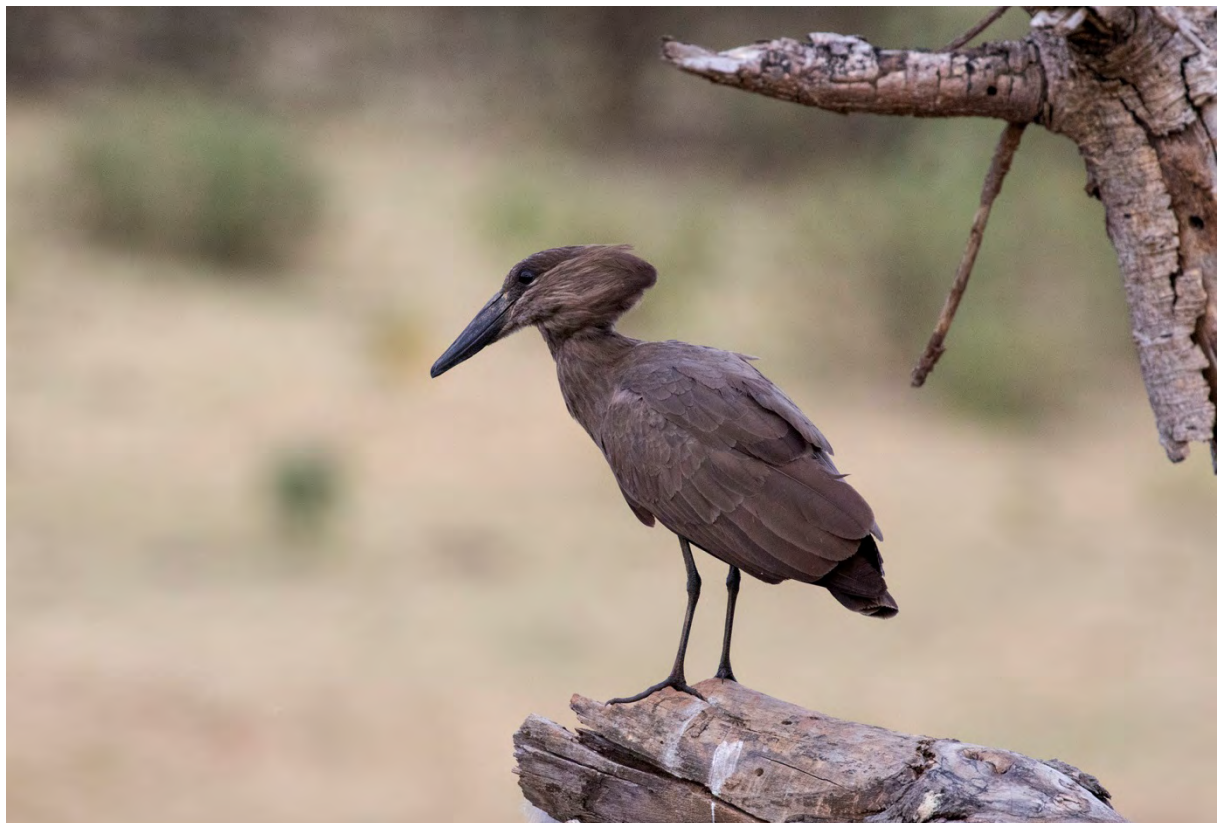
Hamerkop, Bobela Forest (TC)

Hamerkop Scopus umbretta c 100 recorded on 13 dates 7-27/1.