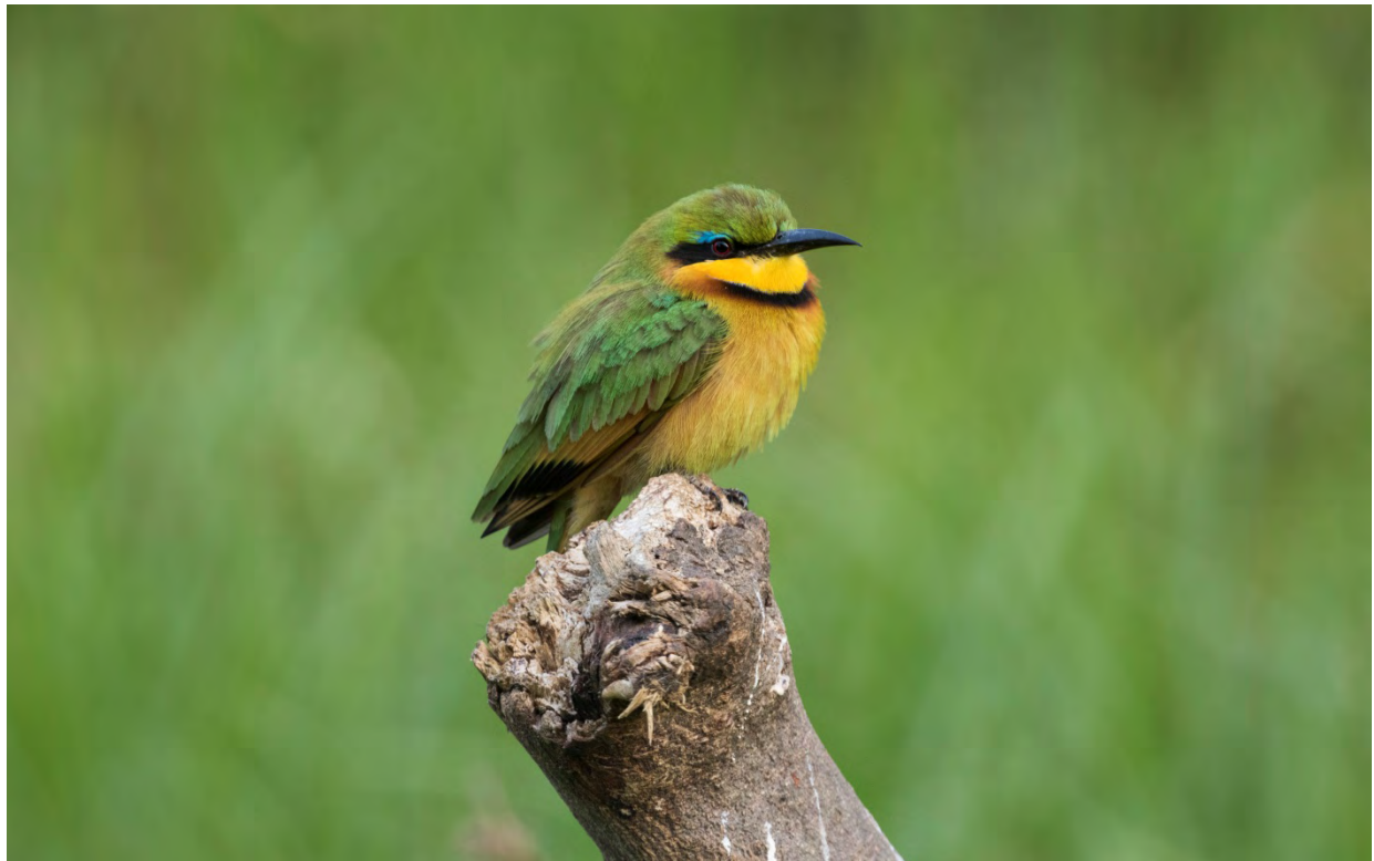
Little Bee-eater, Jema Valley (TC)

Black-billed Wood Hoopoe Phoeniculus somaliensis 46 recorded on 11 dates 7-26/1. ( neglectus )