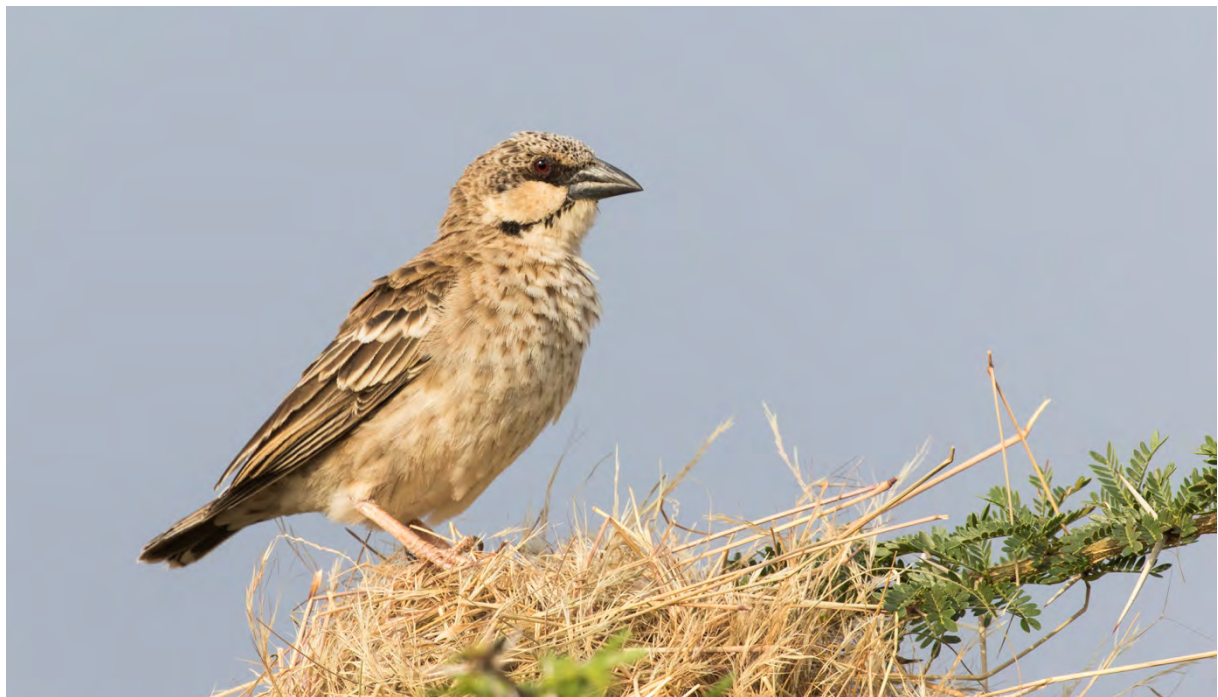
Donaldson Smith's Sparrow-Weaver

Bush Petronia Gymnoris dentata 5+5 Melka Ghebdu 23-24/1, 25 en route to Jema Valley 25/1, and fairly common in Jema Valley 26/1.