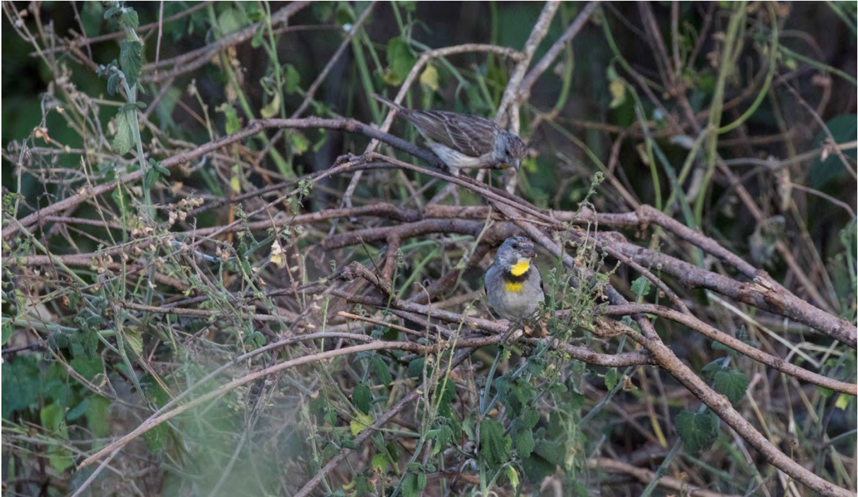
Salvadori's Seedeater, Bobela Forest

Northern Grosbeak-Canary Crithagra donaldsoni 3 rd, S Yabello 11/1.