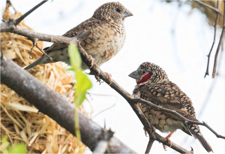
Female and male Cut-throat Finch (TC)