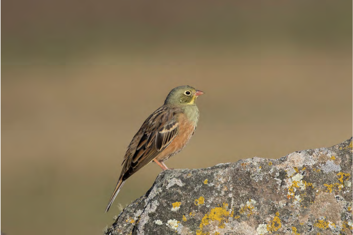
Ortolan Bunting, N Debre Birhan (TC)

Cinnamon-breasted Bunting Emberiza tahapisi 2 rd 8/1, 10 25/1, 20 Jema Valley 26/1, and 2 27/1. ( septemstriata )