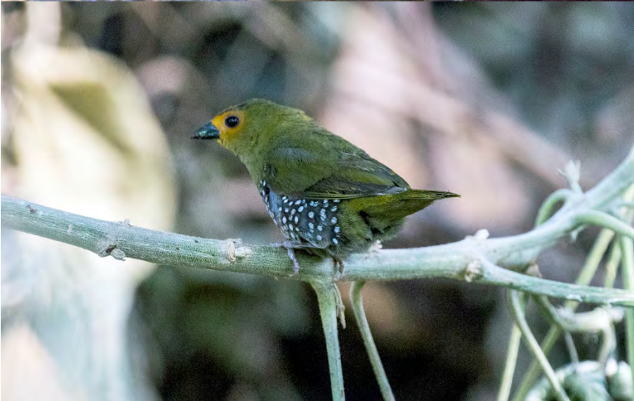
Green Twinspot, Wondo Genet, male and female (TC)