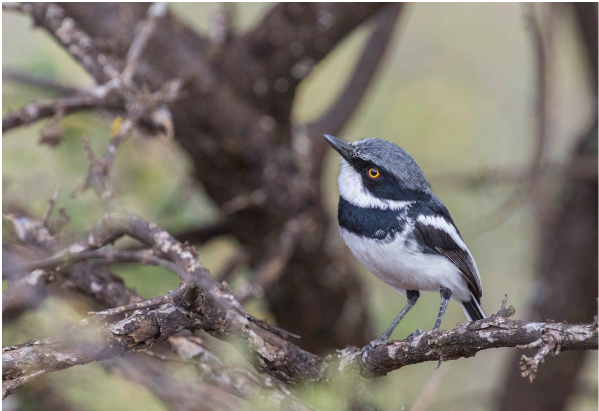
Pygmy Batis (TC)

Pygmy Batis Batis perkeo 4 rd 14/1, and 1 rd 15/1.