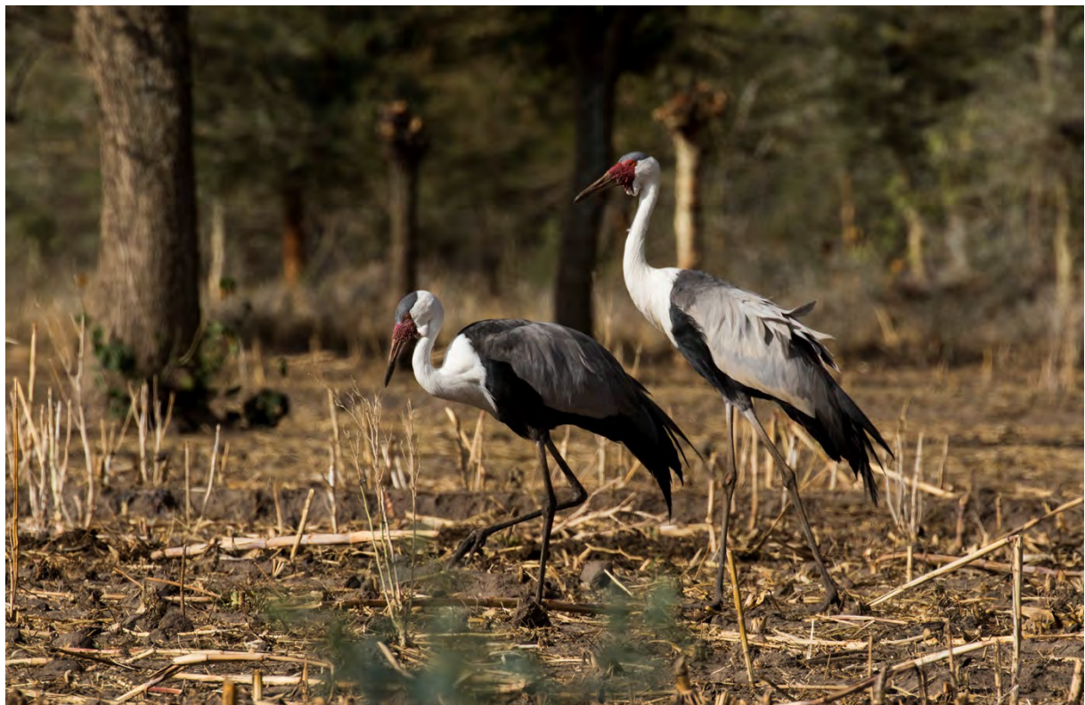
Wattled Crane, near Lake Boyo (TC)

Eurasian Stone-curlew Burhinus oediconemus 1 Lake Shalla 20/1, and 2 Awash NP 22/1.