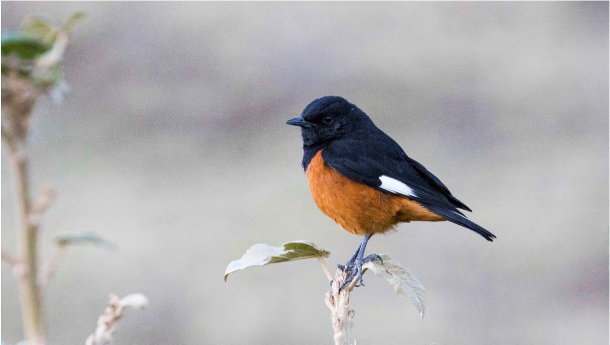
White-winged Cliff Chat, Jema Valley