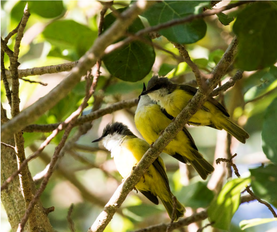
Green-backed Eremomela, Jema Valley (TC)

Eurasian Blackcap Sylvia atricapilla 5 Bishangari 8/1, 1 9/1, and 7 Harena Forest 16-17/1.