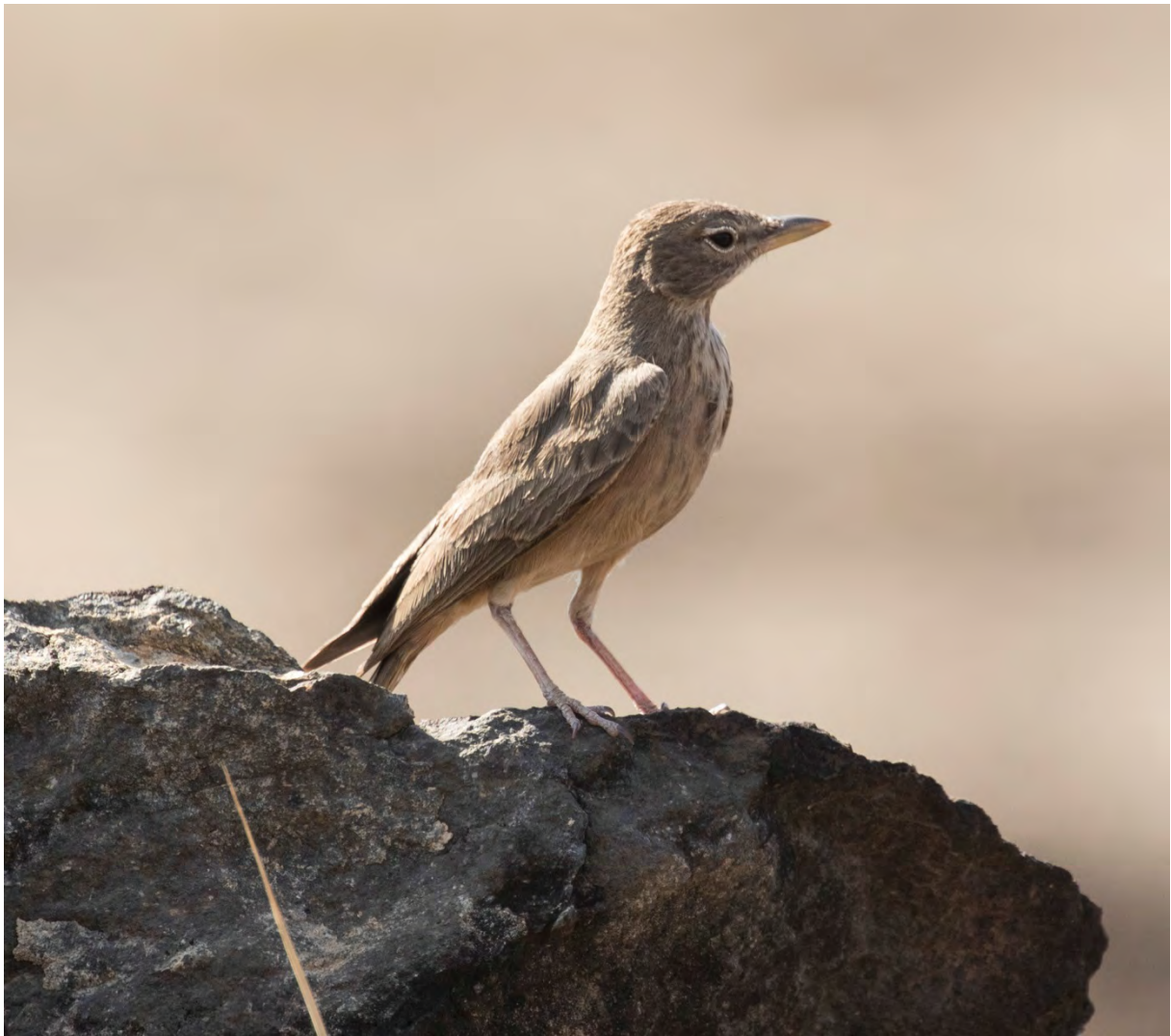
Desert Lark (TC)

Desert Lark Ammomanes deserti 2 rd 23/1. ( assabensis )