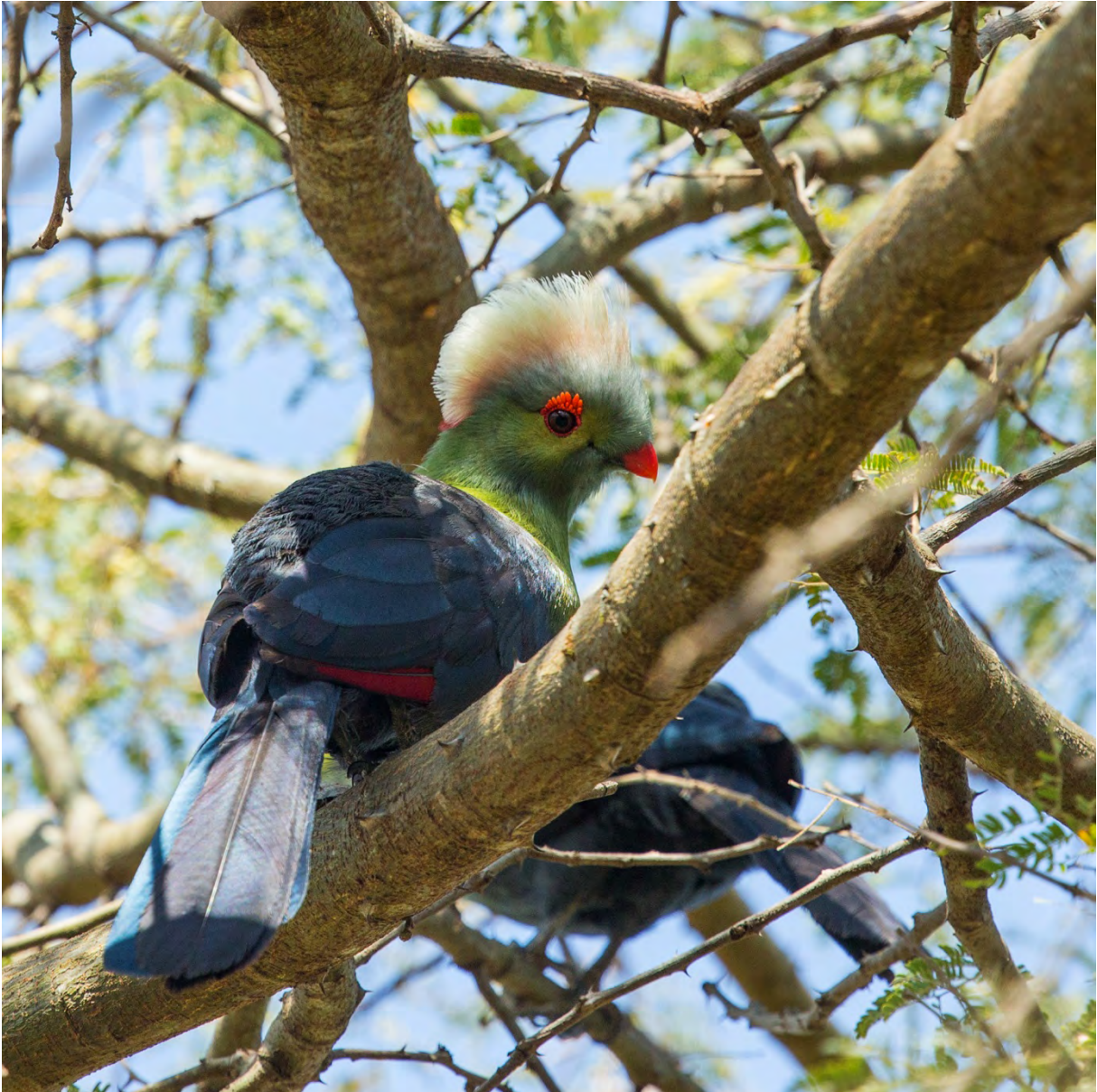
Ruspoli's Turaco (HP)

Klaas's Cuckoo Chrysococcyx klaas 4 Bishangari 7/1, 1 12/1, 1 13/1, and 1 HO 14/1.