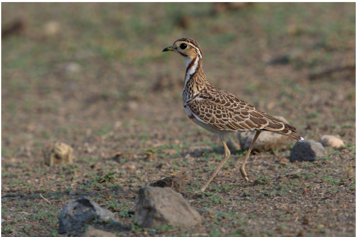
Three-banded Courser (HP)