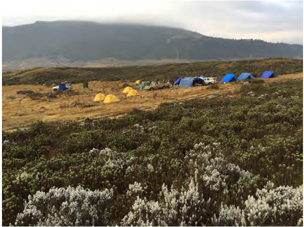
Sanetti Plateau, and our tent camp at Gaysay Valley, Bale Mts (TC)