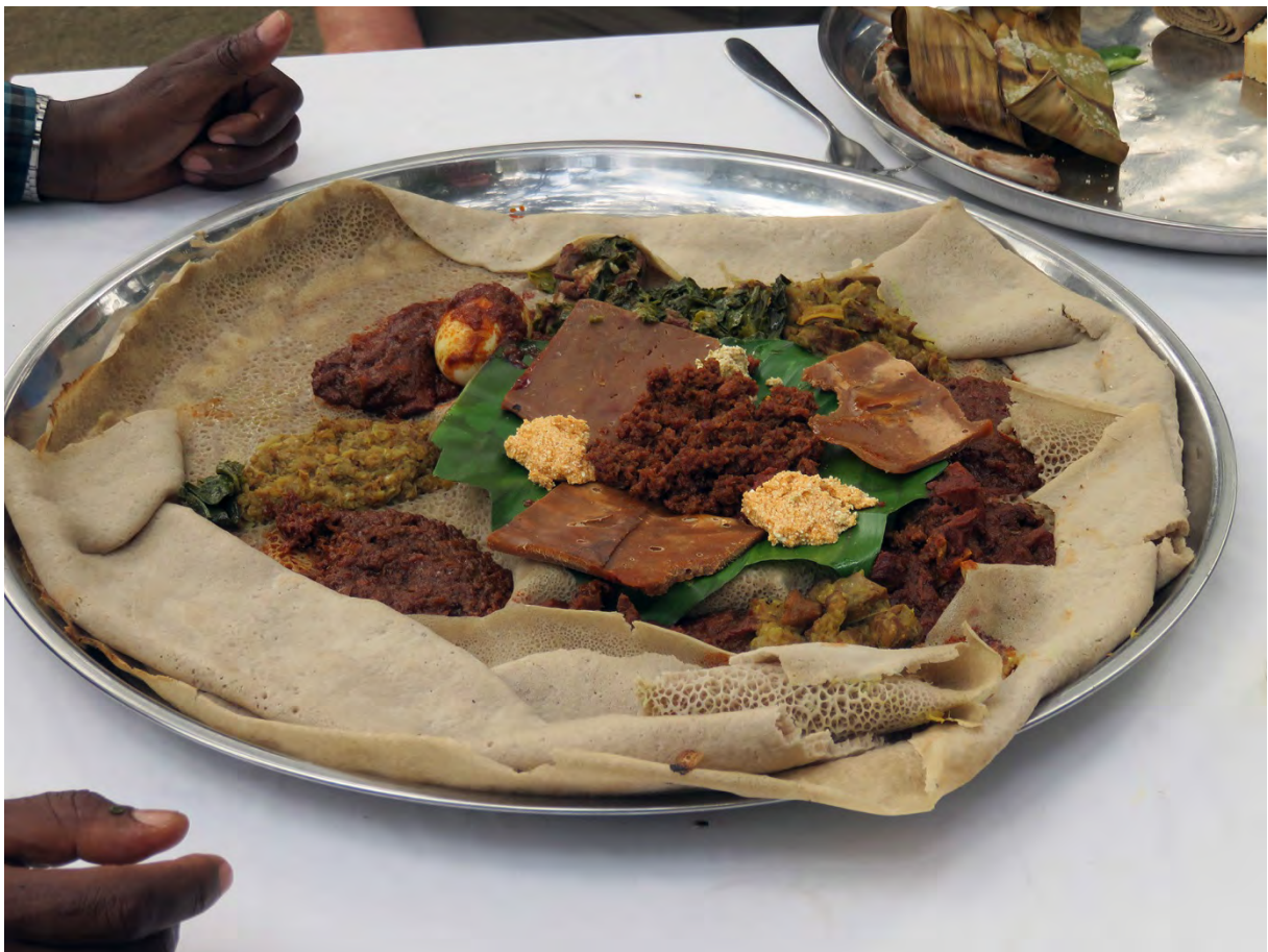
Ethiopian food – injera! Lunch at Sheshemene (RH)

Agama Lizard sp at least 2 different species seen, as well as some unidentified skinks (Scincidae)