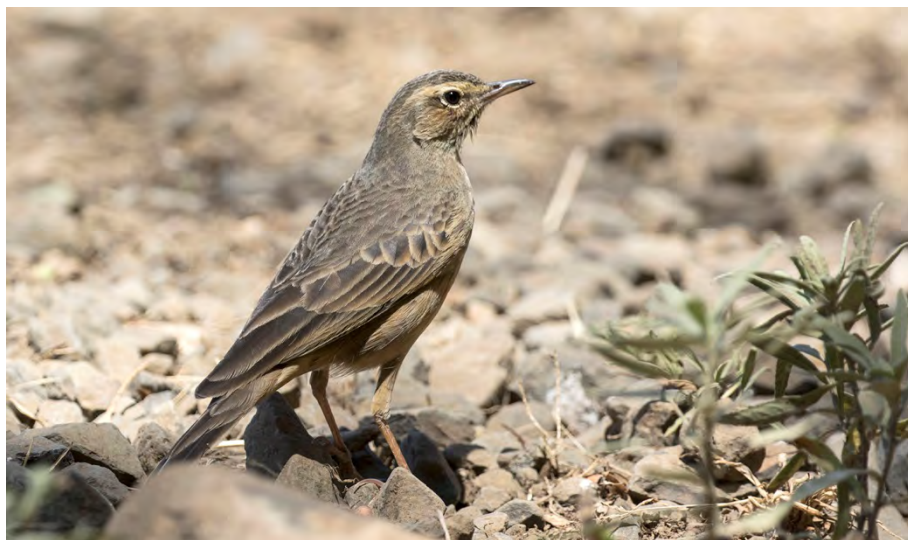
Long-billed Pipit, Jema Valley (TC)

Red-throated Pipit Anthus cervinus c 75 recorded on 8 dates 9-25/1, e.g. 30 Gaysay Valley, Bale Mts 18/1.