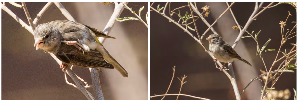
Yellow-rumped Seedeater, Jema Valley (TC)

Yellow-rumped Seedeater Crithagra xanthopygia 3+2 Jema Valley 25-26/1. Endemic to Ethiopia and Eritrea.