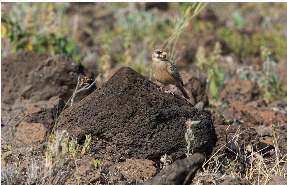
Masked Lark, Didkallo Plains (HP)

Masked Lark Spizocorys personata 7 seen well at Didkallo Plains 12/1. ( yavelloensis )