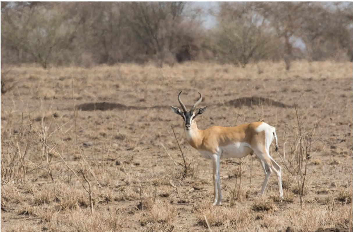
Soemmerring's Gazelle, Aledoghi Plains