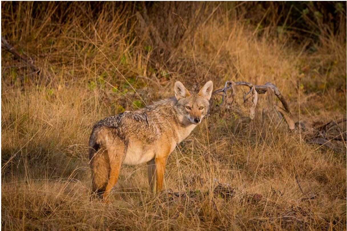
African Golden Wolf, Gaysay Valley, Bale Mts (HP)

African Golden Wolf Canis anthus 2+2 Gaysay Valley, Bale Mts 17-18/1, 2 Abiata-Shalla NP 19/1, and 1 Aledoghi Plains 21/1. According to new research this taxon differs from Golden Jackal Canis aureus (Koepli et al., 2015, Current Biology 25: 2158-2165).