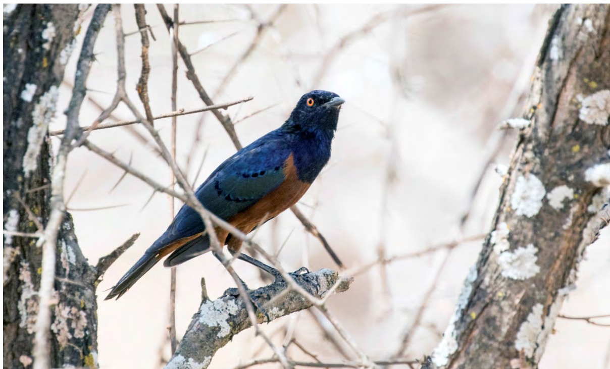
Shelley's Starling (TC)

Red-winged Starling Onychognathus morio 1 m Bishangari 7/1, 1 rd 9/1, 2 11/1, 5 13/1, 2 14/1, and 3 24/1. ( rueppellii )