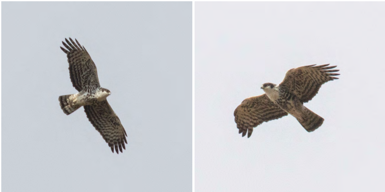
Ayre's Hawk-Eagle, Bobela Forest (TC)

Ayres's Hawk-Eagle Hieraaetus ayresii 2 Wondo Genet 8/1, and 1 ad Bobela Forest 15/1.