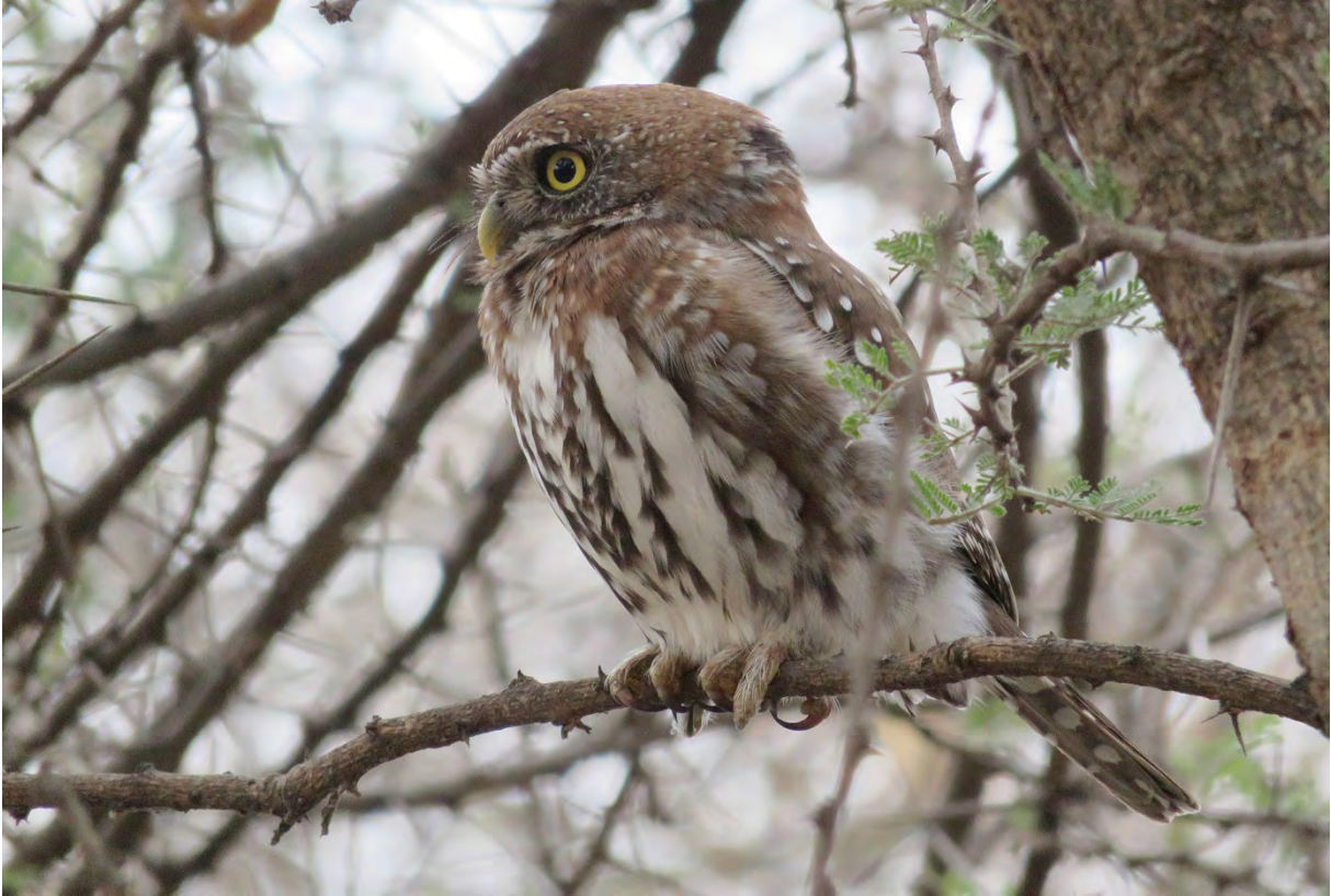
Pearl-spotted Owlet, Abiata-Shalla NP (RH)