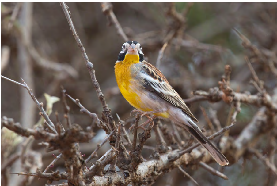
Somali Bunting (HP)

Somali Bunting Emberiza poliopleura 16 recorded on 7 dates 11-23/1.