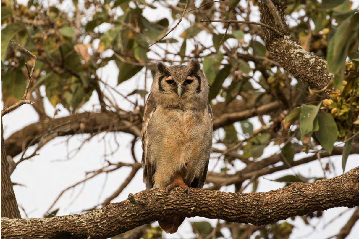
Verreaux's Eagle-Owl, Fonan Gofa (TC)

African Wood Owl Strix woodfordii Great views of a pair and both heard calling and seen when male delivering prey to female in the hotel area, Wondo Genet 8/1, and 1 HO 12/1. ( umbrina )