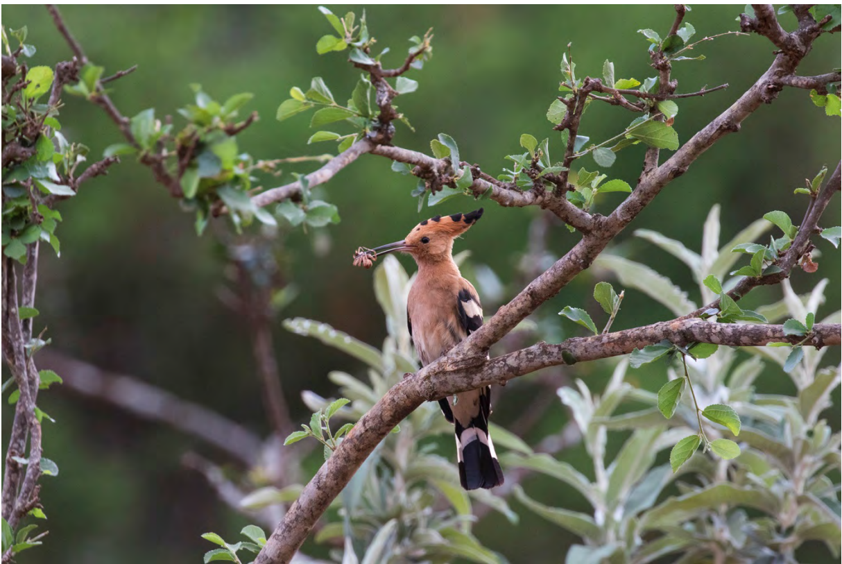
Eurasian Hoopoe, Fonan Gofa (TC)

Abyssinian Scimitarbill Rhinopomastus minor 1 12/1, 2 15/1, and 1 21/1. ( cabanisi in S Ethiopia, minor in the east)