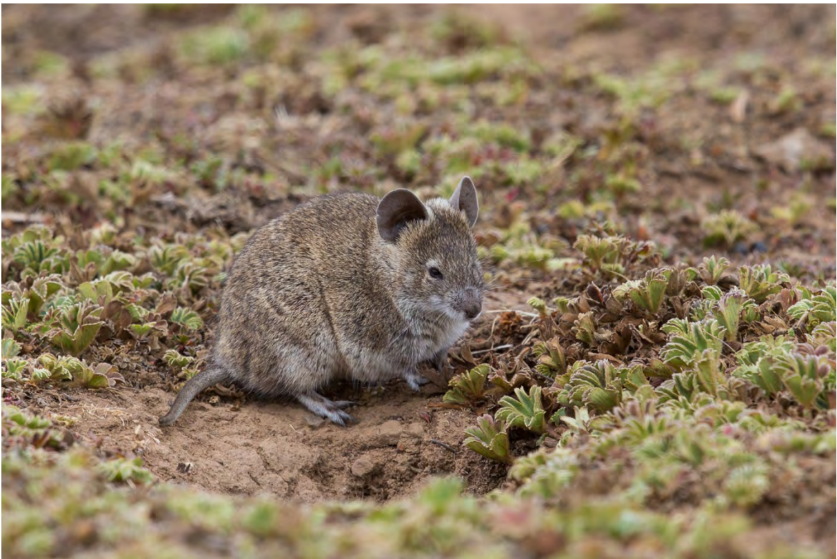
Black-clawed Brush-furred Rat, Sanetti Plateau, Bale Mts (HP)