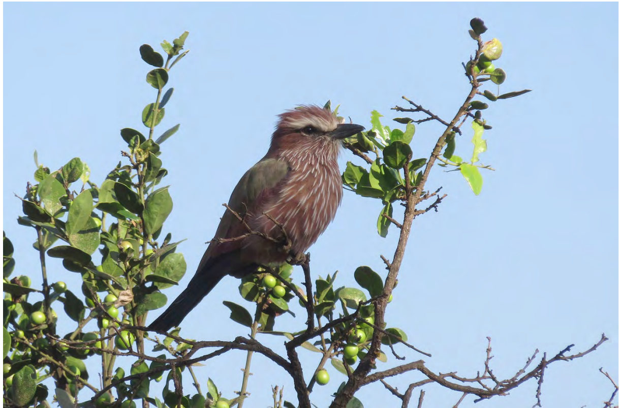
Purple Roller, Fonan Gofa (RH)

Purple Roller Coracias naevius 3 11/1, 1 Fonan Gofa 14/1, 2 15/1, 1 16/1, 1 23/1, and 2 26/1.