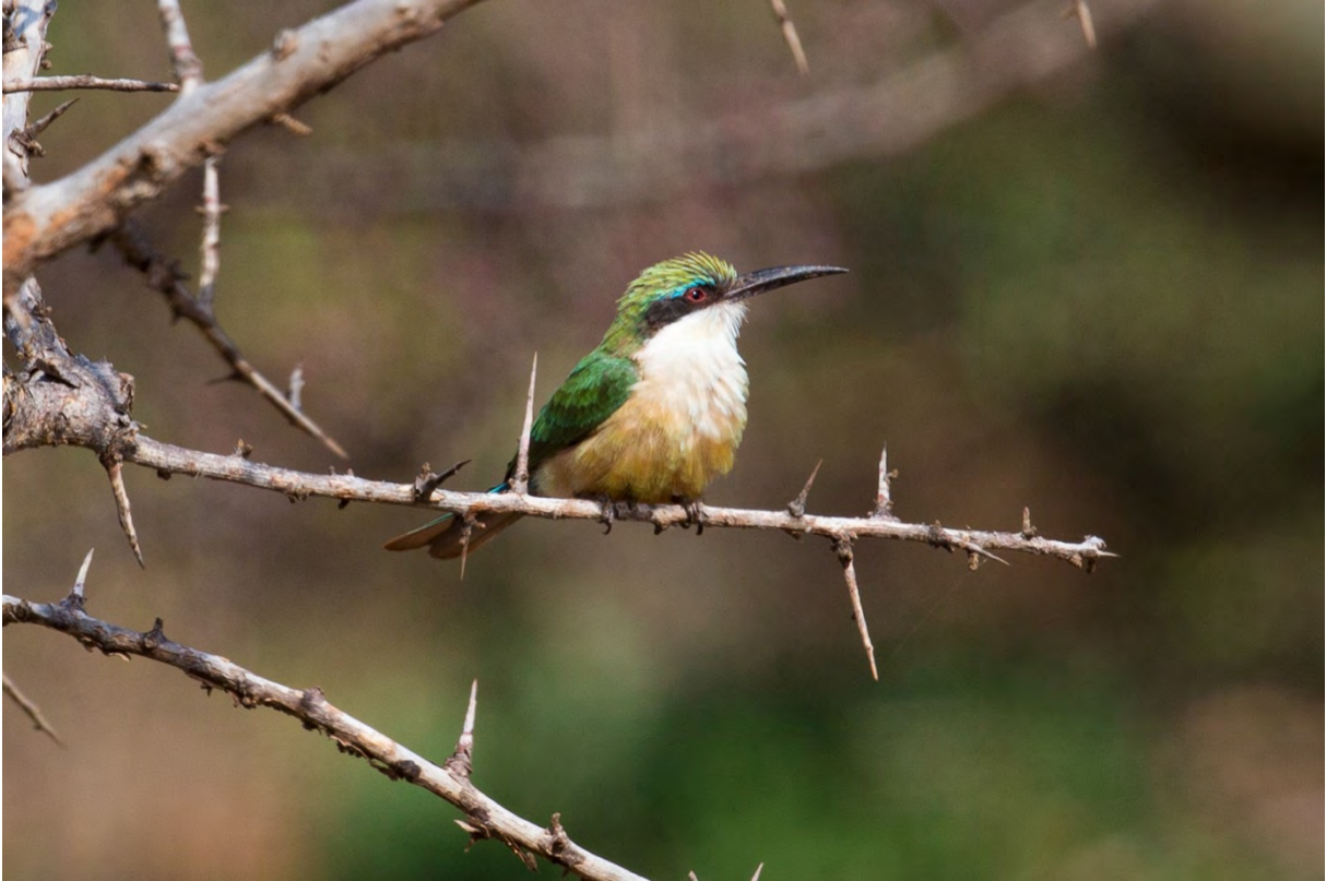
Somali Bee-eater, near Kenya border (HP)