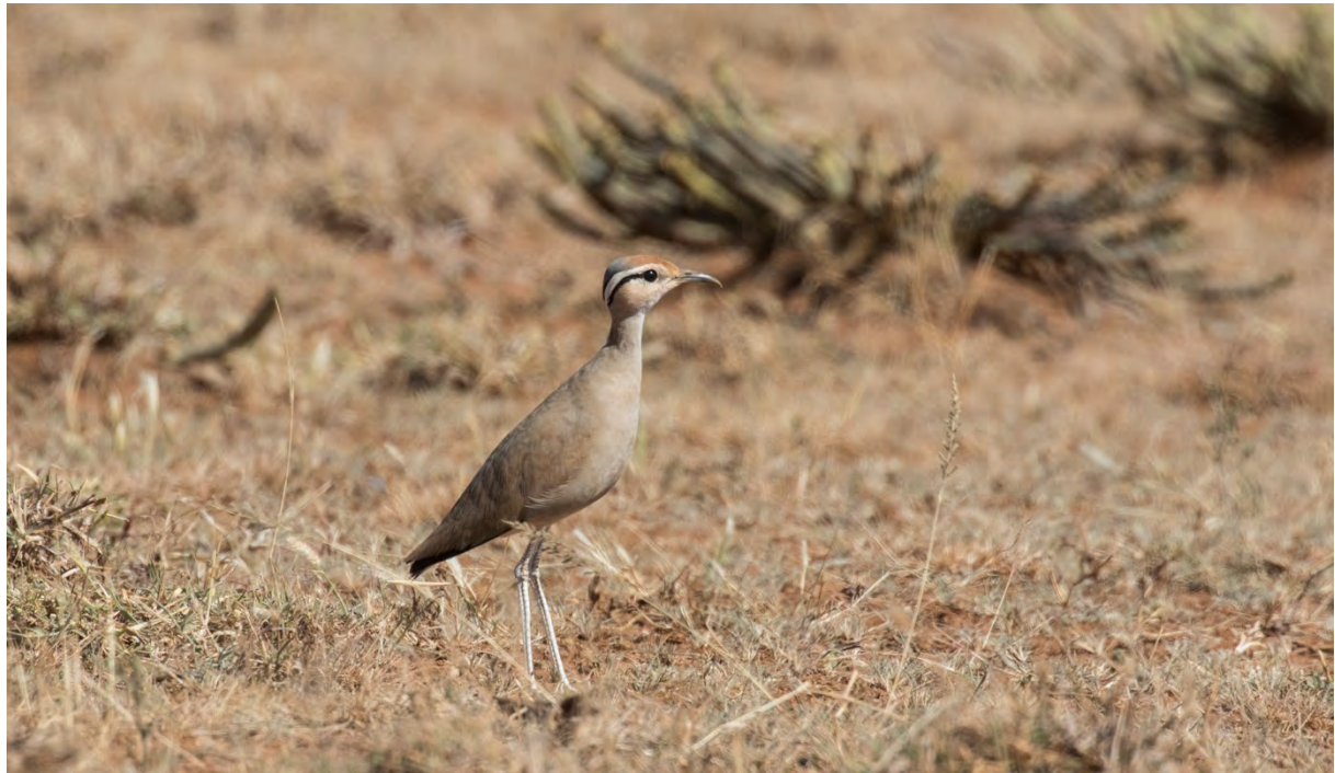
Somali Courser, Machaico Plains (TC)

Somali Courser Cursorius somalensis 3 Machaico Plains 13/1.