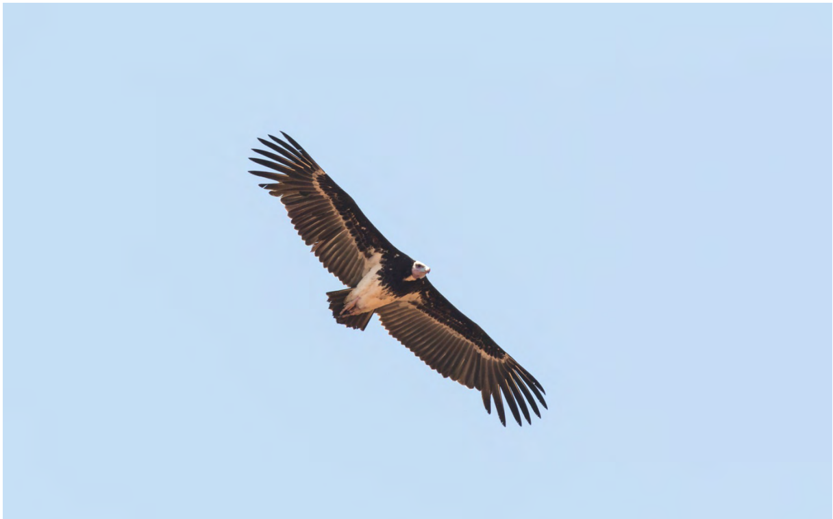
White-headed Vulture (TC)

White-headed Vulture Trigonoceps occipitalis 2 in village near Fonan Gofa 13/1 and 1 16/1.