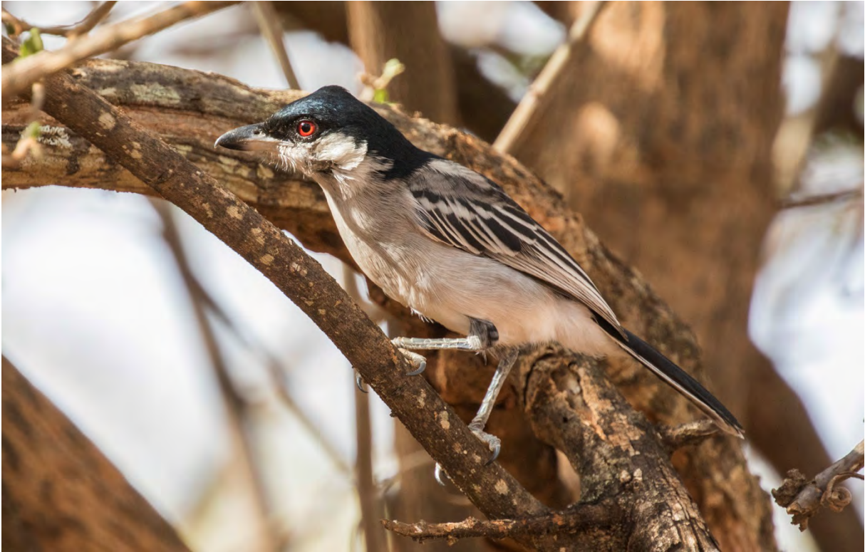
Pringle's Puffback (TC)