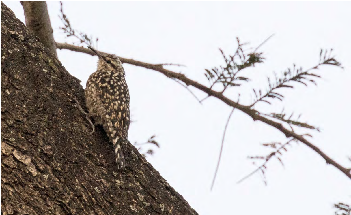
African Spotted Creeper, Wondo Genet (TC)

African Spotted Creeper Salpornis salvadori 2+1 Wondo Genet 8-9/1. ( erlangeri )