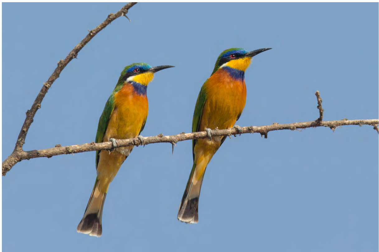
Blue-breasted Bee-eater, Bishangari (HP)