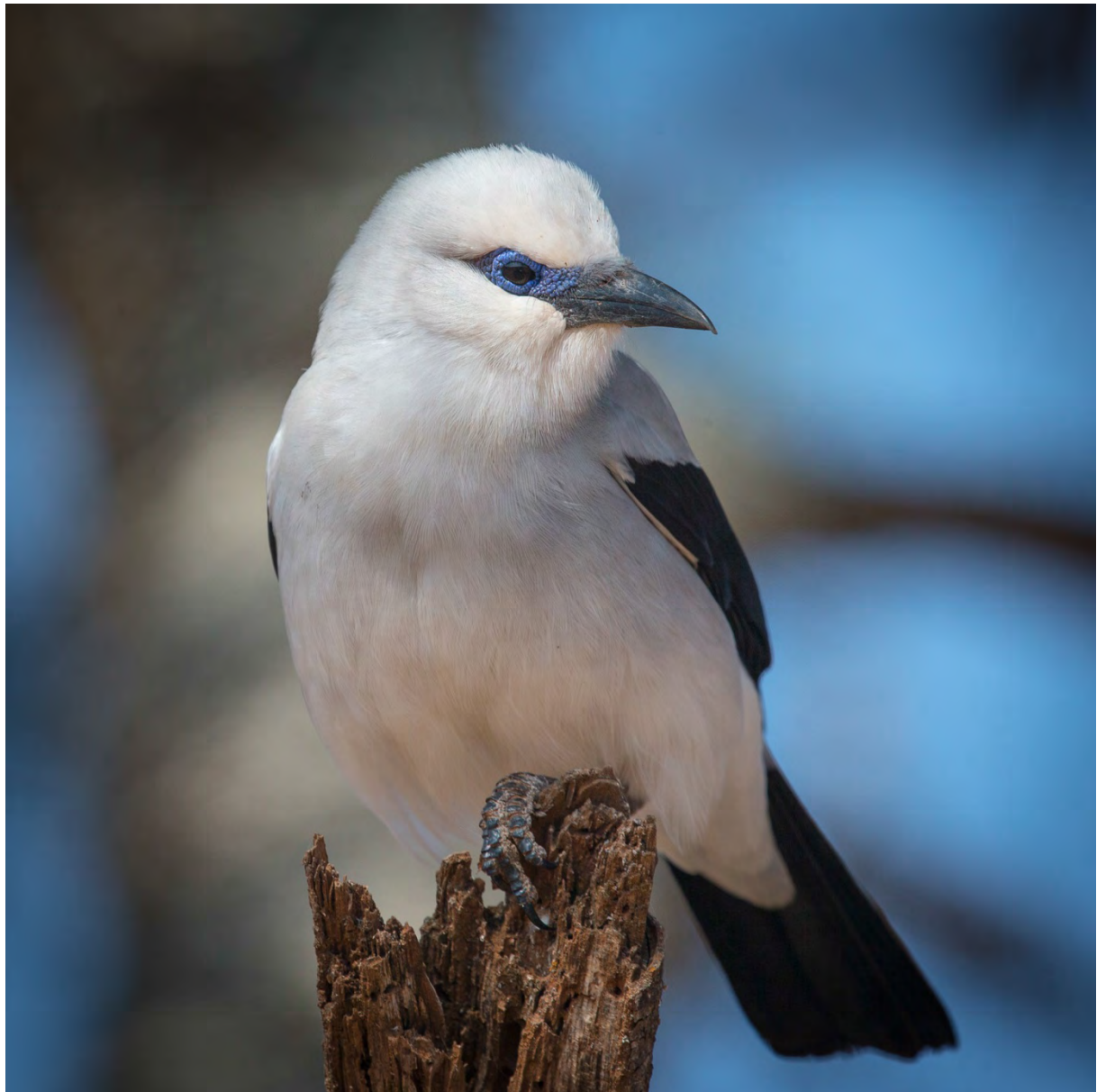
Stresemann's Bushcrow (HP)

Thick-billed Raven Corvus crassirostris 58 recorded on 7 dates 8-24/1, e.g. easily seen at restaurant in Sheshemene.