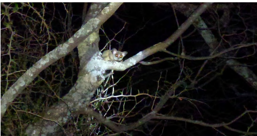
Northern Lesser Galago, Abiata-Shalla NP (SP)