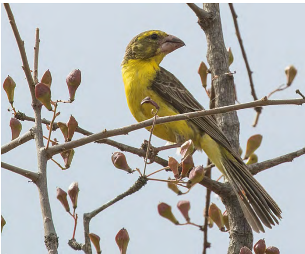
Northern Grosbeak-Canary (TC)

Northern Grosbeak-Canary Crithagra donaldsoni 3 rd, S Yabello 11/1.