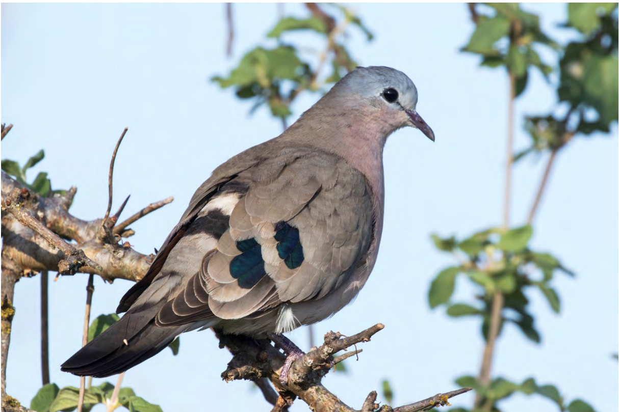
Emerald-spotted Wood Dove, Fonan Gofa (TC)

Emerald-spotted Wood Dove Turtur chalcospilos c 40 recorded on 11 dates, e.g. 10 10/1.