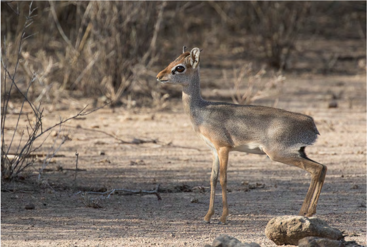
Salt's Dik-dik