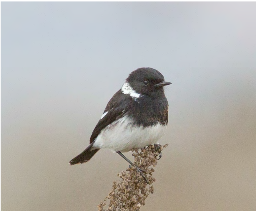
African Stonechat, Bale Mts (HP)

Mocking Cliff Chat Thamnolaea cinnamomeiventris 3 Lake Shalla 20/1, 1 Lonekoko 22/1, 2 23/1, 2 24/1, 8 25/1, and 12 Jema Valley 26/1. ( albiscapulata )