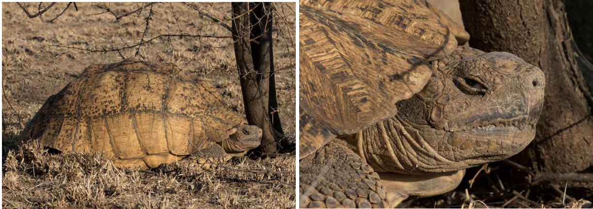
Leopard Tortoise, Awash NP (TC)

Leopard Tortoise Stigmochelys pardalis 2 Awash NP 22/1.