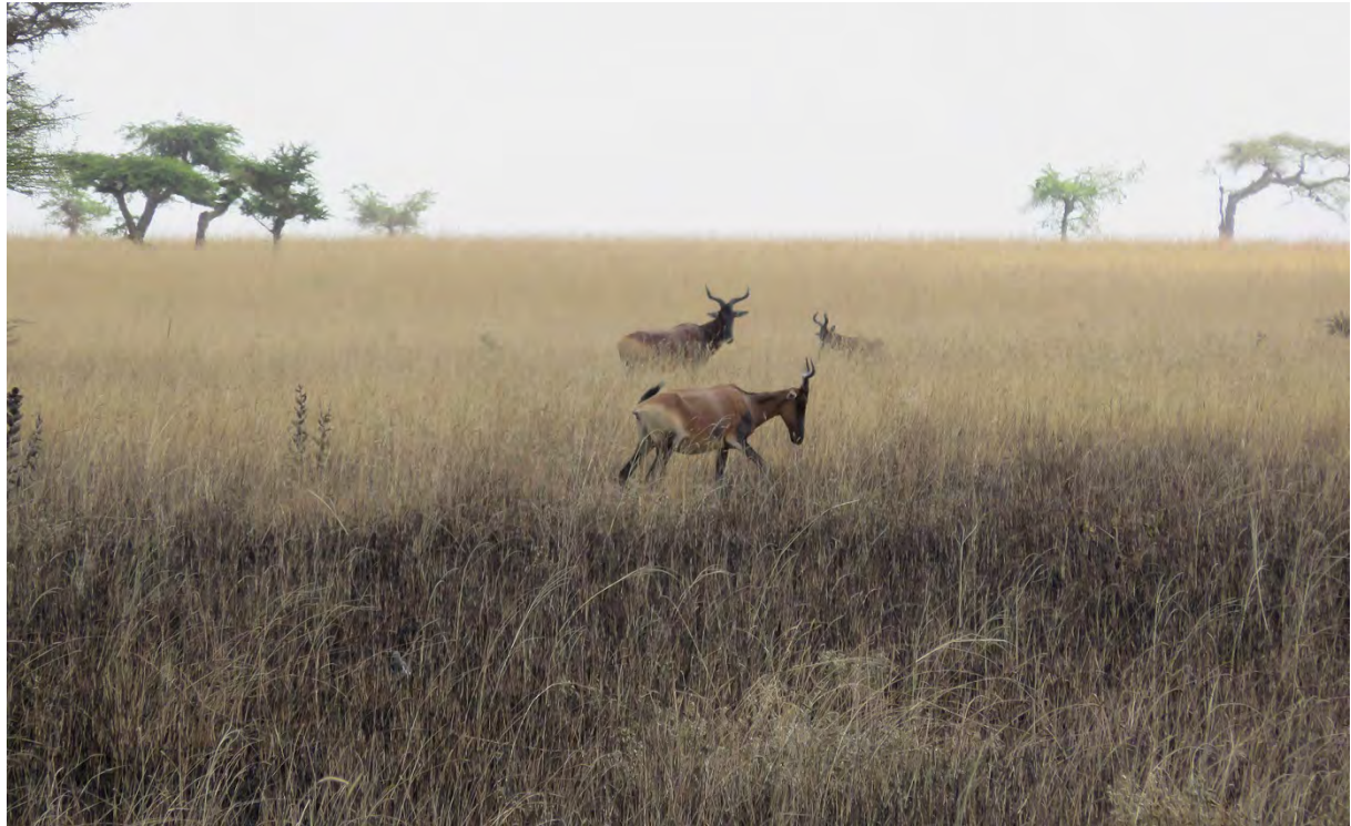
Swayne's Hartebeest, Senkele Wildlife Sanctuary (RH)

Swayne's Hartebeest Alcelaphus swaynei E. 33 Senkele Wildlife Sanctuary 9/1. Classified as Endangered on The IUCN Red List. The total population is estimated at only 600 individuals.