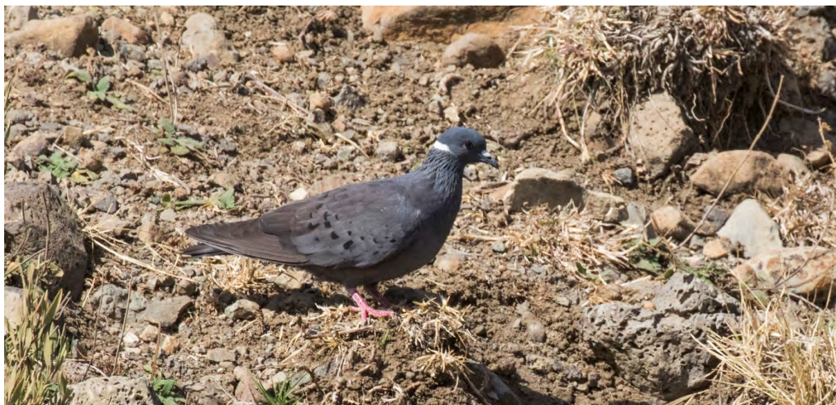
White-collared Pigeon (TC)

African Olive Pigeon Columba arquatrix 1 7/1, 2 Wondo Genet 8/1, 6 Lake Chamo 10/1, 2 15/1, 50 16/1, and 70 17/1.