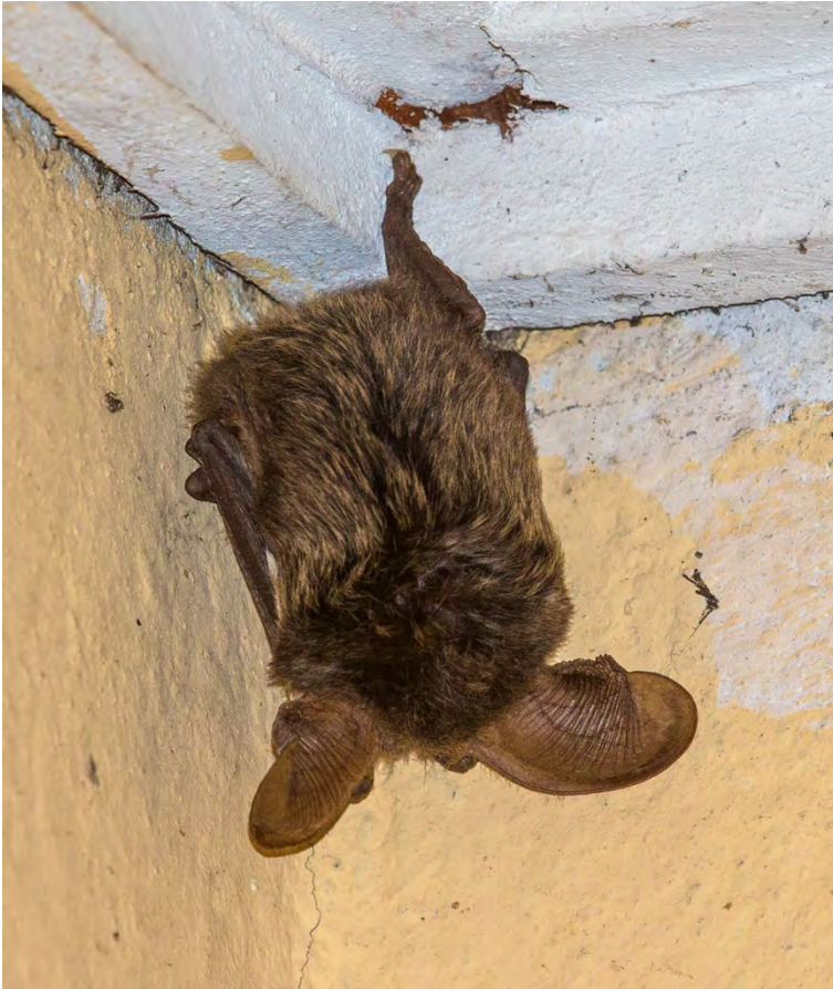
Ethiopian Big-eared Bat, Gaysay Valley, Bale Mts (HP)

Roundleaf Bat sp. Hipposideros sp. (probably Noack's Roundleaf Bat H. ruber ) c 12 in a house in Awash NP 22/1.