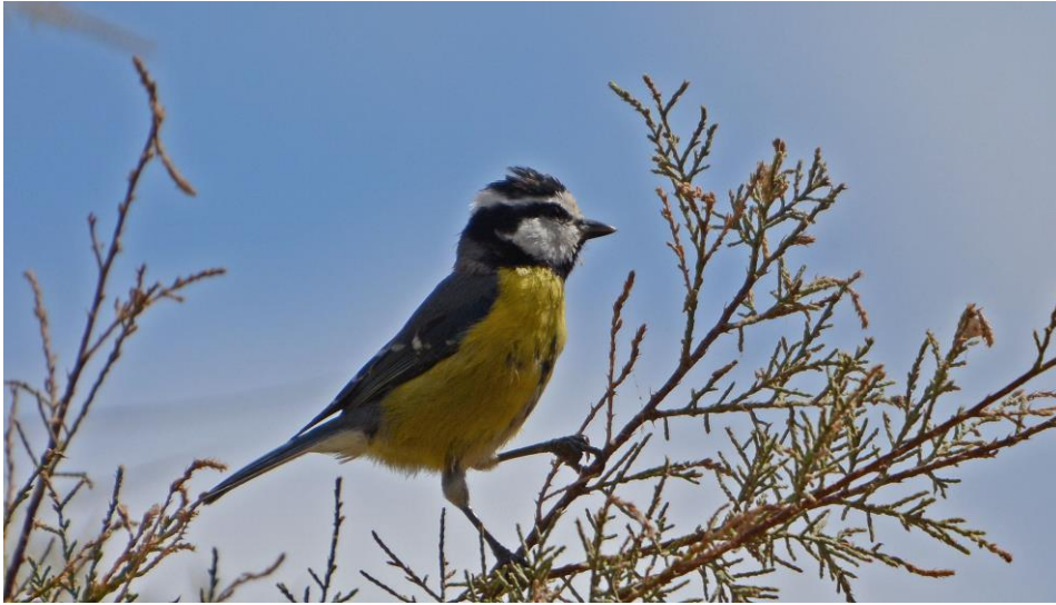
African Blue Tit