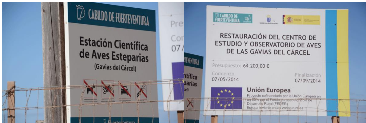
La Oliva – signs at the fence.

If coming from Tindaya take to the left in La Oliva towards El Cotillo (signed) and just where the village ends (signed) take a dirt road to the left. Easy noticed due to a short but steep uphill. This road goes downhill past a settlement and then goes uphill and on the top one will be met by a fenced off area. This is a huge Houbara habitat, nowadays fenced off for preservation and studies of this species. We did not bother to look carefully as we had either short of time (first evening) or already seen Houbara (second visit).