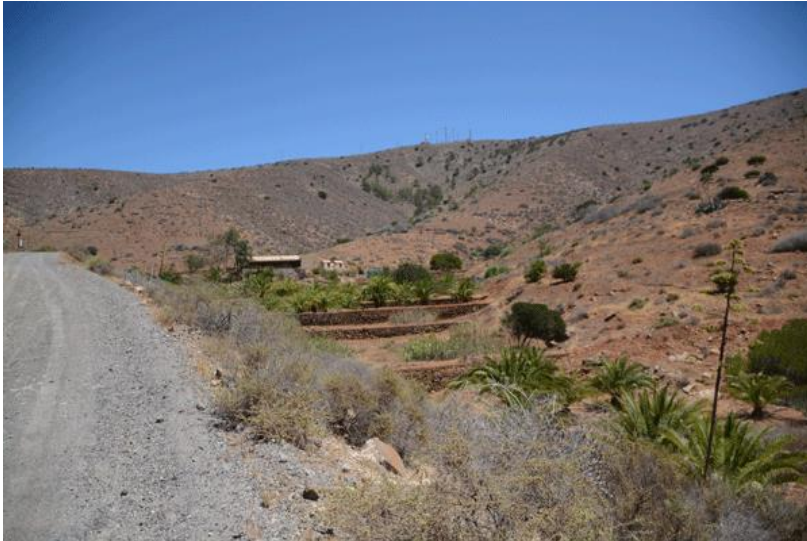
The dirt road up towards Parque Rural Parra Medina

walked the road uphill to find a few houses and some plantations in the "barranco". The area was quite bushy and seems to have a good potential in winter or at migration. Here we found a few Canaries, which was unexpected though this species should be absent on Fuerteventura according to the field guide. After some search on the internet showed that the canary is starting to spread on the island.