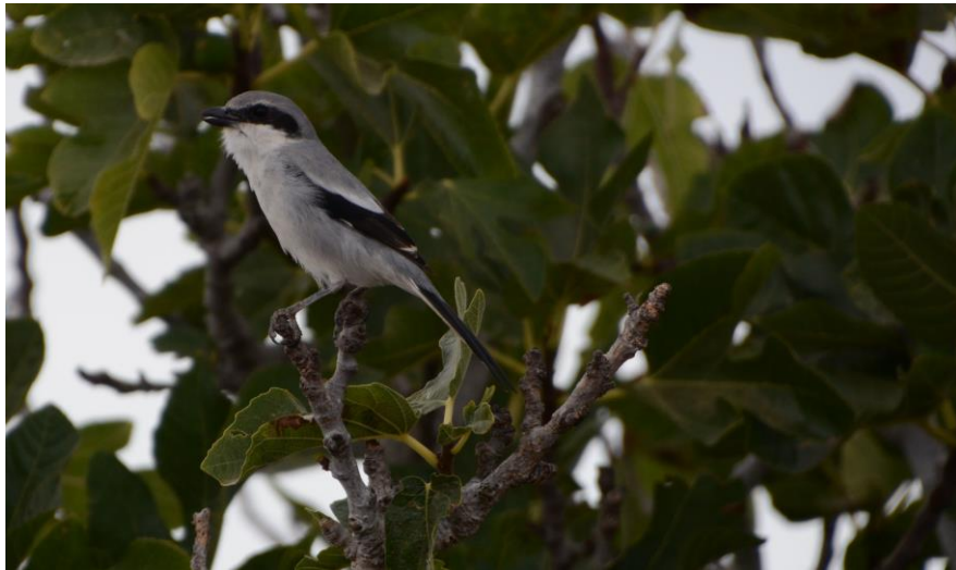
Great Grey Shrike of local race koenigi.