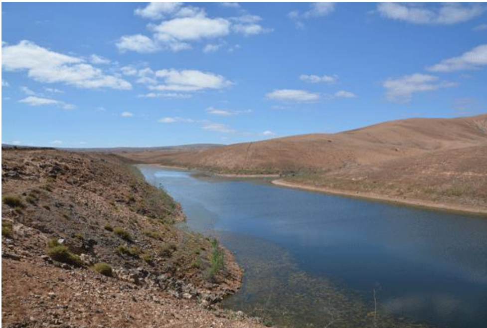
Los Molinos Dam

We followed the directions from the site guide and approached the dam from the northern end. The dirt road from the goat farm is really good so we drove all the way to ruin and parked. We scanned the dam and the only visible birds were Eurasian Coot, Ruddy Shelduck, Black-winged Stilt and one or two Gray Herons. After have used the scope a while some species of waders were added to the trip list. We also walked down in the barranco and found a number of passerines. Overhead a few Plain Swifts and flocks Black-bellied Sandgrouse were seen.