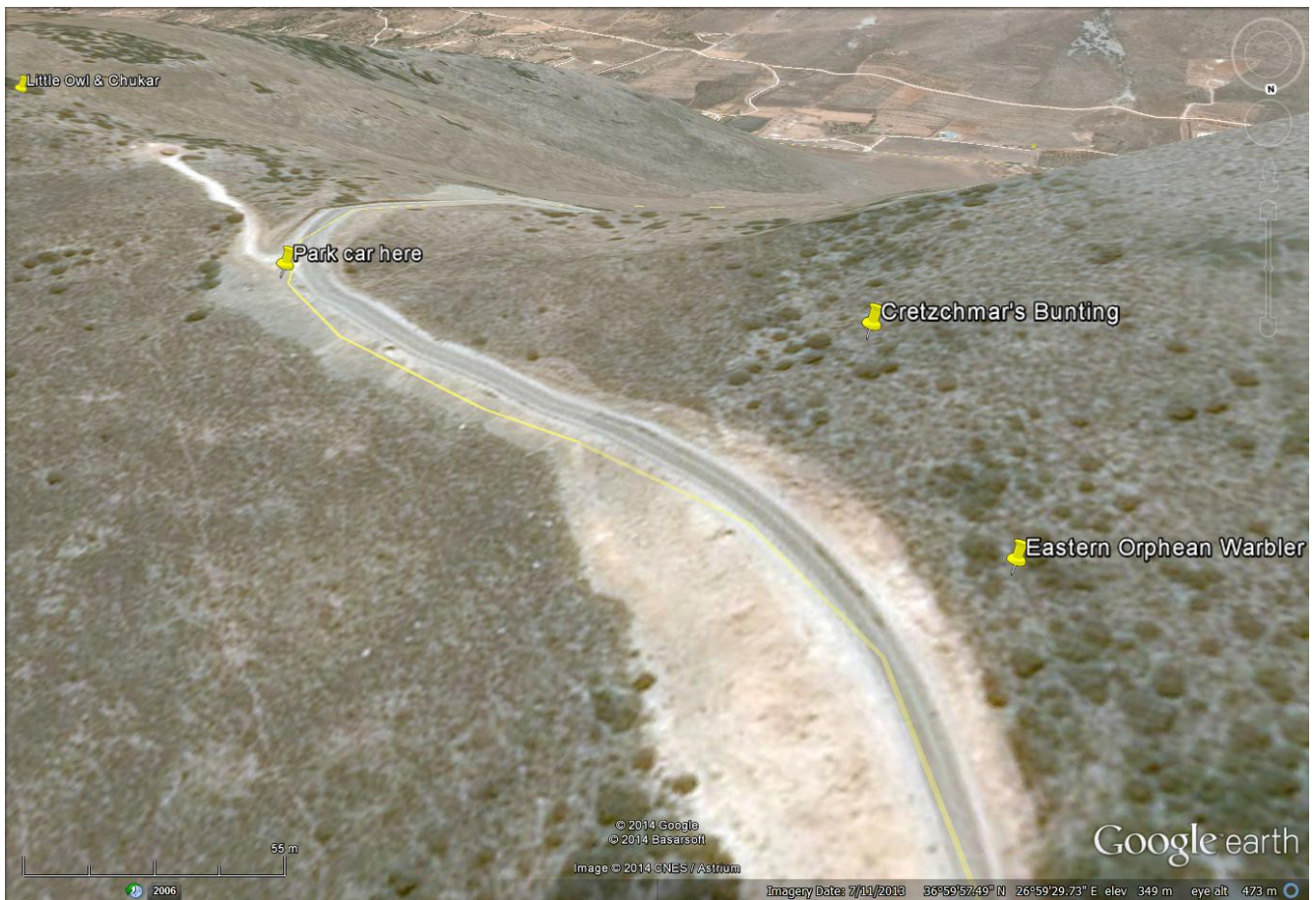
Google Earth, the high pass at Monde Rito seen from north.