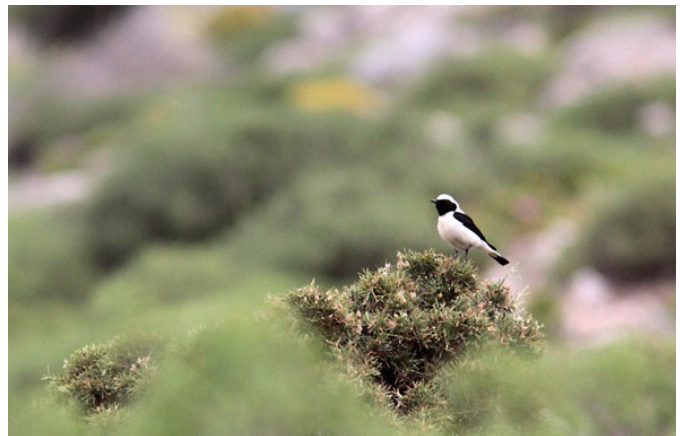
Black-eared Wheatear Oenanthe hispanica , uppermost part of Vathi valley. Many seen around the high pass at Monde Rito.