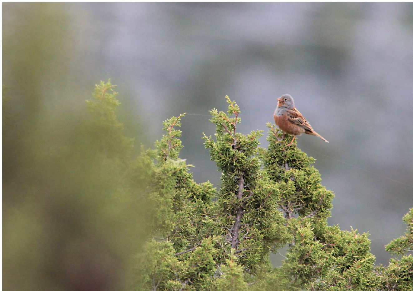
Cretzschmar's Bunting Emberiza caesia , male singing, close to the high pass at Monde Rito.