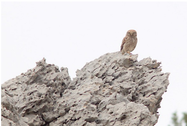
Little Owl Athene noctua , along the road east of Arginonda.