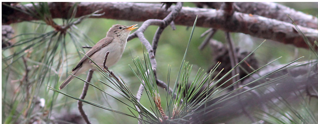
Eastern Olivaceous Warbler Iduna pallida , Monastery of Savas, S of Pothia.