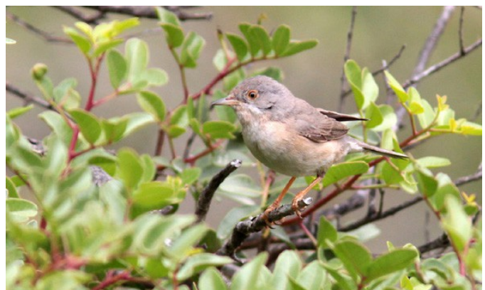
Female Subalpine Warbler Sylvia cantillans at Arginonda.