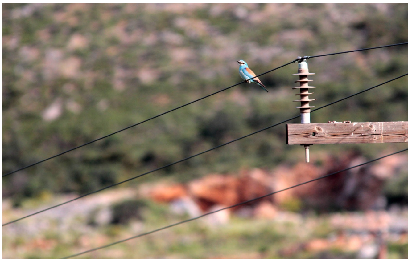
A beautiful migratory European Roller Coracias garrulus at upper Vathis valley.