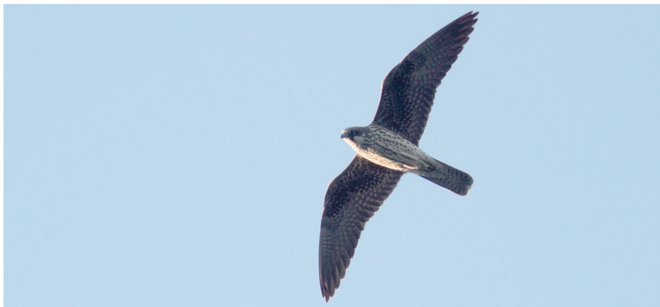
Eleonora's Falcon Falco eleonorae, not often depicted 2cy, possibly dark phase (quite dark underwing coverts). Rather untypically inconspicuous dark trailing edge to the wing on this individual. Monastery of Fotis, SW of Kandouni.

Generally birding was quite tough with few birds and few species. The timing should be perfect though with all breeding birds probably on site (Olive-tree Warbler?) and the possibility of migrants. After a week I felt like there was hard to pick up any new birds, at least resident ones. I reckon Cretzschmar's Bunting, Eastern Orphean Warbler and Great Spotted Cuckoo to be my best findings since they might represent breeding birds. It was easy to drive around the island, traffic was sparse on the northern parts of the island, good maps were available at many places I found one (1:25,000) for outdoor activities with nice topography and marked paths.