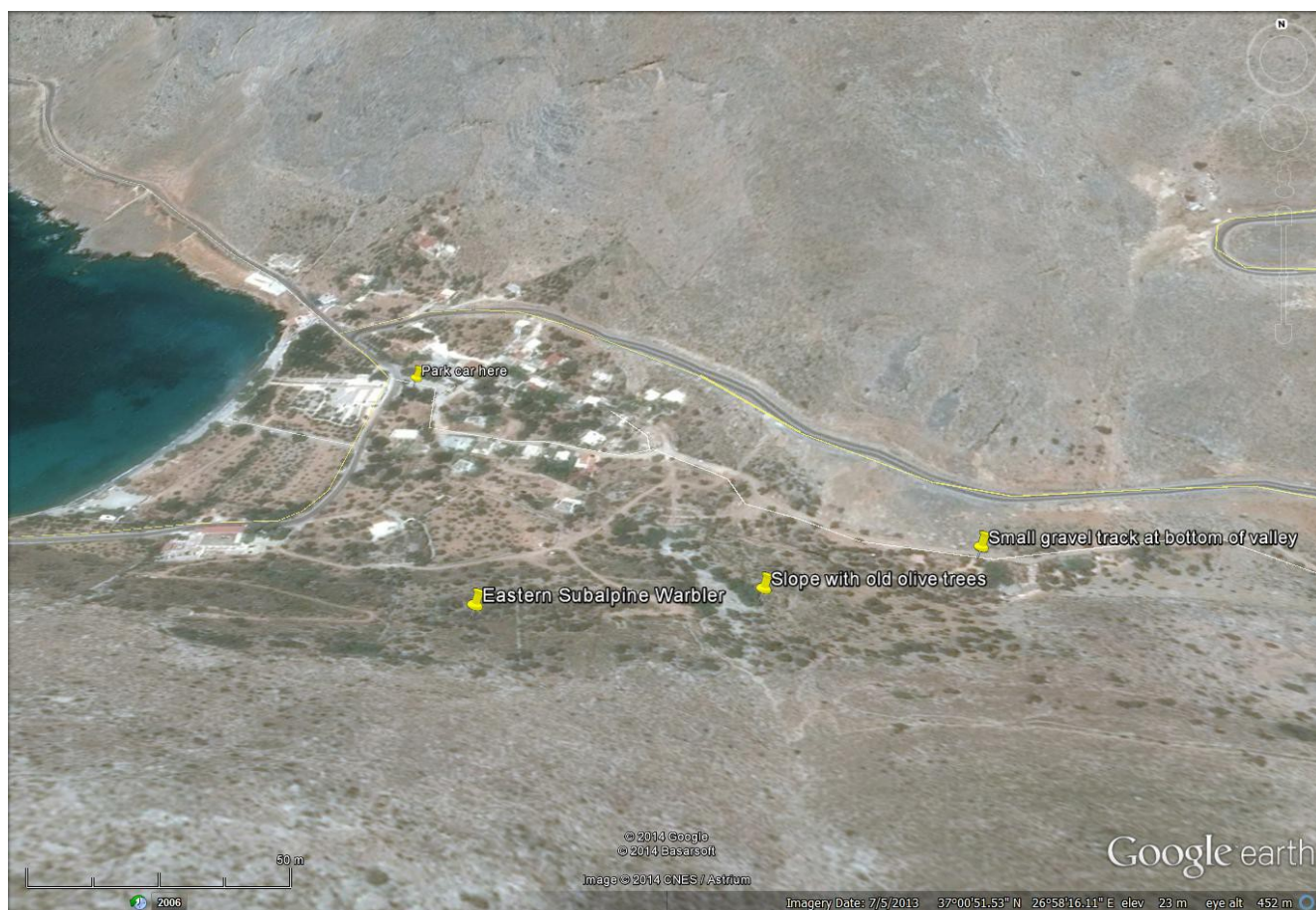
Arginonda with the valley going east. Lots of old large olive-trees on the southern slopes. Seen from south.