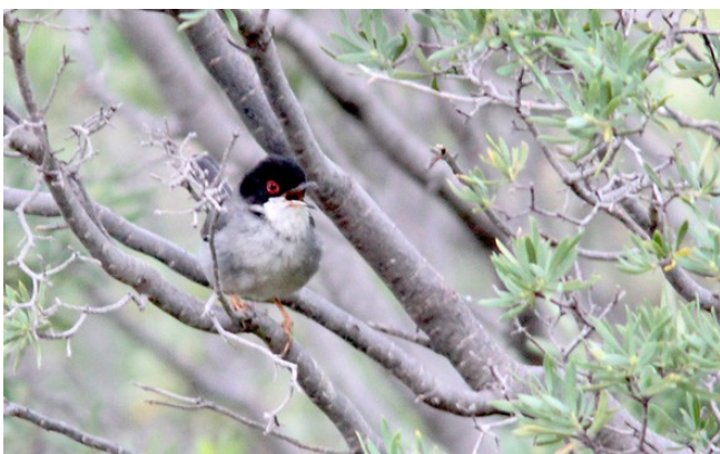
Sardinian Warbler Sylvia melanocephala , a calling bird at upper Vathis valley.