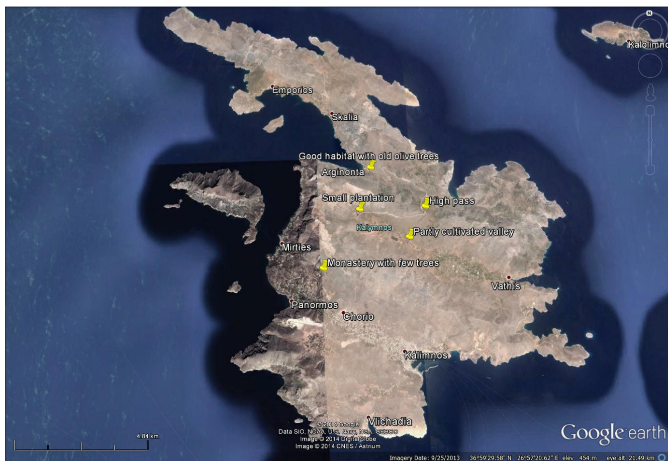
Overview from Google Earth, with some key sites marked. The barren impression is quite accurate.