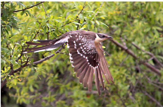
Great Spotted Cuckoo Clamator glandarius, nice views of a pair in Vathi valley.