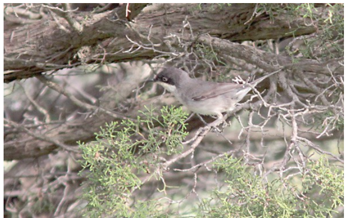
Eastern Orphean Warbler Sylvia crassirostris, harshly calling in bushes at Monde Rito.