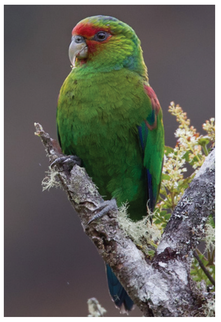
Red-faced Parrot. Another scarce near-endemic inhibiting mountains on the slightly drier interandean valley slopes of southern Ecuador

2 seen at La Union and 1 seen at Salinas, 1 pair with a just about fledged chick at Ayampe