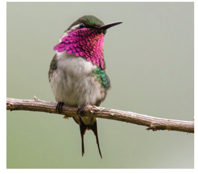
Male Esmeraldas Woodstar. This tiny hummingbird is endemic to the coast of Ecuador. It is seasonal here at Ayampe, coming during the wet season to breed. Non-breeding where-abouts is poorly known but it seems like they move higher up into the foothills with a few records in the Mindo-Tandayapa area.

Amethyst Woodstar Calliphlox amethystina