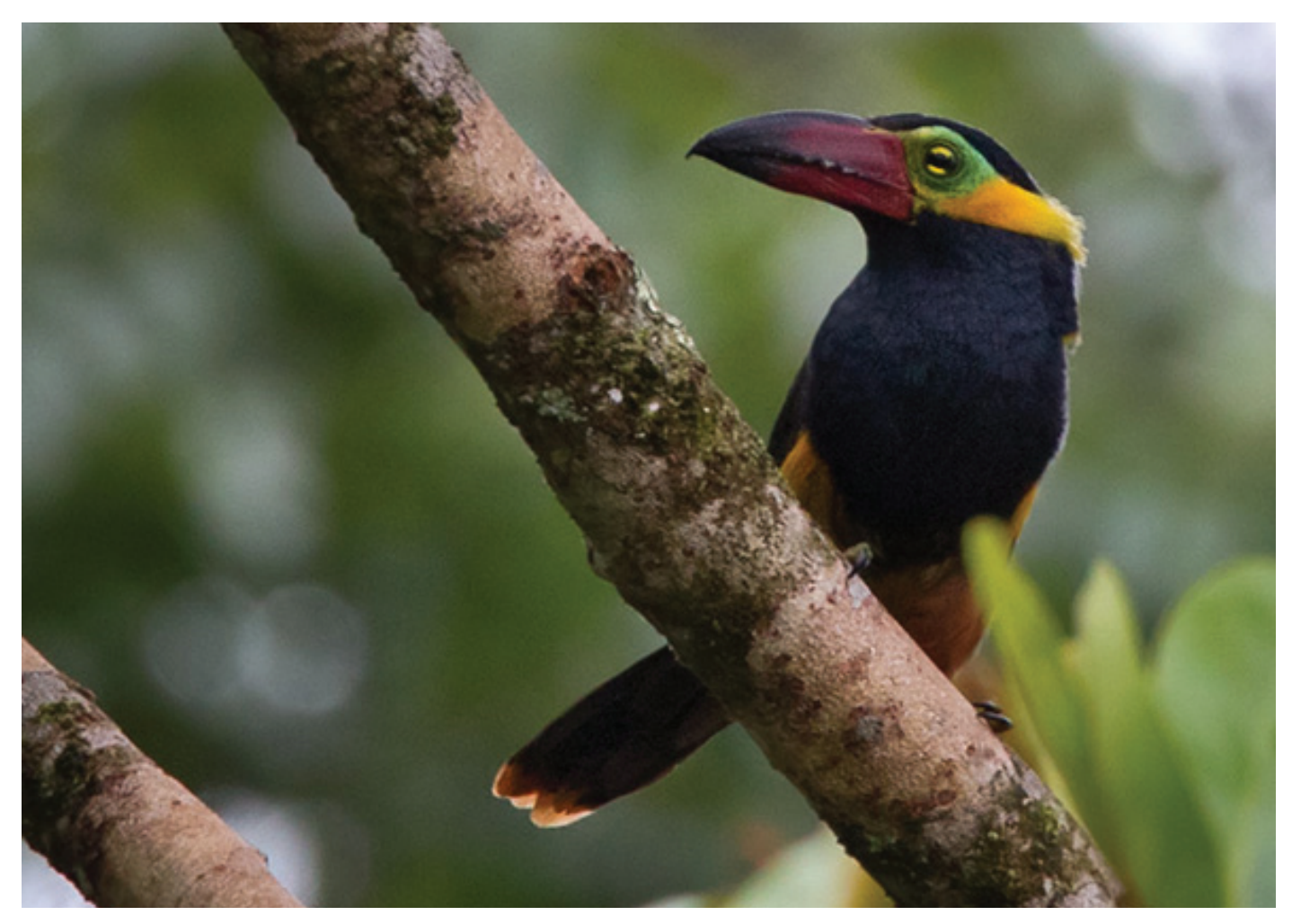
Male Golden-collared Toucanet

Crimson-rumped Toucanet Aulacorhynchus haematopygus