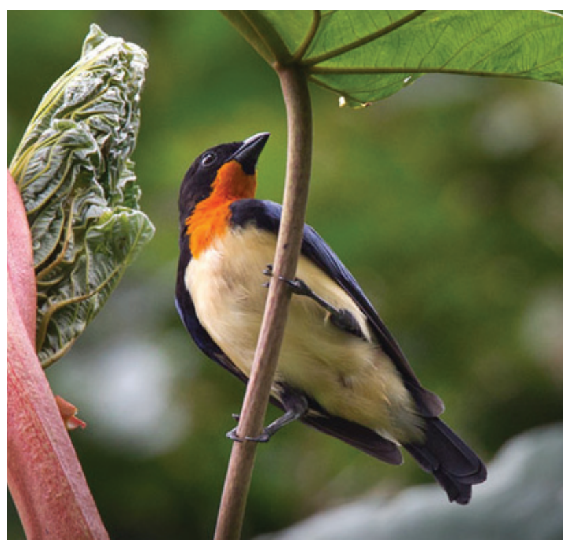
Orange-throated Tanager. This is now the World stake-out for this species endemic to the Cordillera del Cóndor, the mountain range that borders Peru. Up until a few years ago people went to a remote site in Peru a camped for a few days and some got lucky. Here it is almost guaranteed - roadside!