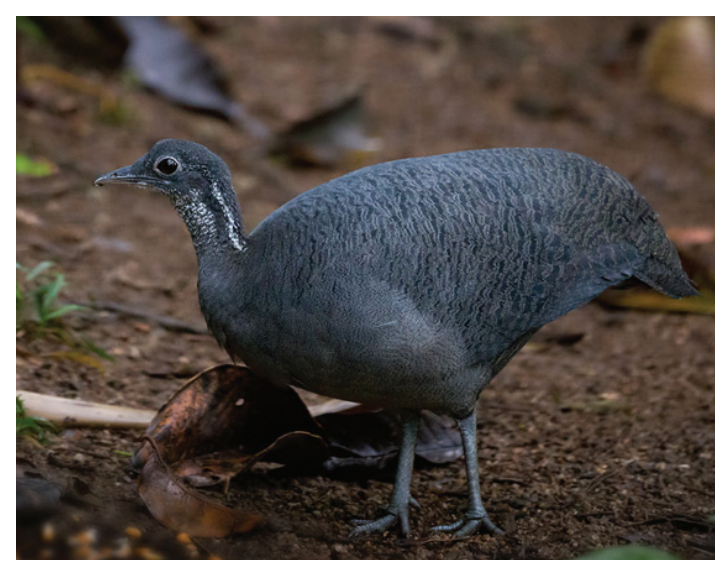
Gray Tinamou. Rare and difficult to see everywhere - except here at Copalingo lodge where they are being fed