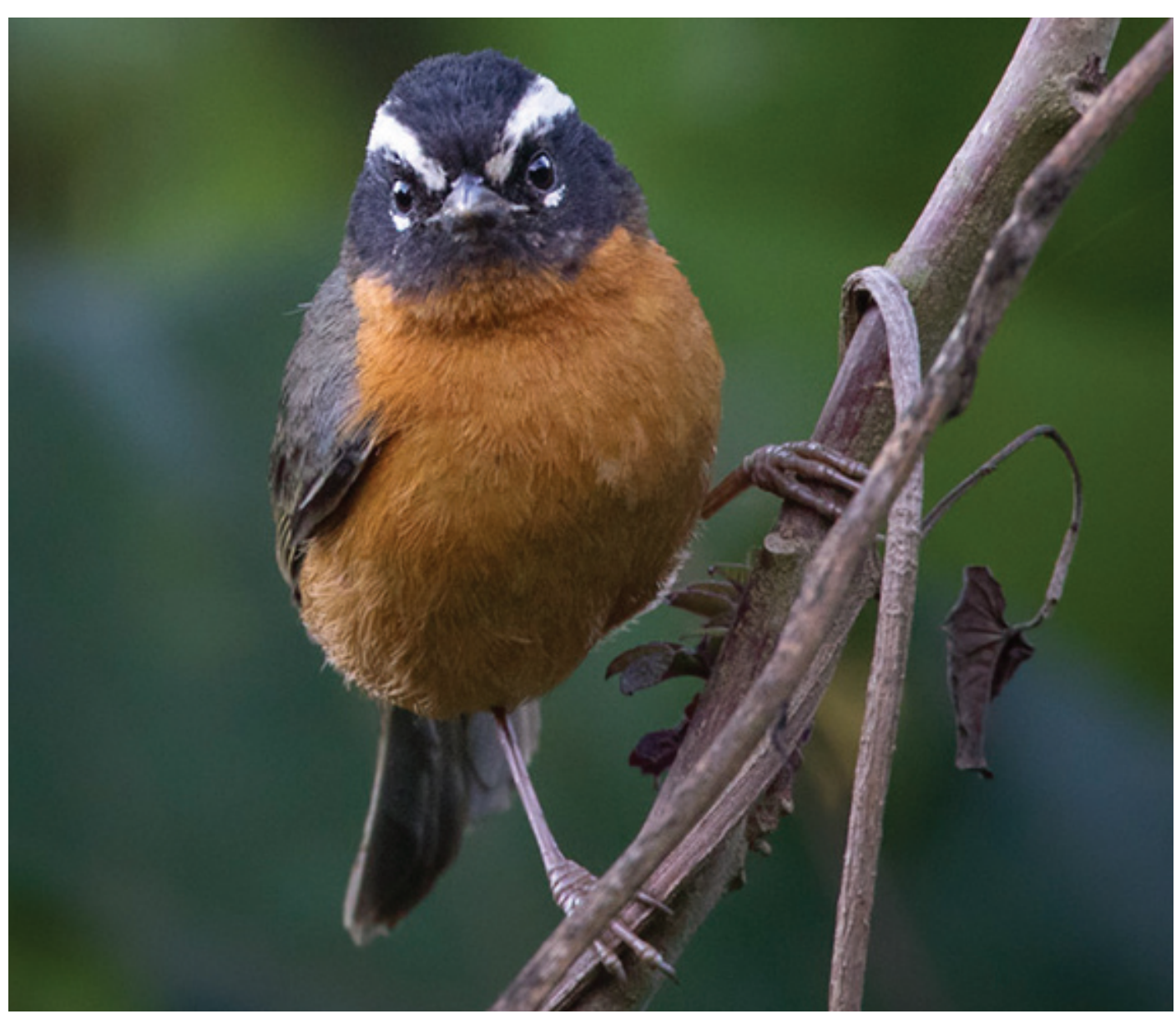
Piura Hemispingus. Rare in southwest Ecuador and northwest Peru. Taxonomic status is uncertain as it is often lumped with Black-eared hemispingus

1 male seen at Buenaventura, 2 seen at Yankuam and 2 seen along the old Loja-Zamora road