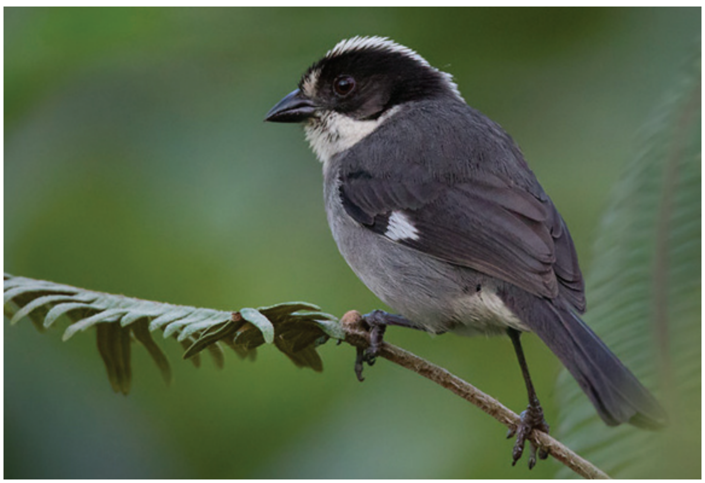
White-winged Brush-Finch. This distinctive taxon has been suggested to represent a separate species - Paynter's Brush-Finch. It has got a very small distribution in northern Peru and was recently found here in Ecuador with only a few territories known.