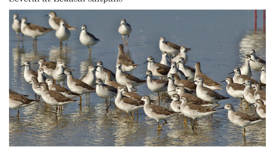
Wilson's Phalaropes at the Ecuasal saltpans