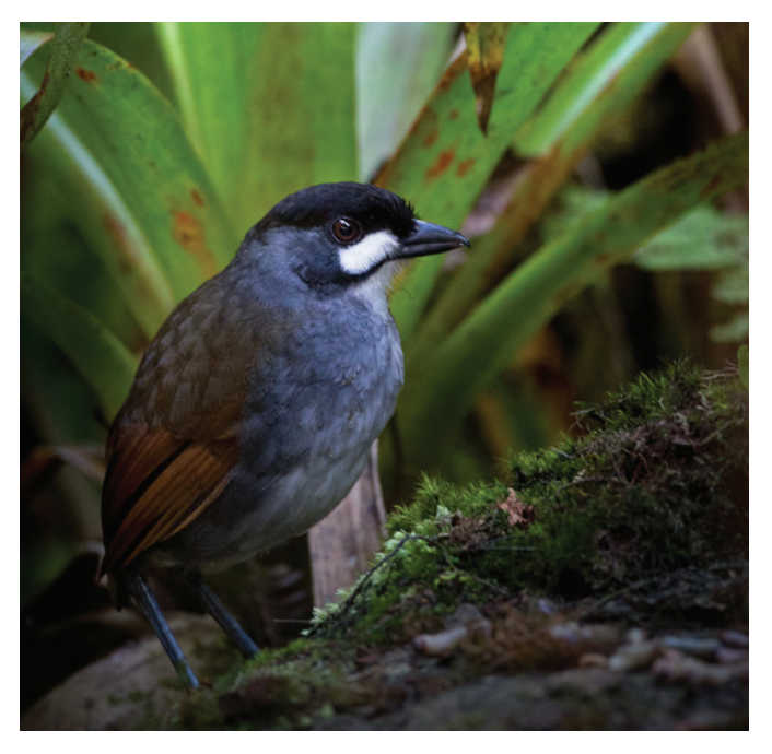
Jocotoco Antpitta. One of the star birds of southern Ecuador. Up to three birds come to feed on worms on a daily basis.

Gray-headed Antbird Myrmeciza griseiceps 1 seen and 1 heard at Utuana