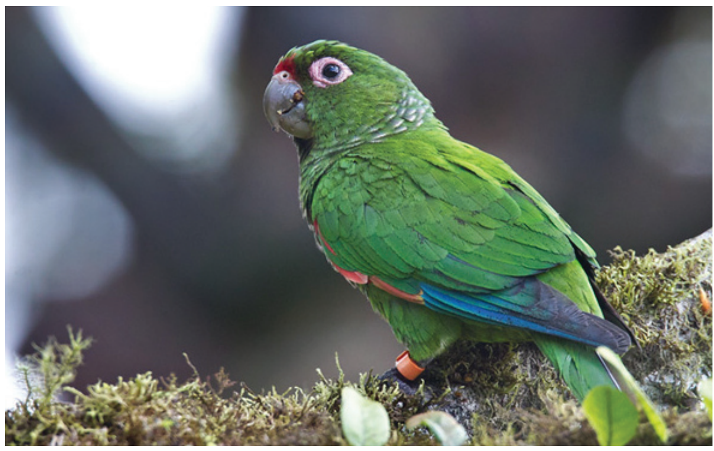
El Oro Parakeet. A rare stricktly Ecuadorain endemic living only in foothill forests on the humid Pacific slope in the southwest. At the Buenaventura reserve they nest in nest-boxes and are doing well.