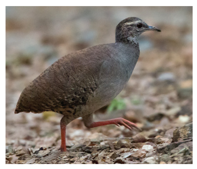
Pale-browed Tinamou. Common, vocal and readily seen at Jorupe

A few seen and many heard at Jorupe (photo below)