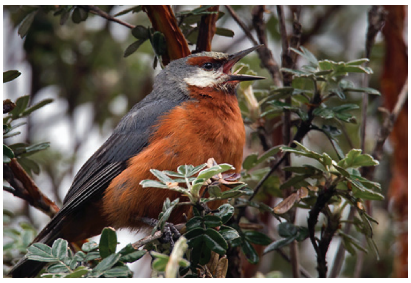
Giant Conebill. The only true polylepis specialist in Ecuador

Singles heard at Tapichalaca and Yunguilla