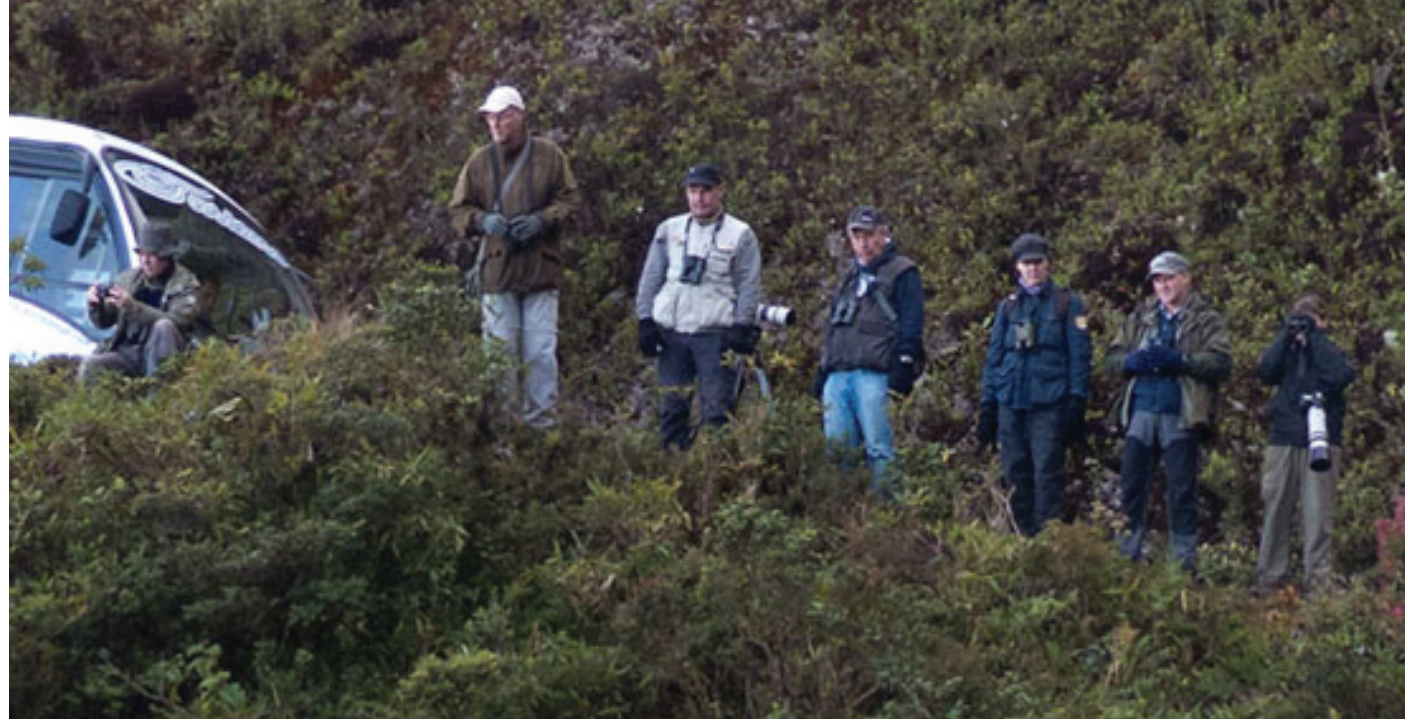
High altitude birding at Cerro Toledo

A few seen at Zapotillo, singles seen in the highlands between Loja and Cuenca