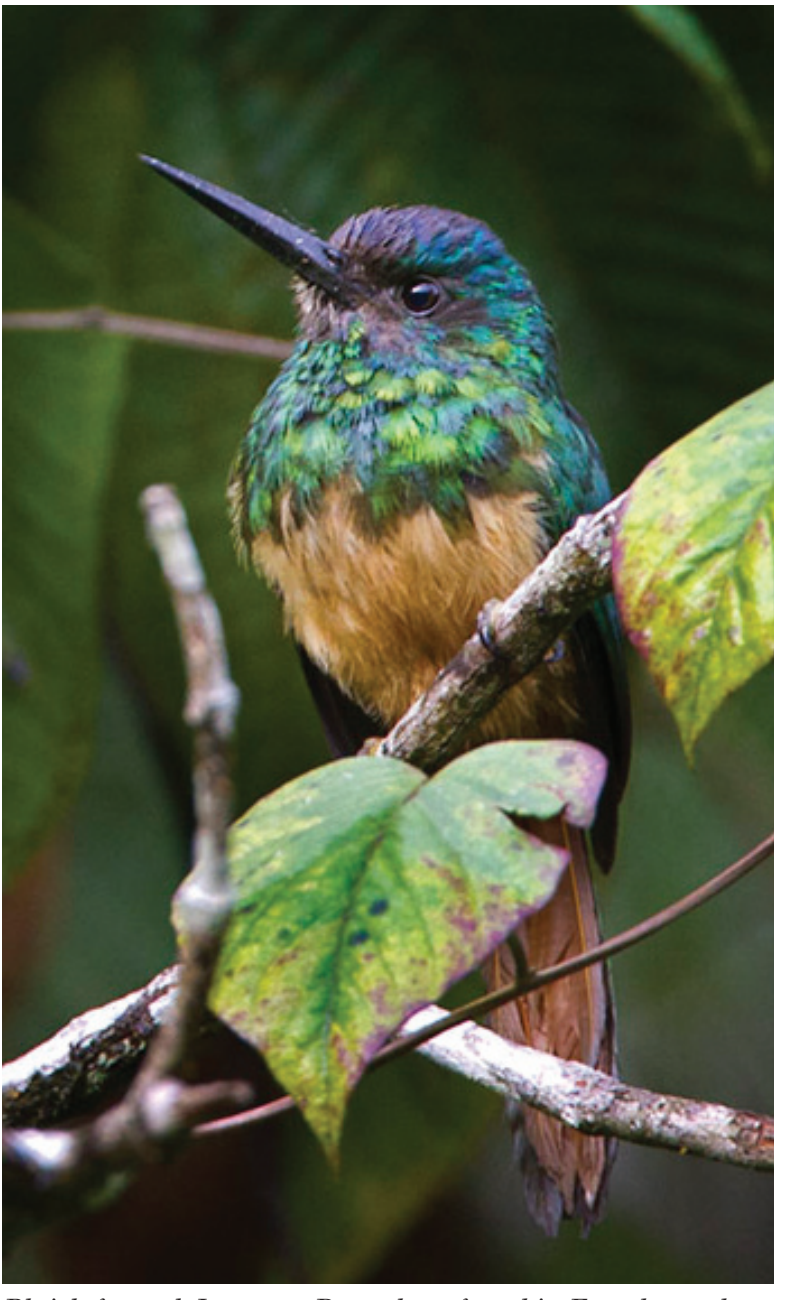
Bluish-fronted Jacamar. Recently re-found in Ecuador and this site is currently the only known territory. Formerly known from south of the Marañon river in Peru.