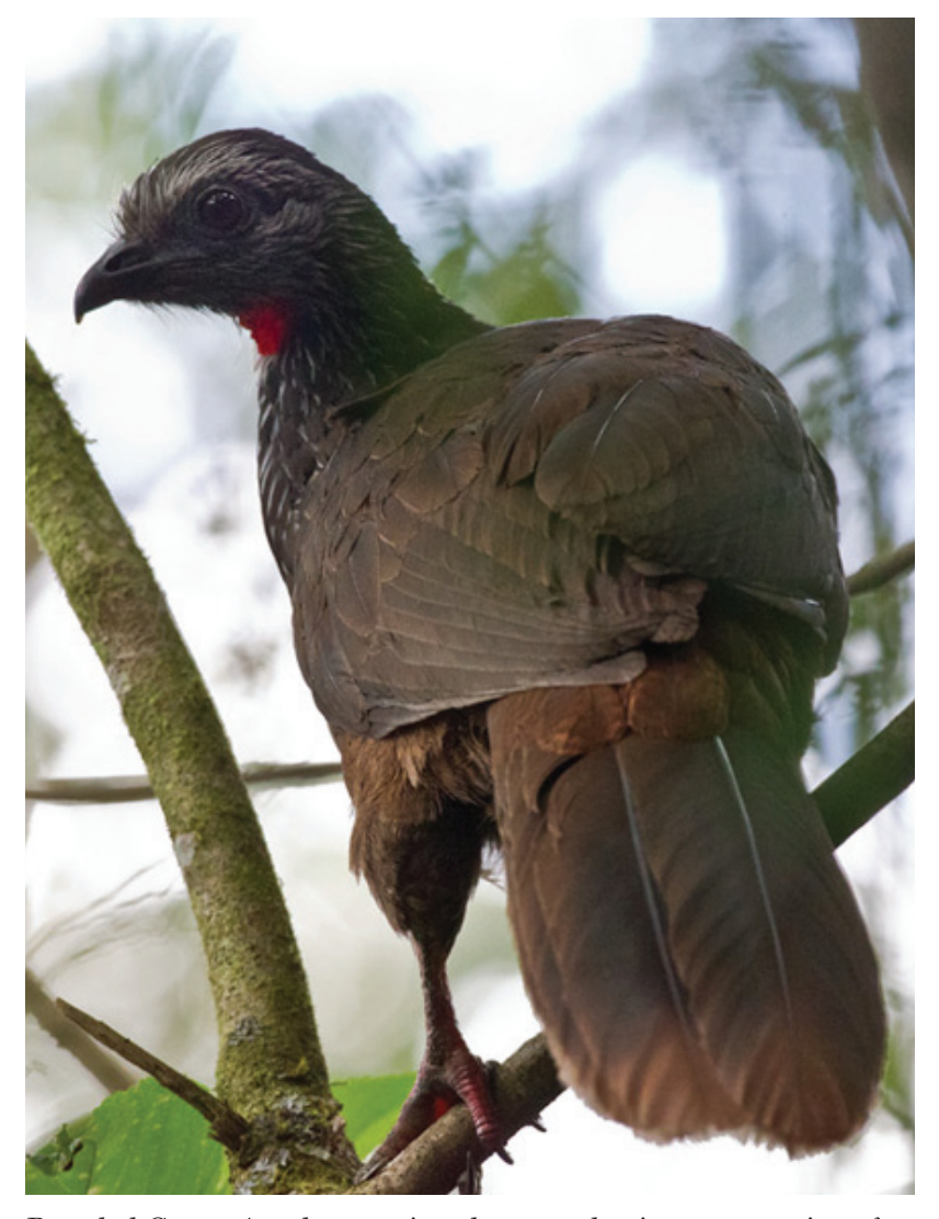
Bearded Guan. Another species almost endemic to mountains of southern Ecuador

Ecuadorian Rail Rallus aequatorialis 3 heard at laguna Llaviucu, El Cajas NP