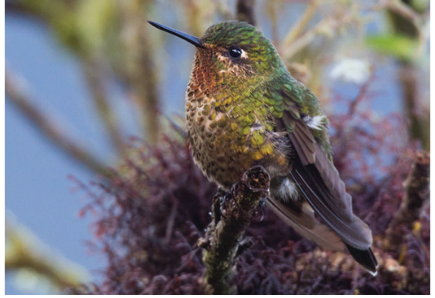
Neblina Metaltail at Cerro Toledo. The species is almost endemic to southern Ecuador and lives at tree-line above range of Tyrian Metaltail. This is the easiest accessible site for it.

flock as well as Grass-green Tanagers and others. After lunch we tried higher up along the road but with the roadwork that was going on, the road cuts had been severely damaged and with the sunny whether it was hard to see anything. The only Smoky Bush-Tyrant of the trip was seen and in the late afternoon the Golden-plumed Parakeets came in and showed well.