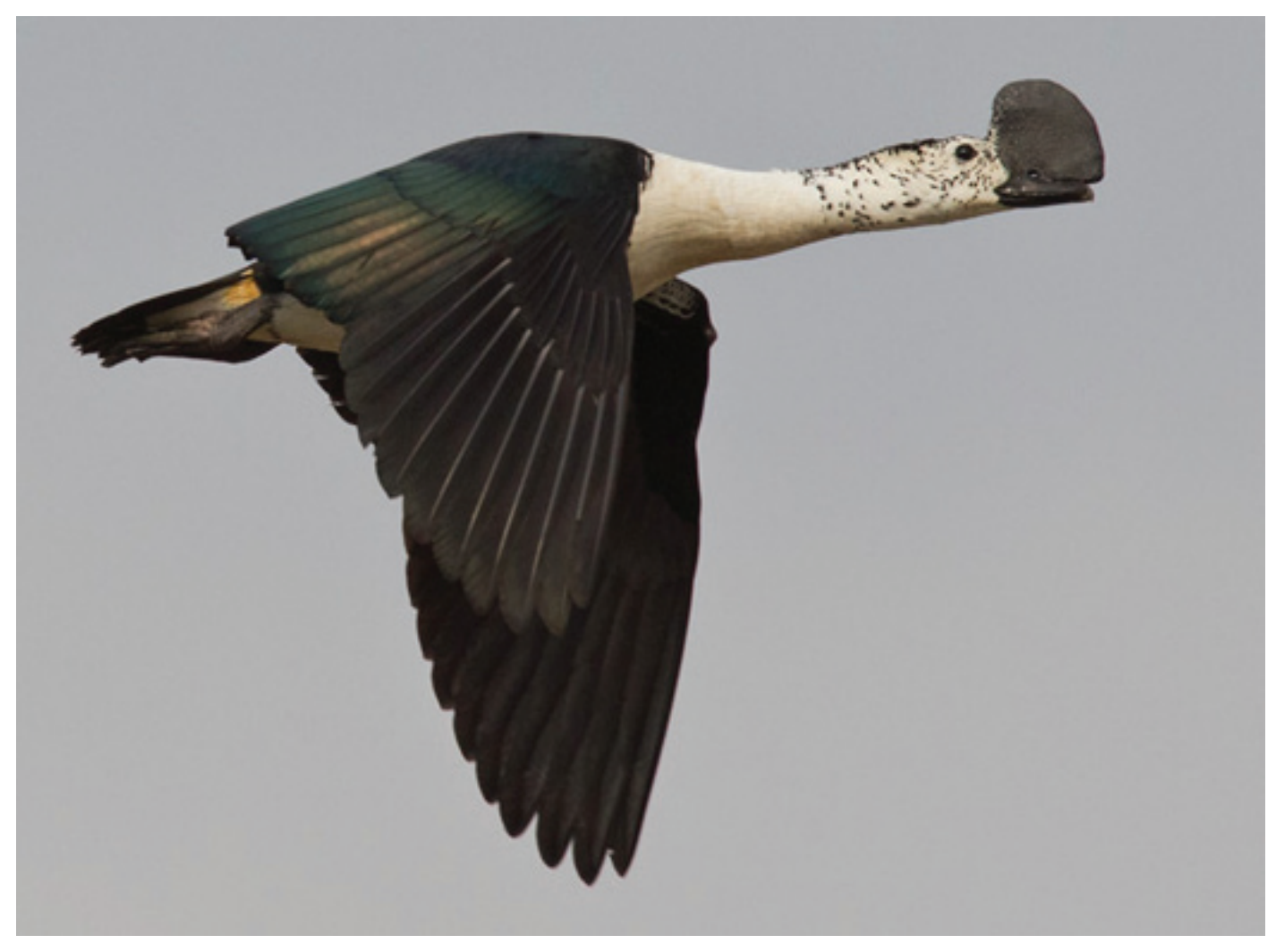
Male Comb Duck. Scarce in southwest Ecuador where this one was photographed.

About 400 seen at Mangalres-Churute and 200 at Puerto Jelí. 10 seen at Ayampe.