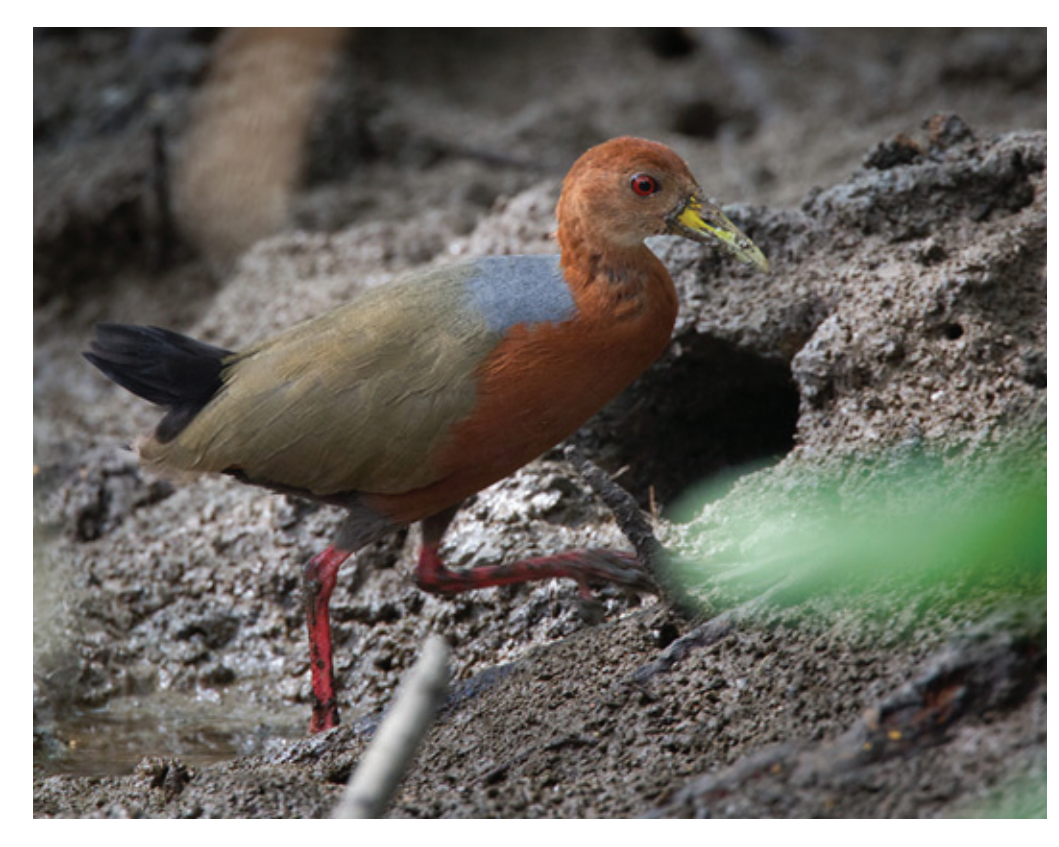
Rufous-necked Wood-Rail. This mangrove specialist was seen at Manglares-Churute working on a crab like a Woodpecker!