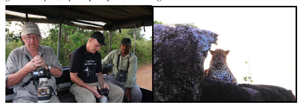
Yala, a heaven for photographers

We went for two safaris in Yala National Park, one full day safari and one evening safari. Leopard, the obvious target mammal species, was seen during both safaris. Birding was very good in the park, especially early in the morning and later in the afternoon.