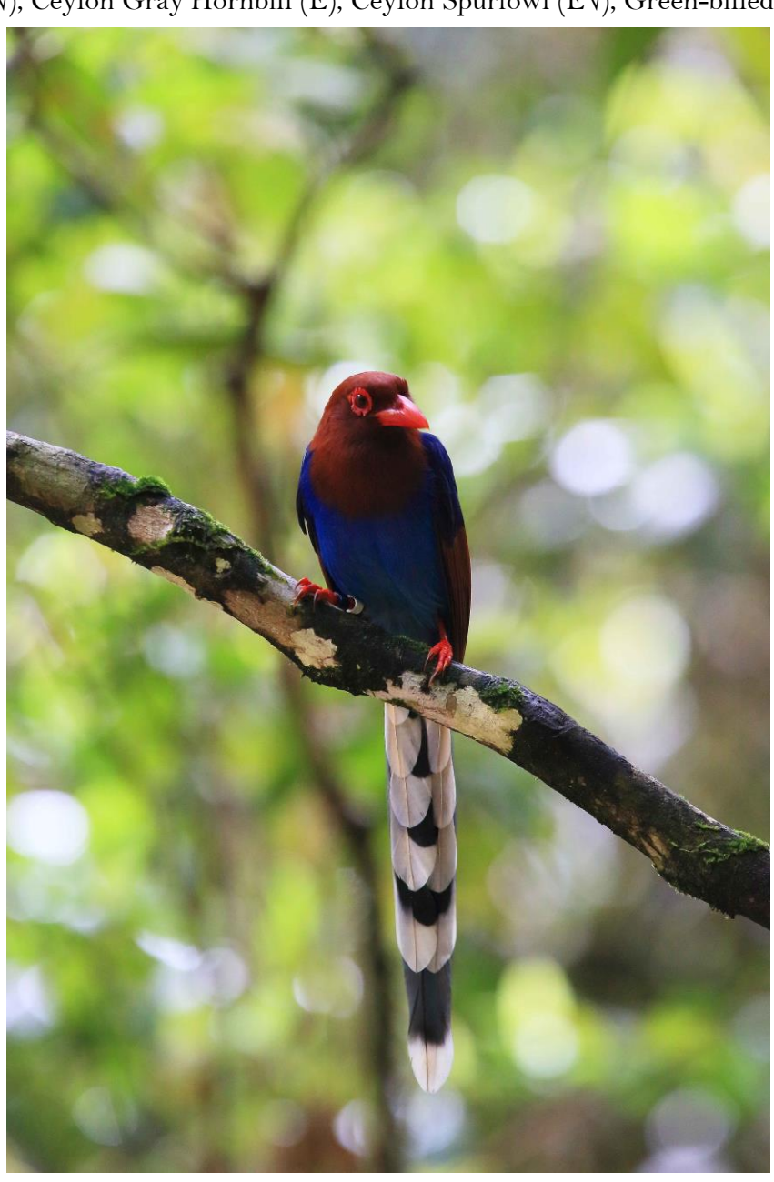
Ceylon Magpie, Sinharaja

Other target species: Crimson-backed Flameback (E\sqrt{}) , Sri Lanka Green-Pigeon (E \sqrt{} ), Black Bulbul -capped (E\sqrt{}), Yellow-eyed Bulbul (\sqrt{}) , Brown-capped Babbler (E\sqrt{}) , Orange-billed Babbler (E√), Sri Lanka Scimitar-Babbler (E \sqrt{} ), Sri Swallow Lanka (E\sqrt{}), White-throated Flowerpecker (E\sqrt{}), Yellowfronted Barbet (E\sqrt{}) , Ceylon Junglefowl (E \sqrt{} ), Layard's Parakeet (E\sqrt{}) , Ceylon Hanging-Parrot (E\sqrt{}) , Indian Blue Robin (\sqrt{}), Black-throated Golden-fronted Munia, (Sri Lanka) Leafbird<sup>12</sup> ( \sqrt{} ), Crested Goshawk, Band-Bay Cuckoo ed Malabar Trogon Dollarbird ( \sqrt{} ), Blackbacked Dwarf-Kingfisher (\sqrt{}) and Black-naped Monarch (\sqrt{}) .