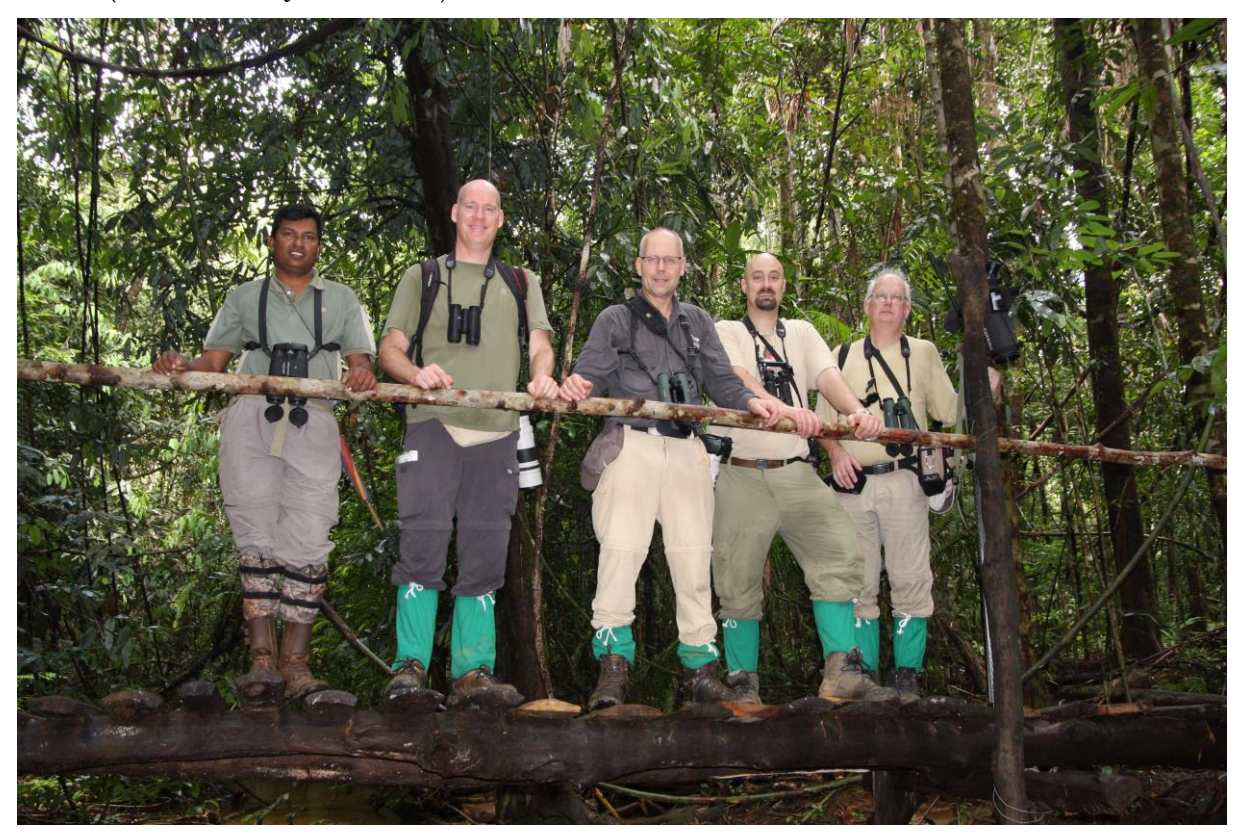
The Team, Sinharaja

We birded in the Sinharaja area for approximately three full days, which felt enough. We spent two mornings birding inside the forest reserve, walking a rather short distance along the same path both days. Quality wise birding in the forest was excellent, but it was rather slow. To be able to bird inside the park one needs a permit, which we received at the visitor center (all handled by Chaminda).