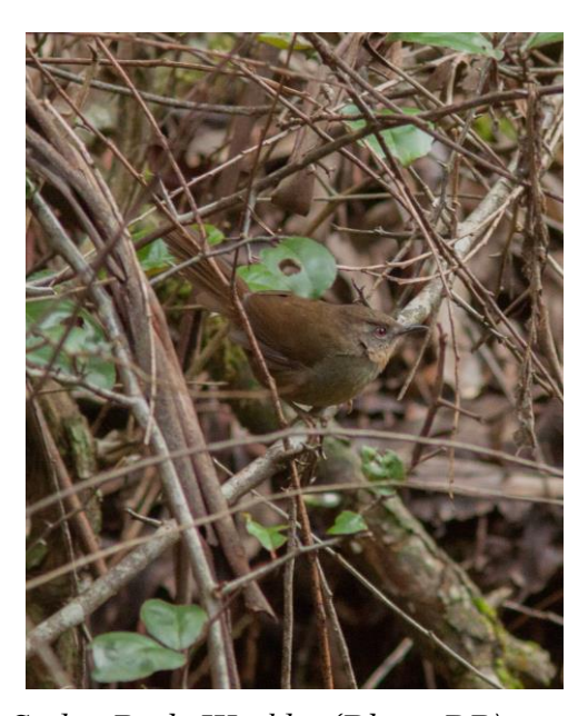
Ceylon Bush-Warbler