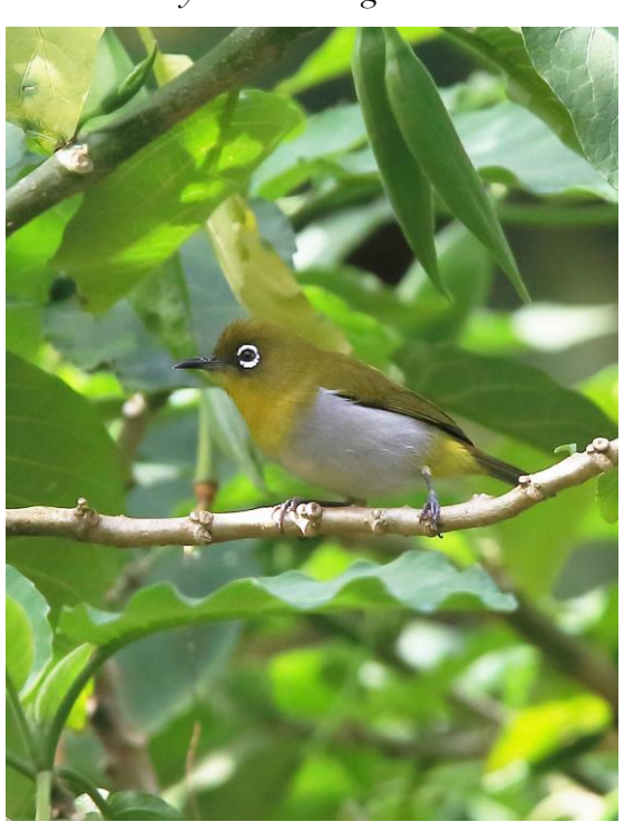
Ceylon White-eye