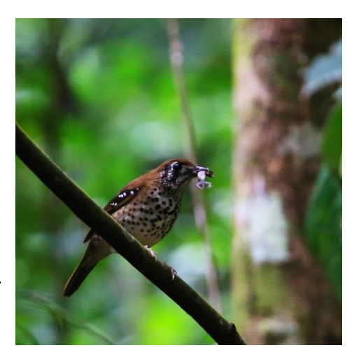
Spot-winged Thrush, Sinharaja

We had luck with the weather in Sinharaja; we had no rain during the days, only some heavy showers during two evenings and one night. There were plenty of leeches around everywhere in the Sinharaja area, why wearing leeches socks here are strongly recommended. The most effective way to get rid of them if they are sucking blood is to spray something containing DEET on them (i.e. MyggA for Swedes).