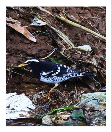
Kashmir Flycatcher, Indian Blue Robin and Pied Thrush, Nuwara Eliya