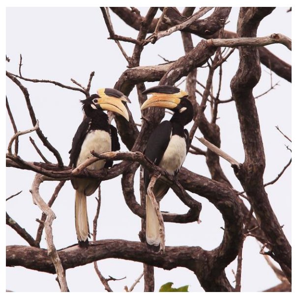
Black-capped Bulbul and Malabar Pied-Hornbill, Uda Walawe