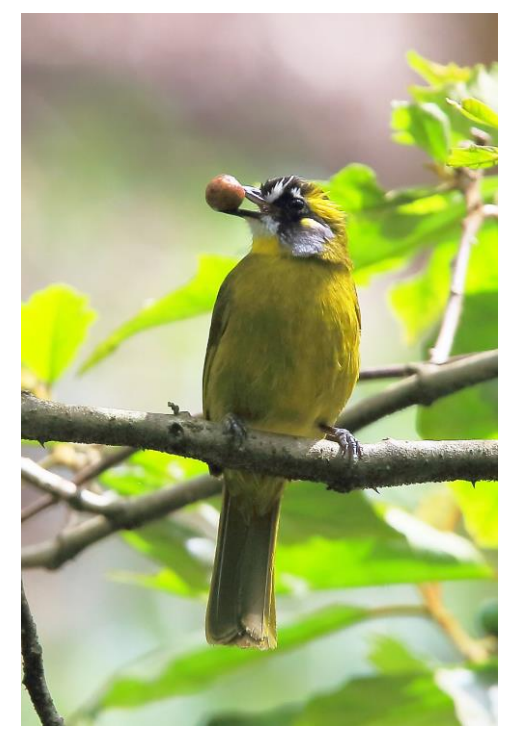
Yellow-eared Bulbul

opportunities to compare Common Snipe (here rather Uncommon Snipe) with Pin-tailed Snipe. In addition, we spent an afternoon and a morning at a forest area in the outskirts of town where we had such birds as Ceylon Bush-Warbler, Yellow-eared Bulbul, Ceylon White-Eye, Sri Lanka Wood-Pigeon (it took some time before we finally could get fantastic views of one perched in a tree near a garbage dump), Dull-Blue Flycatcher and Mountain Hawk-Eagle. According to Chaminda Scaly-Thrush is another possibility at this site if one visits it at first daylight. Finally, we went to a stream just south of Nuwara Eliya on the way to Hakgala Botanical Gardens, where we at dusk got good views of Ceylon Whistling-Thrush.