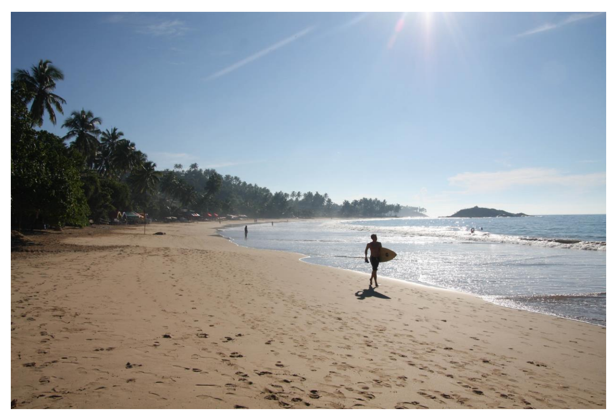
Mirissa Beach

We stayed three nights at Paradise Beach Hotel. The hotel is situated by beautiful Mirissa beach. The rooms were good, the breakfast buffet great but the dinner buffets only