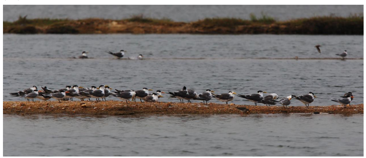
Bundala National Park

Target species: Saunder's Tern, Jerdon's Nightjar ( \sqrt{} ), Indian Nightjar ( \sqrt{} ), Small Pratincole (\sqrt{}) , Glossy Ibis (\sqrt{}) , Red-necked Phalarope (\sqrt{}) , Streaked Weaver, Terek Sandpiper, Yellow Bittern, Cinnamon Bittern, Greater Painted-Snipe, Ruddy Shelduck (R), Hume's Whitethroat (R), Long-toed Stint (R \sqrt{} ), Sharp-tailed Sandpiper (R \sqrt{} ) and Red-necked Stint (R\sqrt{}).