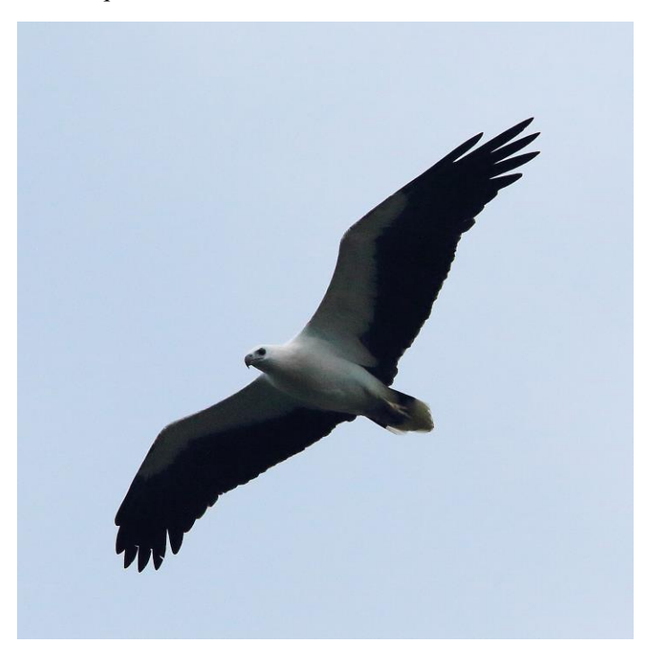
White-bellied Fish-Eagle, Bundala

Moreover, Chaminda said that there were fewer birds than usual because of the water levels, why we guess this can be a site where one easily can enjoyable spend many days. Unfortunately, we only had a few hours to spend here during an afternoon/evening, which most definitely was not enough. If one wants to be able to really scan all shorebirds here, one probable needs at least a morning tour plus an afternoon tour. Nevertheless, we managed to find most of our target species here plus two rarities: Sharp-tailed Sandpiper (new lifer for Chaminda), Rednecked Stint (unfortunately only seen by Patrik), Long-toed Stint, Red-necked Phalarope, Glossy Ibis, Small Pratincole and Jerdon's- and Indian Nightjar.