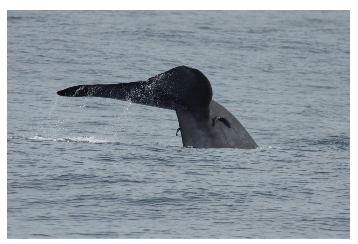
Indian Blue-Whale, Mirissa

During our stay in Mirissa we did a day-tour to Galle followed by an afternoon/evening visit to Kirale Kele, a wetland approximately 40 minutes' drive from Mirissa. Galle old town was a laid back place with rooftop cafés, art shops, a lighthouse, old churches and a fort. We