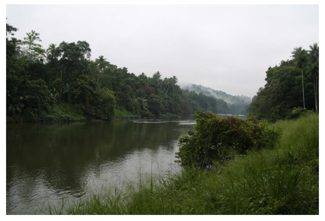
Kelani River, Kithulgala

We stayed in Kithulgala Rest House, which was beautifully situated near the river. The rooms had a basic standard, but the service and the food were quite good.