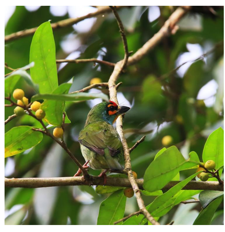
Sri Lanka Small Barbet, Ura Pola

We spent two full days in Kithulgala, which felt enough. We birded mainly in three areas, i.e. in the village area near the police station, at Kithulgala Estate rubber plantation and at Makandawa Forest, which is reached by taking the "passenger ferry" (more like a canoe) across the river Kithulgala Rest House. We wore leech socks in the Kithulgala area, but leeches were few and far between. We had pre-ordered the socks via Bauer's and they were handed over to us by Chaminda.