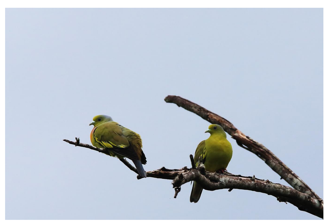
Orange-breasted Pigeon, Uda Walawe