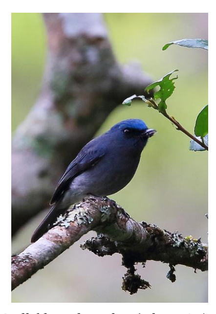
Dull-blue Flycatcher