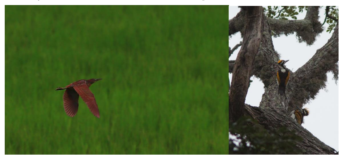
Cimmanon Bittern and White-naped Woodpecker, Tissa Debera Wewa