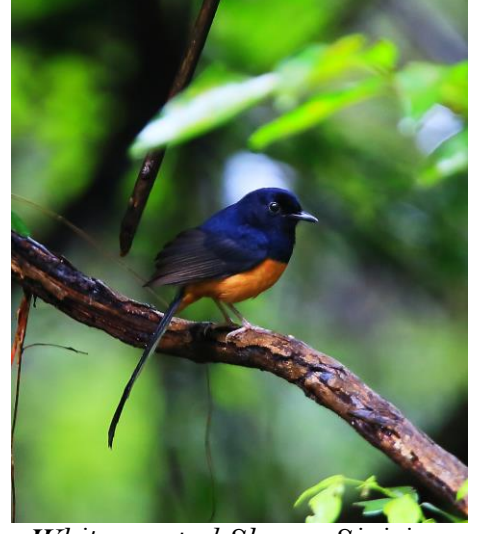
White-rumped Shama, Sigiriya

We stayed one night at Kassapa Lions Rock hotel, which had good rooms but was a somewhat impersonal place.