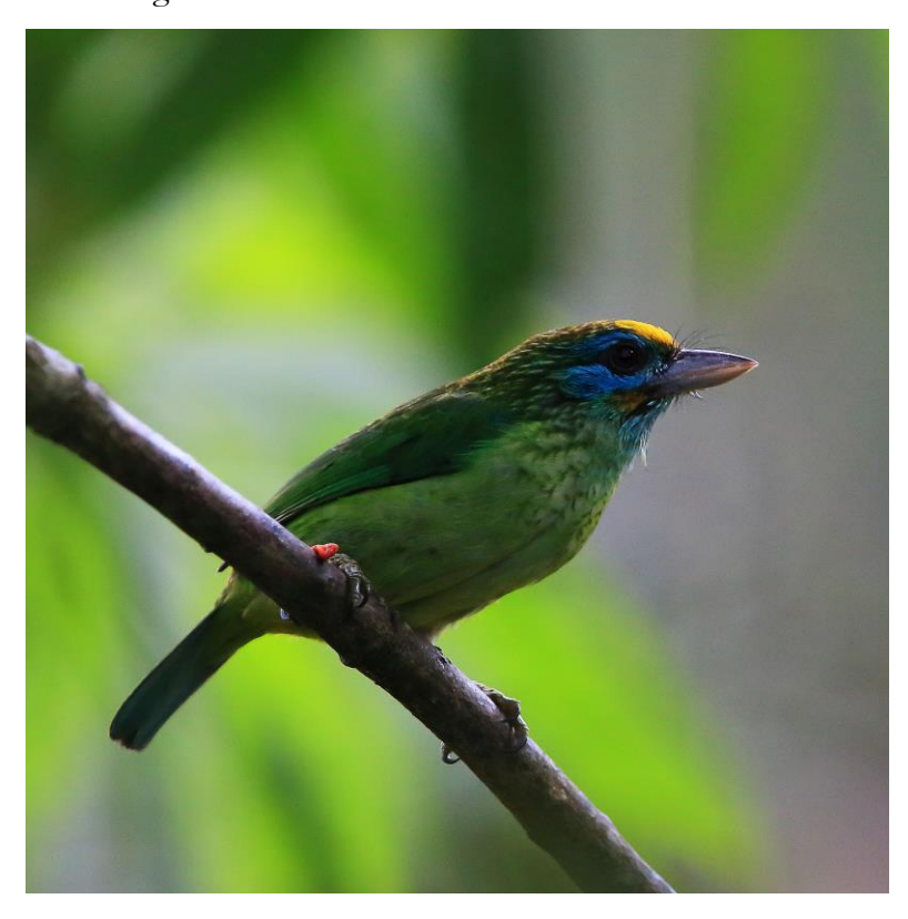
Yellow-fronted Barbet, Sinharaja

site for them, close Sinharaja village, where they have been seen and heard regularly lately.<sup>14</sup> We were out listening for them late evening December 26 and early morning December 27. Unfortunately, the owls are calling less actively this time of the year, which might be one reason behind why we failed to tick the species. In truth, one could say that the main reason behind our failure is that we did not now the different sounds of the species well enough; Chaminda heard Sri Lanka Bay-Owl calls two times at sunrise December 27, but unfortunately no one in the group except for him heard the calls with certainty well enough to be able to identify it species wise.