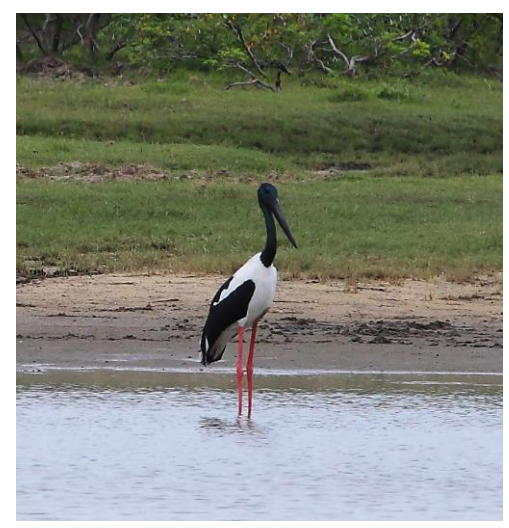
Lesser Adjutant and Black-necked Stork, Yala