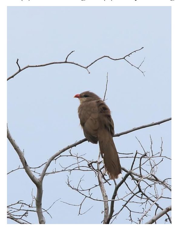
Sirkeer Malkoha, Uda Walawe

We stayed three nights at Centauria Hotel. Indian Scops-Owl can be seen on the hotel grounds, but except for this it is difficult to find anything good to say about this dull hotel, which nevertheless is functional for birders.