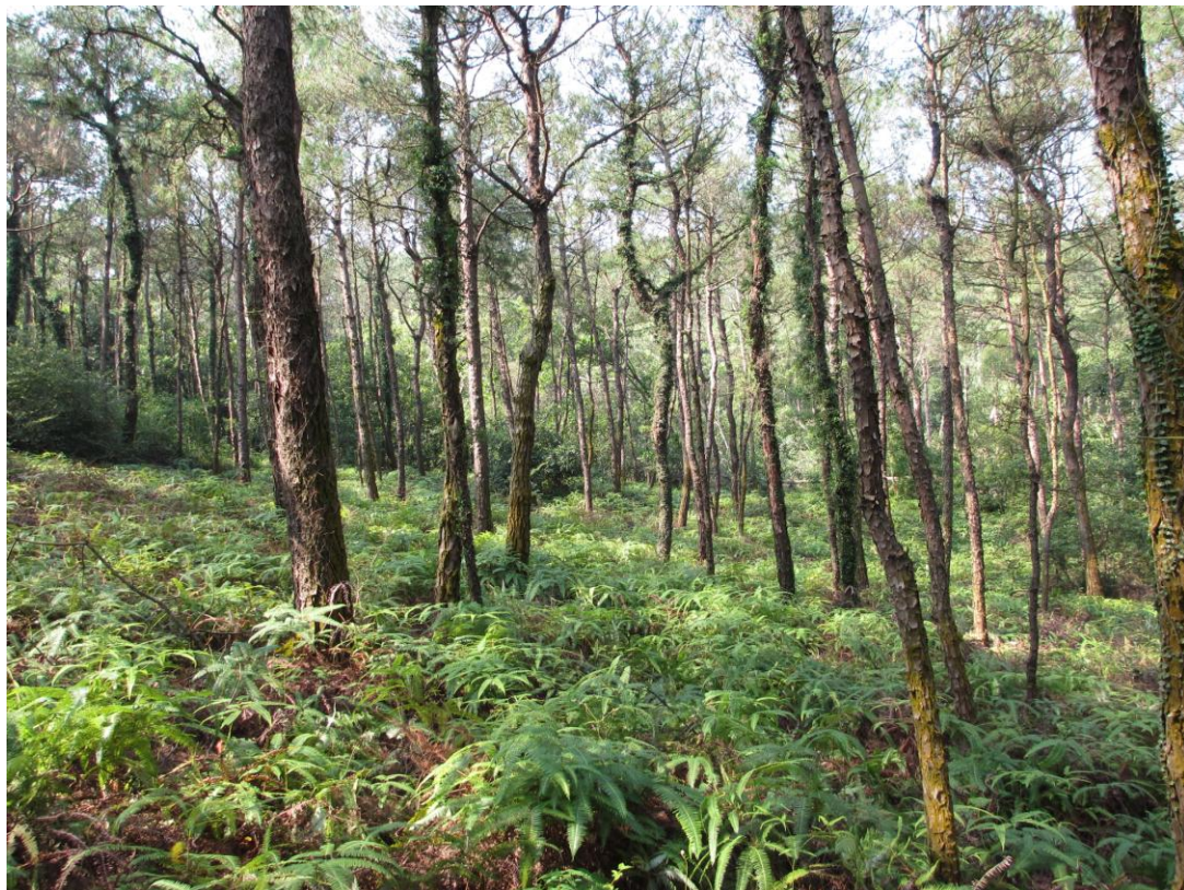
Pine forest at Guanting National Forest Park.