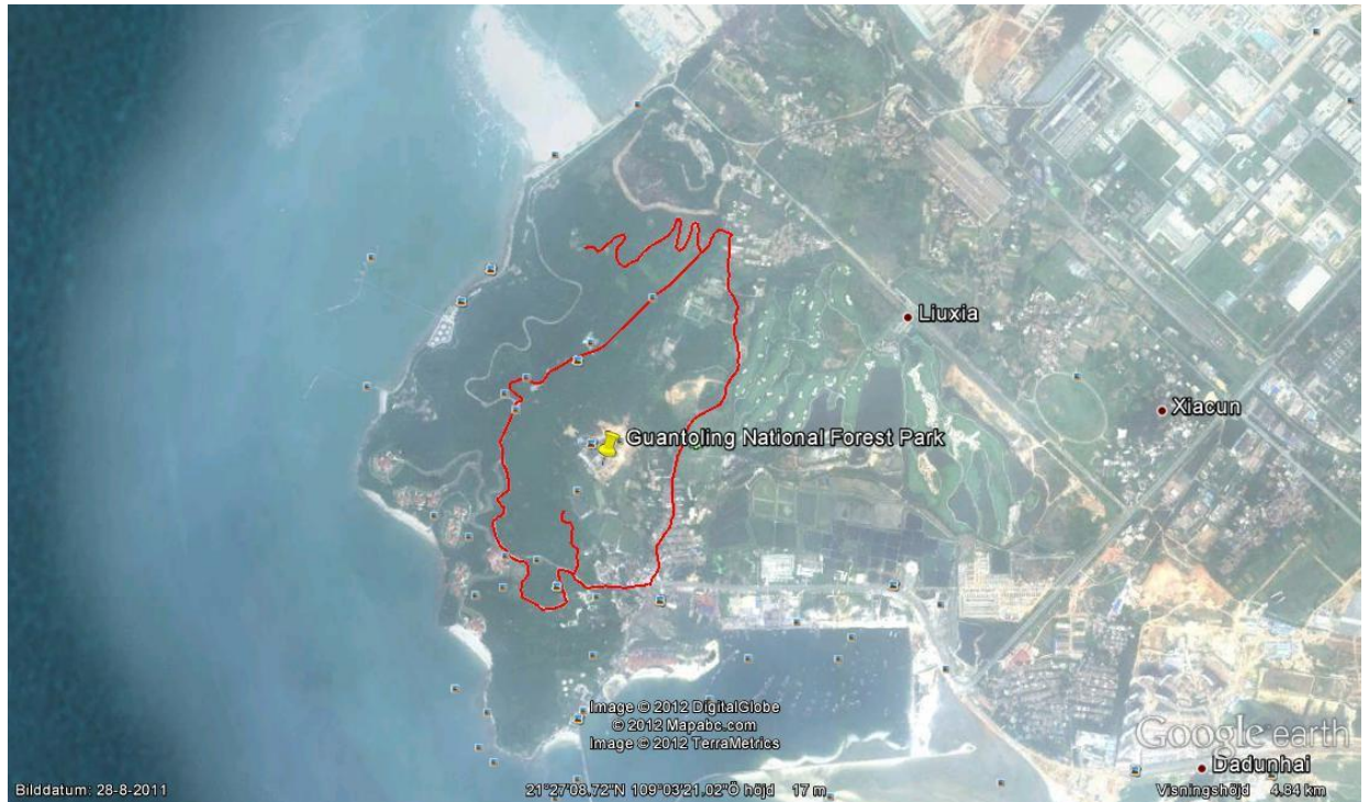
Satellite pictures over Guanting National Forest Park. The red line indicates my route.

there by a taxi for around 70 yuan and found it very easy to walk around in the area even though it got pretty crowded with people in the afternoon. The lower areas proved were good for warblers including Dusky and Radde's Warbler, two species that I really looked forward to see before the trip.