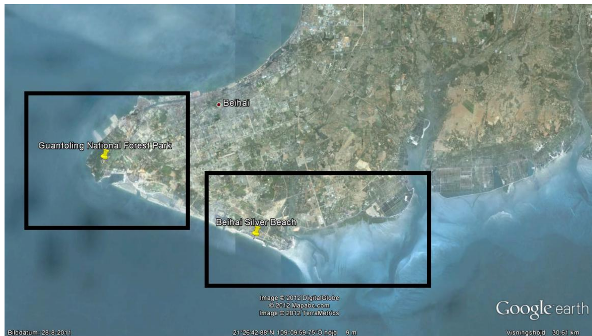
Satellite picture over Beihai with marking for the two areas I visited.

The first place I visited was Guantoling National Forest Park which is situated on the most western part of Beihai peninsula. The nature is hilly pine forest facing the ocean and deciduous forest in the areas on lower altitude. A car-road goes through the area and there are also some smaller roads only for pedestrians making the area easy accessible both by car or by foot. I got