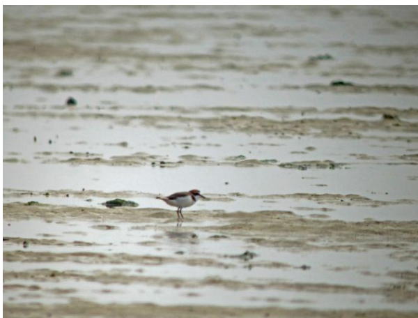
Kentish Plover Charadrius alexandrinus