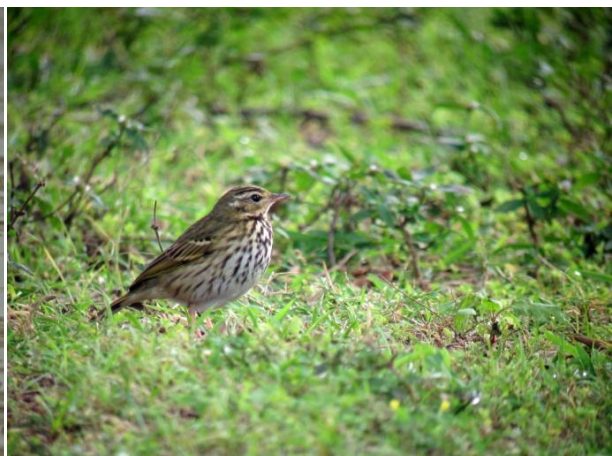
Olive-backed Pipit Anthus hodgsoni