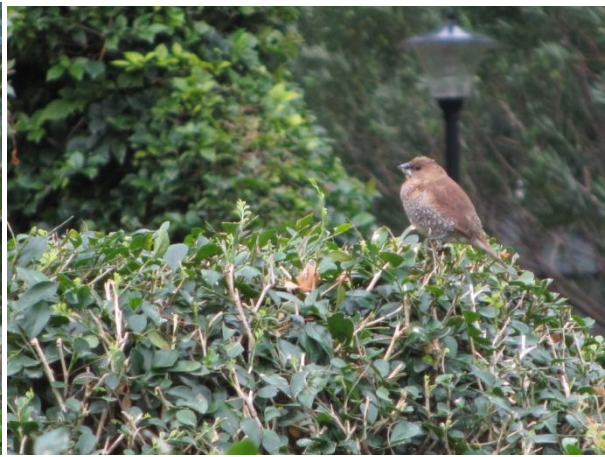
Scaly-breasted Munia Lonchura punctulata