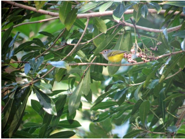
Chestnut-crowned Warbler Seicercus castaniceps