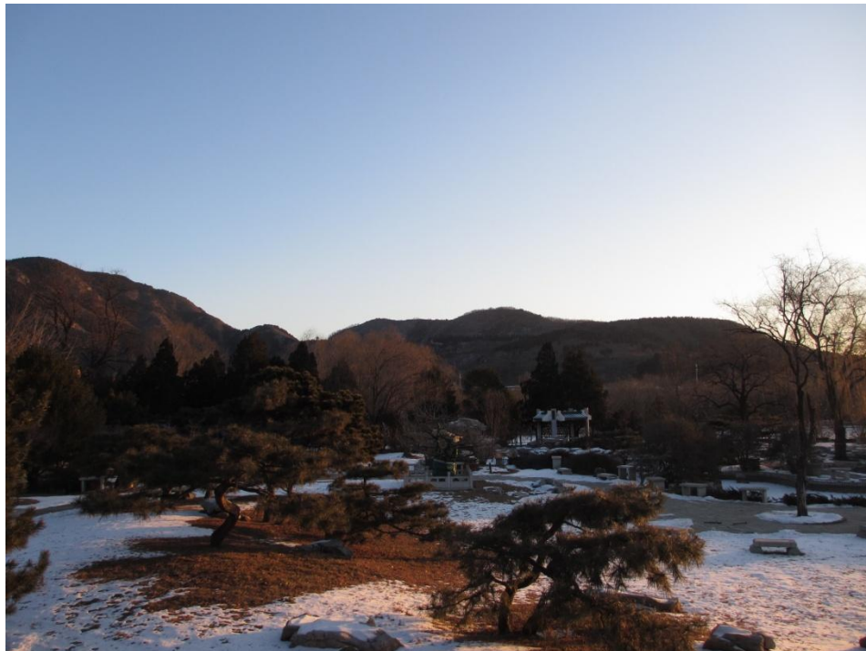
Beijings Botanical Garden

Pere David's Rock Squirrel 1 ex. Cherry Valley, Beijing Botanical Garden 23/12