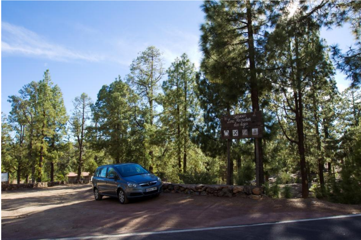
Las Lajas picnic area