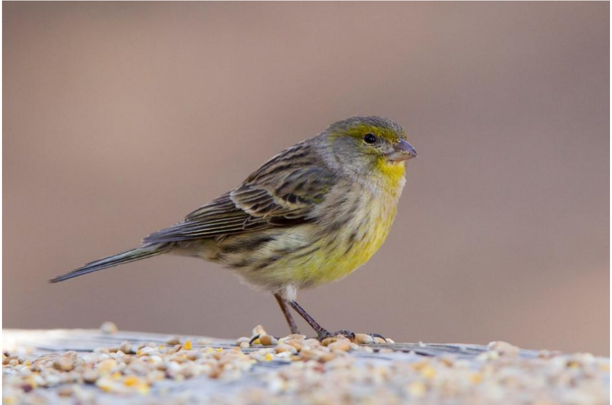
Atlantic Canary, Las Lajas