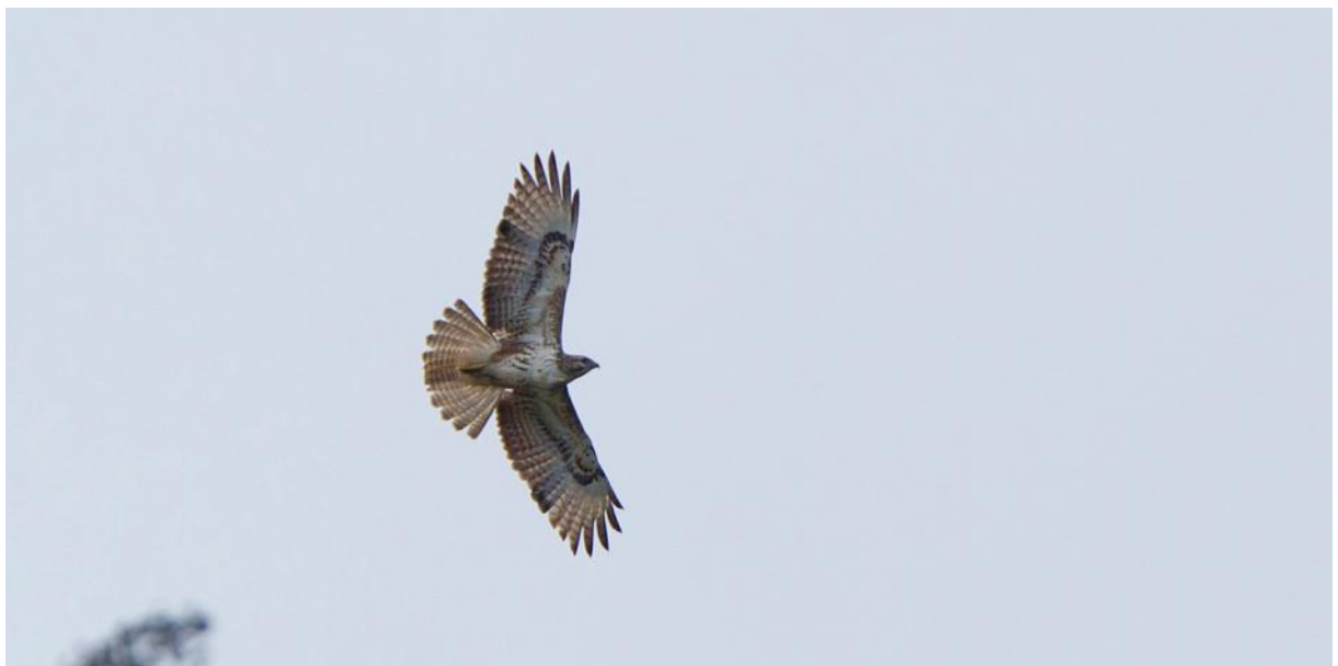
Canary Island Buzzard, Mirador El Lance