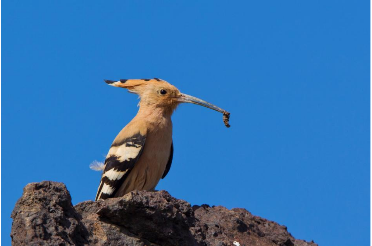
Eurasian Hoopoe, Punta de la Rasca