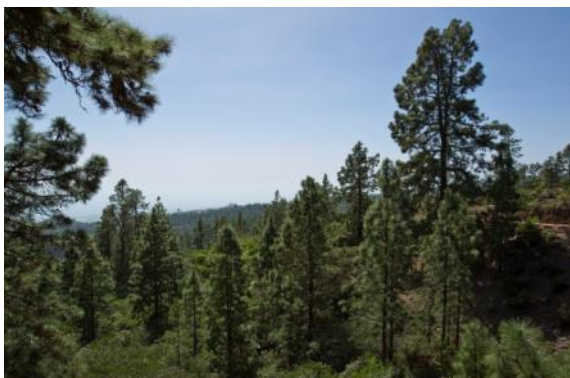
Canary Island Pine ( Pinus canariensis ) Vilaflor 24-2