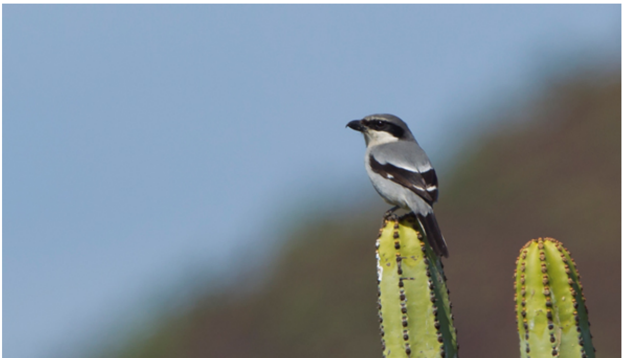
Southern Grey Shrike, Punta de la Rasca