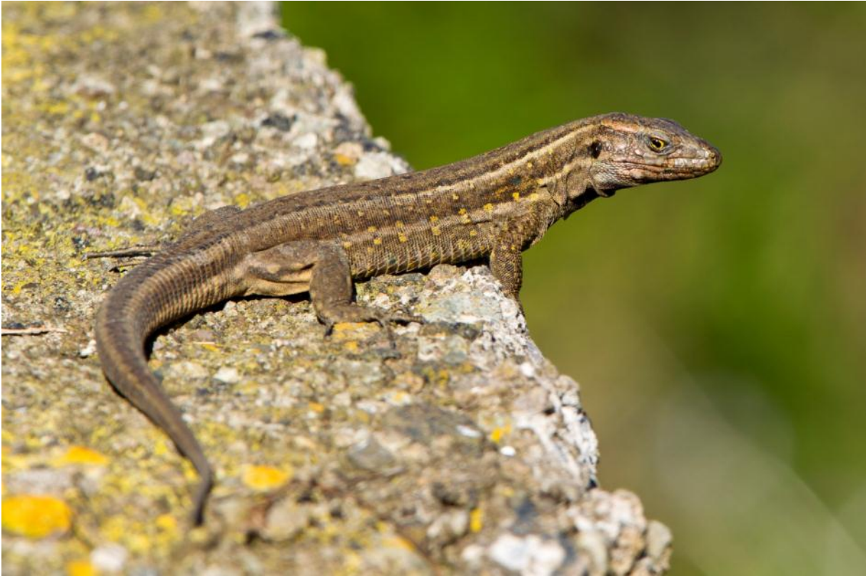
Tenerife Lizard, Barranco du Ruiz

Tenerife Lizard Blåkindad kanarieödla (Gallotia galloti) (2 sightings, 14 ind) 10 Barranco de Ruiz 22-2, 4 Monte del Agua 22-2