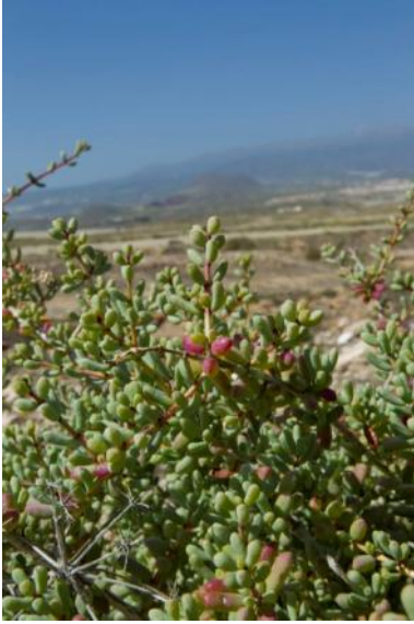
Chenopodiaceae ( Salsola divaricata ) El Medano pond 24-2