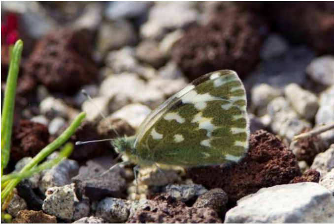
Bath White, Punta de la Rasca

Bath White Grönfläckig vitfjäril (Pontia daplidice) (1 sightings, 1 ind) 1 imago/adult Punta de la Rasca 21-2