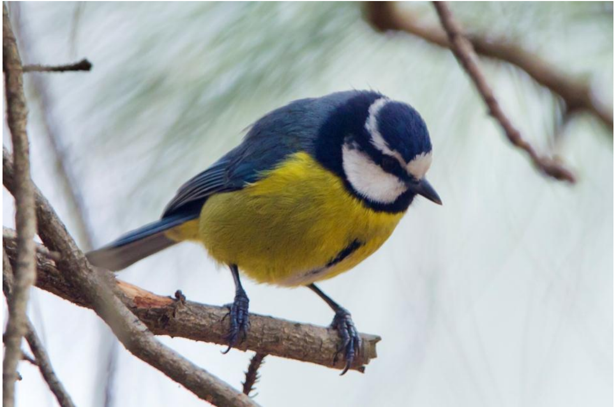
African Blue Tit, Ramon Caminero