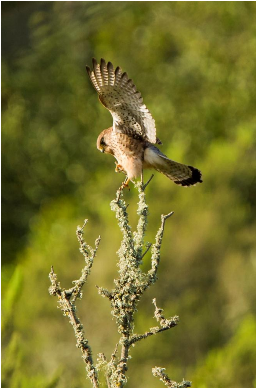
Common Kestrel, Mirador El Lance