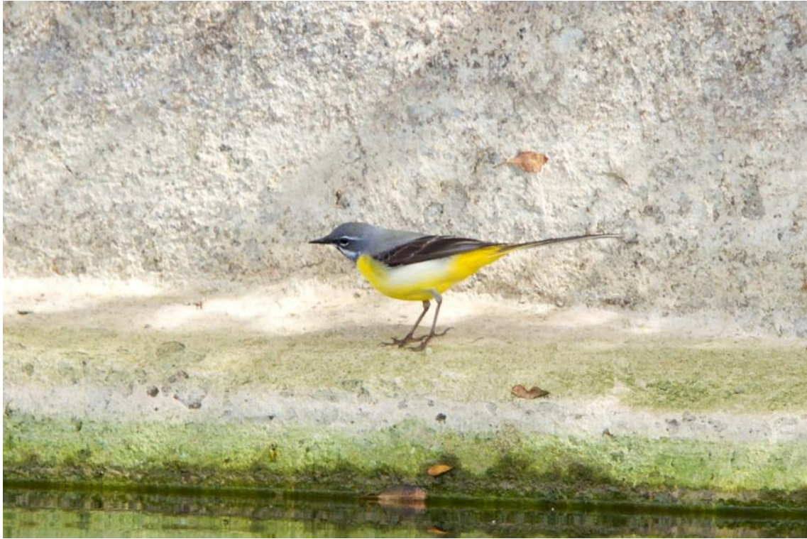
Grey Wagtail, Barranco del Espinal

1 Tenerife Norte airport-Puerto de Santiago 19-2, 1 Las Lucanas farm 20-2, 2 Barranco del Espinal 20-2, 1 Puerto de Santiago 21-2, 2 Punta de la Rasca 21-2, 2 Barranco de Ruiz 22-2, 2 Puerto de Santiago 23-2, 1 Masca valley 23-2