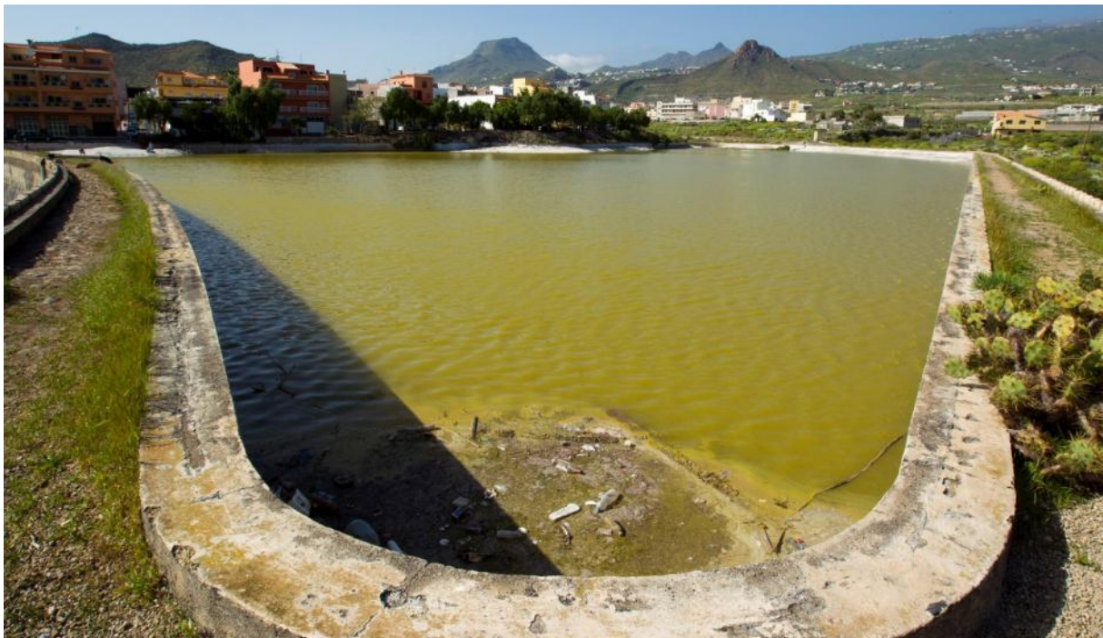
Reservoir de Cabo Blanco

Common Moorhen 2 Eurasian Coot 1 Common Sandpiper 1 Yellow-legged Gull 2 Little Ringed Plover 2 Canary Islands Chiffchaff 2 Eurasian Collared Dove 2 Domestic Dove 1