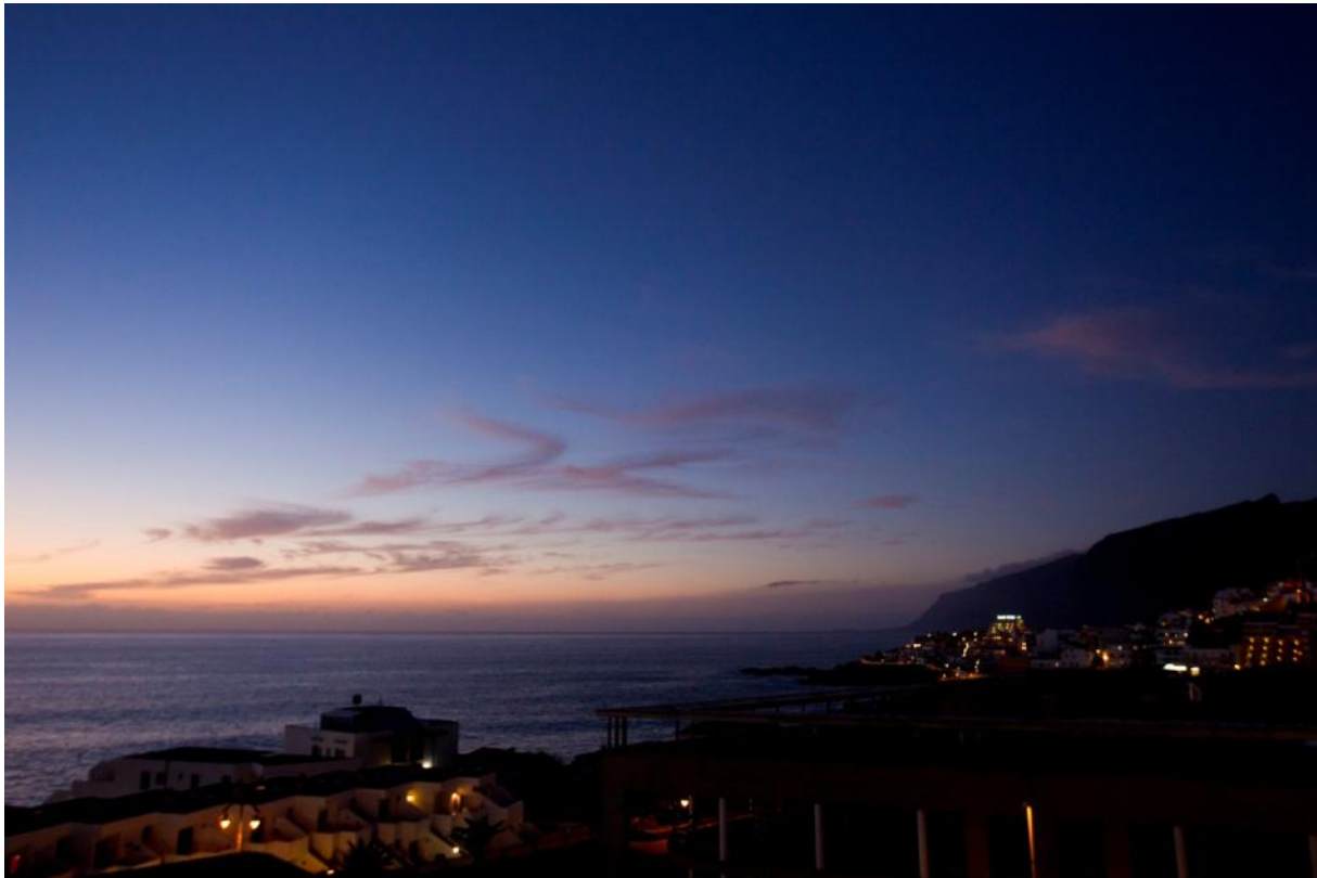
Puerto de Santiago, view to the north from the hotel