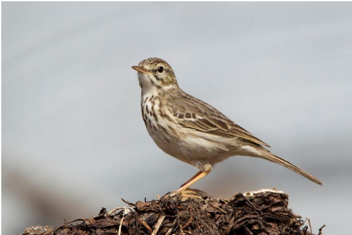
Berthelot's Pipit, Barranco del Espinal