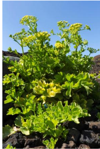
Sea Lavender ( Limonium fruticans ) Punta de Fraile 23-2