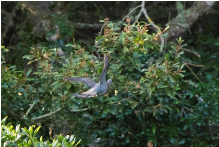
Bolle's Pigeon, Mirador El Lance