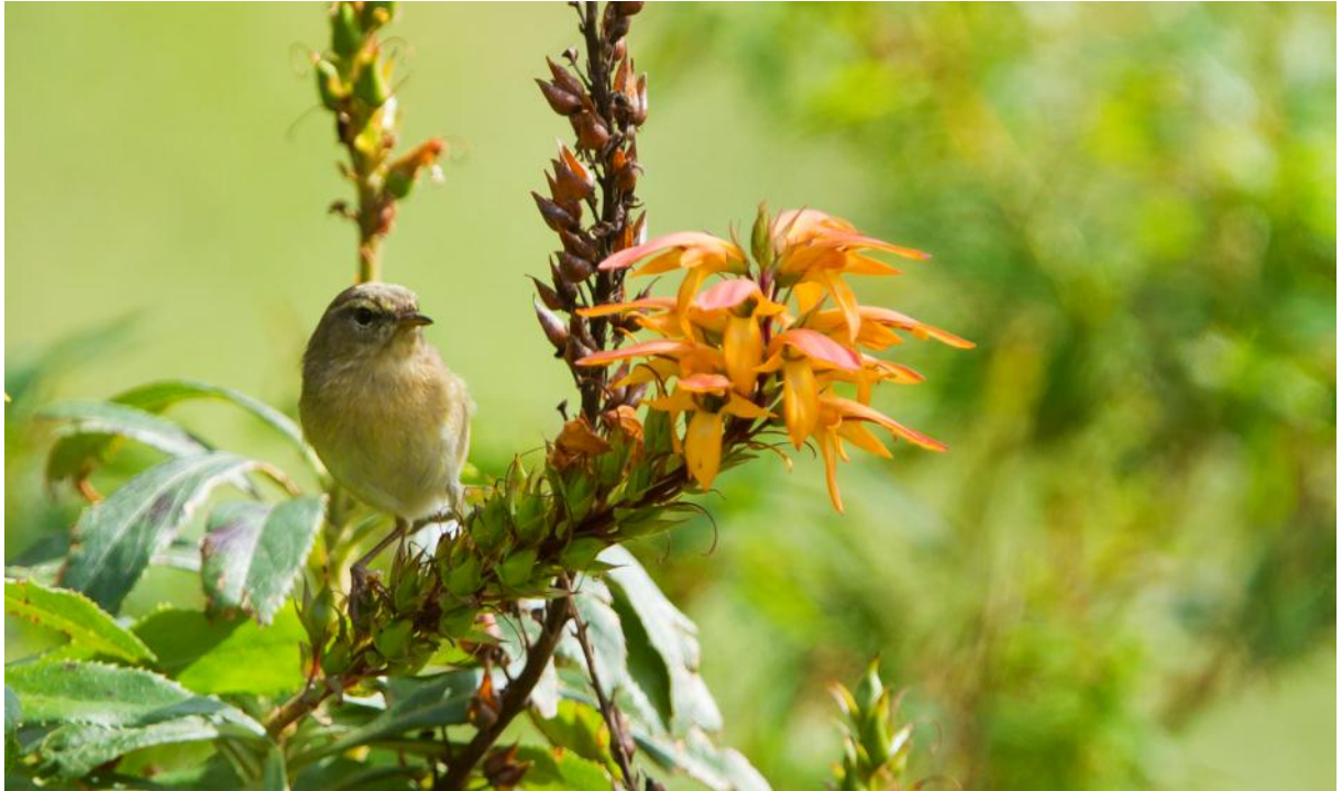
Canary Islands Chiffchaff, Barranco de Ruiz