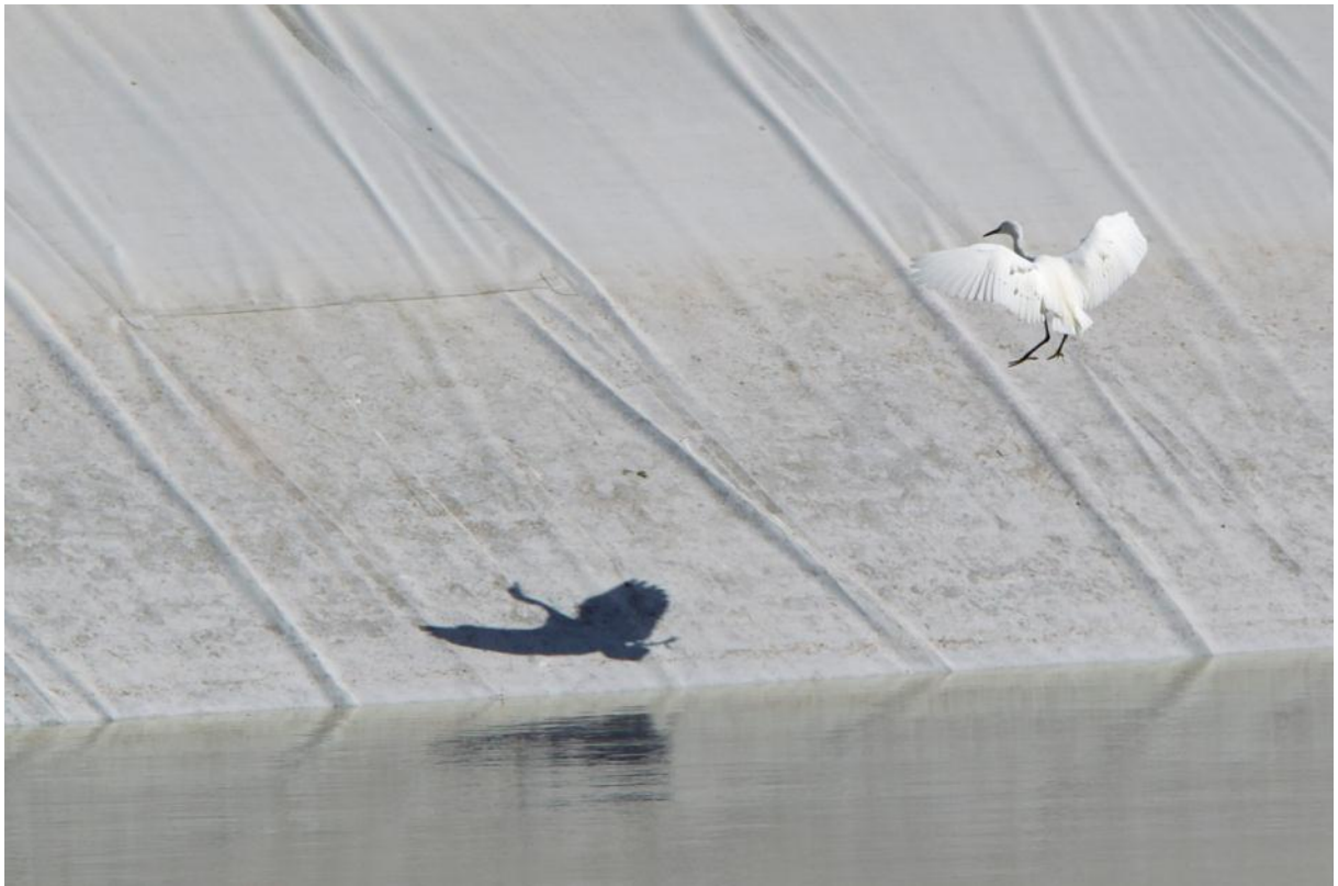
Little Egret, La Tabuna reservoir