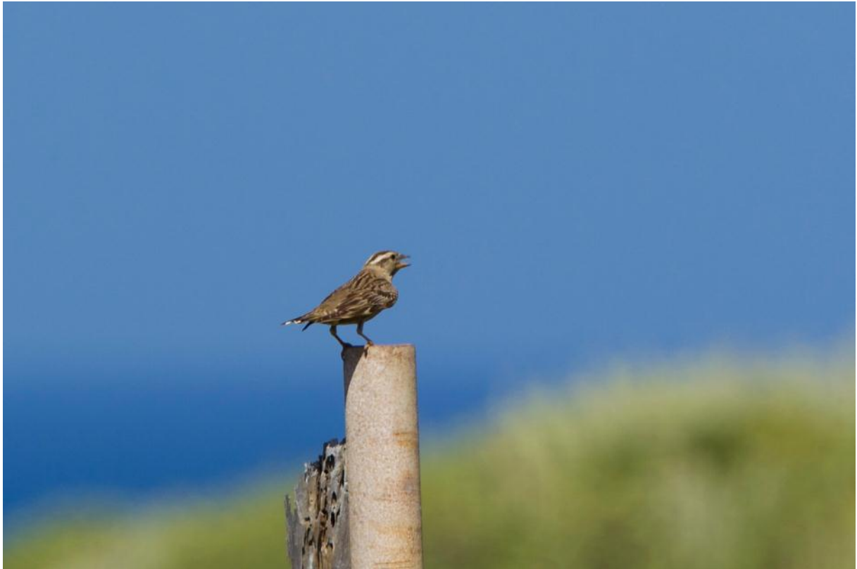
Rock Petronia, Punta del Teno

53. Rock Petronia Stensparv (Petronia petronia) (2 sightings, 202 ind) 2 Vilaflor 21-2, 200 Punta del Teno 23-2