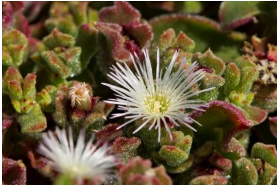
Canary Island Milkweed ( Euphorbia balsamifera )