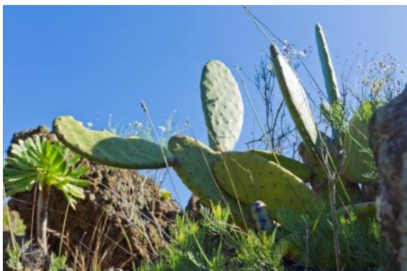
Indian Fig Opuntia ( Opuntia maxima ) Tamaimo 21-2