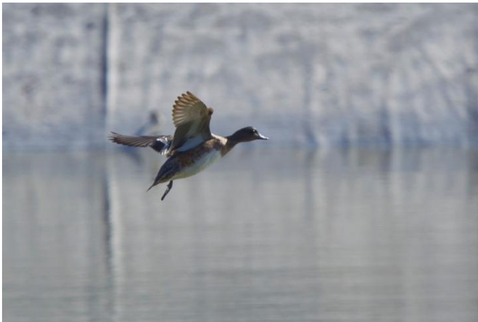
American Wigeon, Tabuna reservoir