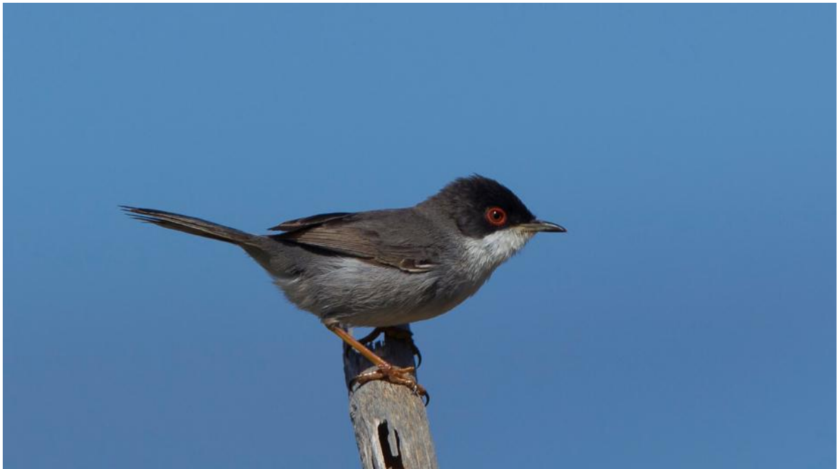
Sardinian Warbler, Punta del Teno