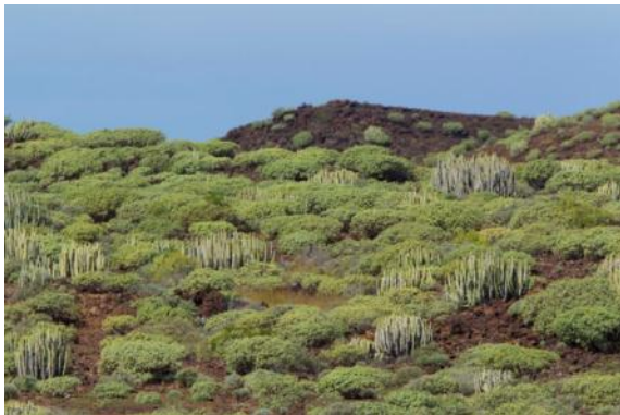
Almond ( Prunus dulcis )