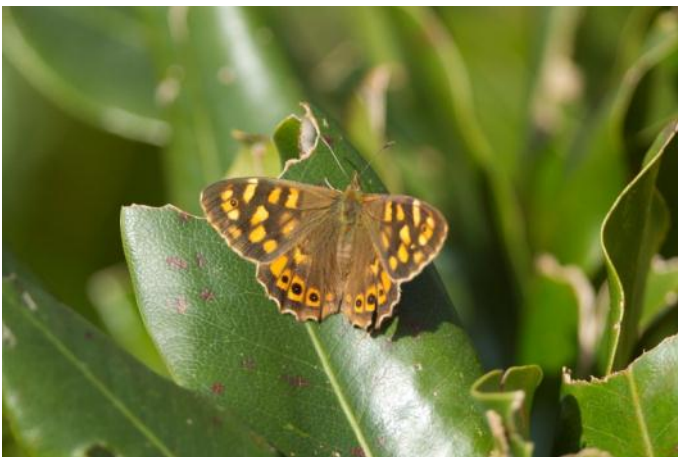
Canary Speckled Wood, Mirador de Pico Inglés

Canary Speckled Wood Vitbandad kvickgräsfjäril (Pararge xiphioides) (1 sightings, 1 ind) 1 imago/adult Mirador de Pico Inglés 20-2