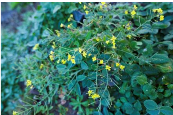
Brassicaceae ( Brassicaceae ) Punta de Fraile 23-2