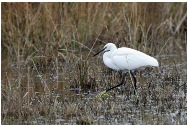
Little Egret, Albufera