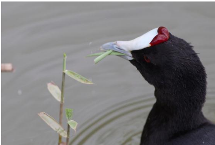
Red-knobbed Coot, Albufera