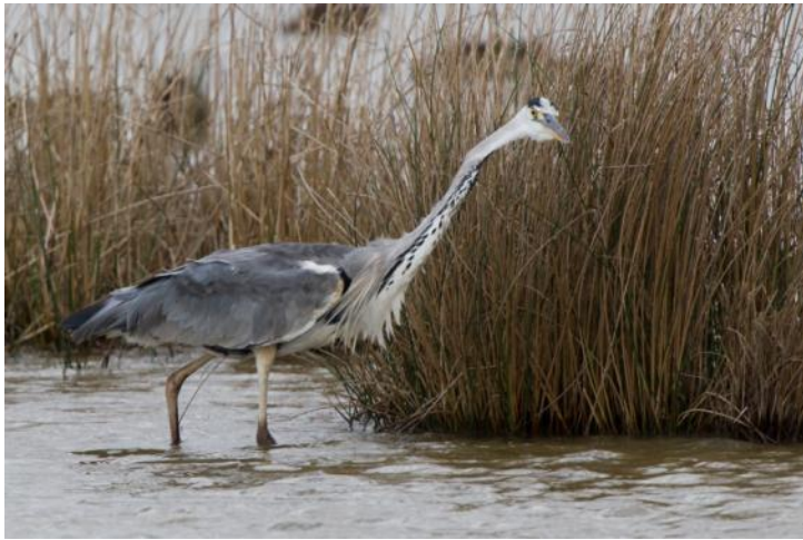
Grey Heron, Albufera