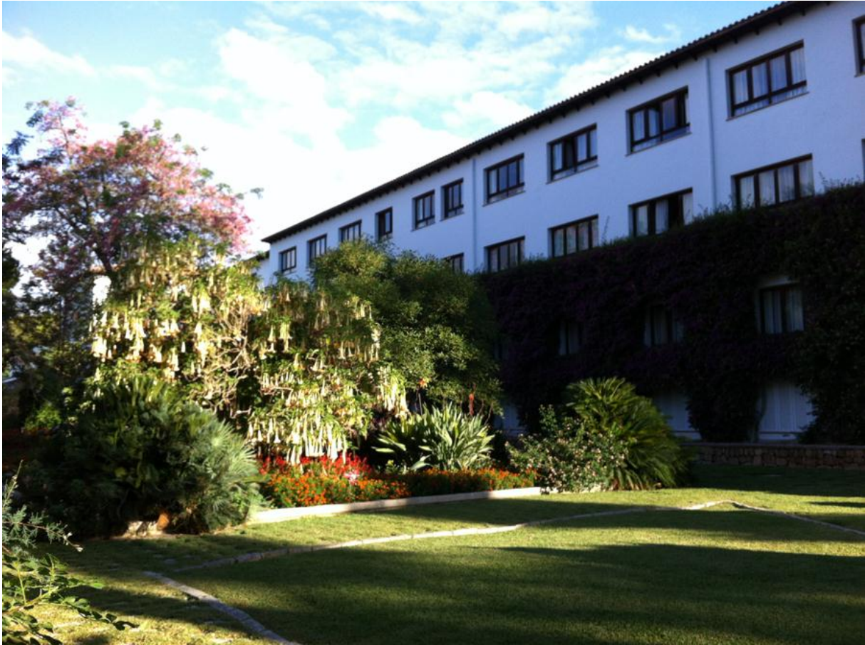
Barcelo Hotel Formentor