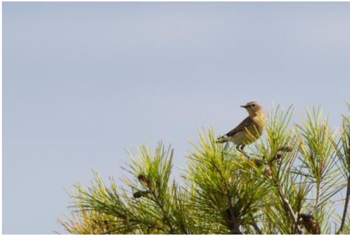
Northern Wheatear, Portals Vells

Probably a bird on migration. New on my Spanish list!