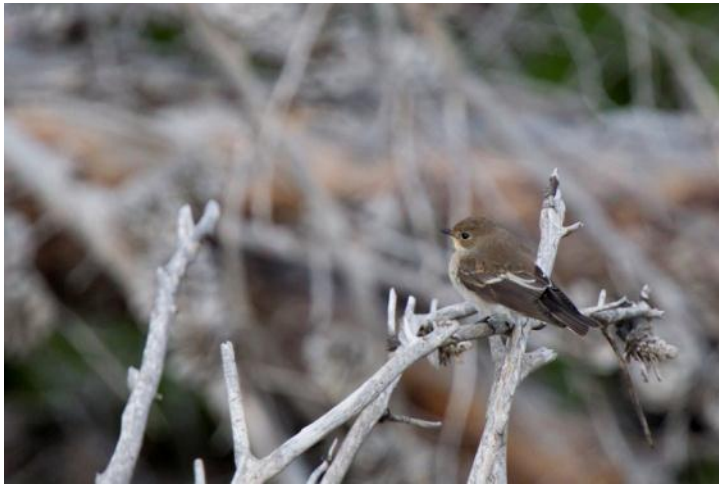
European Pied Flycatcher, Cap Formentor