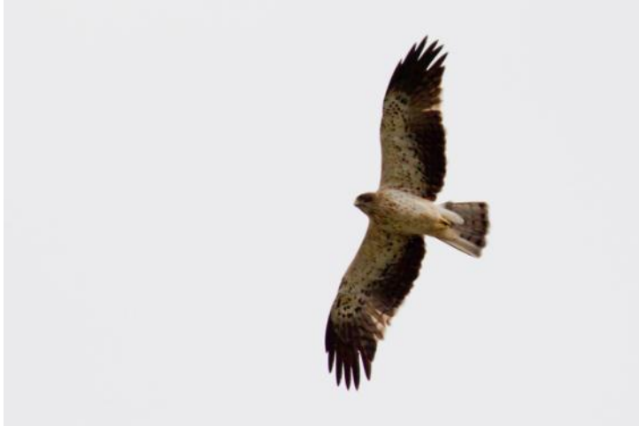
Booted Eagle, Pollença

Nearly daily observations of an adult light phase bird near our hotel.