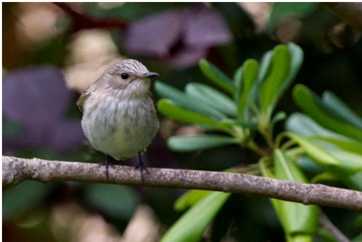
Spotted Flycatcher, Barcelo Hotel Cap Formentor

1 Barcelo Hotel Formentor 28-9, 1 Albufera 28-9, 1 Cases de Ca's Garriguer 29-9, 1 Boquer Valley 30-9, 1 Barcelo Hotel Formentor 1-10, 1 Portals Vells 1-10