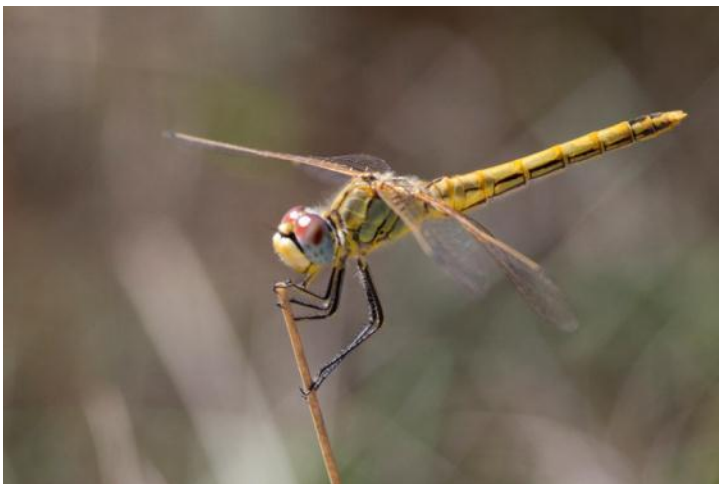
Red-veined Darter, Portals Vells