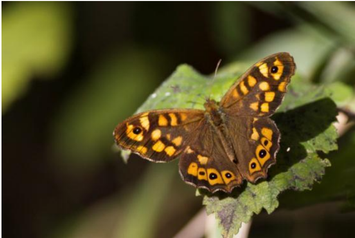
Wall Brown, Albufera