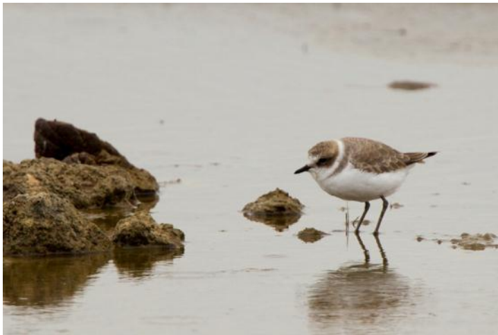
Kentish Plover, Albufera