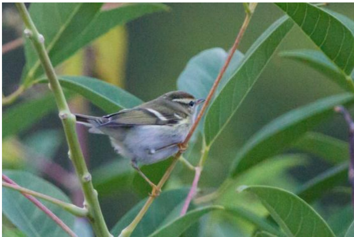
Yellow-browed Warbler, Barcelo Hotel Cap Formentor