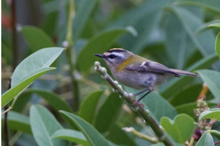
Firecrest, Barcelo Hotel Cap Formentor