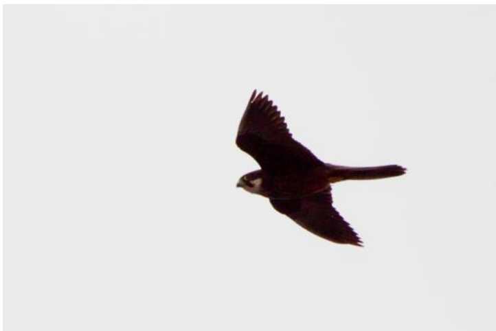
Eleonora's Falcon, Cap Formentor

Not uncommon along the western shore of Sierra de Tramontana. Very good observations near the light house at Cap Formentor.