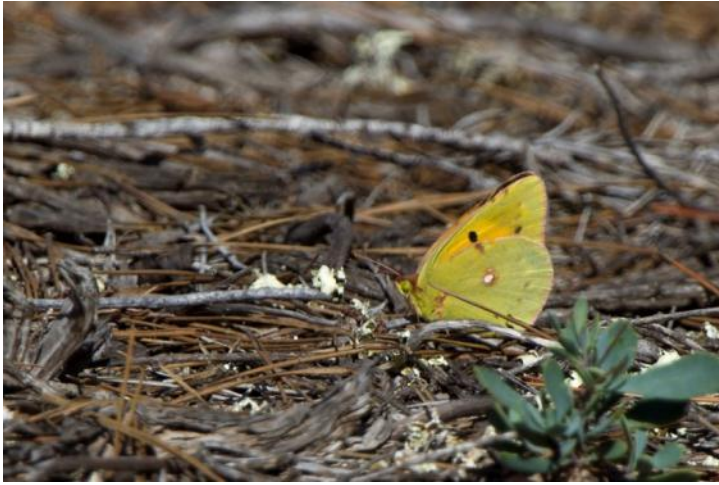
Clouded Yellow, Portals Vells