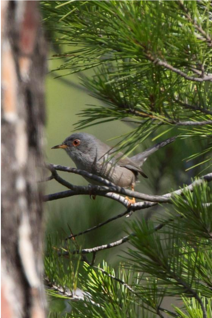
Balearic Warbler, Potals Vells

Quite unexpectedly a few birds were seen in quite sparse pine forest at Portals Vells. The observations on our last visit were in more open landscape.