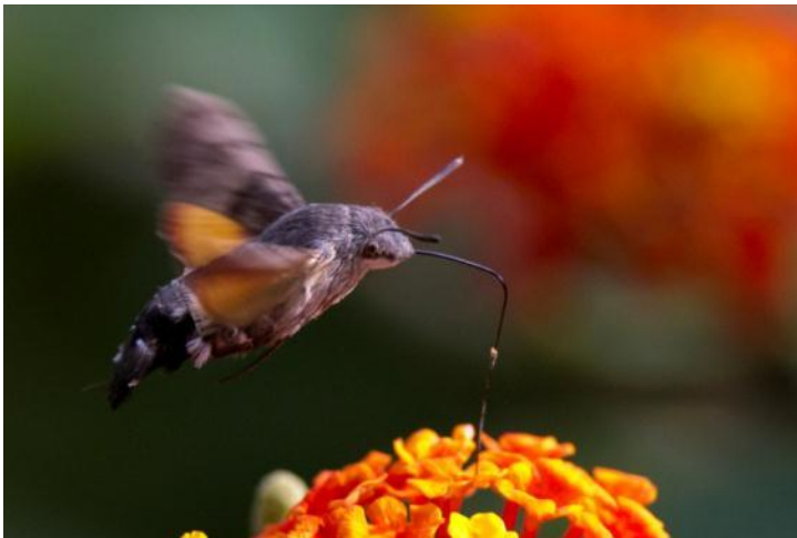
Hummingbird Hawk-moth, Barcelo Hotel Cap Formentor