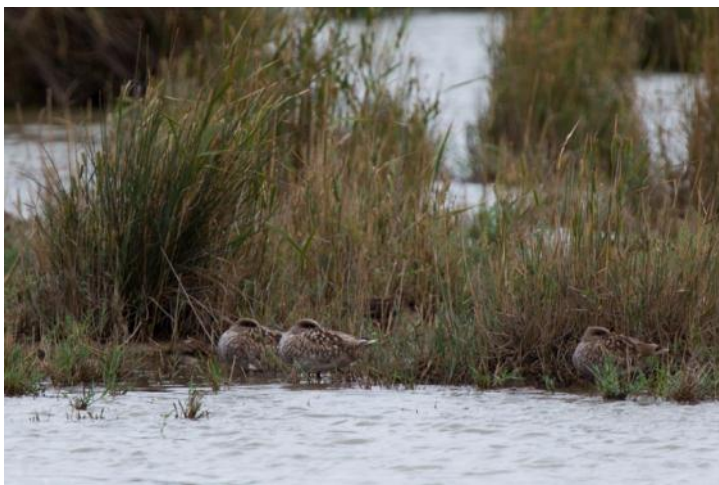
Marbled Teal, Albufera