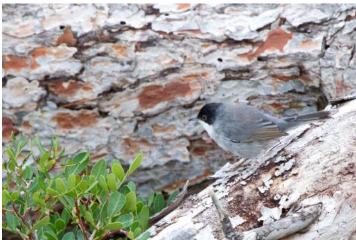
Sardinian Warbler, Cap Formentor