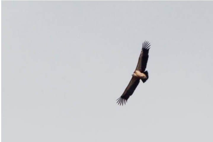
Eurasian Griffon Vulture, Panta des Gorg Blau

Highly unexpectedly one bird was seen and photographed at Embalse de Bleu. After some googling I found out that the species colonized Mallorca very recently. In 2008 a group of young birds arrived from nearby Menorca. 2009 about 50 individuals linger on Mallorca, but no breeding confirmed yet.