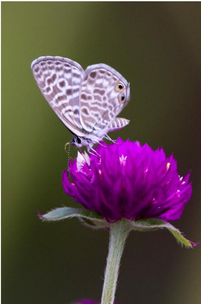
Lang's Short Tailed Blue, Barcelo Hotel Cap Formentor