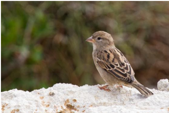
House Sparrow, Cap Formentor

10 Barcelo Hotel Formentor 27-9, 10 Barcelo Hotel Formentor 28-9, 2 Cap Formentor 29-9, 1 Boquer Valley 30-9, 15 Barcelo Hotel Formentor 1-10