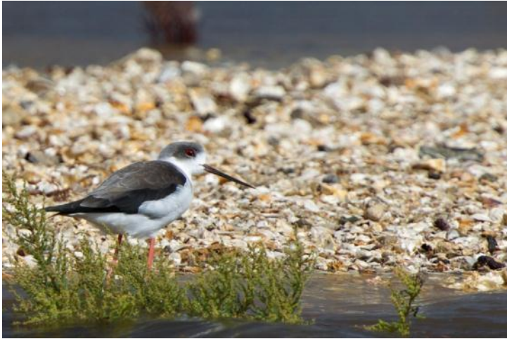
Black-winged Stilt, Albufera