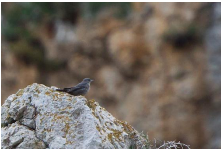
Blue Rock-Thrush, Boquer Valley