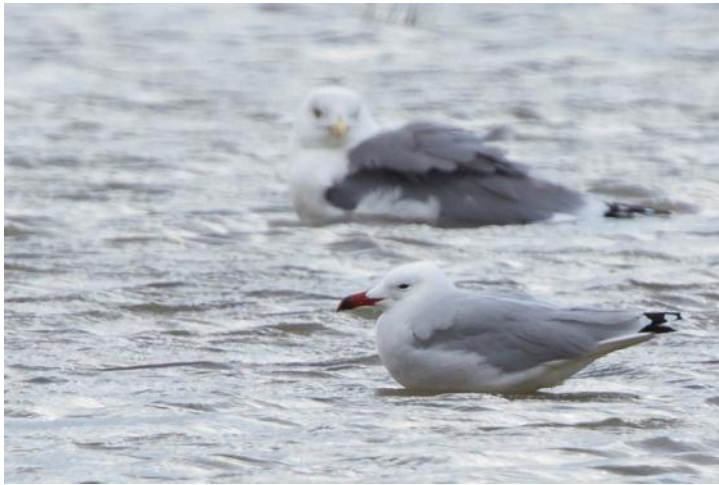
Audouin's Gull, Albufera