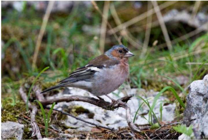
Common Chaffinch, Escorca