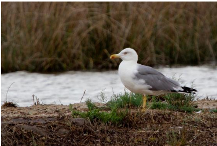
Yellow-legged Gull, Albufera