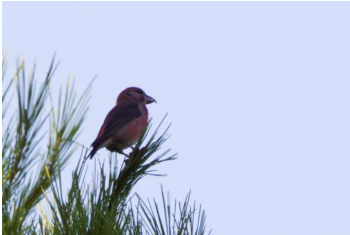
Red Crossbill, Barcelo Hotel Formentor

1 Barcelo Hotel Formentor 28-9, 2 Barcelo Hotel Formentor 29-9, 2 Barcelo Hotel Formentor 29-9, 3 Barcelo Hotel Formentor 1-10, 2 Portals Vells 1-10