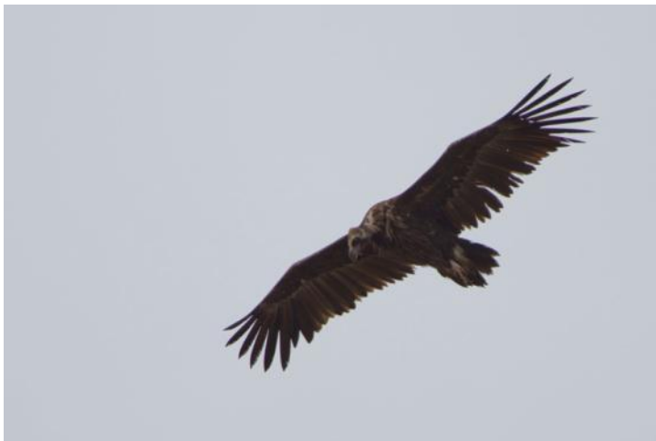
Cinereous Vulture, Sierra de Tramontana

Very close observations in drizzly weather. When seen later in better weather the observations were much more distant.