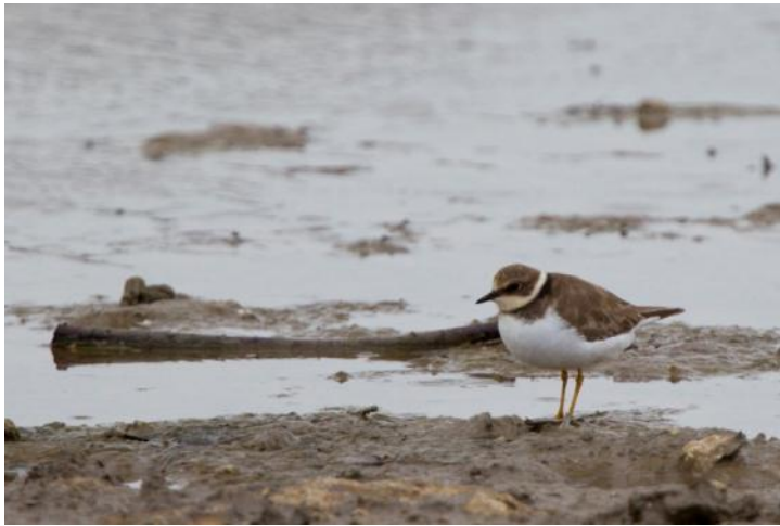
Little Ringed Plover, Albufera