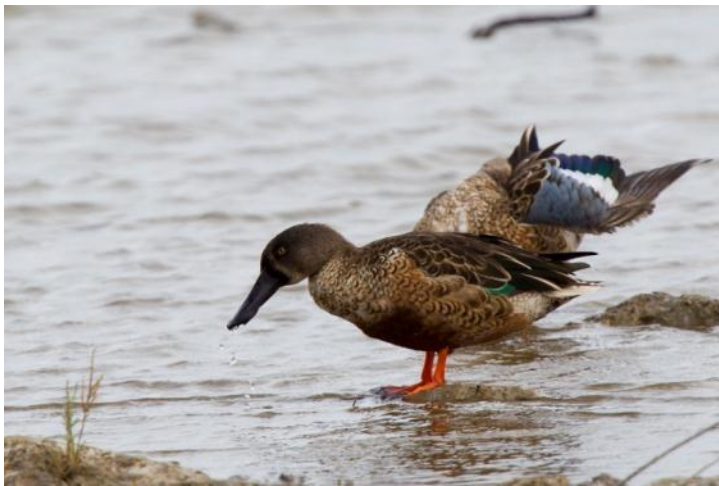
Northern Shoveler, Albufera