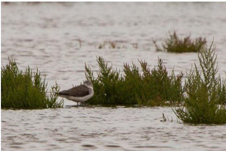
Common Greenshank, Albufera