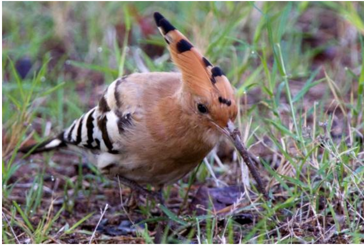
Eurasian Hoopoe, Barcelo Hotel Formentor