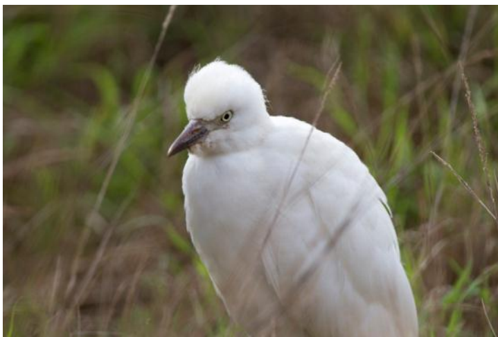
Cattle Egret, Albufera