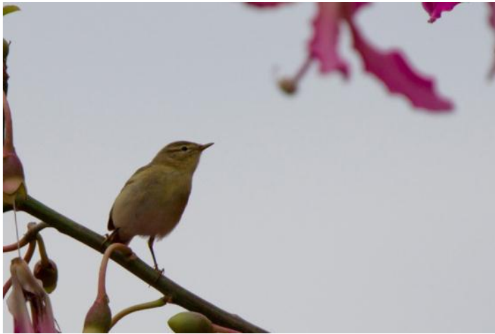
Common Chiffchaff, Barcelo Hotel Cap Formentor