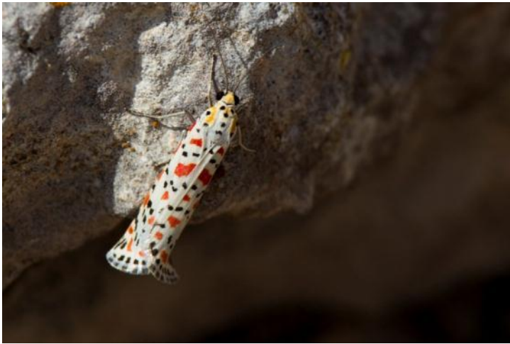
Crimson-speckled Flunkey, Portals Vells