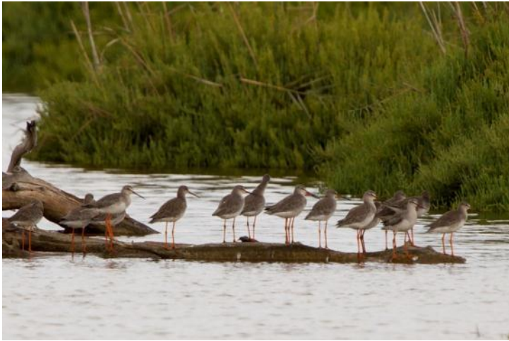
Spotted Redshank, Albufera