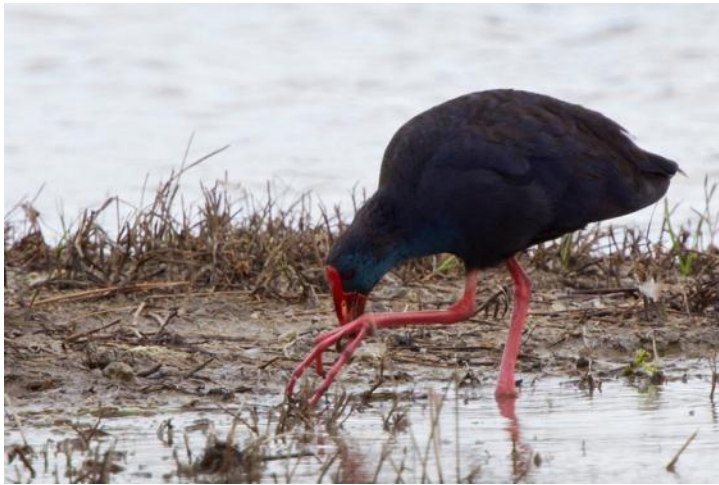
Purple Swamphen, Albufera

Just two birds seen at distance at Albufera on our first visit. Better views on the second visit and much more approachable.