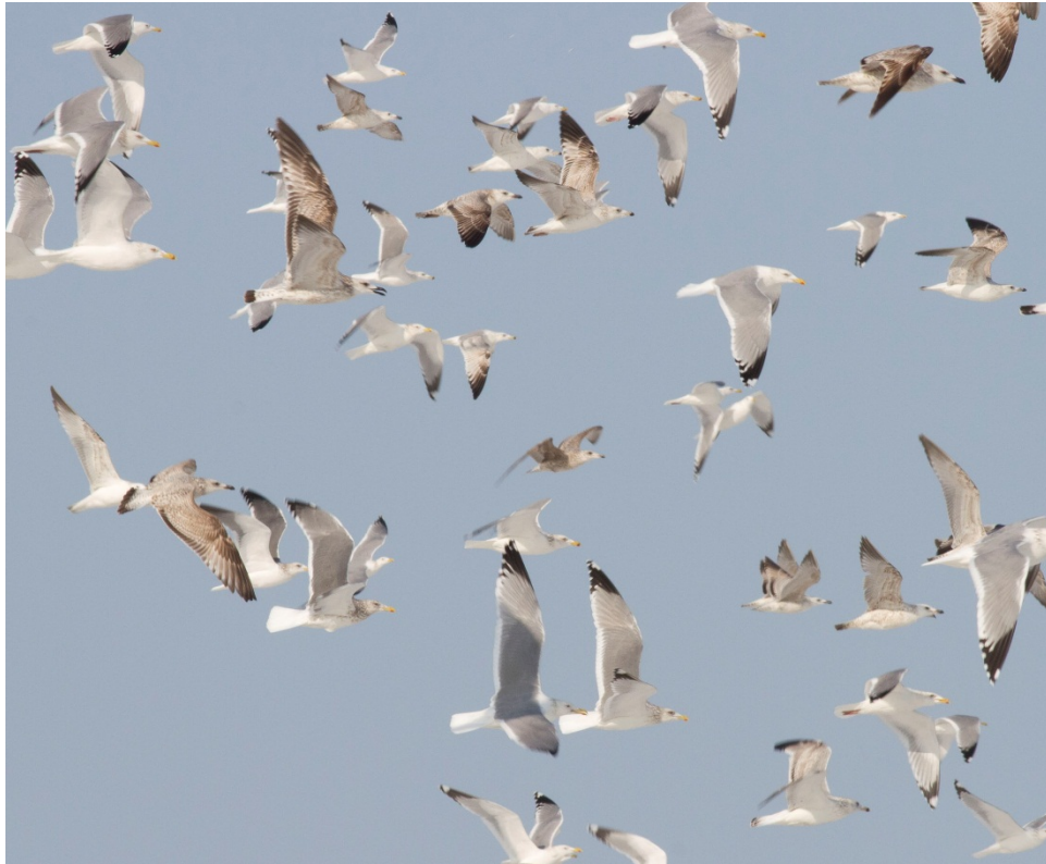
The gulls around Jinzhou Landfill were one of the undoubted highlights of the trip.

We also recorded four Globally Threatened species as defined by BirdLife International and five others considered Near Threatened. VU = Vulnerable and NT = Near Threatened. More details of all nine of these are repeated here -