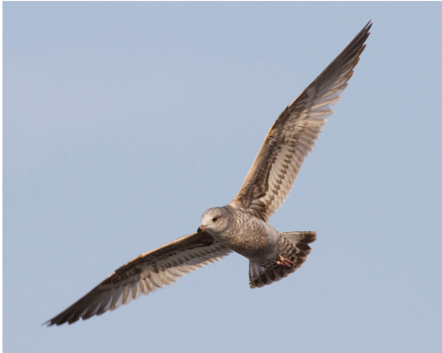
A marked first-winter L. c. kamtschatschensis near Jinzhou Landfill on 25 January.

345 in Zhuanghe on the 28/1/2012. 340 of these were at the Xiaotangfu cun, Dazheng 'Relict Gull site' while the other five were seen from the Zhuanghe to Shicheng Dao & Dawangjia Dao ferry. Four of the latter, including two first-winter heinei & another first-winter that showed some characters of kamtschatschensis were in & around Zhuanghe Port itself, while the fifth bird, an adult was on Dawangjia Dao. 20, including eight first-winter heinei & one first-winter kamtschatschensis , near Jinzhou Bay refuse dump on the 29/1/2012. 31 near Jinzhou Bay refuse dump on the 30/1/2012. Mostly first winters there were 16 heinei & one well marked kamtschatschensis .