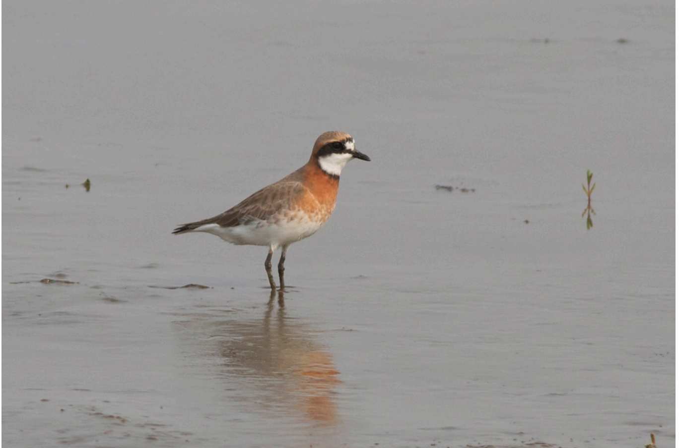
Lesser Sand Plover, Donggang.