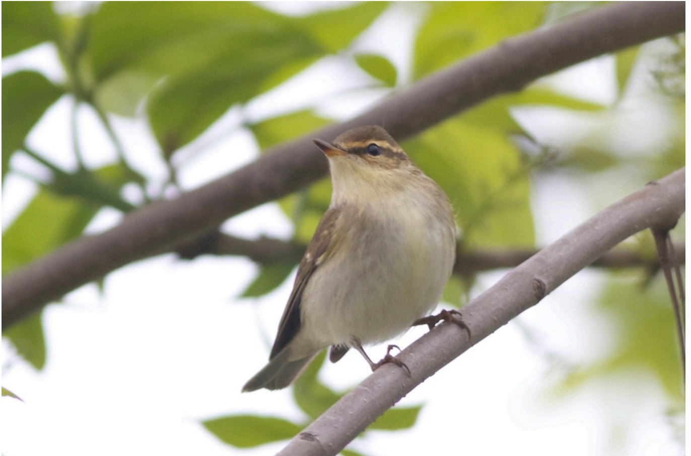
Kamchatka Leaf Warbler, 12 May 2012. Note the yellowish wash to the throat and central breast and the buffy supercilium.