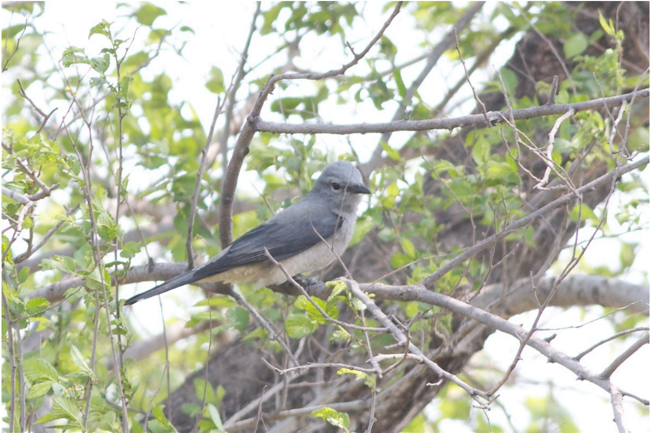
Black-winged Cuckooshrike, Donggang, 11 May 2012 (the first Liaoning record).

In flight there were small whitish wing flashes (that were reminiscent, but much less conspicuous, of those of Chinese Grey Shrike Lanius sphenocercus or Northern Mockingbird Mimus polyglottos ) on the outer primaries of both wings. With the examination of photographs it could be seen that these patches were formed by sharply demarked rectangular white patches covering almost the basal half of the inner web of several outer primaries (primaries 2-5). These patches, occasionally conspicuous in flight, were never seen at rest and were largest on primaries three and four. Again from examination of flight photographs it could be seen that the inner webs of most of the bird's primaries (and even some of its secondaries) were bluish-grey.