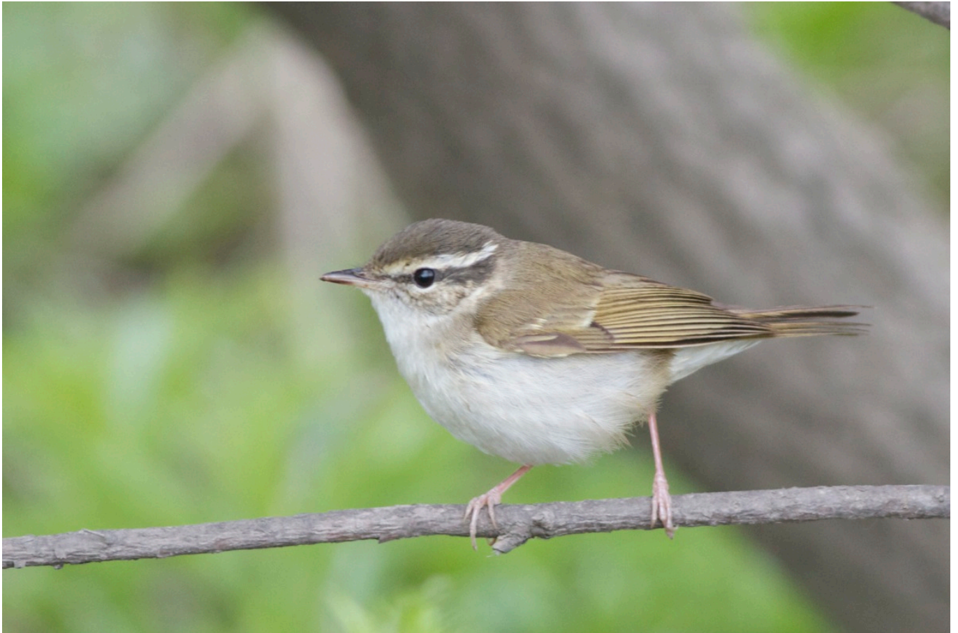
Pale-Legged or Sakhalin Leaf Warbler, Donggang, 13 May 2012.