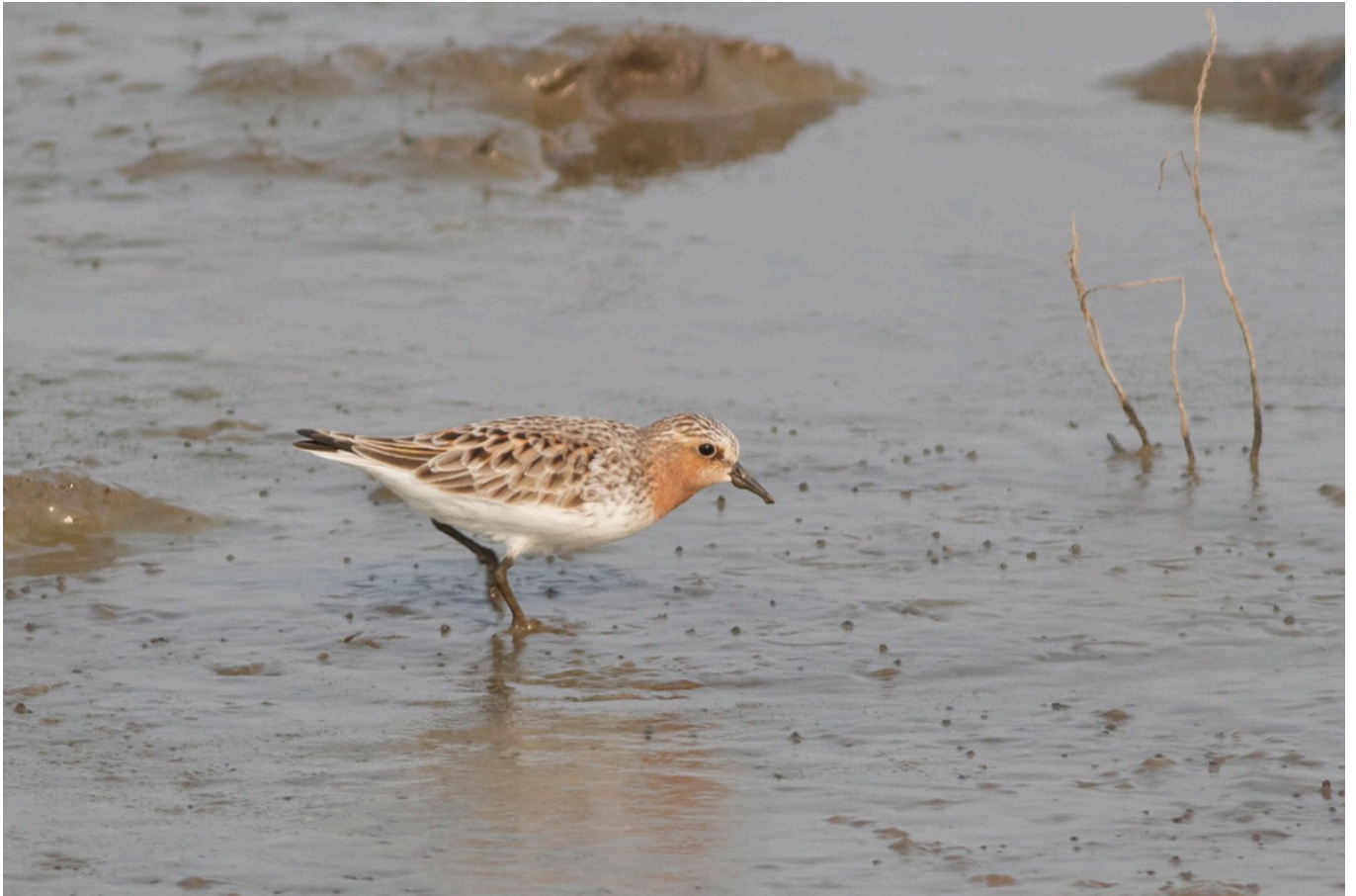
Red-necked Stint, Donggang.