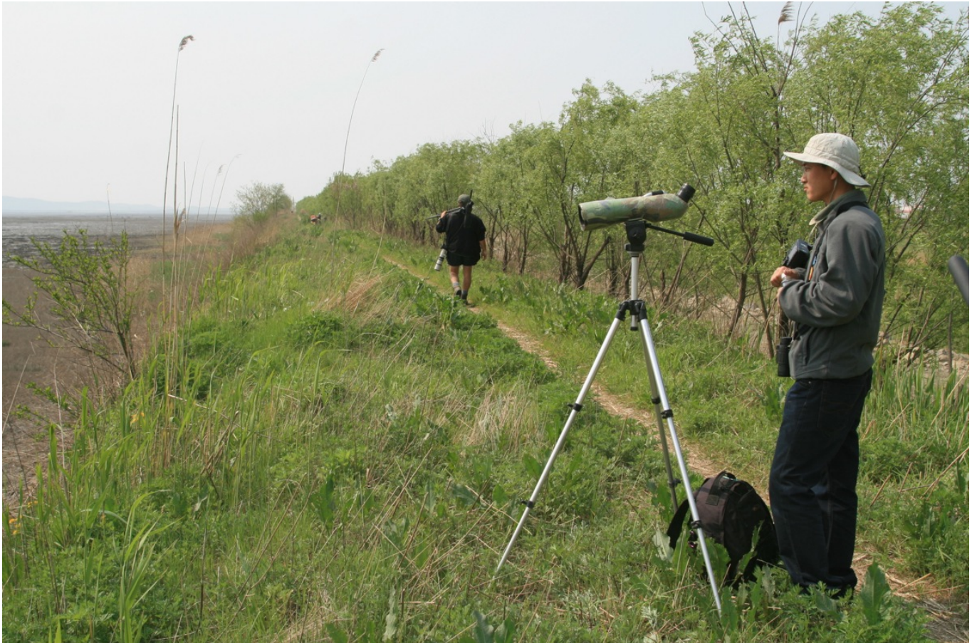
The hedge along the western embankment of the Yalu River (Yalu Jiang). Great for passerines.

We did just as we'd done on our two previous visits – walked up the river embankment almost to the end before swinging off inland and exploring the small patches of young trees (a small forest nursery) about 50 metres in from the river. It is then possible to re-join Bin Hai Lu at about kilometre 56.