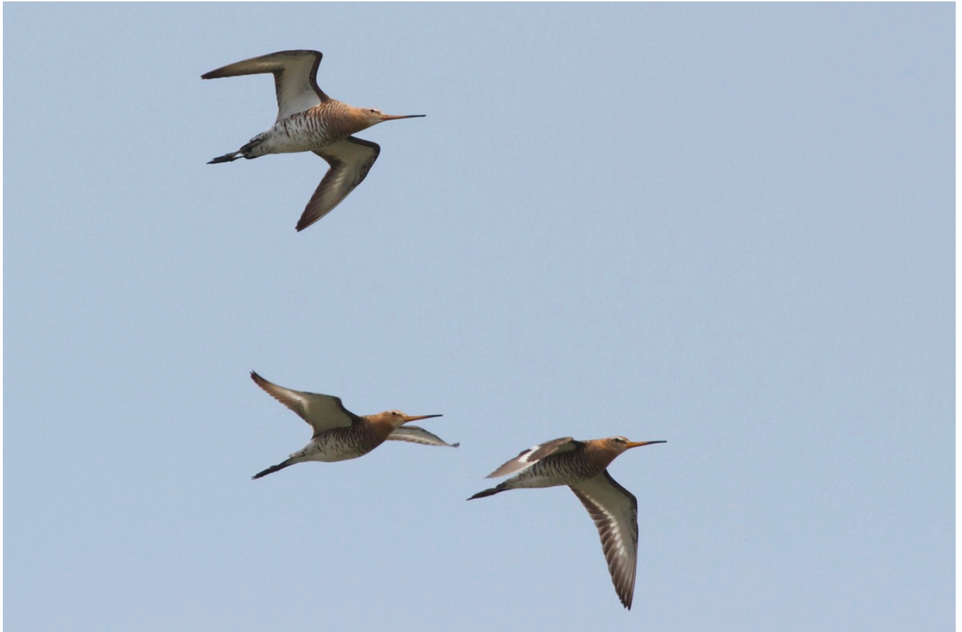
‘Eastern’ Black-tailed Godwits, Donggang.