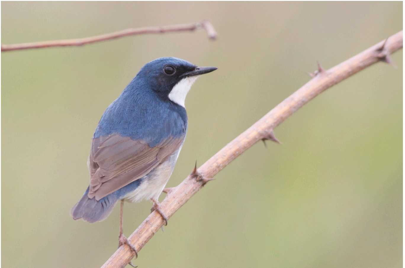
Siberian Blue Robin (1 st summer male), Donggang.

1 adult male flew north over the Ash Ponds, Donggang on the 9/5/2012. 2 at the Ash Ponds, Donggang on the 9/5/2012. 1 at the Ash Ponds, Donggang on the 9/5/2012. 1 female at the Ash Ponds, Donggang on the 9/5/2012. 17 around Donggang on the 9/5/2012 with 15 near the Ash Pond (Qu Hui Zi or Da Shi Tang) & two at 'Site 2'. 1 at the Ash Ponds, Donggang on the 9/5/2012.