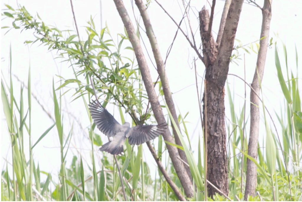
Black-winged Cuckooshrike showing the white panels in the wings, seen flight but not always obvious.

Cai (1987) considered Black-winged Cuckooshrike to be a vagrant to Beijing and had just one specimen - a female intermedia collected 'east of Beijing' on 30 October 1956. He surmised that it might also be a summer visitor to the Capital but since his publication there's apparently only been one other sighting there – a single bird at Tiantan on 1/9/2007 (王玉琦, 王世和, 卢斌, 陈曦 & 晓白 via BirdTalker)