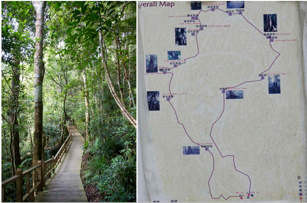
The Ming Feng Boardwalk is where we spent most of our time

There are numerous bi-lingual wooden signs throughout the trail's length – some indicating your current position on a map of the entire trail, others describing sites of particular interest such as particularly impressive trees, strangler fig or a particular geological features such as 'Ancestor Cave' while yet others give scientific names & identify a good many of the trail side trees.