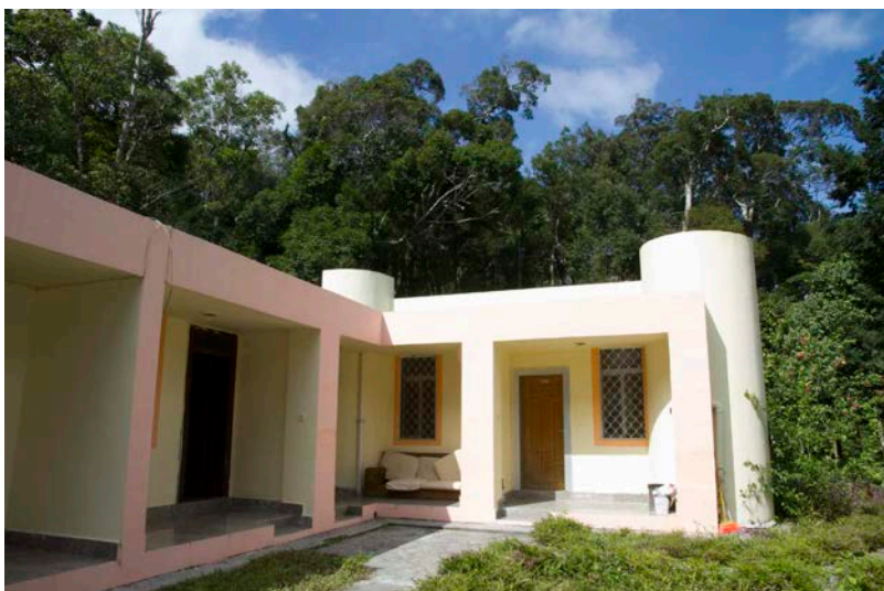
Our accommodation block at the Tianchi Resort, Jianfengling

There is currently a twice daily bus service from Haikou to Jianfeng town & this takes four hours. Somewhat surprisingly there is now no bus service from Sanya to Jianfeng town (this trip only takes between 1.5 & two hours in a taxi) and taxi drivers were asking 700 yuan for the one-way trip from Sanya to the Tianchi Resort. Note that the entrance gate to the park is only about 1.5 or two kilometres from the centre of Jianfeng town and is staffed 24 hours and that a one off fee of 40 yuan (down from 55 three years ago!) is payable here. From the entrance gate its about 13 kilometres up to Tianchi Lake and from there another three kilometres, or so, to the Tianchi Resort where we stayed. There are no proper taxis in Jianfeng town - just motorbike taxis where the passenger rides pillion and quite a few, perhaps marginally safer, local motorbike three-wheelers – rather like a motorbike with a make-shift side car attached. It is impossible to find any of these once you are inside the park itself so you should arrange with a driver to come and pick you up at the end of your stay.