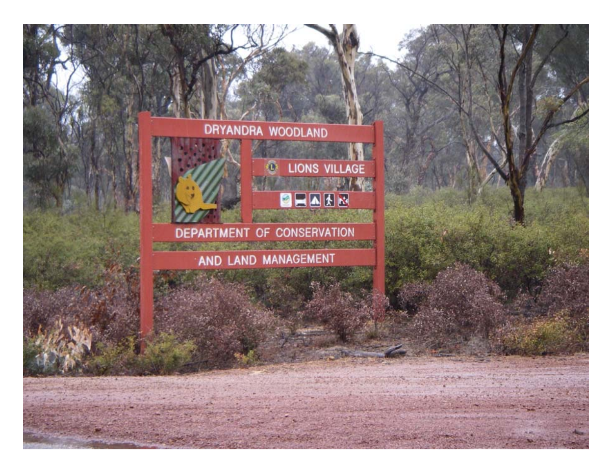
Photo 1. Sign to the Lions Dryandra Woodland Village and the State Forest.

several interesting tracks into the forest. Petrol and groceries are available in the nearby (26 km) Narrogin, at the heart of the SW Australia's southern wheat-belt.