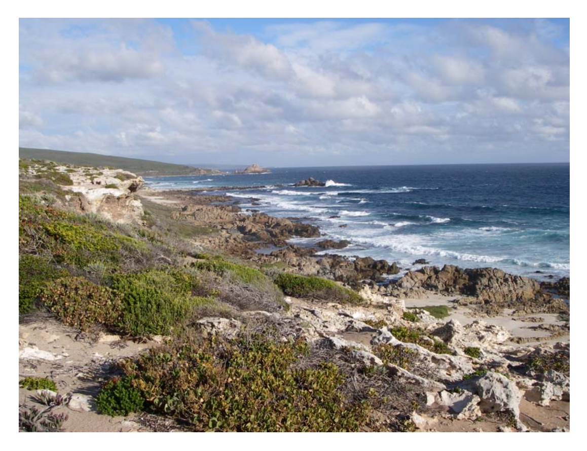
Photo 15. Cape Naturaliste coast, with Sugarloaf Rock in the background.

In Dunsborough, the only motel option is Best Western, with its overpriced rooms and doubtful chain operation character. Personally, I prefer to support local, independent businesses. The whole coast from Dunsborough to Geographe Bay has sadly been spoiled by generic second home production for well-to-do people from Perth, with almost complete loss of local character and a plenitude of 'posh' activities for the upper middle class: wine sipping (one needs to be a bit intoxicated to survive the weekends?), lodges, SUVs, golf, cafés, and trinket shopping. It is a replica of Perth suburbs and you could easily bore yourself to death. For a decent motel accommodation, you need to drive to Busselton, a few km towards Perth from Dunsborough. I stayed in a place with character, Motel Restawhile, for AUD 65. At Geographe Bay, there are still wetlands with abundant birdlife, but as the second home development project advances, these may soon become disturbed.