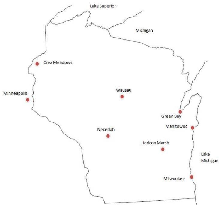
Map above: Wisconsin

Sep 16: After the car is delivered back to the car-rental office I still have some time left so I take a walk eastwards from the hotel. The morning is calm and clear and there is good activity among the birds, mainly because of the adult Coopers Hawk that is sitting in a dead tree. Close to some American Robins in a tree sits a green bird that I first can't identify but soon I realize that it is a young Scarlet Tanager . East of the industrial area is a small village. Here I find at least 10 Eastern Bluebirds and many Chipping Sparrows along a meadow. Near a big house I hear harsh warning sounds. It is three House Wrens , jumping around a cat. In the field nearby walk eight Wild Turkeys . This small walk from the hotel has produced three new lifers for me, a very nice end of this Wisconsin birding!