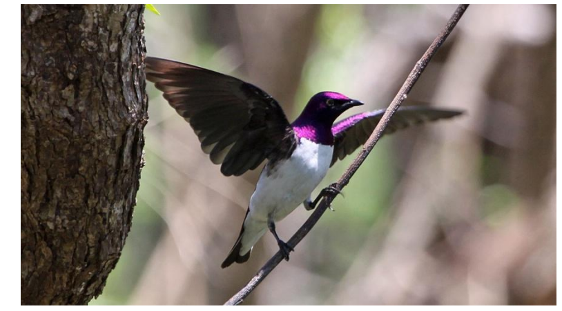
Violet-backed Starling alarming for a green snake...

Animal- and bird wise the reserve was good but maybe also slightly disappointing. We did find a Leopard ourselves while it was slowly crossing the road just in front of our car early evening and we also saw some new really nice bird species (like Neergaard's Sunbird and Pink-throated