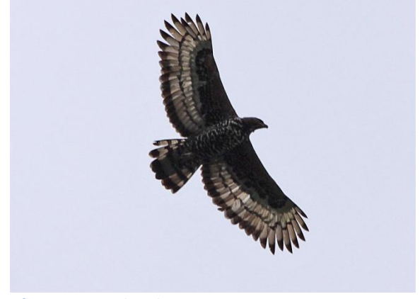
African Crowned Eagle

Chacma Baboon, Vervet Monkey, Samango Monkey, African Elephant, Burchell's Zebra,