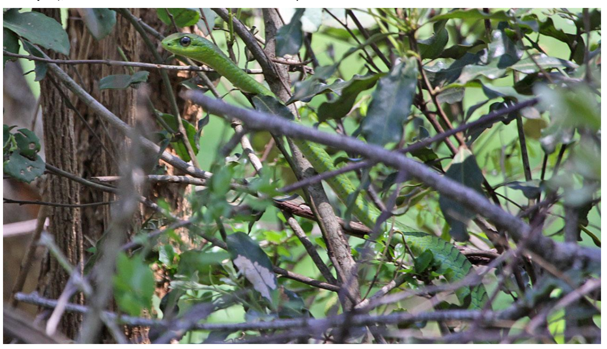
The cause of the alarm - a young male Boomslang (Dispholidus typus)

Adding to this, Mkhuze was the only place on the whole trip where the weather gods was not on our side - although we had decent weather during the morning game drives, we had some really heavy raining in the afternoons and evenings.