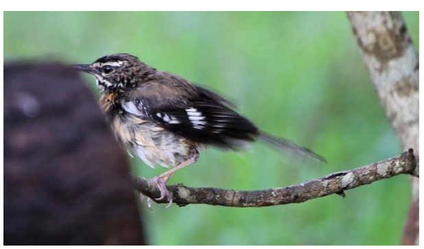
Bearded Scrub-Robin (a very wet one)

In spite of what's written above, we don't regret at all visiting the Mkhuze GR!