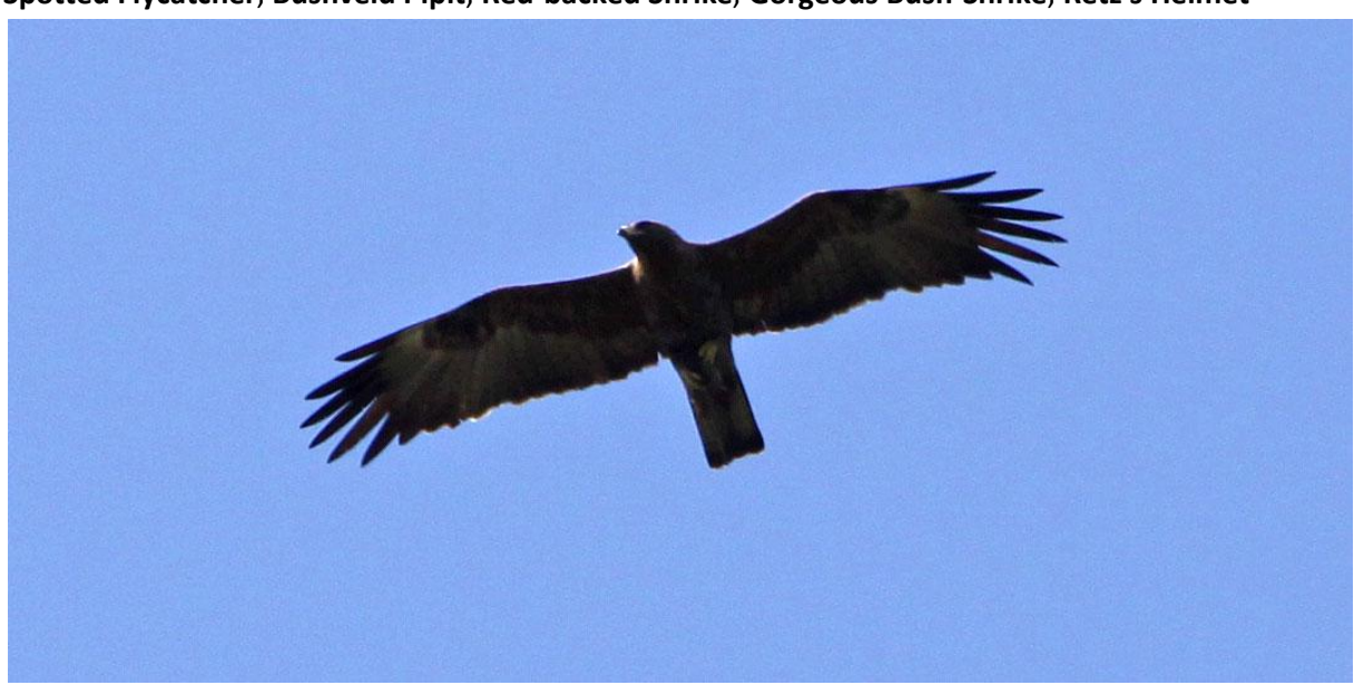
Wahlbergs's Eagle (with prey in its talons)

Spotted Flycatcher, Bushveld Pipit, Red-backed Shrike, Gorgeous Bush-Shrike, Retz's Helmet-