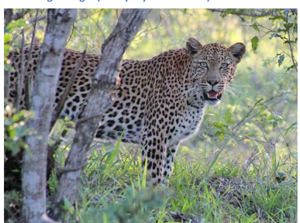
Leopard in Mkhuze

Shrike, Violet-backed Starling, Red-billed Oxpecker and Purple-banded Sunbird.