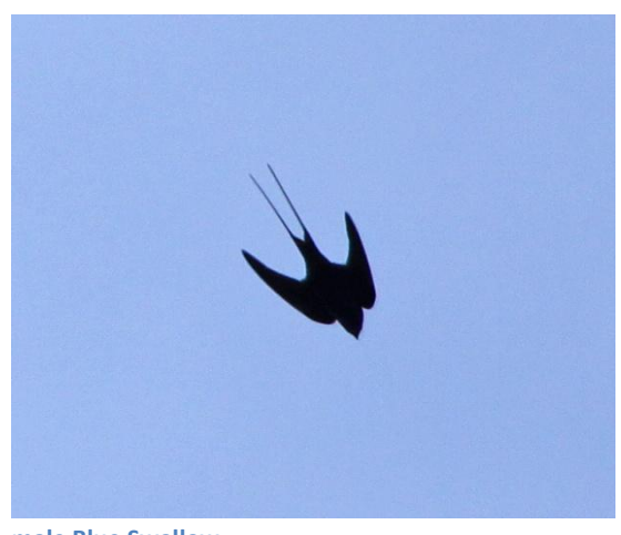
male Blue Swallow

Highover was really fantastic and also offered very good accommodation - we stayed in the Lodge. We were so very well looked after by the owners Dave and Margie Edwards. They were extremely nice and served us with lunch, snacks, diner, wine, advice, game drive and much more!