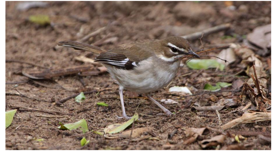
Brown Scrub-Robin along the iGwalagwala Trail

Other noteworthy species in St Lucia area: