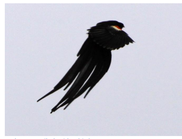
male Long-tailed Widowbird

Southern Bald Ibis, Long-crested Eagle, African Olive Pigeon, Dark-capped Yellow-Warbler, Southern Red Bishop, Long-tailed-, Red-collared- and Fan-tailed Widowbirds, Pin-tailed Whydah, Brimstone-, Yellow-fronted- and Cape Canaries.