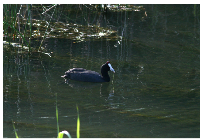
Red-knobbed Coot, Fulica cristata, Albufera