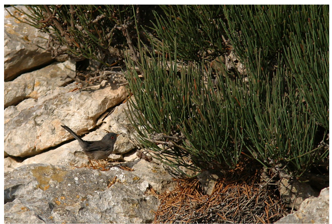
Balearic Warbler Sylvia balearica, at KM17, Cap de Formentor