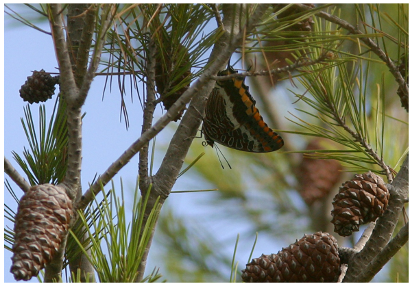
Two-tailed Pasha Charaxes jasius, Ermita de Betlen