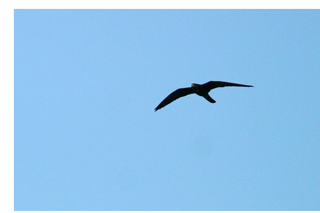
Eleonora's Falcon Falco eleonorae, black phase, Cap de Formentor