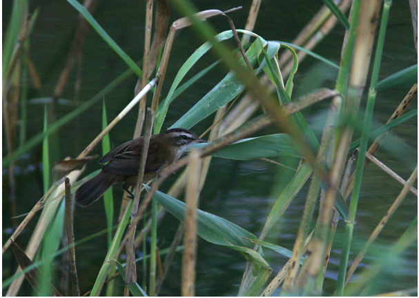
Moustached Warbler, Acrocephalus melanopogon, Albufera