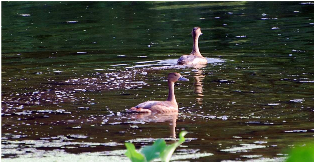
Lesser Whistling Ducks in the Lanai Pond.

1 Pantai Tengah 8/1, 5 Pantai Tengah 9/1, 150-180 Bonton Reedbeds 10-11/1 and 7 Lanai pond 14/1.