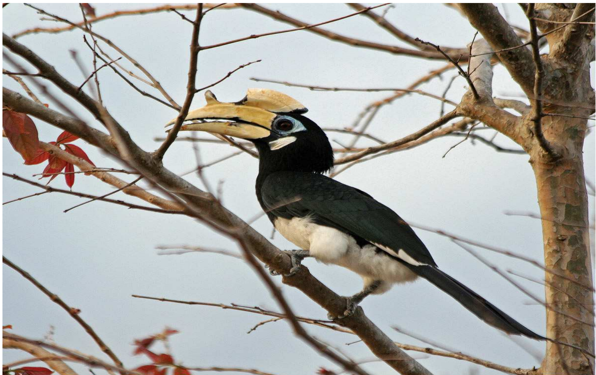
Oriental Pied Hornbill in Kuah public park.

Common. Up to 20 seen around Pantai Tengah and Malai Jetty. Also seen around Datai, Gunung Raya and in the public park close to Legenda Park near Kuah Jetty. Langkawi must be one of the easiest places in south-east Asia to see this species.