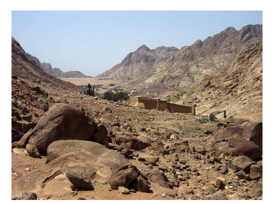
St Katherine monastery.