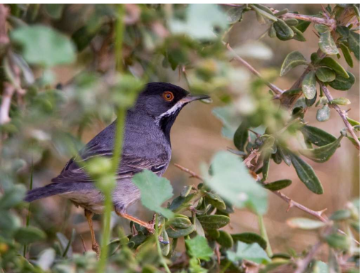
Male Rueppell's Warbler Cultivation 52 km NW of St Katherine 6th.