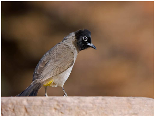
White-spectacled Bulbul Feiran 5th.

Only seen on Sinai peninsula. 5 Feiran 5th, 1 St Katherine monastery 6th, and 5 Cultivation 52 km NW of St Katherine 6th.