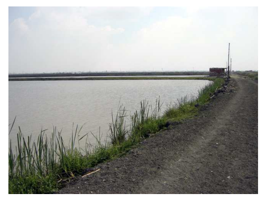
Abbasa fish-ponds. Photo SC.

It took us a little less than one hour to reach the Abbasa area (c. 25 km). Due to our printed Google aerial maps we easily found the fishponds east of Abbasa village and parked where the road crosses a small canal (30°32'20.95"N, 31°44'2.93"E). We birded in the area until early afternoon and when driving back we by pure luck found a Senegal Coucal in the small village of Baalwa. The locals were a little bit worried over our presence, but eventually we were accepted and were even offered tea, which we accepted! At first we were "interrogated" by the local English teacher but this ended in a very interesting discussion on Egypt and educational systems! After this we headed back to Zagazig for a second night at the Marina hotel.