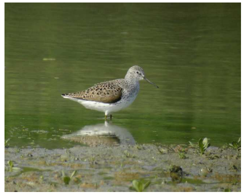
Marsh Sandpiper Abbasa 9th.