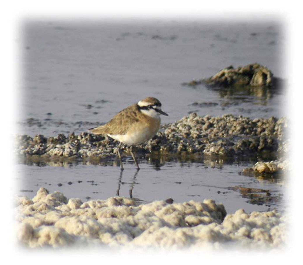
Kittlitz's Plover Al Buhyarah, Wadi Natrun 8 April. Photo SC.