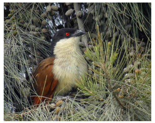
Senegal Coucal Baalwa 9th.

1 discovered in Stone Pine ( 30°32'53.96"N, 31°51'44.66"E) Baalwa 9th. Also displaying and photographed before flying off, 1 heard Abu Hammad 10th, 1 heard at the same place as for the Southern Grey Shrikes Tell el Kebir 10th, and 3 displaying (two ♂s 800 m N of the bridge at the canal and one ♂ 100 m S of the bridge at the canal) Abbasa 10th.