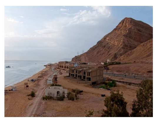
Ain Sukhnah.

which we didn't succeed in. It ended with a sleep in the car at a very good lay-by (30°23'41.54"N, 30°22'28.52"E) with some restaurants and petrol station in Wadi Natrun city along the A1 road between Cairo and Alexandria. Observe that Wadi Natrun city (near the A1 road) is wrongly labelled Sadat city in Google Earth! We first tried to sleep in the car at Al Buhayrah, but were very much disturbed by some locals so we had to move on. We also experienced some difficulties to find the place due to the closing of the normal turnings from the A1 road (see below). In Wadi Natrun city an Egyptian tried to cheat us when filling petrol as well as someone else that wanted to "help" us by fixing a room for a very high cost.