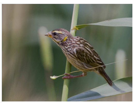
Streaked Weaver Abbasa 10th.

4 (1 pair + 2 \bigcirc ) Alqam 8th, 4 (1 \bigcirc + 3 \bigcirc ) in small reeds on both the southern and northern side of the bridge on the eastern side of the canal east of Abbasa 9th, and 25 at the same spot as the Red Adavats Abbasa 10th.