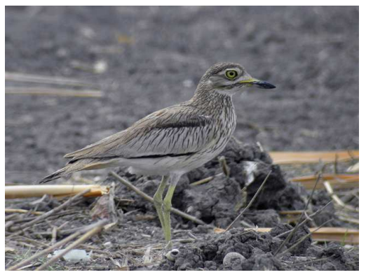
Senegal Thick-knee Abbasa 9th.