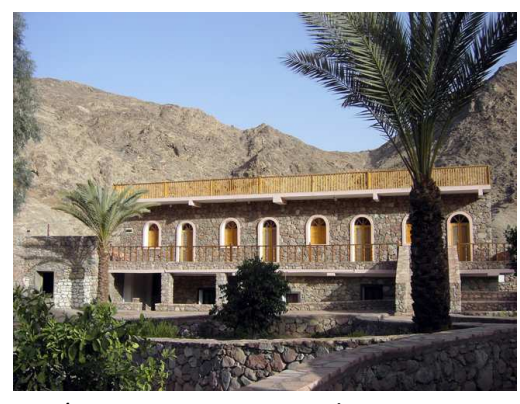
Nun's Monastery, Feiran.

hard to hear Hume's Owl, using play-back from many places along the village. There are a few records from the village some years ago.