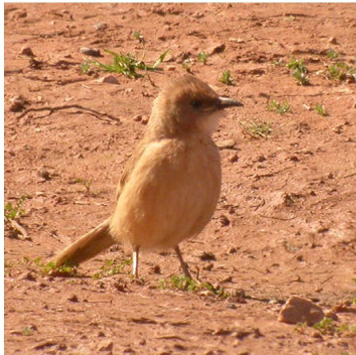
African Desert Warbler south of Auberge Kasbah Said and Fulvous Babbler west of Errachidia.