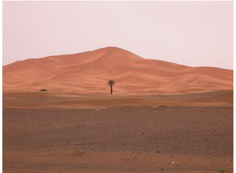
Sand dunes in Erg Chebbi.