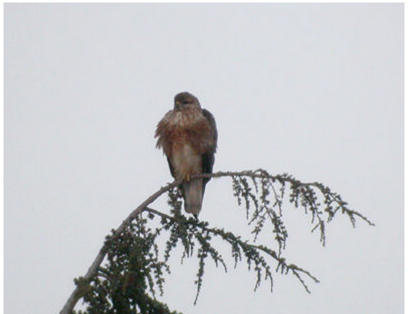
Long-legged Buzzard near Fôret de Cedres.