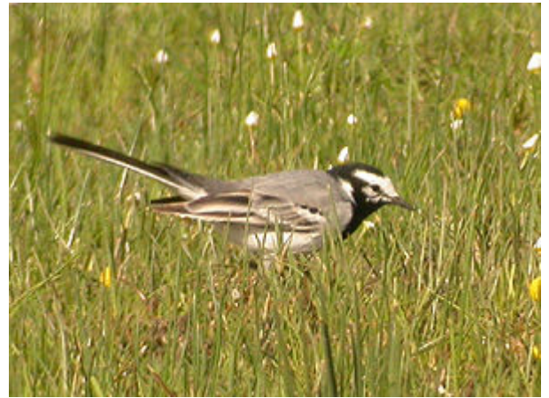
Moroccan White Wagtail, Oued Loukkos.

133. White Wagtail Motacilla alba alba Singles seen every day in all possible habitats. Common most days.