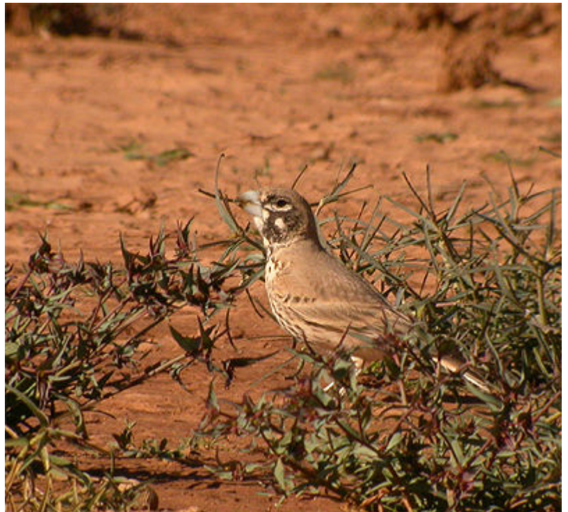
Thick-billed lark west of Errachidia.

Night at Hotel La Vallée des Oiseaux in Boulmane de Dades. Cheap, dirty, damp and probably to cold even for the roaches... double-BRRR... Watch out for the prices as they tried to fool us to pay more than we should (a lesson you, unfortunately, should bring with you everywhere in Morocco).