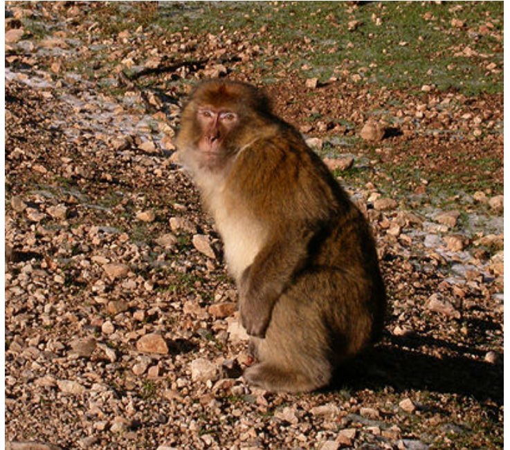
Barbary Ape in Fôret de Cedres.

We spend the night in Midelt and have our first Tajine at dinner.