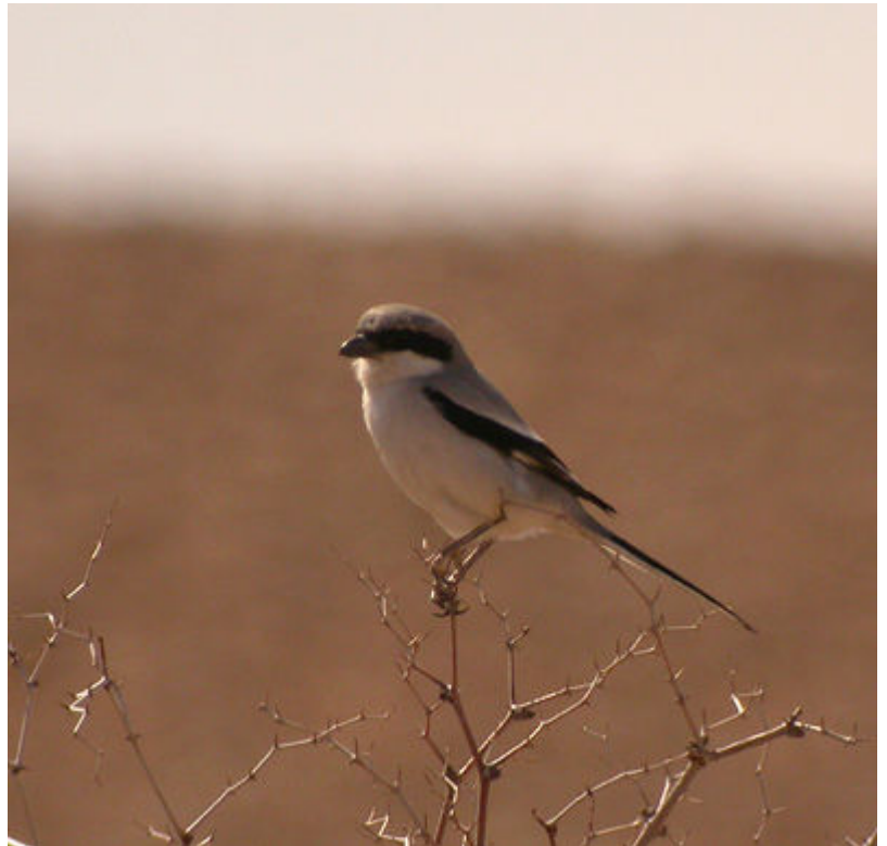
Southern Grey Shrike.

1 bird showing intermediate characters in pair with an elegans in wadi south of Erfoud 19.2.