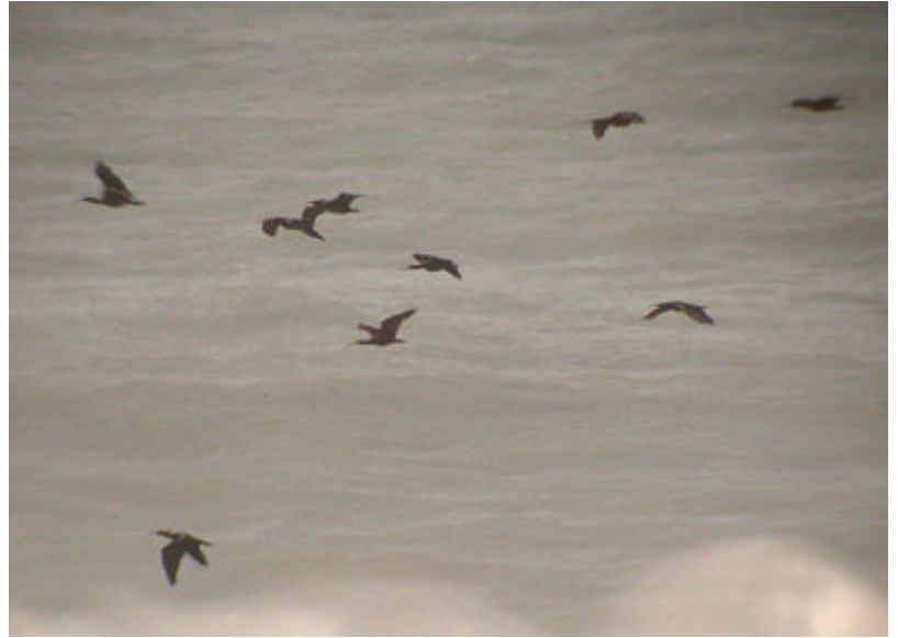
Northern Bald Ibises near Tamri.

Dark and we hear a distant “tocking” of Red-necked Nightjar from the palace gardens although a Stone Curlew doing its best to destroy all possibilities.