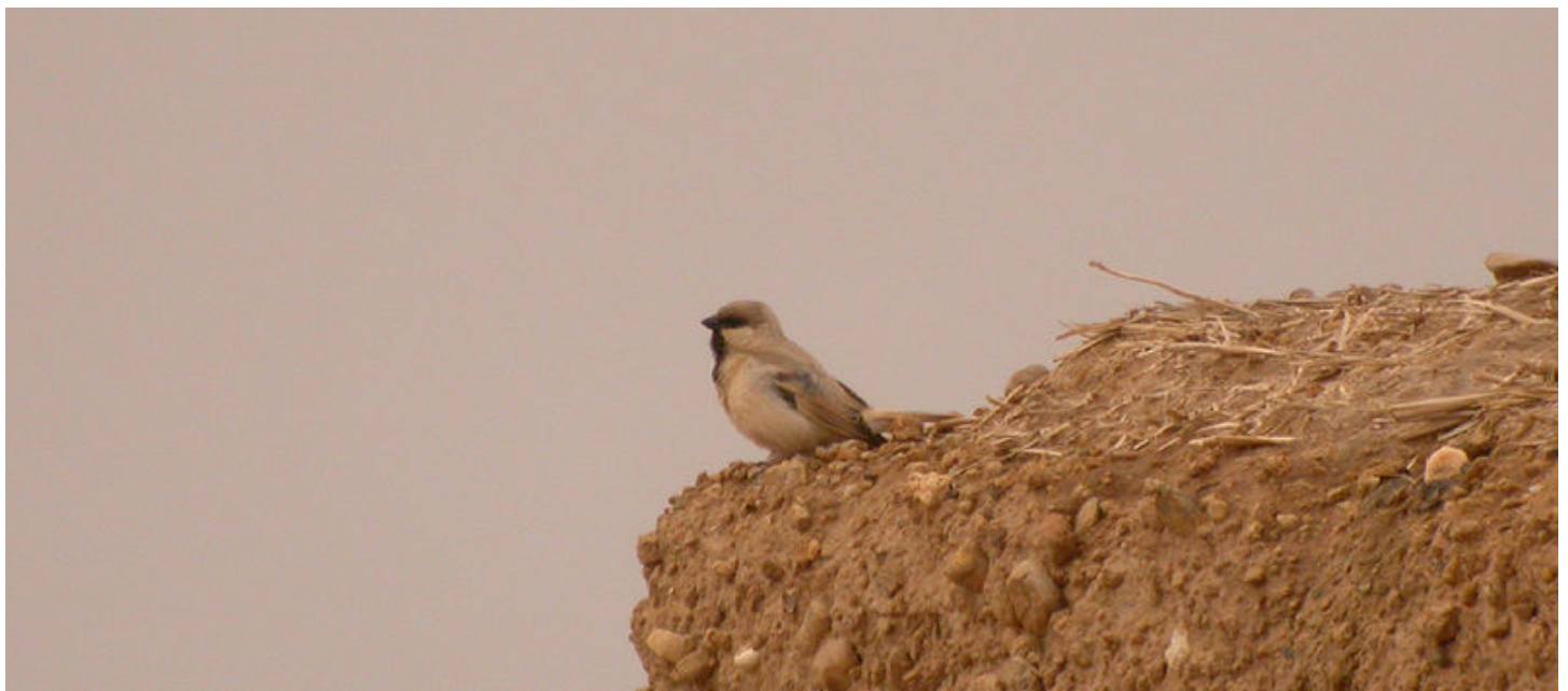
Desert Sparrow, Café Caravan, Erg Chebbi.