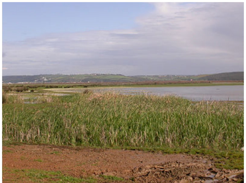
View over Oued Loukkos.

The plan was to spend next morning here but as francolin already secured we drove the evening towards Atlas Mountains and a nice hotel just N Azrou (where we spent the night).