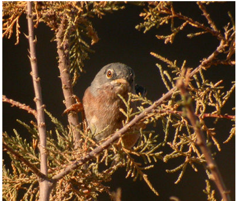
Tristram's Warbler east of Rissani.