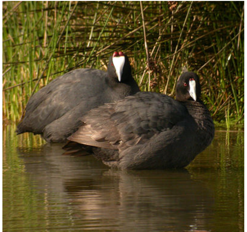
Red-knobbed Coot in Oued Loukkos.

52. Red-knobbed Coot Fulica cristata Approximately 500 in Oued Loukkos 17.2. Only 2 common coots were found among them!