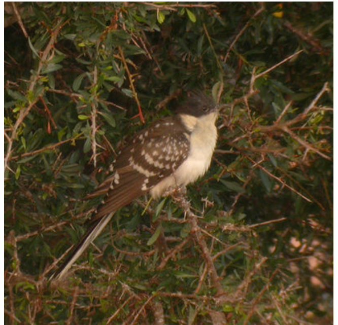
Great Spotted Cuckoo east of Massa.