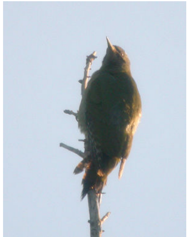
Levaillant's Green Woodpecker.