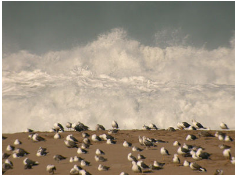
Roosting Gulls in front of a wild Atlantic Ocean.