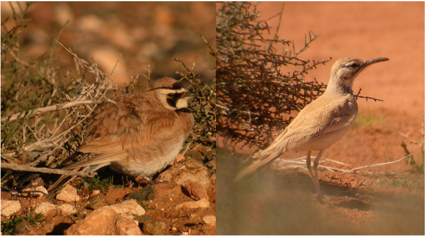
Temminck's and Greater Hoopoe Larks at Tagdilt Tracks and Errachidia, respectively.