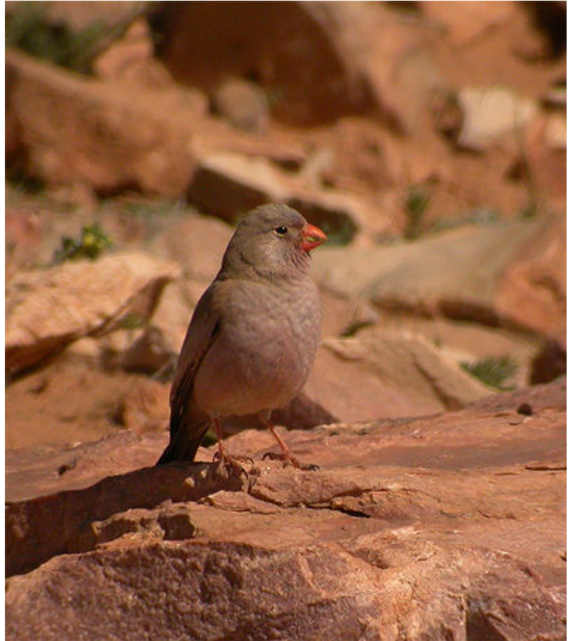
Trumpeter Finch south of Erfoud.

A really great experience and good surprise that the bird is still present!