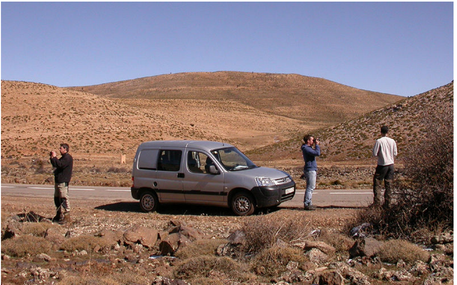
Birding in the Atlas mountains.