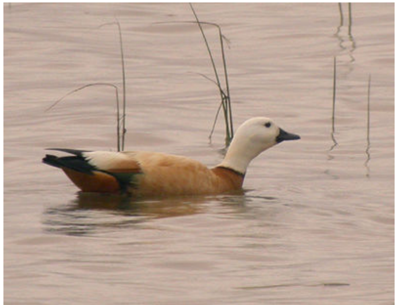
Ruddy Shelduck in Dayet Srji.