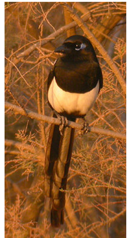
“Moroccan” Common Magpie.