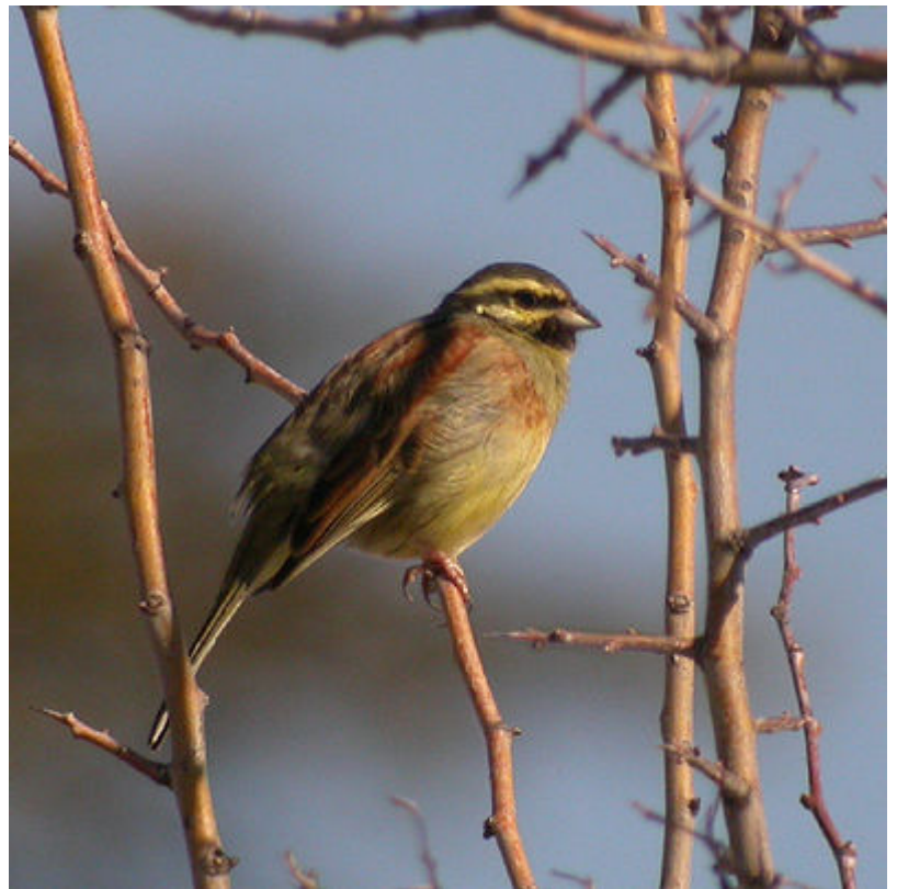
Cirl Bunting, Fôret de Cedres.

192. Common Reed Bunting Emberiza schoeniclus 1 Oued Loukkos 17.2. The endangered subspecies witherbyi breeds in northern Morocco and southern Spain. Unfortunately we only saw the bird briefly in flight so we never got a chance to determine its subspecies.