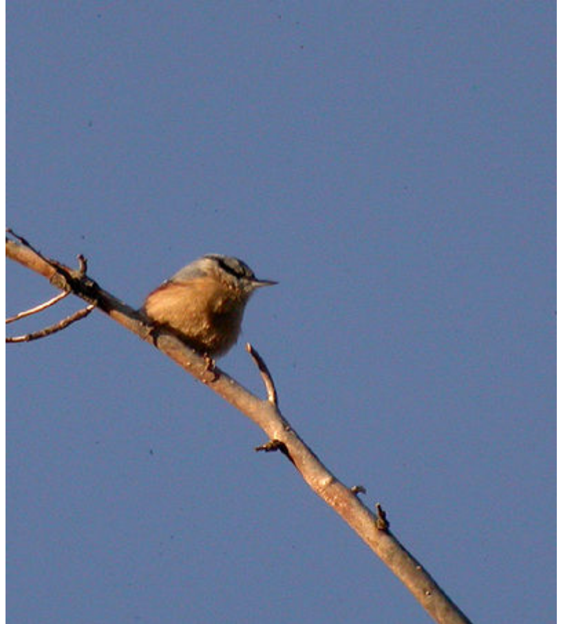
Eurasian Nuthatch, Forêt de Cedres.