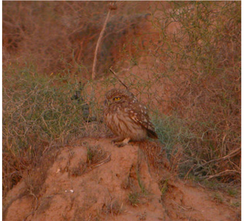
Little Owl, Taroudant.

1 calling 5 km west of Rissani 19.2. The bird started calling at dusk and was calling for about 10 minutes. Joppo managed to get a short glimpse of it as it flew off westwards over the ridge to go hunting. Drive north from Rissani towards Erfoud. After you have left the town you will soon see a Ziz petrol station on your left. Just before the petrol station there is a road to the left, signposted towards Alnif and a few other places. Set your trip meter here and drive 4,9 km on this road until you reach a small bridge over a wadi near the “Alnif 84” km stone, park your car here. On the right you will have a ridge following the wadi on its west side. Walk north in the wadi for about 2 km until the ridge makes a rather sharp left turn, it almost looks like the ridge ends here but it doesn't. A few hundred meters further ahead you will see a low ridge on your right and some larger hills, maybe 15 m high, in front of you. Climb the first hill and face the cliffs. If you look a little to the left you will see some strange formations in the cliffs. To the left of these there is a small cave which is supposed to be the owls favourite cave. Before you reach the hill there is also spelled out with rocks in the sand “Eagle owl” and an arrow pointing towards the cave. As far as we know this site has been reliable for quite a few years now.