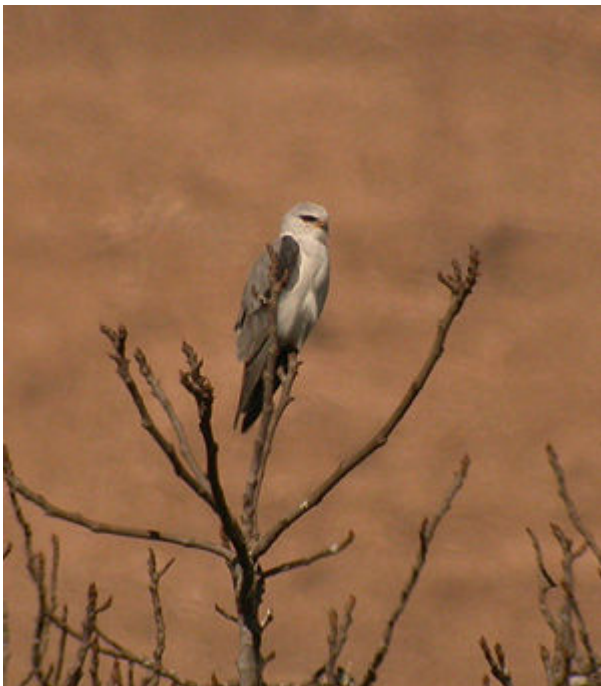
Black-shouldered Kite in Massa.

We decide we have to walk back to the car and try to find the right spot just as a brown swallow with dark coverts and “plain” underside speed away over our heads. Someone instinctively shouts “Crag Martin!” and we all follow it until it disappears in a few seconds ...but wait a minute... As we are discussing the brief impressions we start to question the bird: What is a Crag Martin doing out over the fields? Shouldn’t we have seen windows on the tail? Wasn’t it too small and do Crag Martins ever practice that fluttering flight? It certainly had no breast-band... While the unpleasant feeling spreads in our bodies that we might have missed a Plain Martin we decide to chase after the bird. It does not take long until we find a few birds flying around (and even into holes in the sand). Small, brown Martins without breast bands, what a feeling!