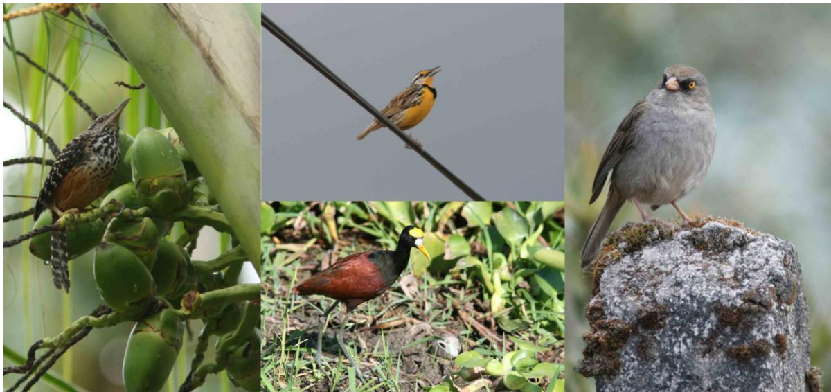
From top left: Band-backed Wren, Eastern Meadowlark, Northern Jacana, Volcano Junco

While driving to our hotel we passed a small densely wooded area. Here a party of about 20 Coatis entertained tourists. Although it is not allowed to feed them, people do and the Coatis were not late to pick food from the hands of people. We reached Hotel Arenal Paraiso in the late afternoon where a bath in the volcanic temperate water pools was very relieving.