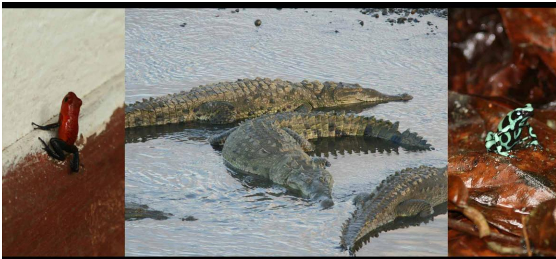
From left: Strawberry Poison Dart Frog, American Crocodile, Green and Black Poison Dart Frog