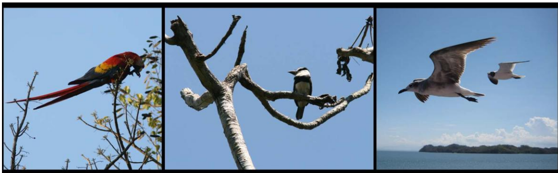
From left: Scarlet Macaw, White-necked Puffbird, Laughing Gulls

The afternoon was for relaxing and bathing in the Pacific Ocean. In the evening we went for a little drive and ended up at the Tarcoles river mouth where it reaches the sea. Unfortunately the water level was very high why we saw virtually no waders or gulls. Instead we had very nice views of Scarlet Macaws and saw a lot of herons and Roseate Spoonbills .