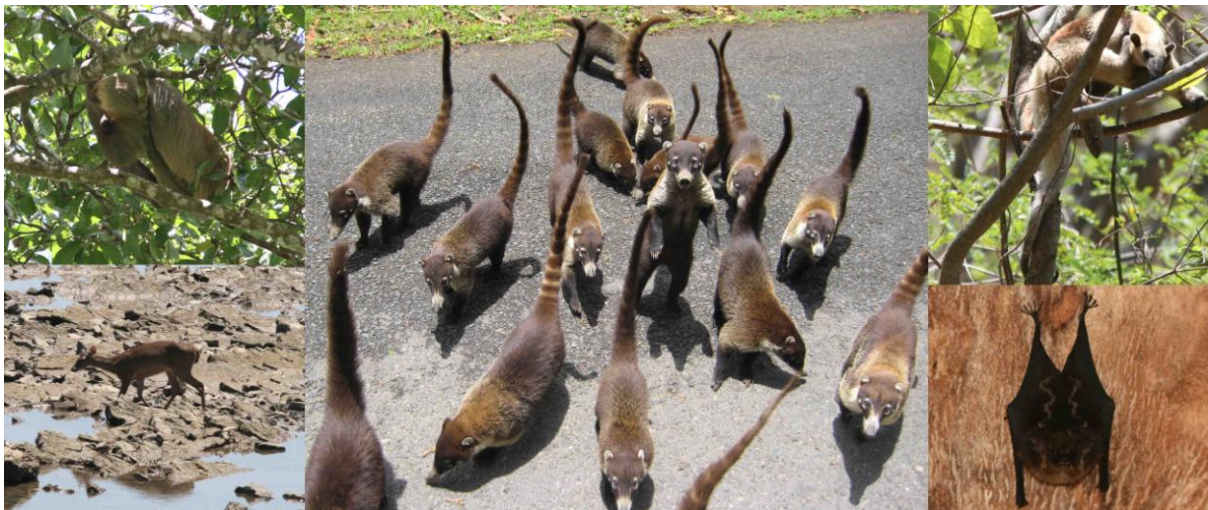
From top left: Hoffman's Two-toed Sloth, White-nosed Coati, Northern Tamandua, bottom left: White-tailed Deer, bottom right: Greater White-lined Bat