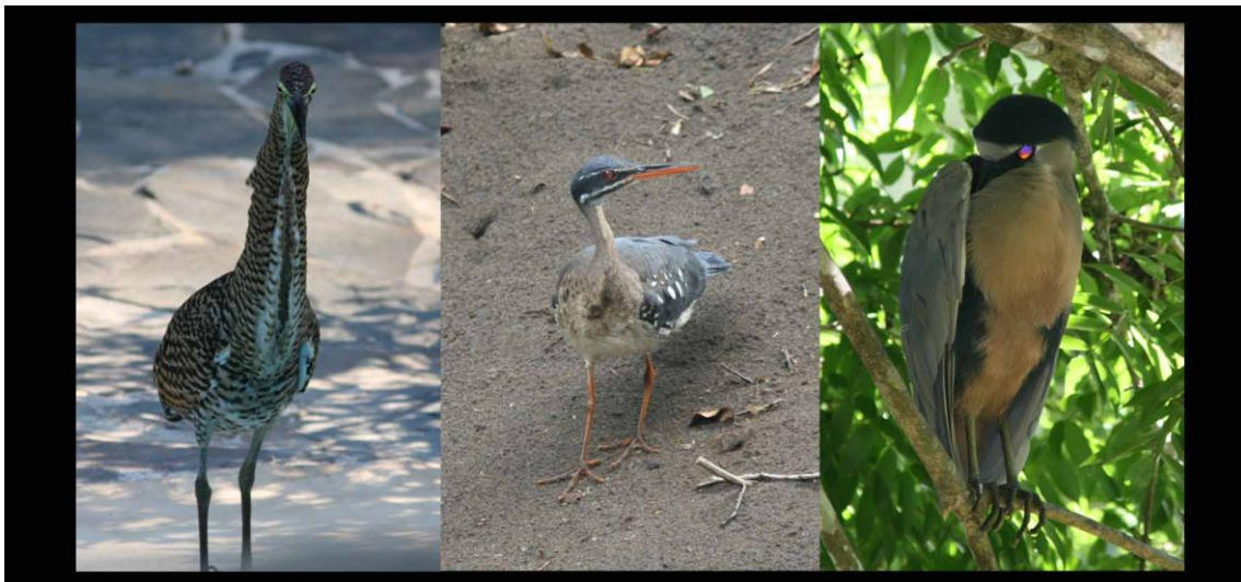
From left: Bare-throated Tiger-Heron, Sunbittern, Boat-billed Heron

After lunch and some bathing we went for a late afternoon/evening tour. It was virtually the same birds as the day before but large numbers of Scissor-tailed Flycatchers were on the move before dusk and a Striped Owl was heard calling. On the way back to the hotel there was also a massive movement of big crabs heading towards the sea. There were even singles near or inside our hotel room! As revenge we had seafood in the evening. It was equally good as the meal we had several days before in Jaco. If you like seafood, enjoy it while you are near the coast. Further into the country seafood is relatively sparse.