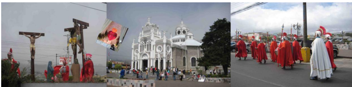
Easter in Cartago

We spent the rest of the day trying to compensate for our bad morning but the rain showers were a bit hindering. We saw many Strawberry Poison Dart Frogs and Basilisks but birds were scarce. We had booked a boat trip on the Sarapiquí River that afternoon. Since this also was Holy Thursday a lot of people were bathing in the river and although the sun was now shining, birding was so and so. We saw at least Howler Monkeys, a Two-toed Sloth, Sun Bitterns and a few Buff-rumped Warblers .