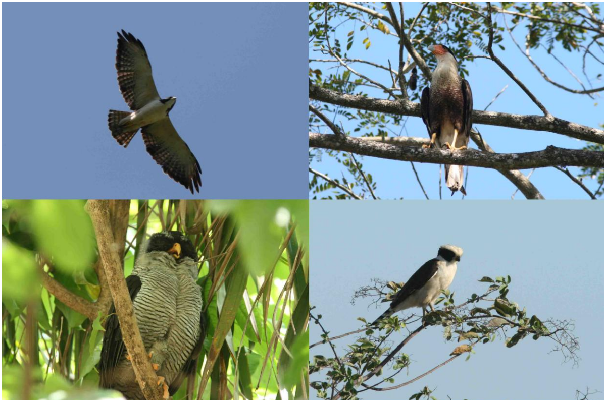
From top left: Short-tailed Hawk, Crested Caracara, Black-and-white Owl, Laughing Falcon

Thanks to C-G Dahl for providing information before our departure.