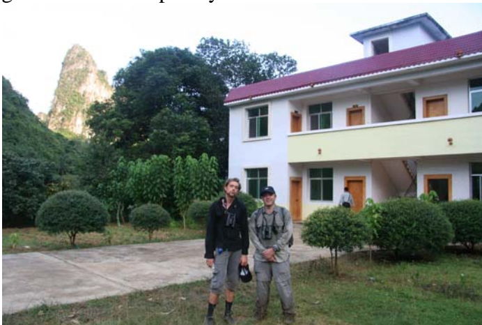
Lenglei, Nonggang HQ