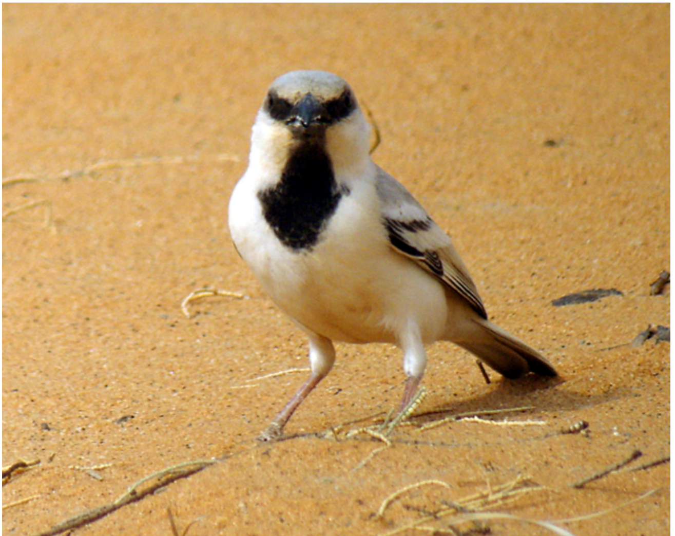
Male Desert Sparrow Auberge Yasmina, Erg Chebbi 11 th April.