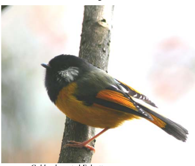
Golden-breasted Fulvetta, Alcippe chrysotis swinhoii About ten at Yangmaxia.