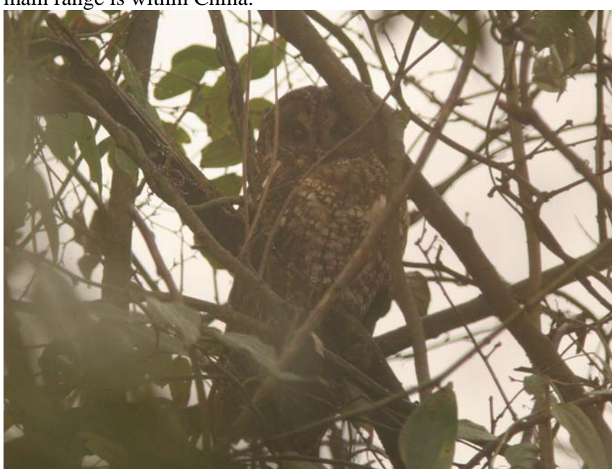
Chinese Tawny Owl

Speckled Piculet, Picumnus innominatus chinensis