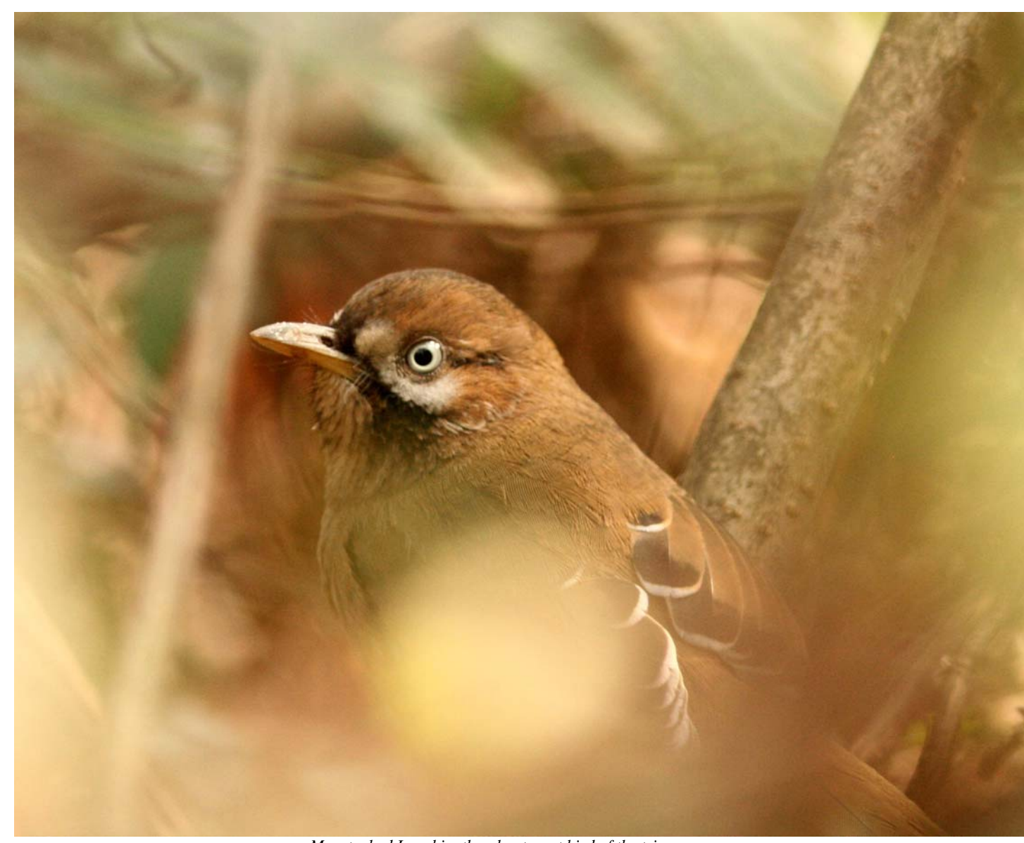
Moustached Laughingthrush – target bird of the trip