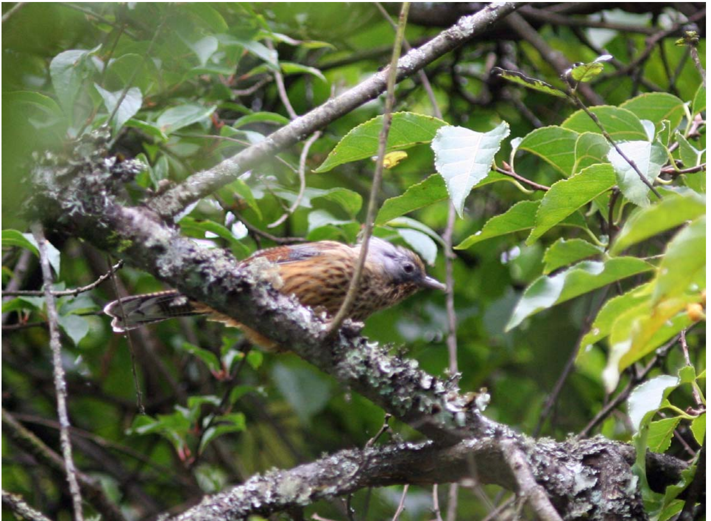
Streaked Barwing, the target bird of the trip