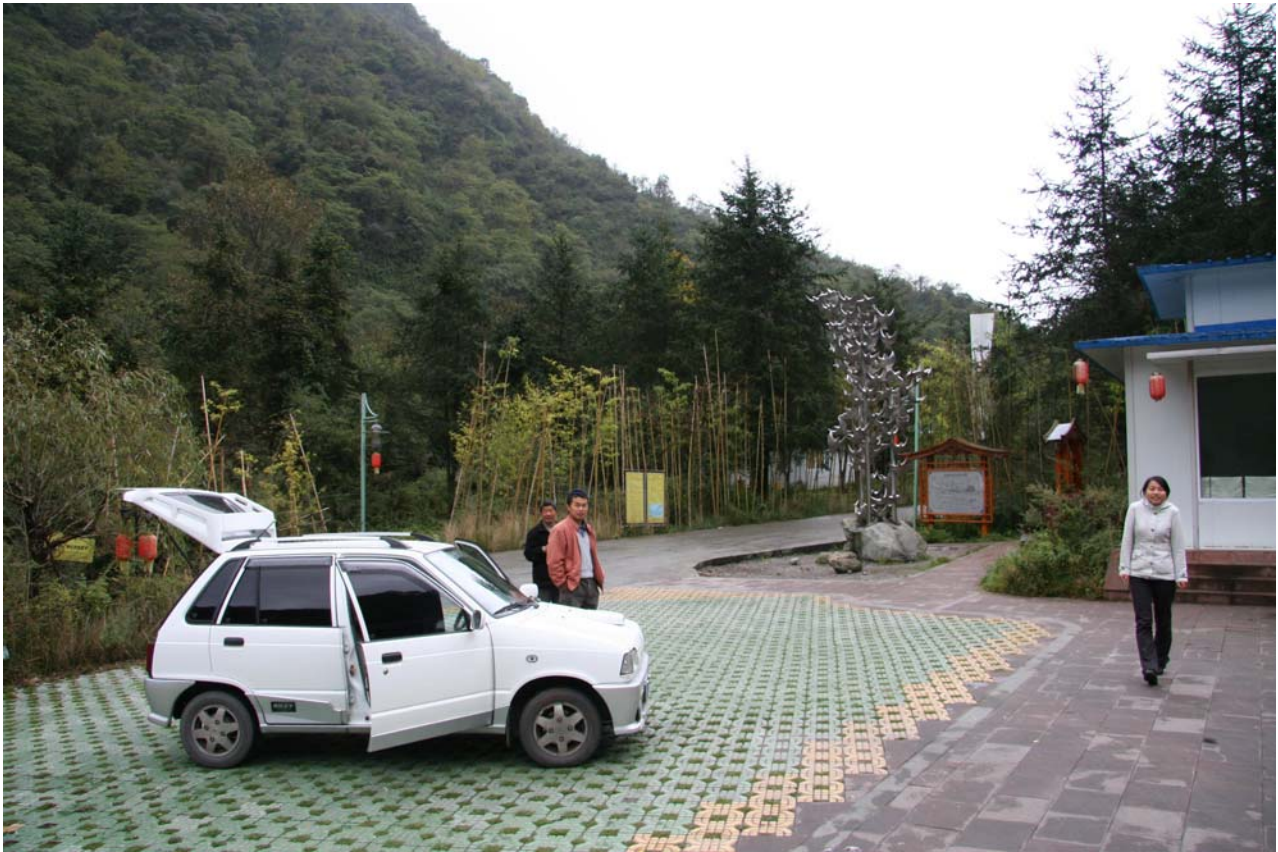
White Dove Resort with the White Transport Car