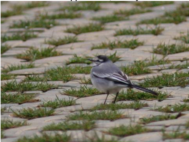
White Wagtail of the taxon ocularis

About ten at the upper hotel, mostly alboides and at least one ocularis .