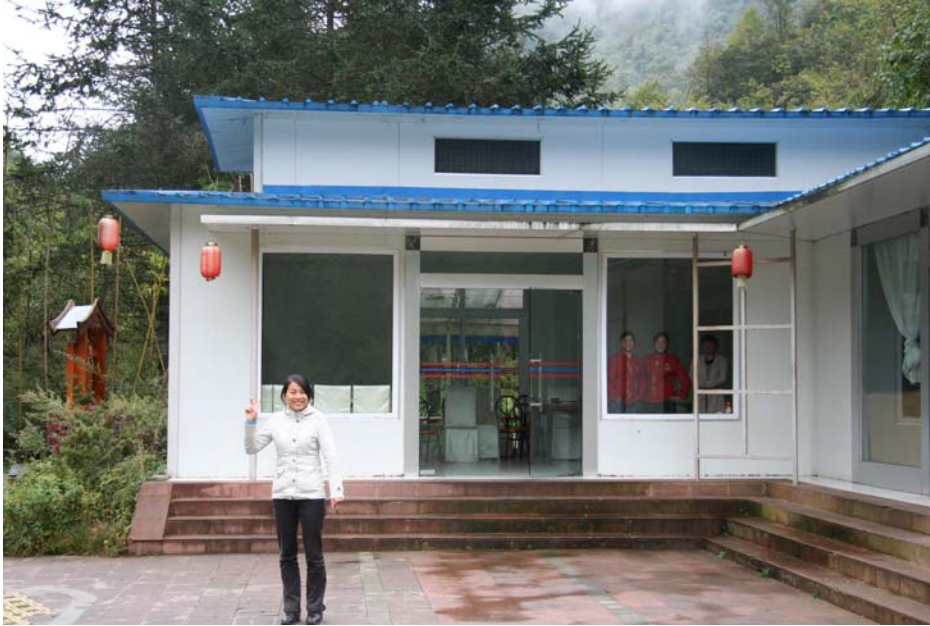
The restaurant at White Dove Resort

We did a few short stops along the road at lower altitudes, but in the early afternoon it was almost birdless, so we continued to Chengdu airport where we arrived at 17.00. I managed to rebook to a slightly earlier flight to Beijing and Dave continued on his birding trip to Yunnan.