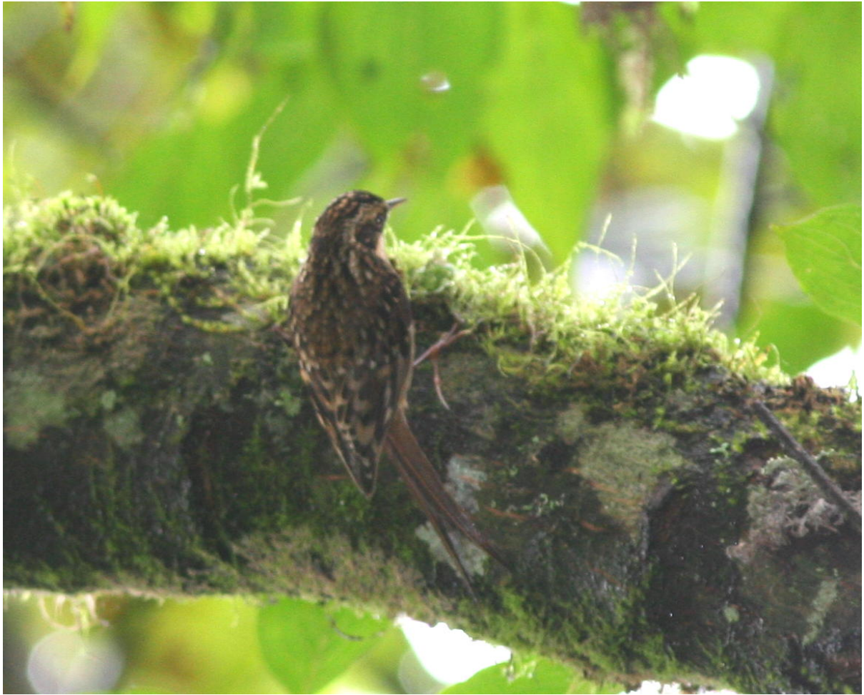
Sichuan Treecreeper. Note the long plain brown tail, the scaly/checkered mantle and the short and rather straight bill. The underparts are rather drab, becoming paler towards the throat. The song is completely distinctive; an about one second long descending high-pitched ringing trill.