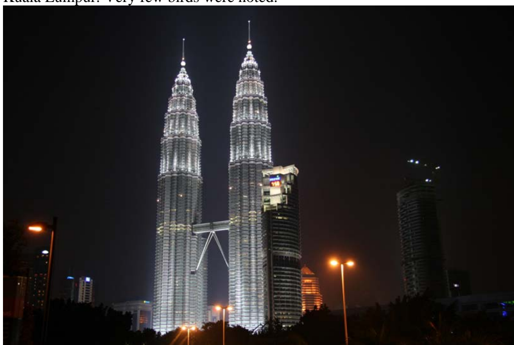
The Petronas twin towers, once the highest buildings in the world

We arrived at Kuala Lumpur about midnight on 28/9 and spent the first few days at Sunway Resort in Kuala Lumpur. Very few birds were noted.