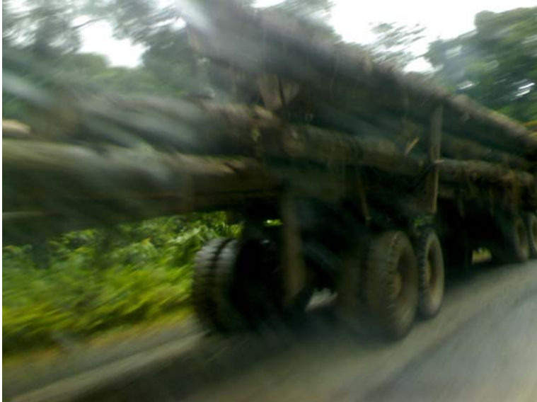
Bornean lowland rainforest on the road...