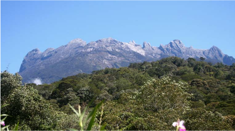
View of the ca 4100 meter high Mount Kinabalu

Mount Kinabalu is one of the real famous birding sites in Sabah and is thoroughly described in many other reports. From Tanjung Aru it takes 2-2.5 hours to drive.