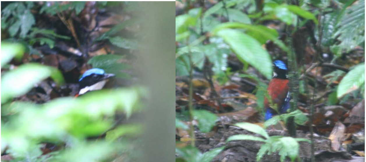
Blue-headed Pitta, poor shots of a splendid bird...

One heard at Hornbill trail, one heard at Tekala trail and one showy male at Segama trail at Danum Valley.