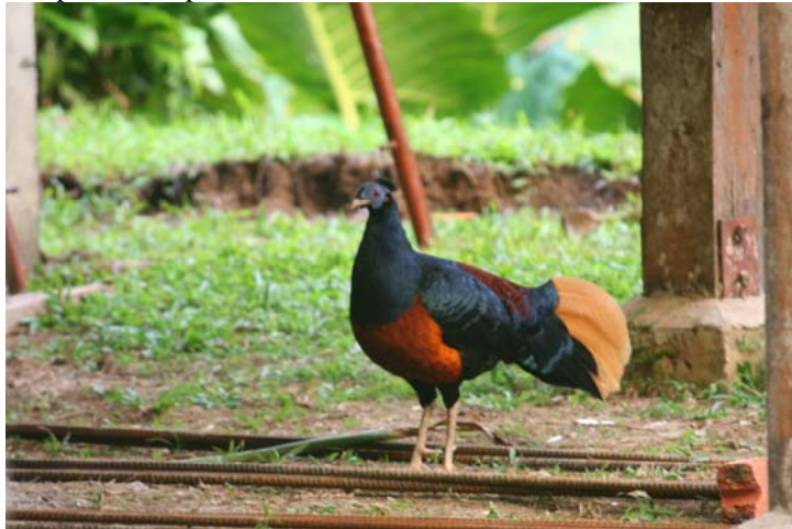
Crested Fireback, a few birds are strutting around the lodge like chicken, but fortunately there are also “real” birds in the forest...

Three males and a female at the lodge and one male and two females at the canopy walk at Danum Valley. The Bornean forms are perhaps best treated as a separate species, although intermediate birds on Sumatra complicate the picture.