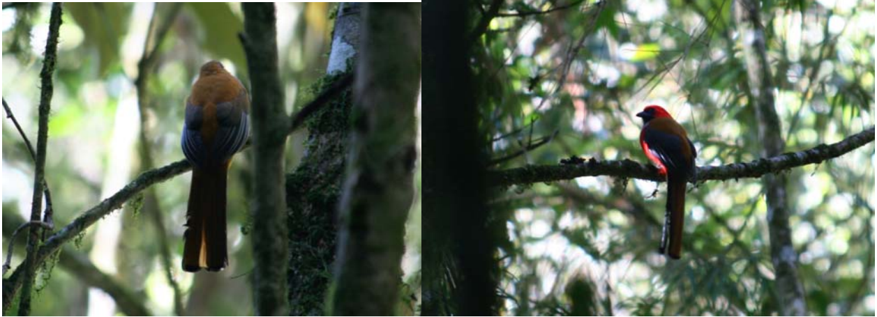
Mrs and Mr Whitehead's Trogon

A splendid pair was seen at the 500m marker at Silau Silau trail at Gunung Kinabalu. Others have stated that this is the most beautiful Trogon in Asia, and I am tempted to agree. Having seen the Spiderhunter on my first trip, I will hopefully complete the Whitehead hat-trick next trip.