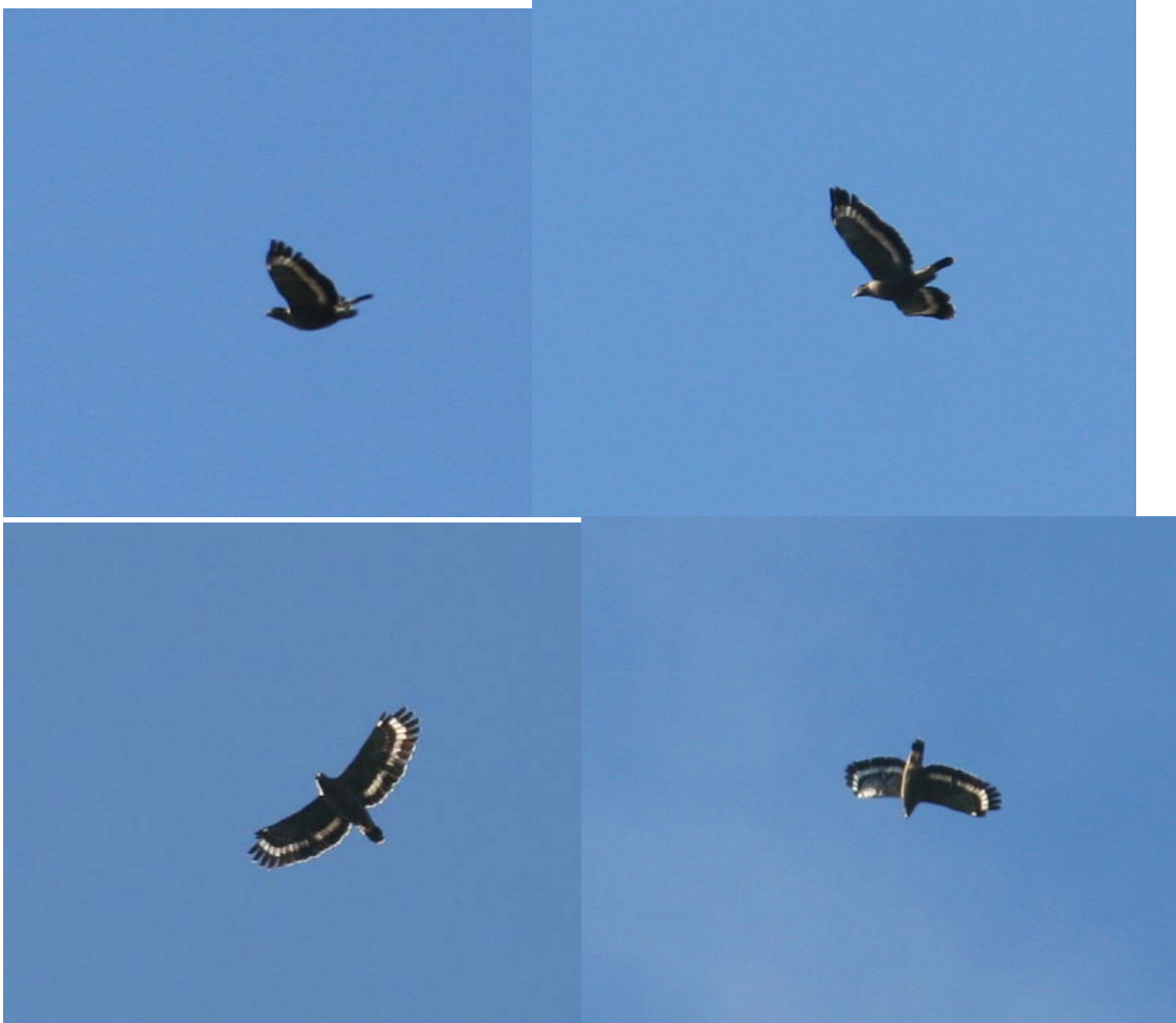
Mountain Serpent-Eagle (top two in display flight)

A pair in display flight at Tambunan Rafflesia Reserve. The birds were photographed and tape-recorded at an altitude of ca 1400 masl.