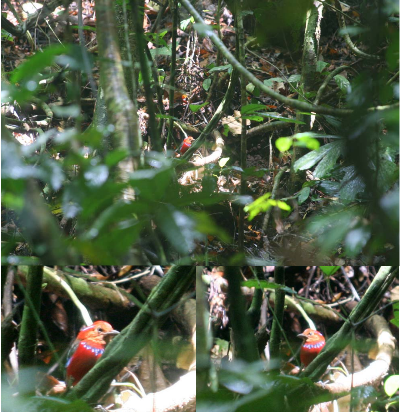
Blue-banded Pitta, almost looking artificial when the rays of sun hit it