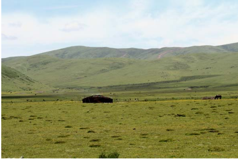
Rolling grasslands on the Tibetan plateau south of Rouergai, unfortunately heavily grazed by Yaks.

We left Chuanzhisi at 8.00 and after 1h45m we arrived at the crossroads to Hongyuan, which was my initial destination. The driver thought that the road conditions would be rather bad and as I had back-up sites for the target Tibetan Grey Shrike at Rouergai, I quickly decided to go straight to Rouergai instead. At 10.00-10.45 I made a road-side birding stop at some scrub-covered hillsides. As I was keen to get to Rouergai, I did not stop too many times along this road, although it looked good. The scenery on the Tibetan plateau is absolutely breathtaking and is a must to experience. Equally breathtaking is walking too fast uphill if not acclimatized for the altitudes, which I wasn't when coming straight from sea-level in Beijing.