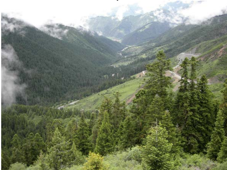
Coniferous forest on the west side of Gezangjiaze.

We set off from Baxi at 04.40 and drove on good roads towards Gezangjiaze mountain pass. In the dark, I suddenly saw a huge owl on a phone-post and after explaining to the surprised driver that I quickly wanted to turn around the car we eventually had the head-lights pointing at an Eagle Owl (not the hoped for Pere David's Owl or Tawny Fish-Owl...).