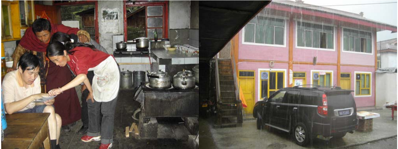
The accommodation at Baxi, where we had dinner in their kitchen, while heaven opened up.

The night was uneventful, apart from being woken most of the time due to the entire pack of village dogs having a party. I have never heard so persistent barking from so many dogs at the same time... The rain continued for most of the night!