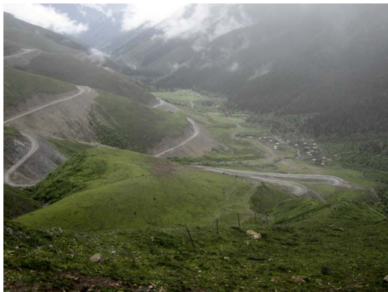
The east side of Gezangjiaze