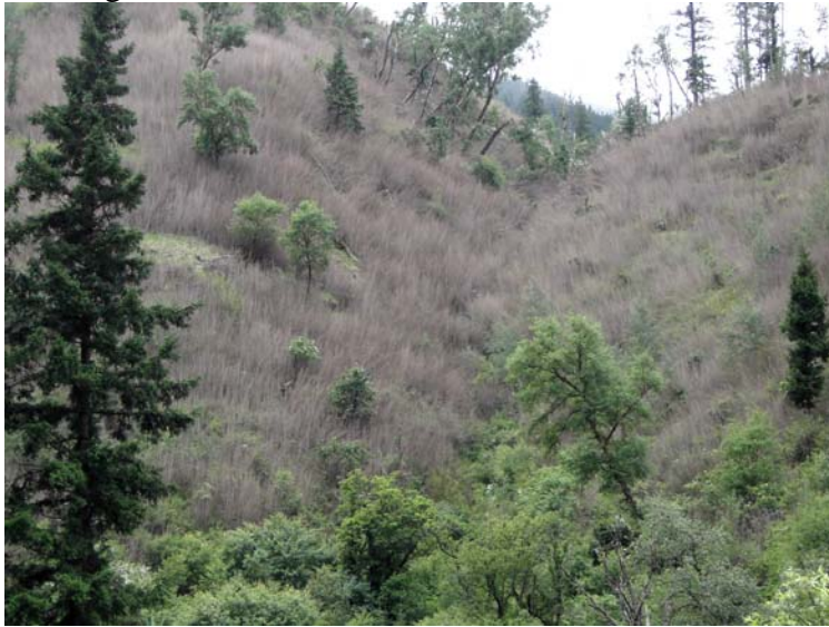
Extensive areas of dead bamboo east of Gezangjiaze. One can just imagine the sight of Przewalski's Parrotbills when the bamboo was flowering...

all, but suddenly one of them decided to give up and offered some fantastic views. I continued to walk along this road that eventually took me to above the tree-line near the pass itself. Until 11.30 I covered some 11 km and ended up at 3600 masl. Once I saw at least two Blue Eared-Pheasants in a grassy clearing and later on I flushed a group of three, which could have been the same birds. I enjoyed my best views ever of the normally flighty Tibetan Serin, with a single bird that came in to my pishing. By midday I had reached the alpine scrub and although I kept searching, I could not find my target Crimson-browed Finch. As I was keen to move on to the bamboo forest on the eastern side of the pass, I left this side of the mountain by 11.45. After crossing the pass at 3865 masl we descended quickly to below 3000 masl where the forest resumed. It did not take long until I found extensive areas of bamboo undergrowth, although as mentioned previously, it was all dead! No Parrotbills and no Blanford's Rosefinches were to be seen. This was an area where I had planned to spend a full day scouting as well as 2-3 days the coming weekend. Needless to say, I did not find it worthwhile, so therefore we continued past some smaller villages like Dajiu, Yuwa, Heihe and Lingjiang until we at 14.45 reached the main Jiuzhaigou road.