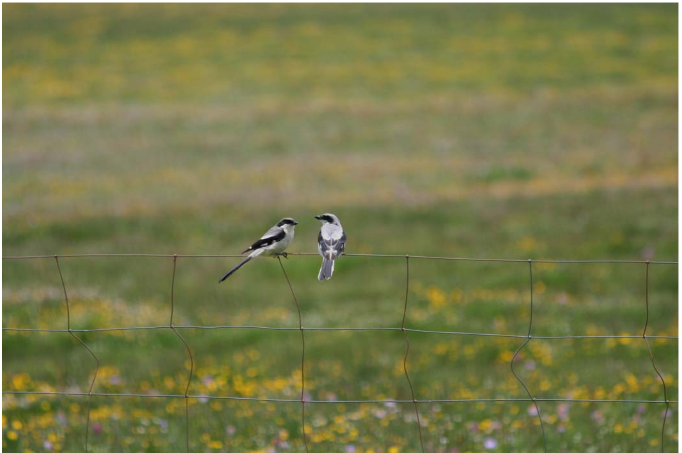
The target bird of the weekend, a pair of Tibetan Grey Shrikes