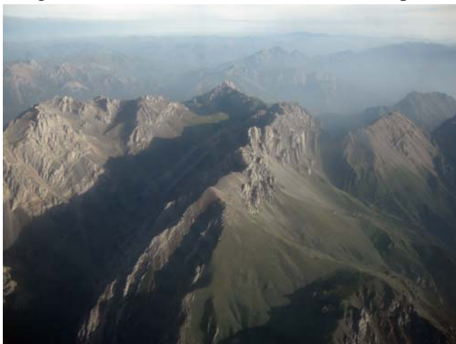
Spectacular mountains near Jiuzhai-Huanglong airport

I left Chengdu with the first morning flight at 6.50 to Jiuzhai-Huanglong airport. The weather was clear and I could enjoy some truly spectacular views of gorgeous mountain ranges. During the inflight we flew low over Gonggangling, where I have been birding a couple of times. I was met by the pre-booked driver and within minutes at 7.45 we were on our way to the Tibetan plateau. At nearby Chuanzhisi, we bought some water and then took the rather poor road 213 due north towards Rouergai.