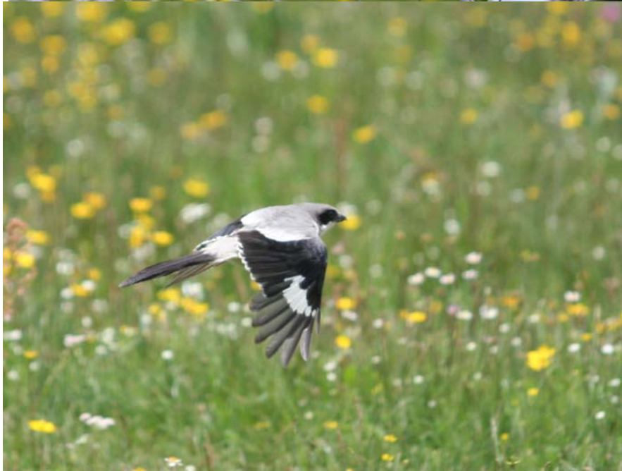
Tibetan Grey Shrike