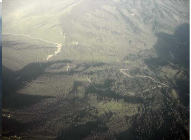
Gonggangling, a patch of good forest about halfway between Jiuzhaigou and Chuanzhisi (near the airport)