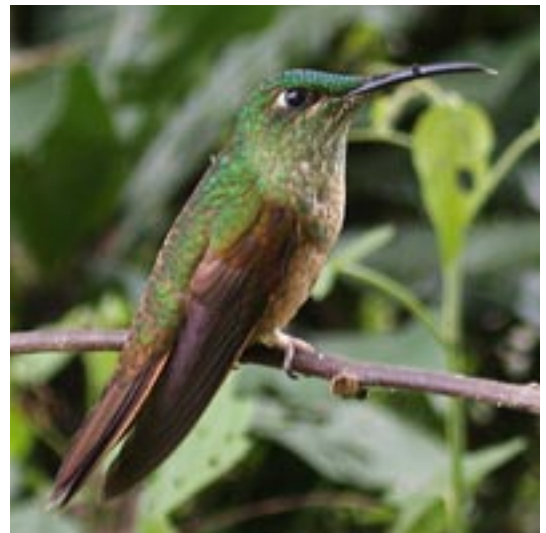
Female Fawn-breasted Brilliant at Paz de las Aves

1 seen at Rio Silanche, singles seen or heard all days at Canandé