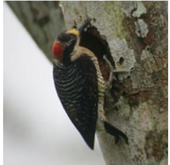
Female Black-cheeked Woodpecker at Canandé