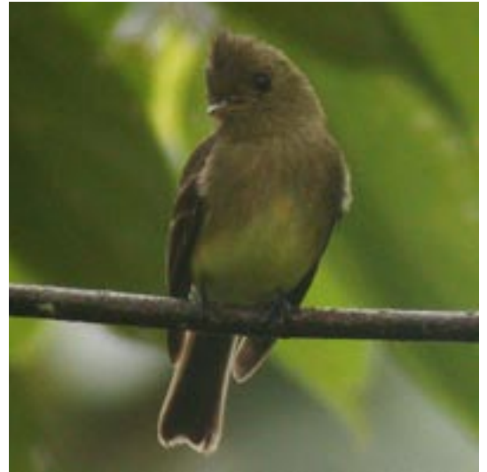
Northern Tufted-Flycatcher at Canandé

2 seen at km 106.5, 2 seen at Rio Silanche and 7 seen at Canandé