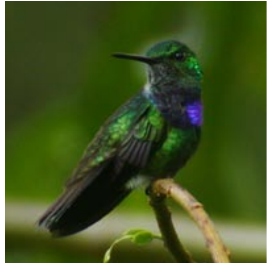
Male Purple-chested Hummingbird at Canandé

7 seen at restaurant Rio Blanco, los Bancos, 2 females at Canandé