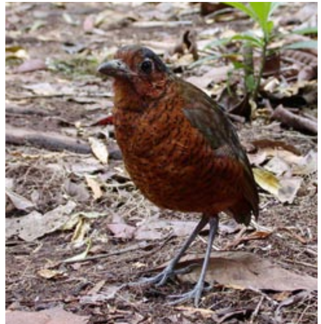
Giant Antpitta at Paz de las Aves. This individual listens to the name 'Maria'