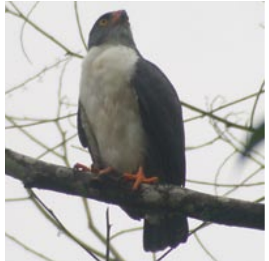
Semi-plumbeous Hawk is, like Plumbeous Hawk, mostly found inside the forest