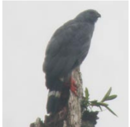
This Crane Hawk may be the first documented record for the Esmeraldas province

This reserve owned by Fundacion Jocotoco offers access to lowland forest in the Chocó region. This was our first visit here and to be honest it was a bit of a disappointment. The foundation has got 1300 ha of forest here but you only bird in secondary forest albeit good secondary forest. Chain saws are heard all the time as a big logging company owns the neighbouring land. The lodge itself is highly overpriced and rather basic. Despite this, the site holds a good number of Chocó lowland birds that are hard to find elsewhere e.g. at Rio Silanche. I have nowhere in the world seen as many moths as here, some very big and spectacular once.