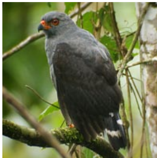
Plumbeous Hawk is a scarce raptor found in the forest interiors

Today Roger and Macklin went to Cotopaxi for some high-altitude birding. The plain around laguna Limpiopongo produced the usual stuff like Stout-billed Cincloides and Paramo Ground-Tyrant. Near the lake Streak-backed Canasteros showed well but the search for Noble Snipe ended in a less glorious way with Roger sinking down to the waist and Macklin got wet as well! And we didn't see the snipe. Ecuadorian rail was heard and 9 Blue-winged Teals lingered in the lake. Higher up the mountain we saw an Ecuadorian Hillstar before we decided to try another site. Lunch at Hacienda Cienega nearby was good but a lot of people today. Nearby we soon found Streak-throated Bush-Tyrant and Chiguanco Thrush. After some playbaking we had gripping views of Ecuadorian Rail. A nice end to a very good trip.