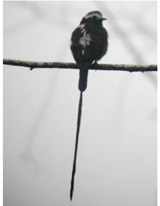
Long-tailed Tyrant at Canandé

5 seen at Paz de las Aves and 5 at Bellavista