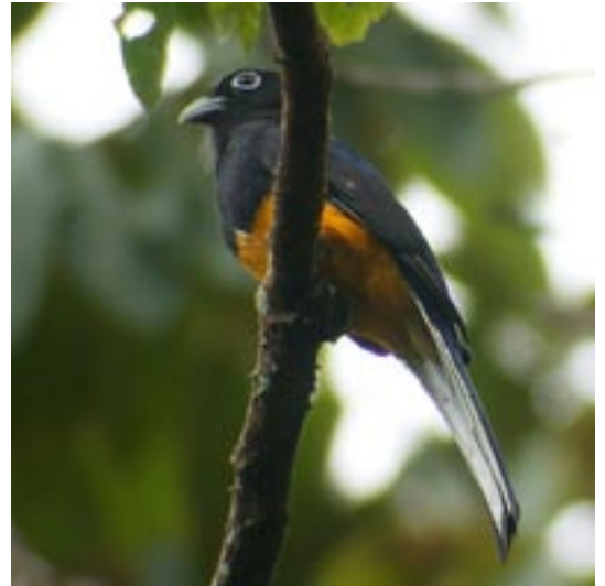
Male Western White-tailed Trogon at Canandé

2 heard at Paz de las Aves and 1 heard below Bellavista