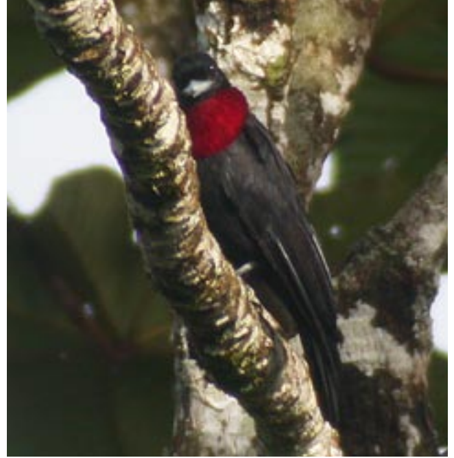
Purple-throated Fruitcrow at Rio Silanche