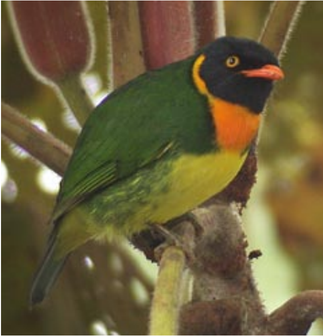
Male Orange-breasted Fruiteater at Paz de las Aves.