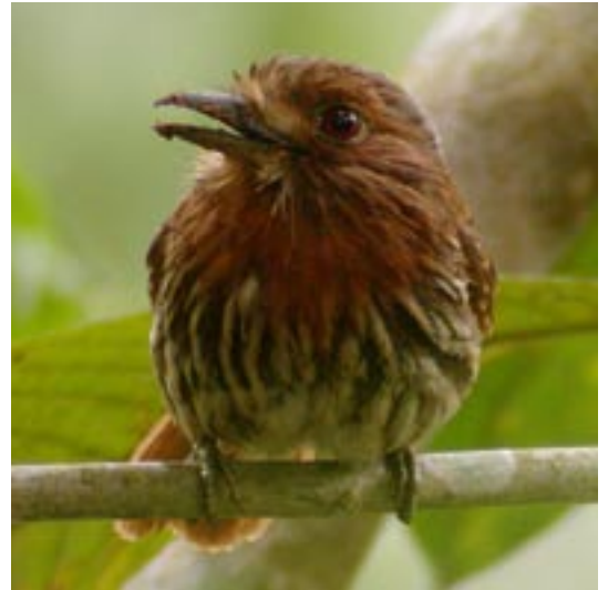
White-whiskered Puffbird at Canandé