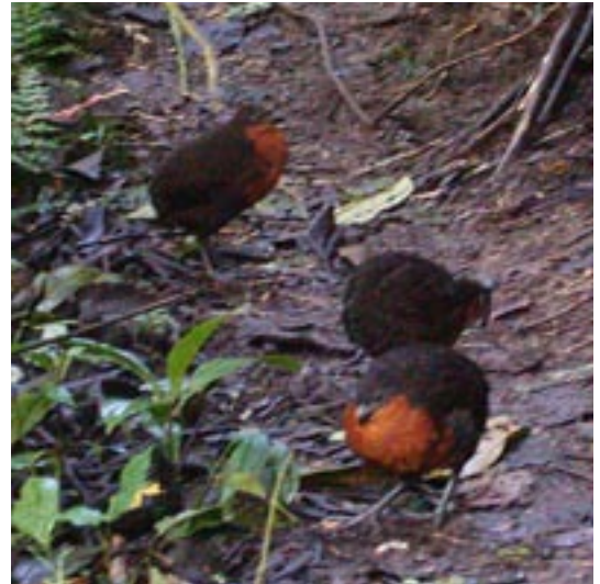
Dark-backed Wood-quails at Paz de las Aves. They, like the Antpittas, were being hand-fed!