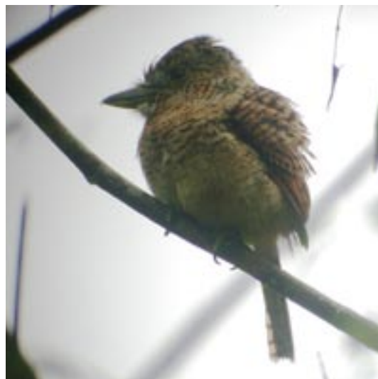
Barred Puffbird at Canandé