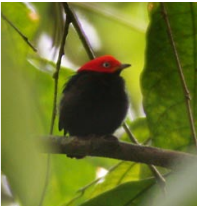
Male Red-capped Manakin at Canandé