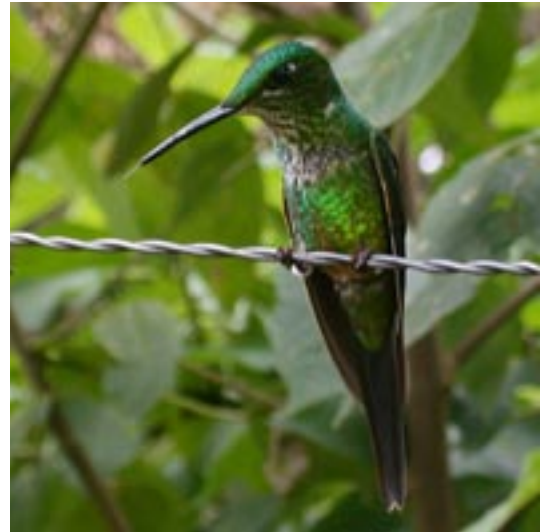
Female Empress Brilliant at Paz de las Aves