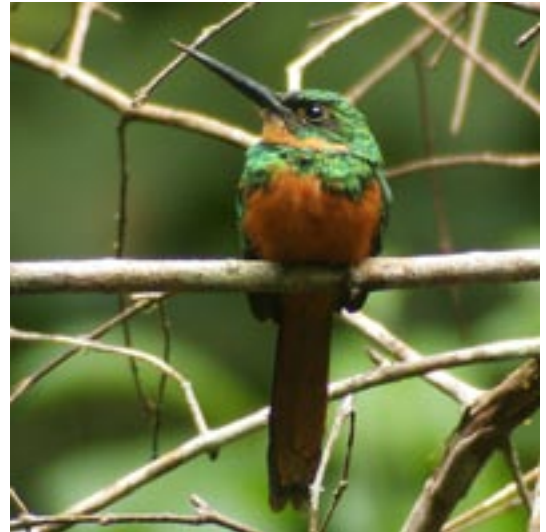
Female Rufous-tailed Jacamar at Canandé

Singles seen daily from Milpe to Canandé