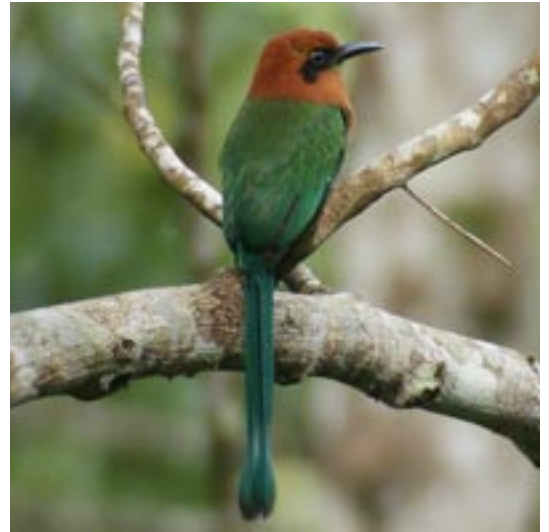
Broad-billed Motmot at Canandé