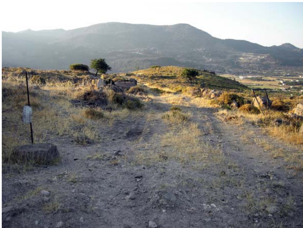
The hills N Petra.

Black-eared Wheatear 10 ad both white- and black-throated forms Cirl Bunting 1 female Western Rock Nuthatch 2 Eurasian Blue Tit 2 Great Tit 1 Little Owl 1 Common Kestrel 1 male resting on telephone pole eating small animal (lizard?)