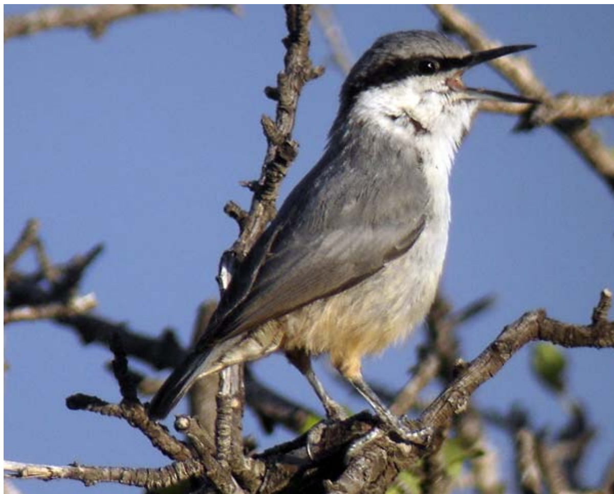
Western Rock Nuthatch Petra 18 June.

1 pair at the Panorama hotel, Petra 13 June, 1 singing Panorama hotel, Petra 14 June, 15 Skalochori, northern part 14 June, 1 Potamia valley 15 June, 2 The "Amfi-disco", Petra 16 June and 6 the "Amfi-disco", Petra 18 June.