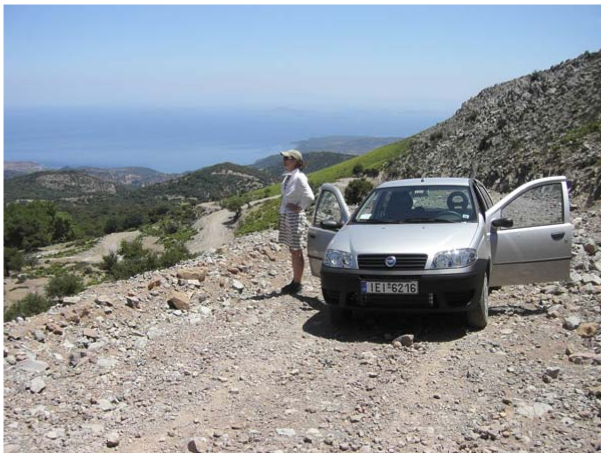
Vigla, Lepetymnos mountains 16 June.