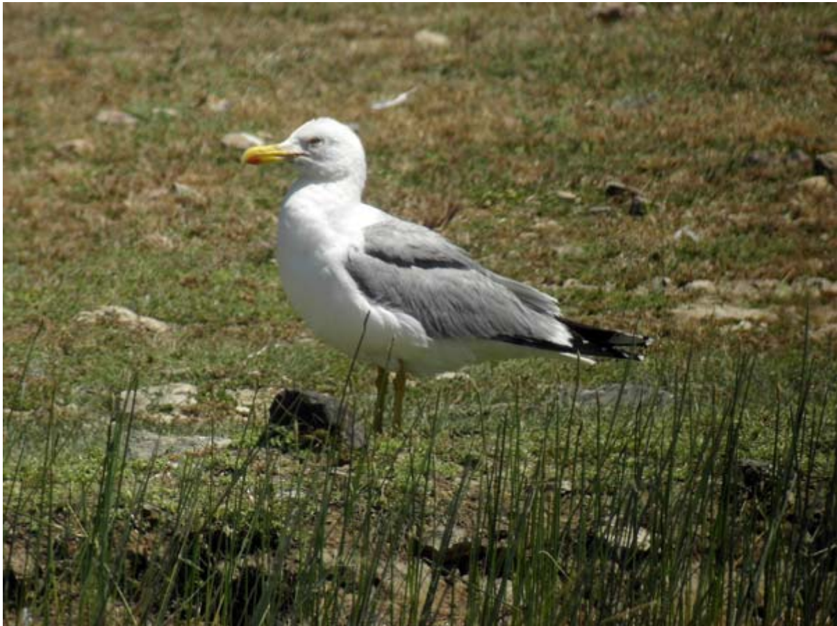
Adult Yellow-legged Gull Klio 16 June.

15 Mytilini 12 June, 25 Panorama hotel, Petra 12 June, 50 Petra reservoir 12 June, 2 adult Mithymna (Molyvos) 15 June, 6 ad Klio, small pond at the road just S the village 16 June, 150, probably nesting, many juveniles Georgios Petras island (Rabbit island) 17 June, 10 Myrmingi island 17 June, 50 Mikro Nisi island 17 June, 42 ad Klio, small pond at the road just S the village 18 June, 25 Prasologos island off Pedi 18 June, 110, many juveniles Georgios Petras island (Rabbit island) 19 June, 5 Myrmingi island 19 June and 50 Mikro Nisi island 19 June.