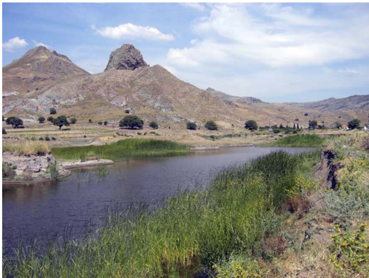
Pond near the road (northern side), 6 km E Eresos