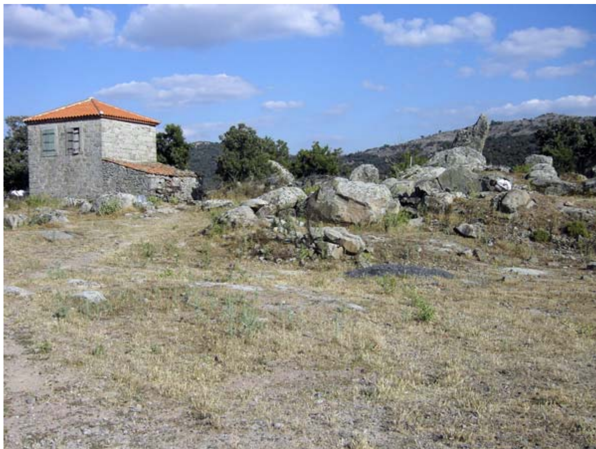
Olive Tree-warbler-place NE Skalochori