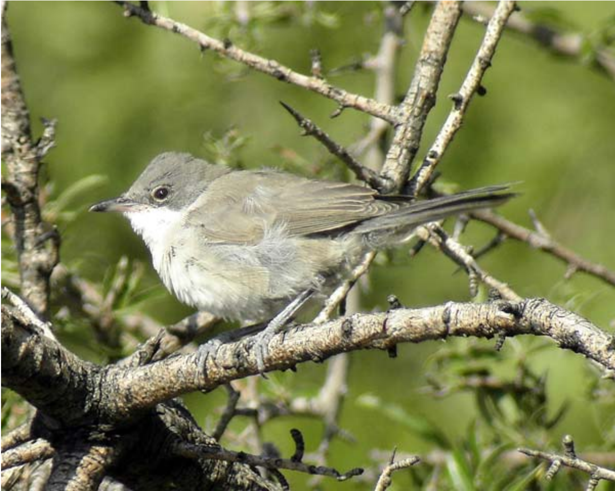
Juvenile Eastern Orphean Warbler 2-3 km SW Skalochoi 14 June.