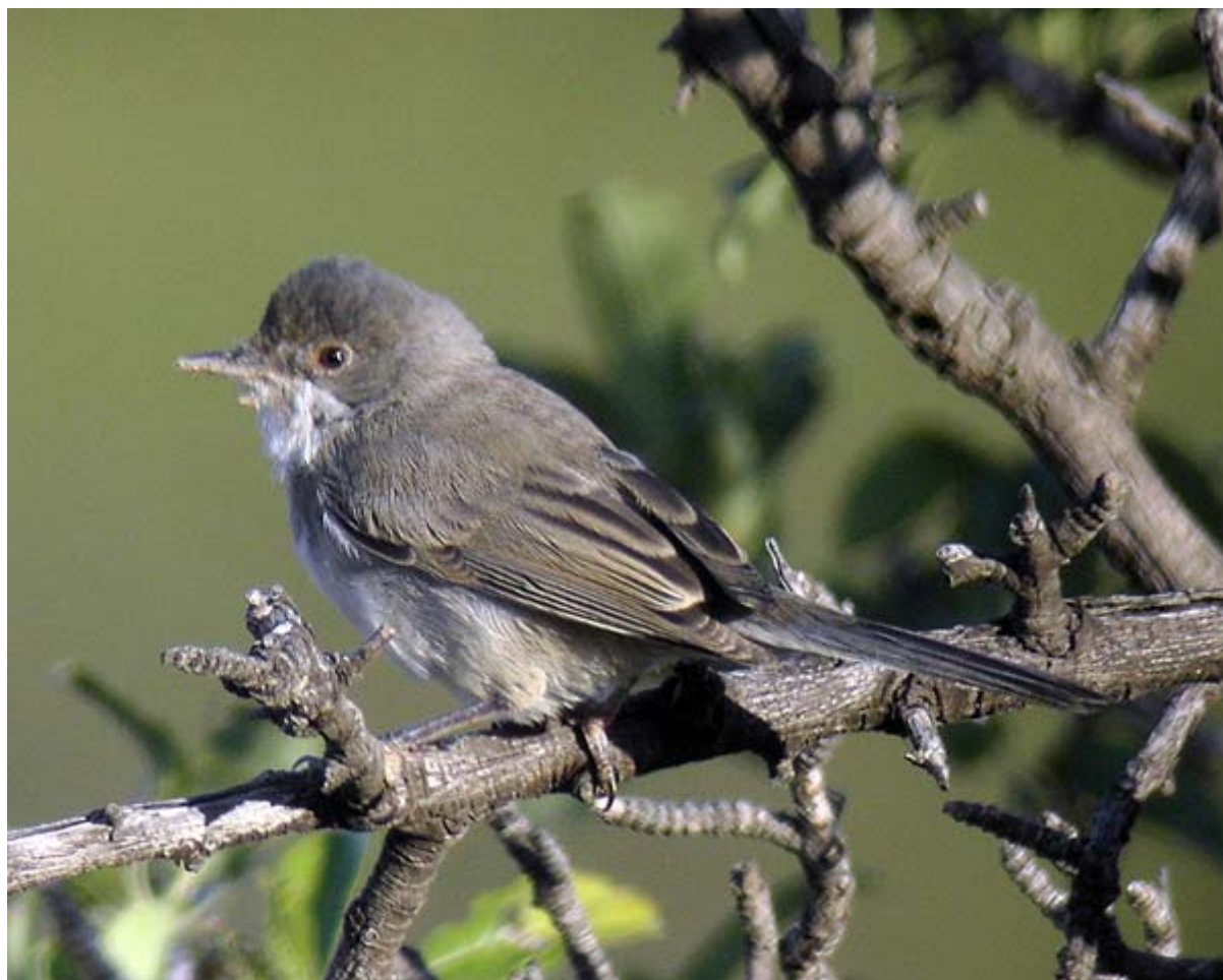
Adult female Rüppel's Warbler Petra 18 June.

3 female + 2 male at the "Amfi-disco", Petra 18 June.