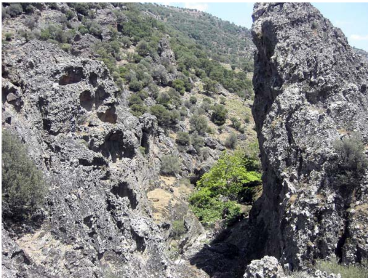
"Grand Canyon" between BP-station and Vatousa.