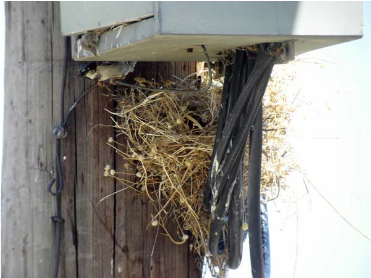
Adult male House Sparrow at nest constructed in the free, Potamia valley 15 June.

unusual record was one at nest constructed in free in an electric pole in the Potamia valley 15 June.