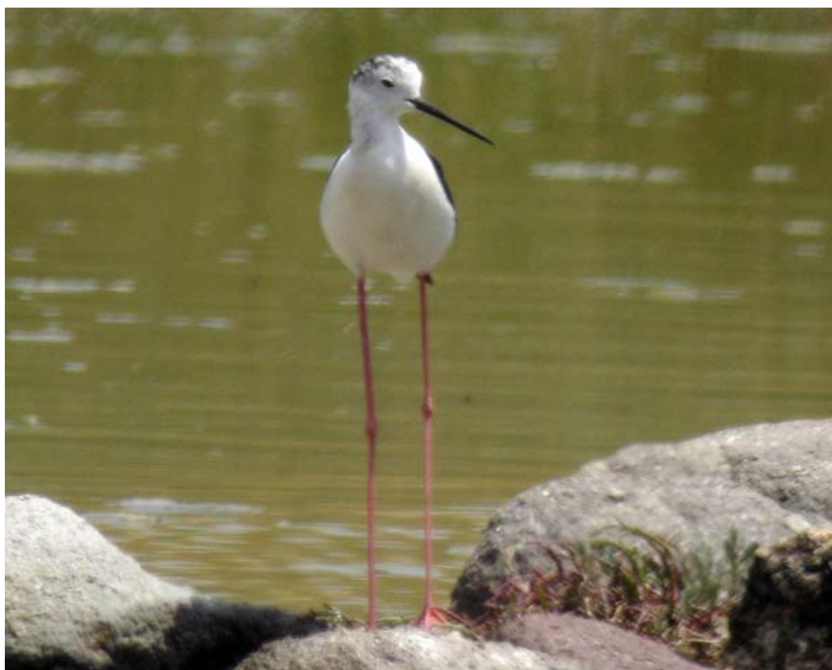
Male Black-winged Stilt Kalloni salt pans 13 June.