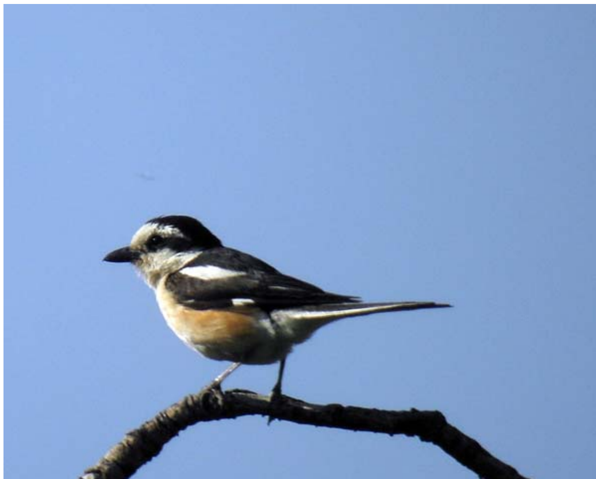
Adult male Masked Shrike at the Olive Tree-warbler-place NE Skalochori 14 June.