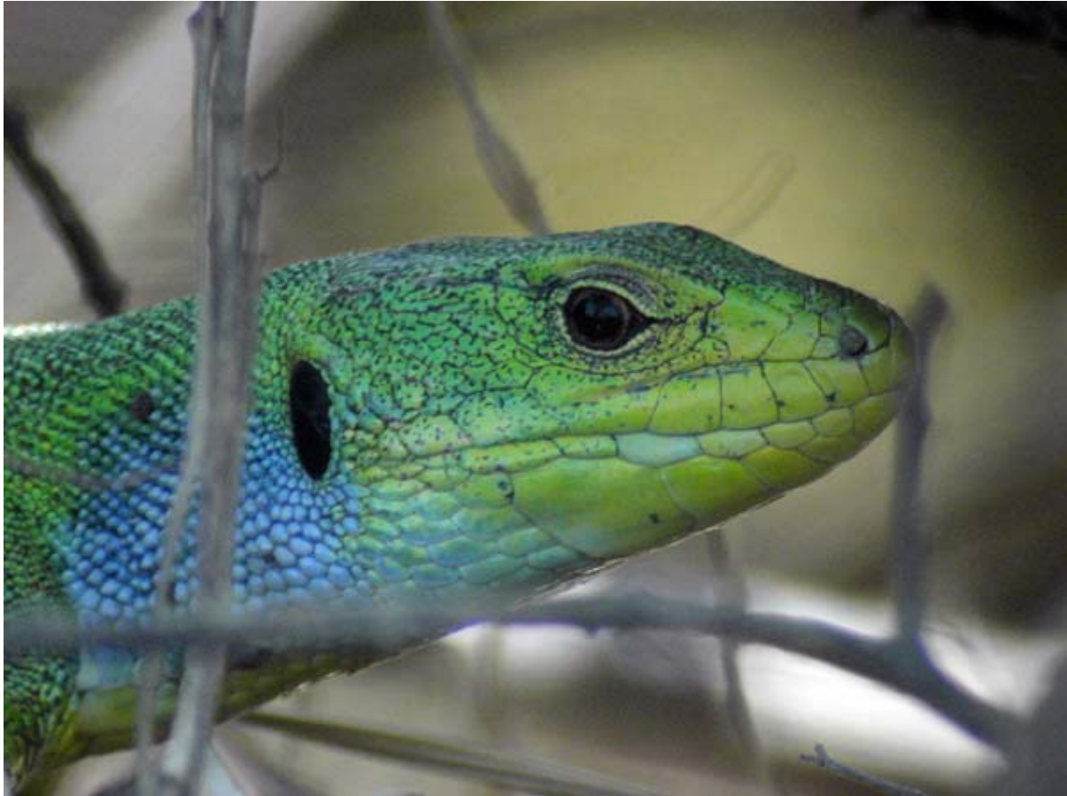
Balcan Green Lizard Potamia valley 15 June.