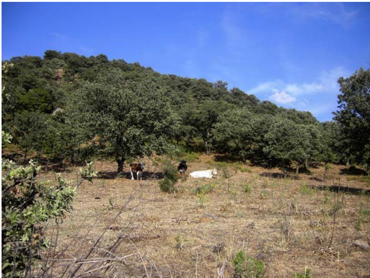
Small valley with mixed Olive Trees and Oaks 17,1 km S Skutaros