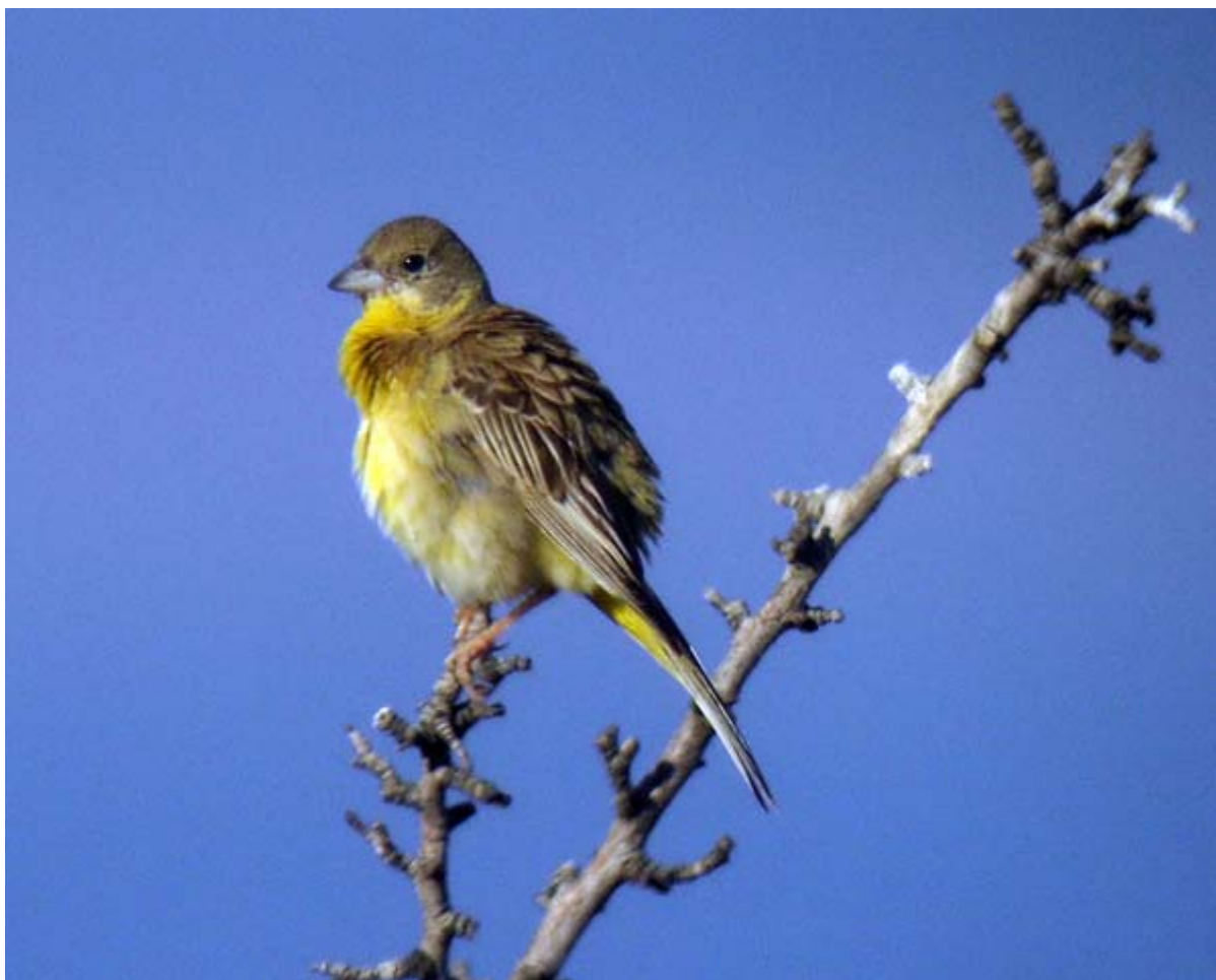
Adult female Black-headed Bunting Petra 18 June.