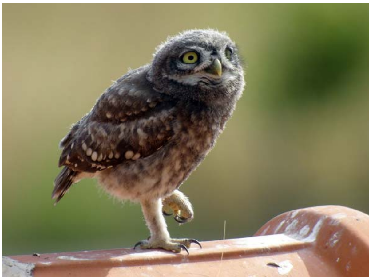
Juvenile Little Owl, Petra 15 June.

1 ad + 3 pull/juv at the roof of the Panorama hotel, Petra 12 June, 1 adult plus 2 juveniles at the hotel roofs 13 June, 1 The "Amfi-disco", Petra 16 June and 1 The "Amfi-disco", Petra 18 June. The family heard, seen and photographed every evening at the hotel.