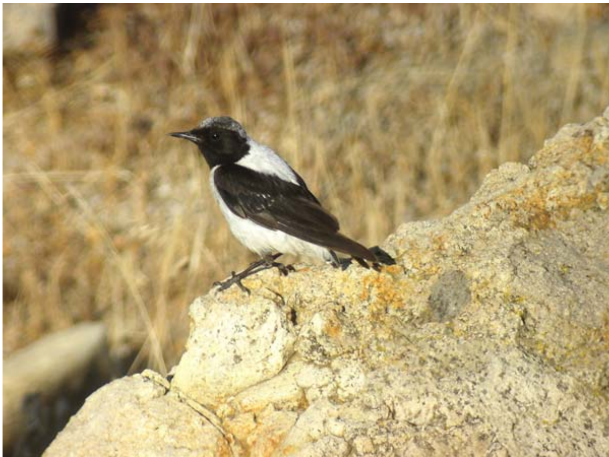
Male black-throated form of Black-eared Wheatear Petra 18 June.