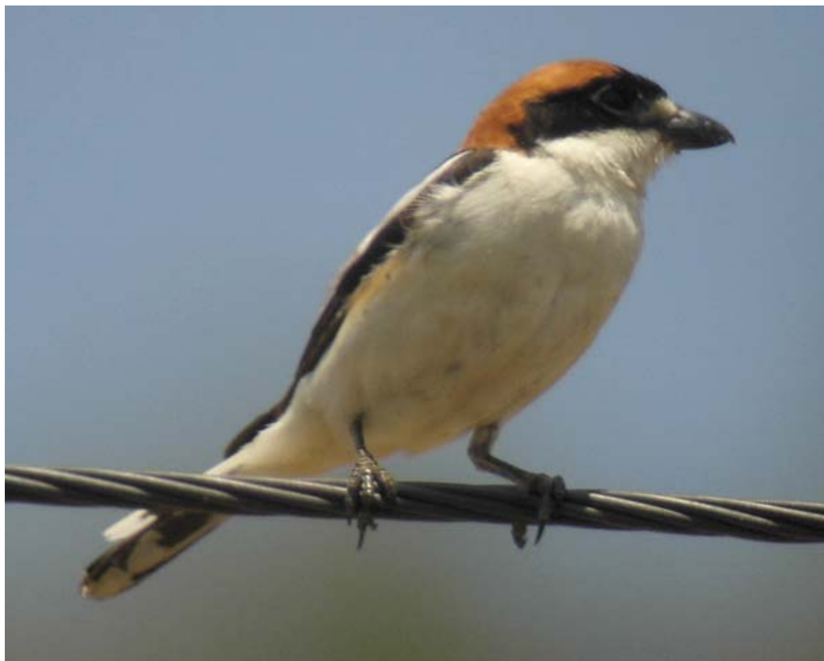
Adult male Woodchat Shrike Potamia valley 17 June.

1 male Petra reservoir 12 June, 1 2-3 km SW Skalochoi 14 June, 1 adult male Potamia valley 17 June, 2 adult and 2 juvenile "the Isabelline Wheatear crossing" W Andissa 17 June.