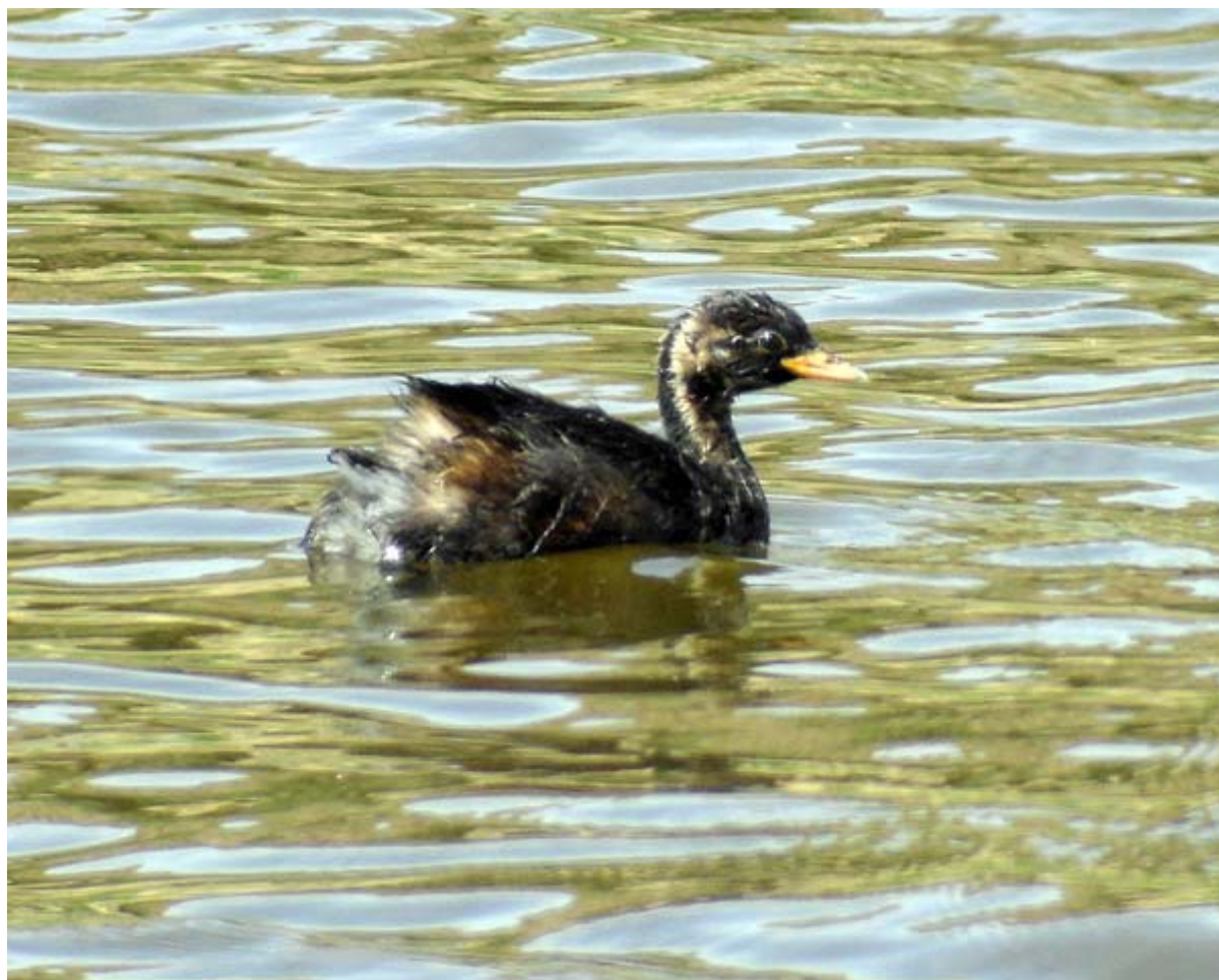
Juvenile Little Grebe in pond near the road (northern side), 6 km E Eresos 17 June.

2 adult and 1 juvenile in pond near the road (northern side), 6 km E Eresos 17 June