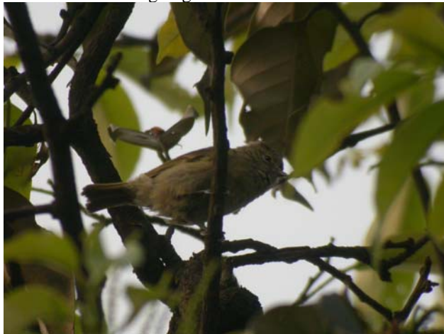
Yellow-browed Tit at Wawu Shan

About ten at Dafengding and two at 1700 m at Wawushan.