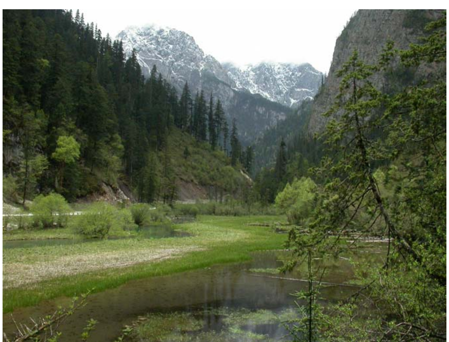
Swan Lake towards Primeval Forest