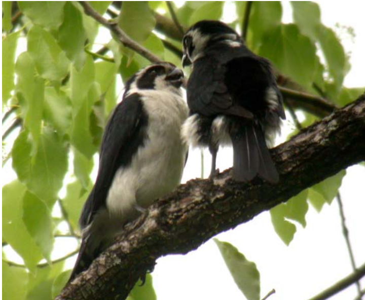
Pied Falconets.

Besides the Yellow-throated Laughingthrushes and the brilliant views of the pair of Pied Falconets, seeing the male Elliot's Pheasant, although briefly, was truly memorable. Also the flocks of Swinhoe's Minivets were notable.