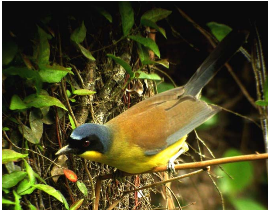
Yellow-throated Laughingthrush at Zhongyun.

With notes on Yellow-throated (Courtois's) Laughingthrush