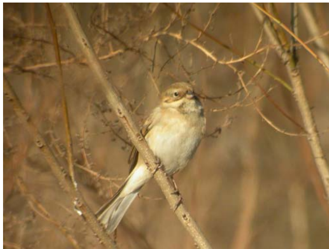
Pallas's Reed Bunting