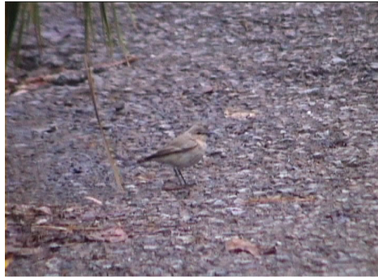
Isabelline Wheatear, Kaeng Krachan, © Mats-Åke Persson