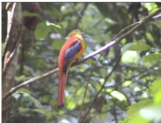
Orange-breasted Trogon, Kaeng Krachan, © Mats-Åke Persson

Orange-breasted Trogon ( Harpactes oreskios ) 2 Kaeng Krachan 24.3, 1 Kaeng Krachan 26.3, 1 Khao Nor Chuchi 27.3 and 2 Khao Nor Chuchi 28.3.