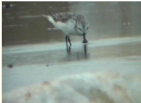
Spoon-billed Sandpiper, Khok Kham

Amongst the many fantastic birds recorded during the trip we would in particular like to mention the Spoon-billed Sandpiper by Khok Kham, a stunning male Gurney's Pitta in Khao Nor Chuchi, the rarely seen Giant Pitta in Kaeng Krachan, Chinese Egrets in superb breeding plumage and one Nordmann's Greenshank in the estuary of the Krabi river, strange Coral-billed Ground Cuckoos in Khao Yai, elegant Frigatebirds, including Christmas Island Frigatebird, at the southernmost of the Phi-Phi Islands!