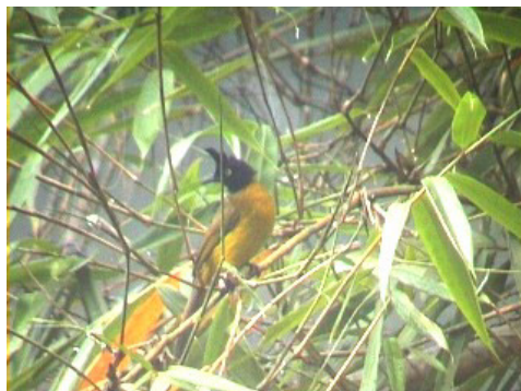
Black-crested Bulbul, Kaeng Krachan, © Mats-Åke Persson

Fairly common in Kaeng Krachan, single birds daily in Khao Nor Chuchi, 2 Krabi 31.3, common in Khao Yai.