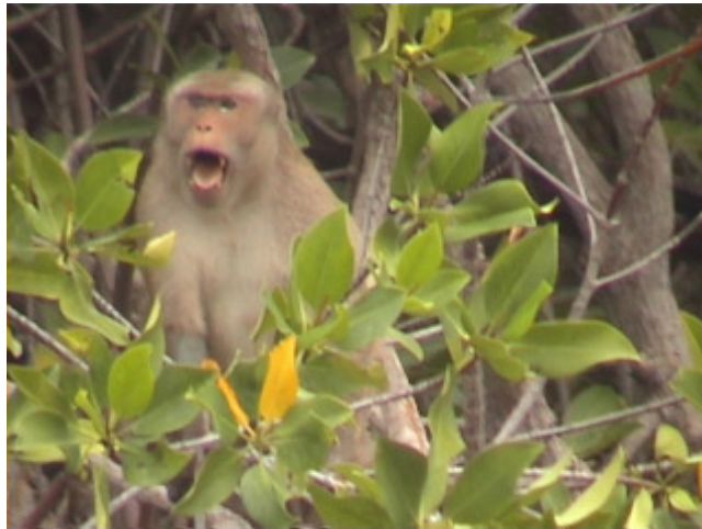
Crab-eating Macaque, Pak Bica Cape

1 Pak Bica Cape 26.3. About 10 in the Krabi mangroves 1.4.