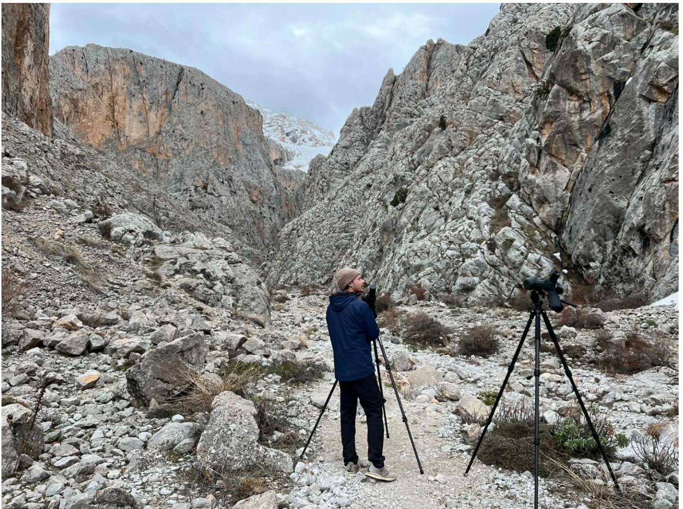
Birding at the base of the Aladaglar mountains