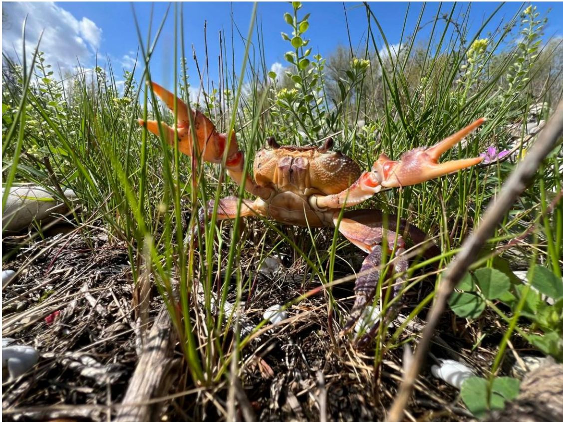
Levantine freshwater crab

flew by just above our heads, calling loudly. We walked around the area for a bit and see Eurasian penduline tits , Syrian woodpeckers , Pygmy cormorants , Spotted cuckoos , lots of Hoopoes , more White-throated kingfishers , an Egyptian mongoose and a crab which we later identified as a Levantine freshwater crab .