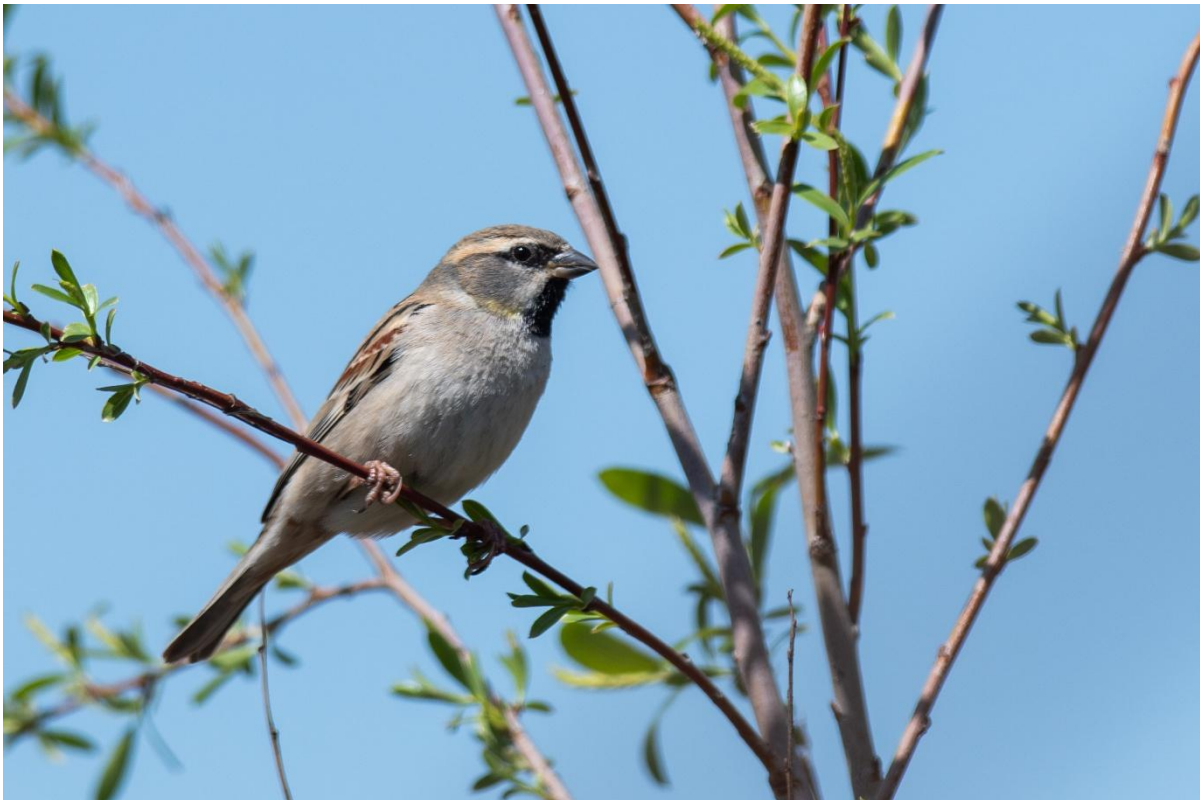
Dead Sea sparrow

At 13:00 we drove towards the Hancagiz dam (36.953860022671236, 37.84083152105632) and arrived there an hour later. It was a large dam located just south of Nizip; this time of the year it held a lot of water and large wet meadows surrounded the northwestern part of the dam. There was unfortunately severe littering as