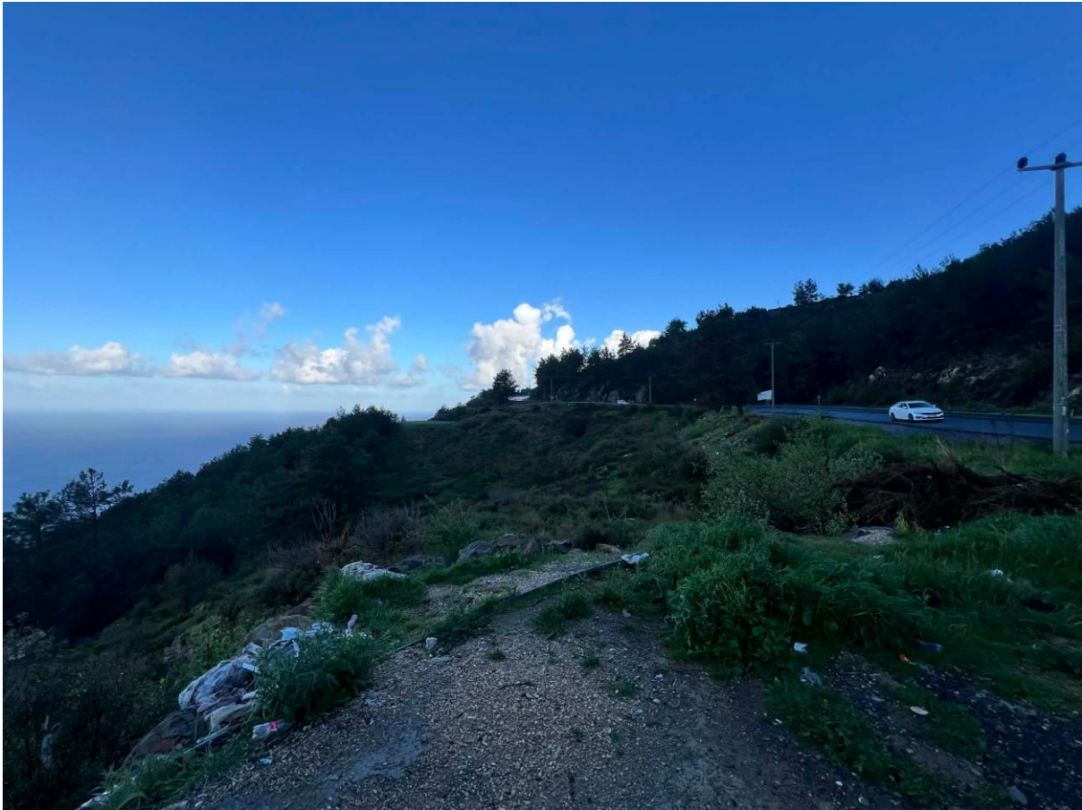
Roadside east of Zeytinada

After gaining some energy from the birds we made a quick stop to buy some food and water in Anamur and then continued driving east along the sea. On the way we saw the first Short-toed eagle , Glossy ibis and Black stork of the week, with many more to come.