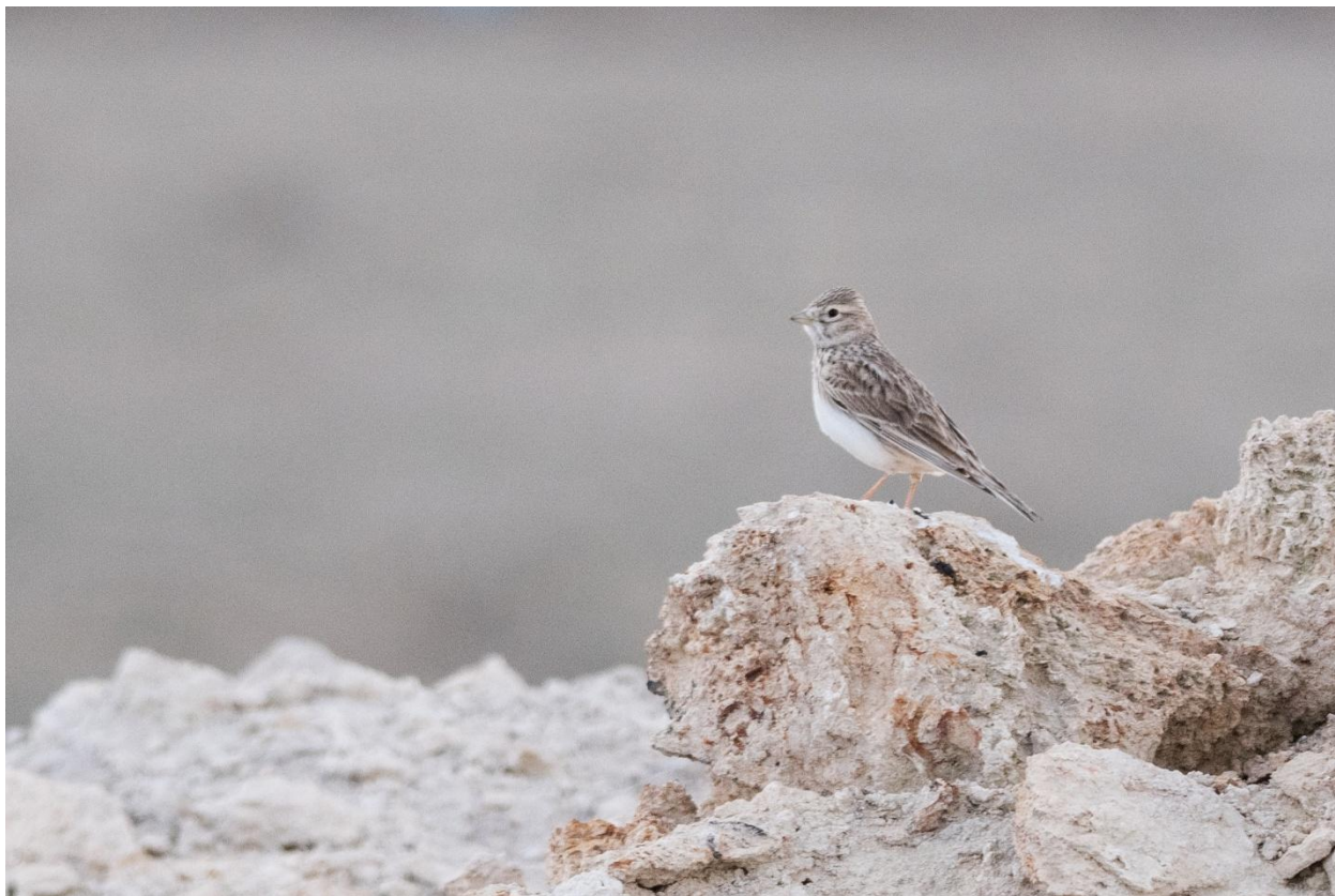
Turkestan short-toed lark

there were at least six Turkestan short toed larks singing and foraging, together with Greater short toed larks , Isabelline wheatears and Hoopoes .