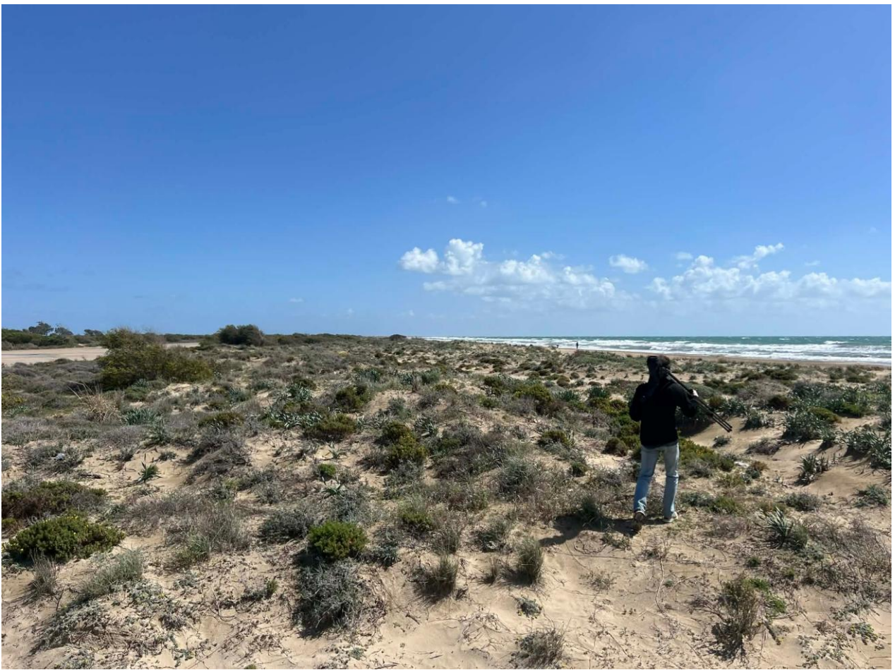
Birding in Göksu delta

Eastern orphean warbler: 1 Eastern subalpine warbler: 5 Rüppel's warbler: 1 Cetti's warbler: 3 Eastern bonelli's warbler: 1 Lesser grey shrike: 1 Spanish sparrow: 5 Serin: 2 Cretzschmar's bunting: 6 Ortolan bunting: 2 Corn bunting: 5