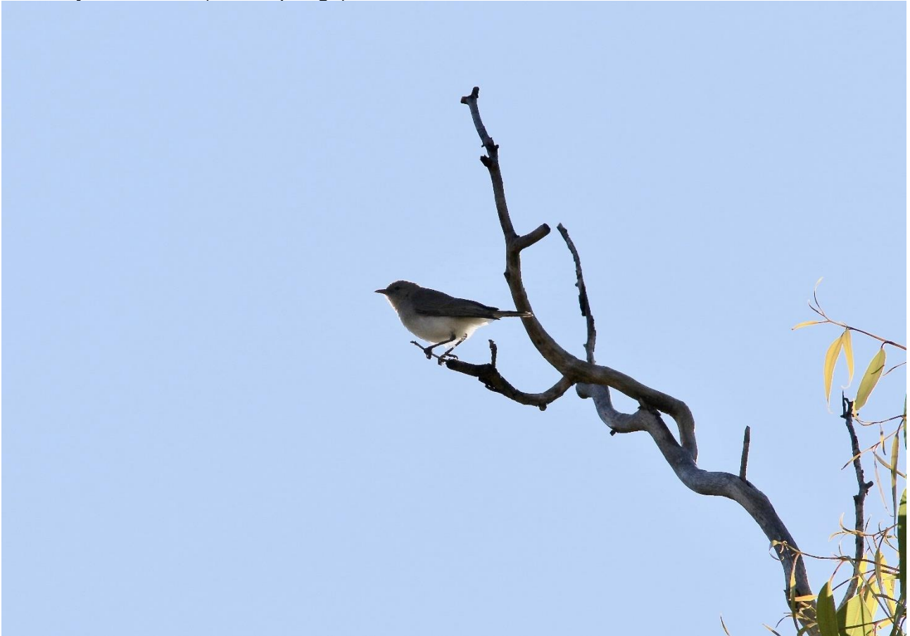
Grey Honeyeater, John Flynn's Grave

Grey Honeyeater Conopophila white EN John Flynn's Grave (Alice Springs)