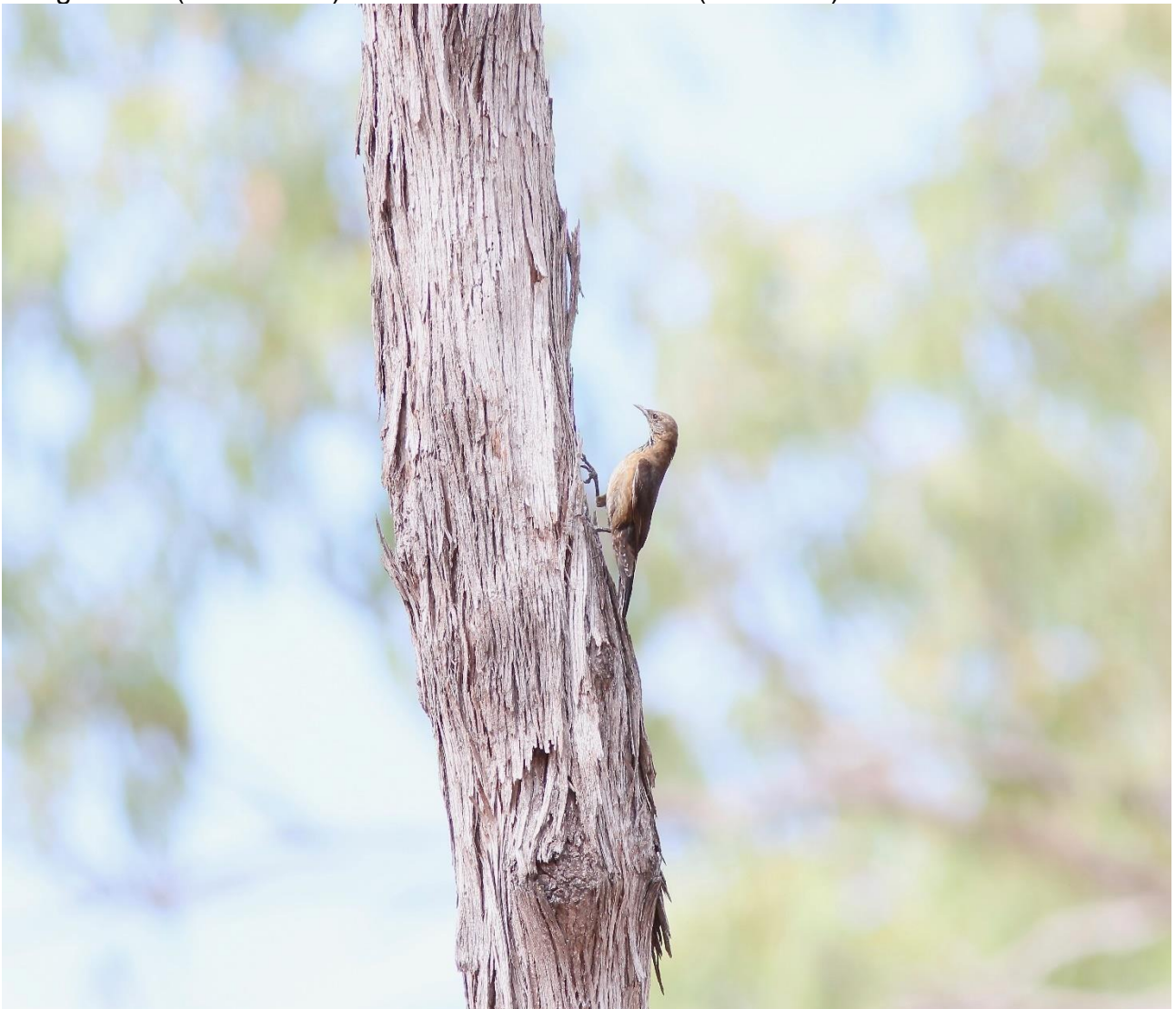
Black-tailed Treecreeper, Nanguluwurr (Kakadu NP)

Nanguluwurr (Kakadu NP) and Central Arnhem Road (Katherine)