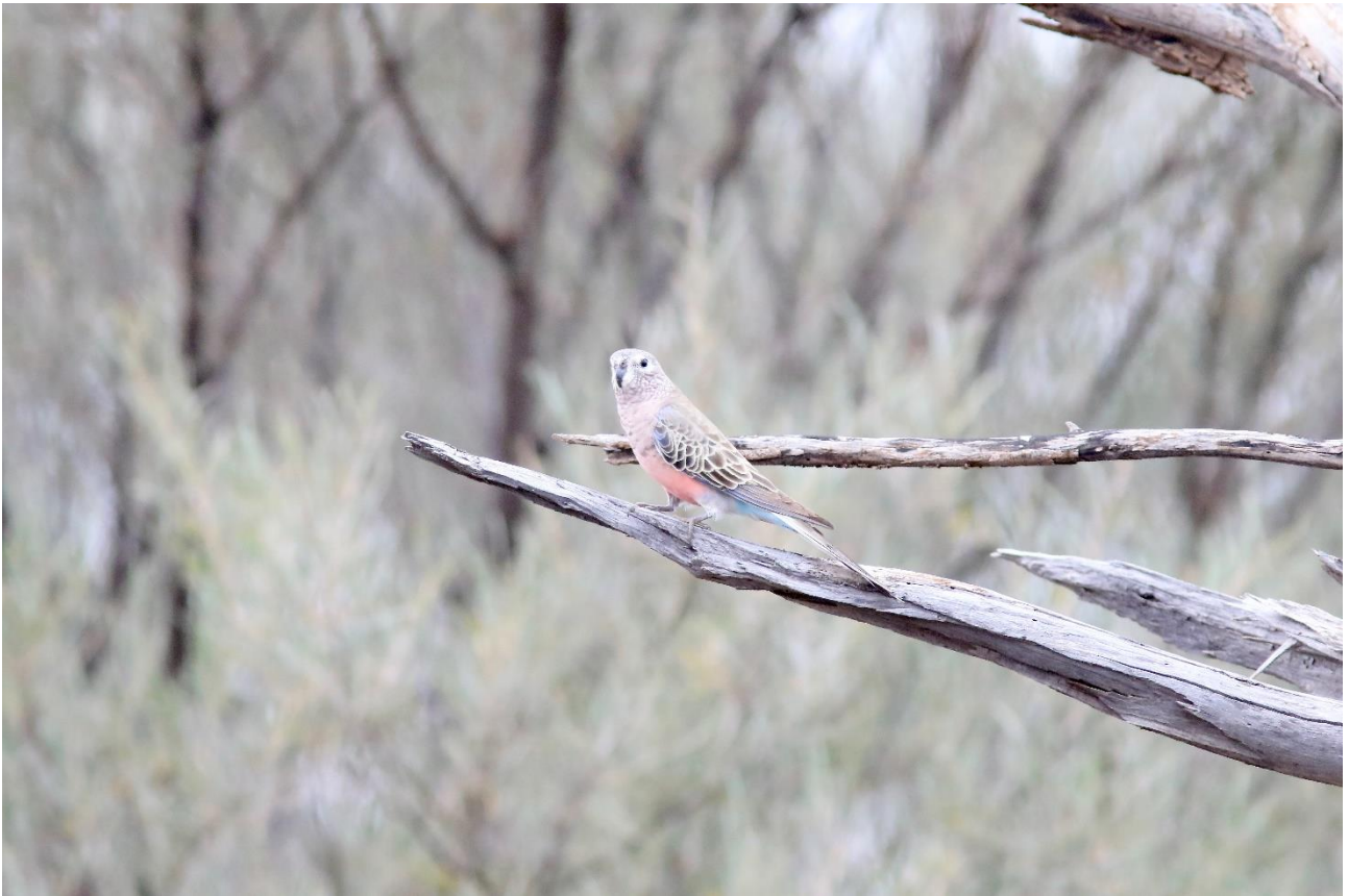
Bourke's Parrot, Bourke's Parrot Swamp, Santa Teresa Road

When in Alice Springs, where the night sky is fabulous, I took part of Earth Sanctuary's program ( https://www.earth-sanctuary.com.au ). This is something I really recommend. Their "Dinner & Stars" was great!