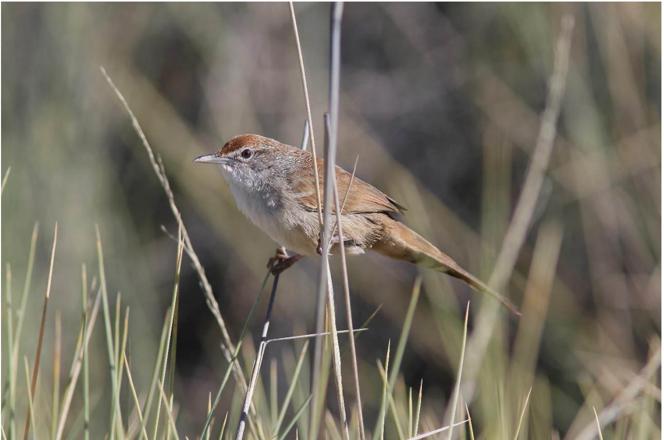
Spinifexbird, Ormiston Gorge

Alice Springs Telegraph Station Historical Reserve ( https://ebird.org/hotspot/L1121938 ) was visited since I had read a recent e-bird report of Redthroat in the area. This was a species with only one report in the region the last couple of weeks previous to my visit, so I understood this would probably be my only chance to connect with this species. When I reached the area my heart sank - there was no obvious place to look for Redthroats and several different trails to choose from. I decided to go for Bradshaw Walk and as it turned out this was a good decision. Birding there in the middle of the day it was very hot and bird activity low, but halfway through the trail I heard the calls of Redthroats and had great views of three birds. Excellent!