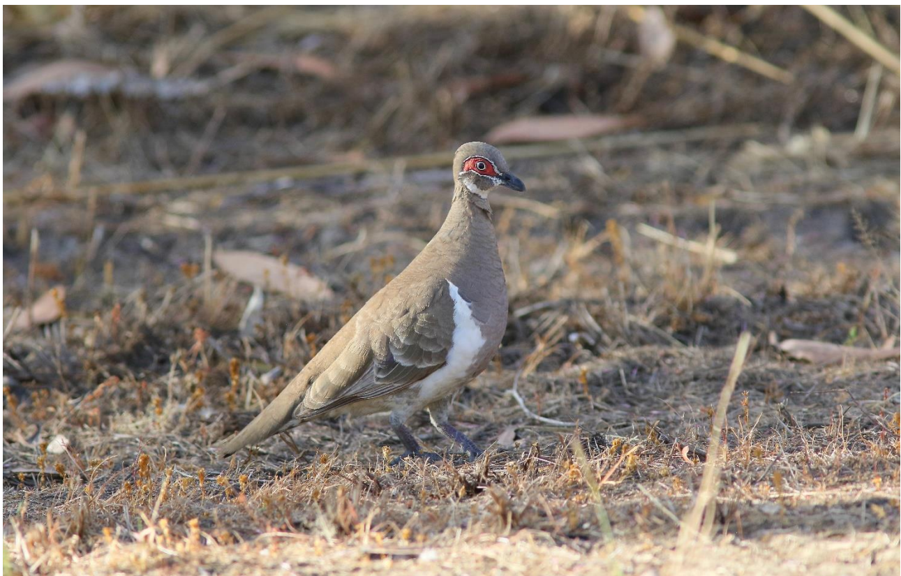
Partidge Pigeon, Kakadu NP

Adelaide River Crossing is right by Arnhem highway ( https://ebird.org/hotspot/L1174344 ). I visited this site twice - first thing in the morning, and then after my visit to Fogg Dam. I did not find this location to be very productive, but on my second attempt I managed to see the main target, Mangrove Golden Whistler (a female).