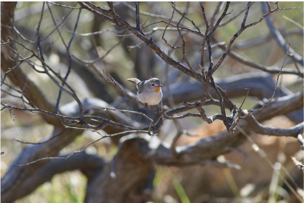
Redthroat, Alice Springs Telegraph Station Historical Reserve

Olive Pink Botanic Garden ( https://ebird.org/hotspot/L1176748 ) is located close to the city centre in Alice Springs. The main reason for me visiting this place was to see Western Bowerbird . I actually did not find any on my first visit, despite the small size of the area, but on my second attempt I managed to find two birds and the bower. Here, I also recorded Spotted Dove and Red-browed Pardalote .