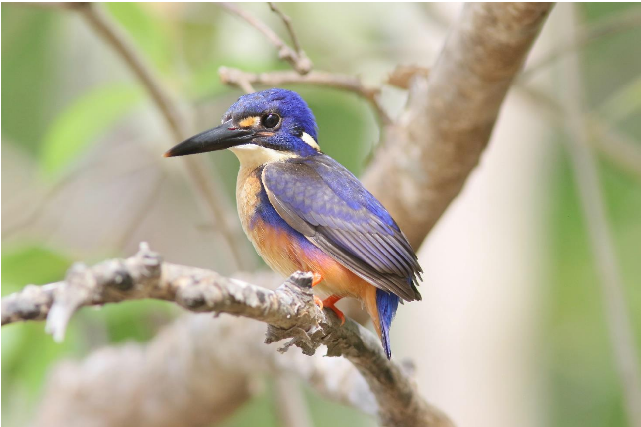
Azure Kingfisher, Buffalo Creek

Mangroves near Orchard Road (Coconut Grove, Darwin)