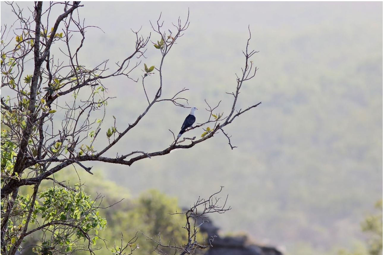
Black-banded Fruit Dove, Nawurlandja Lookout

Rose-crowned Fruit Dove Ptilinopus regina Fogg Dam and Howard Springs Nature Park (Darwin)