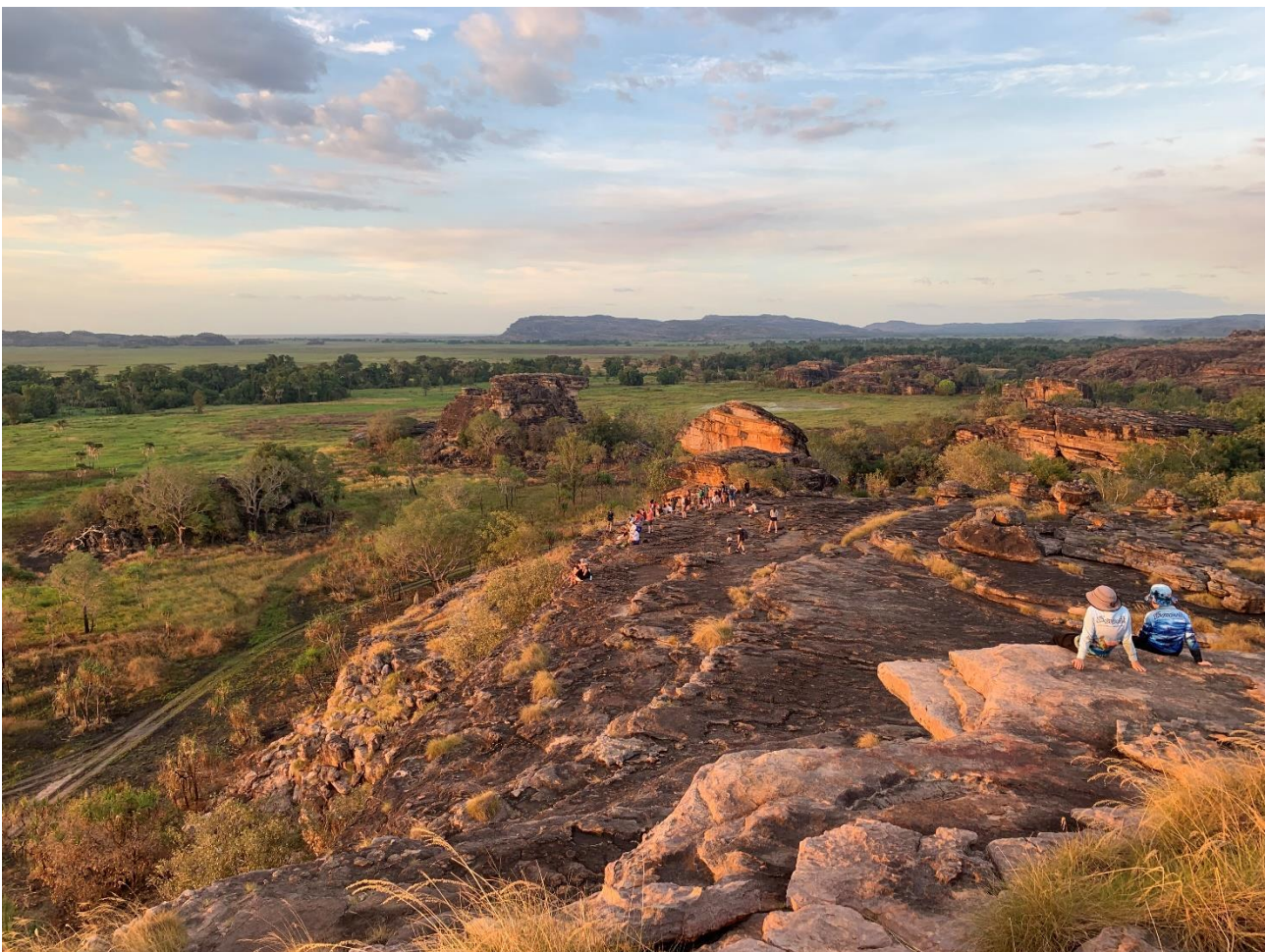
Ubirr at sunset

Ubirr ( https://ebird.org/hotspot/L984086 ) is a must, albeit maybe not for birding reasons. The rock art here is spectacular and so is the sunset views. The only interesting bird species seen here was Sandstone Shrikethrush . This is a good site for Chestnut-quilled Rock Pigeon , albeit I did not see any. Nearby, is Bardedjilidji Sandstone Walk ( https://ebird.org/hotspot/L1608618 ). I did not spend much time here, because I was in a hurry to get to Ubirr at sunset, but I managed to find my main target, Chestnut-quilled Rock Pigeon , within minutes.