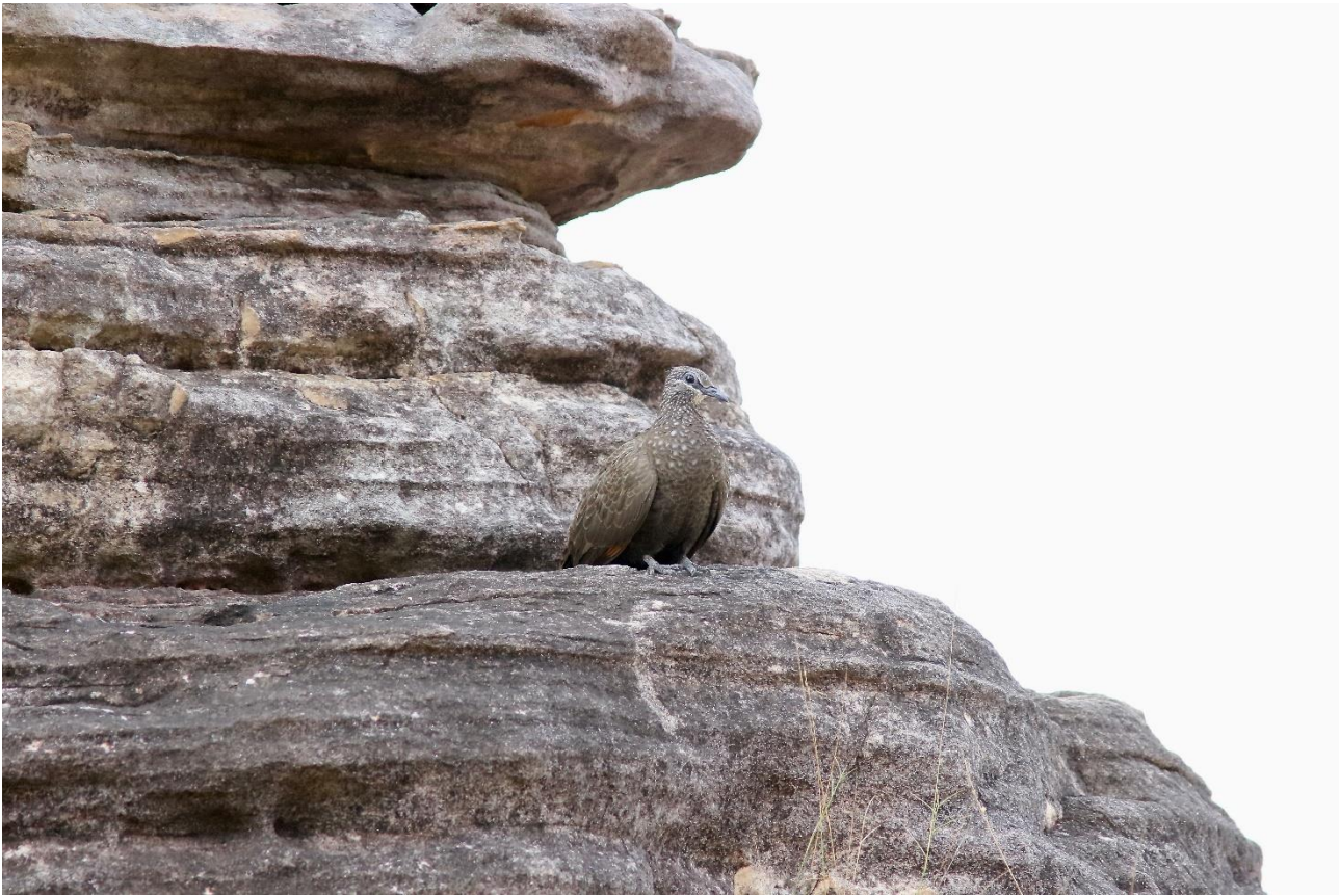
Chestnut-quilled Rock Pigeon, Bardedjilidji Sandstone Walk

Chestnut-quilled Rock Pigeon Petrophassa rufipennis EN Bardedjilidji Sandstone Walk (Kakadu NP)