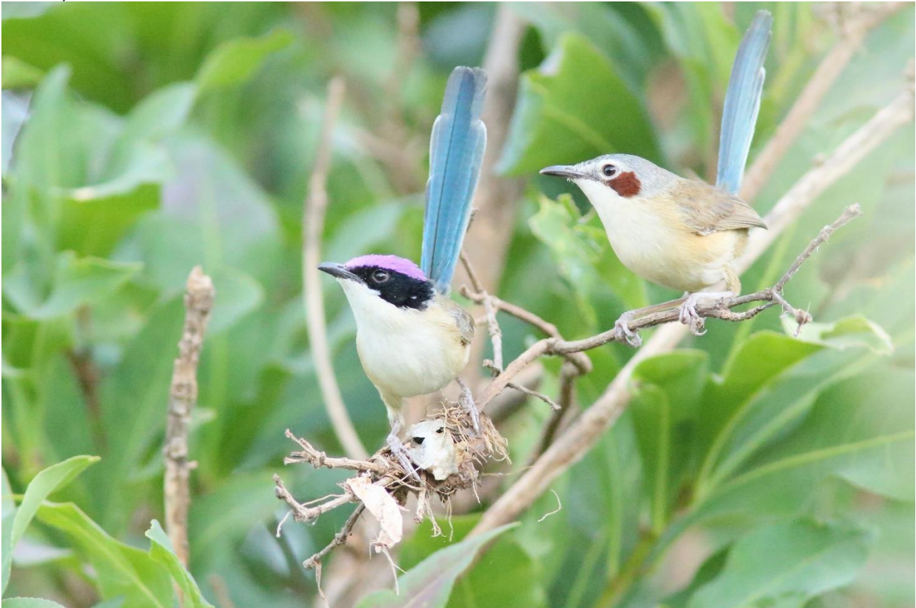
Purple-crowned Fairywren, Victoria River Crossing

Victoria River Crossing, Victoria River Escarpment walk and Bradshaw Bridge (Timber Creek)