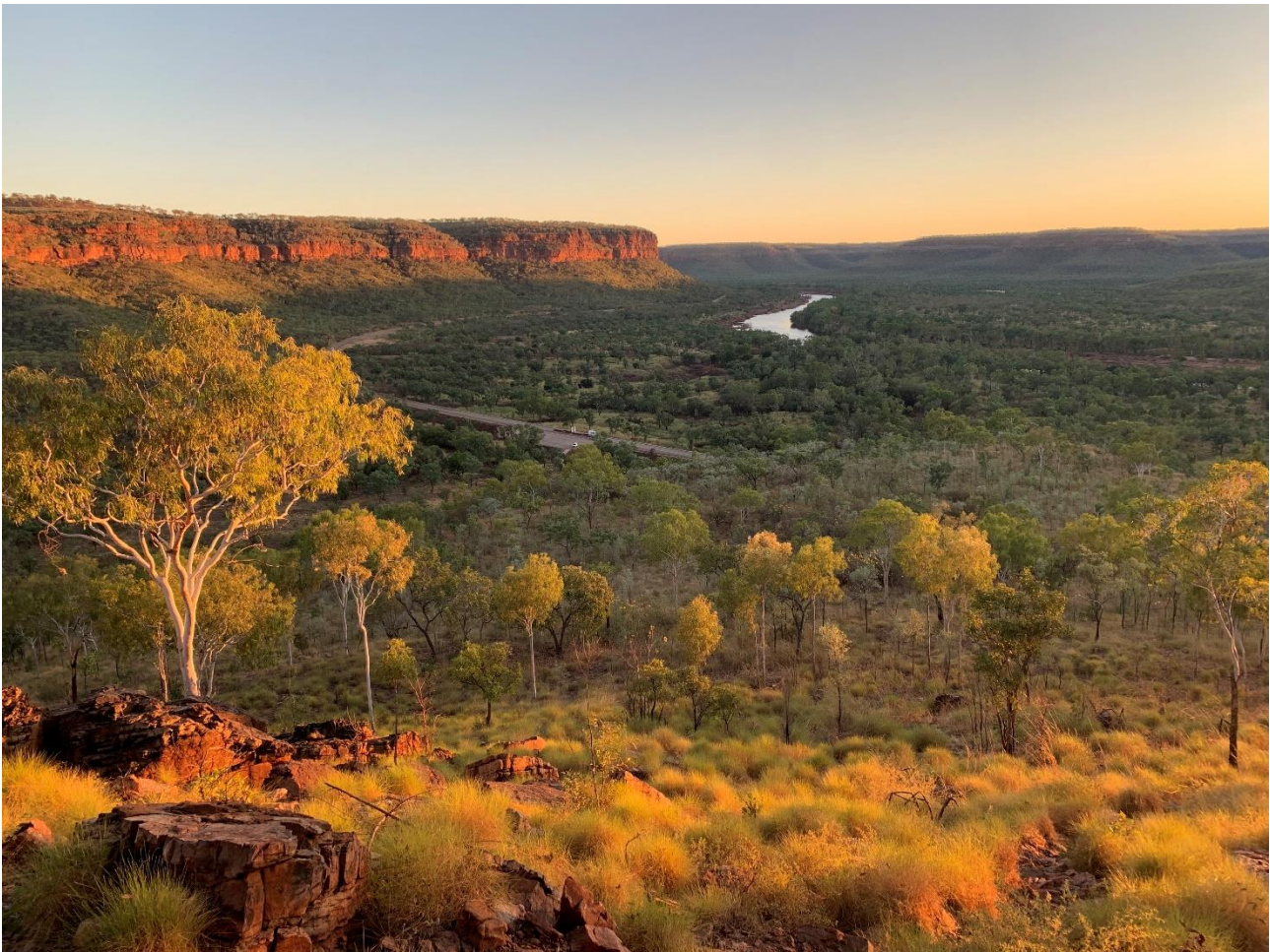
View from Victoria River Escarpment Hike