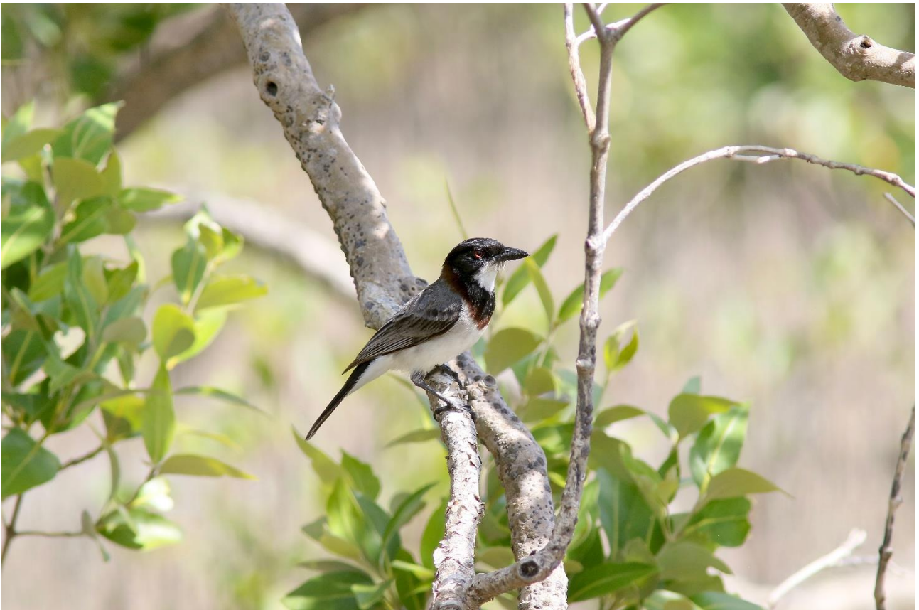
White-breasted Whistler, Mangroves near Orchard Rd

We visited the mangroves near Orchard Rd (Coconut Grove) twice, both times at low tide ( https://ebird.org/hotspot/L1175729 ). The main targets here are Mangrove Golden - and White-breasted Whistler . The first time, late afternoon, we failed to find the targets, but during our second visit (12 noon) we had excellent sightings of both species. This shows that one might need more than one day in the Darwin area, to have the opportunity to make a second visit if necessary. To bird this site together with local birders is recommended - to find one's way through the mangroves towards the mudflats on a hardly notable trail and then back again is not, according to me, as straightforward as it might seem. Bring plenty of water - it gets extremely hot here during the day.