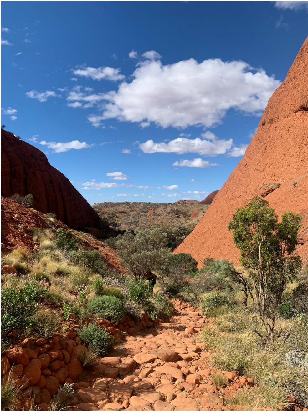
Valley of the Winds in Kata Tjuta

After watching Uluru at sunrise (among hordes of tourists, unfortunately), I went to the site known as Dunefield east of Yulara airport and north of Lasseter Highway ( https://ebird.org/hotspot/L2533048 ). This is the best site for Rufous Grasswren in the Northern Territory. I knew beforehand that the species is somewhat difficult, but nevertheless I felt very disappointed drawing a blank despite two hours of dedicated effort.