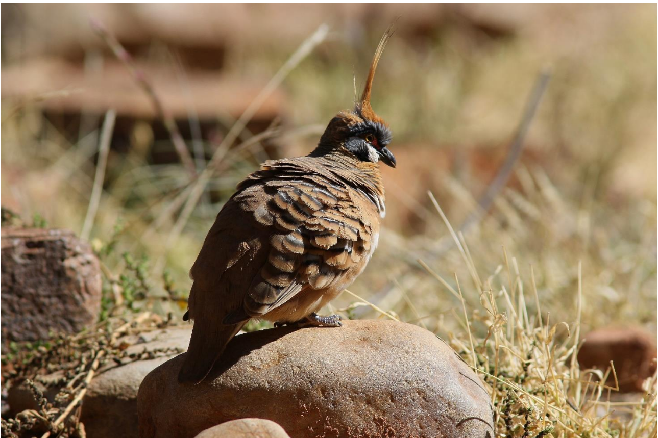
Spinifex Pigeon, Ormiston Gorge