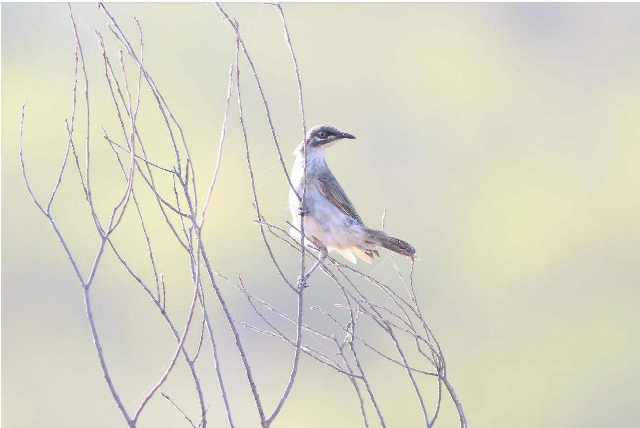
White-lined Honeyeater, Nawurlandja Lookout

lot was unsealed and corrugated so I decided to park the car by the end of the sealed road and walk. As it turned out, this was a good choice, because during the walk along the unsealed road towards the parking area I heard and then saw the first Black-tailed Treecreepers of the trip. The walk from the parking area to the rock art site did not yield many birds at all. Chestnut-quilled Rock Pigeons and Partridge Pigeons had been reported at this site, but I did not find any despite a lot of effort. The second morning visit was focused on Nourlangie Rock ( https://ebird.org/hotspot/L1120554 ). Having spent 1,5 hours of the morning searching for Partridge Pigeon around Jabiru, I arrived pretty late. Bird activity was very low. I walked Anbangbang Rock Art loop-walk and also visited the Gunwarddehwarde look-out. Since I had already seen the main target species here, I focused on enjoying the rock art. Nevertheless, I managed to add Silver-crowned Friarbird to the trip list. After this I made a short detour to Anbangbang Billabong ( https://ebird.org/hotspot/L1840869 ), which yielded Glossy Ibis .