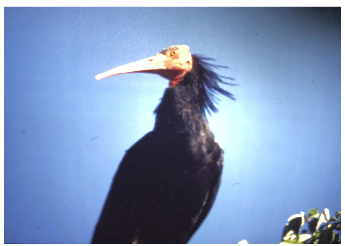
Northern Bald Ibis raised in captivity Photo 1987